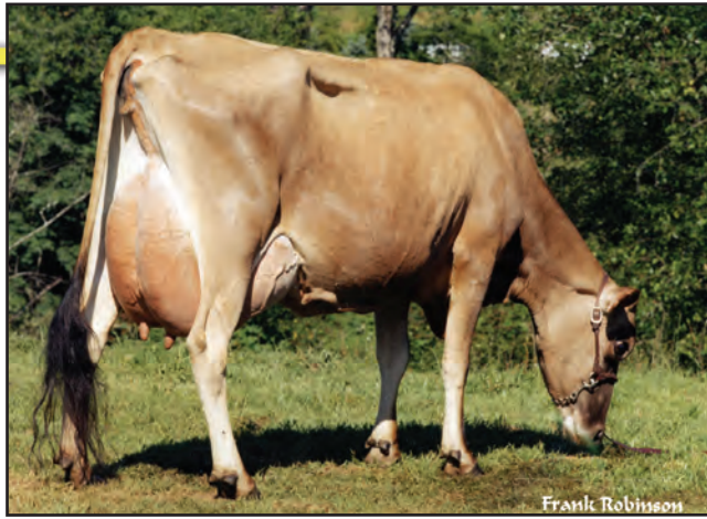
WOODSTOCK BERRETTA TINA {6}, E-91% Fourth Dam of Lot 1585