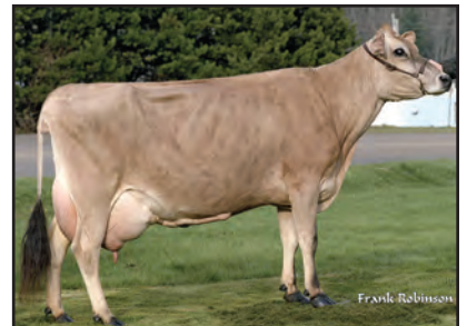
WOODSTOCK BOOMER SOONER ROBIN {5}, E-90% Sixth Dam of Lot 1386