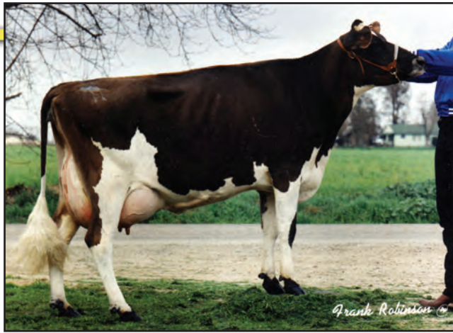
AHLEM GEORGES CHARM {6}, E-90% Sixth Dam of Lot 3228