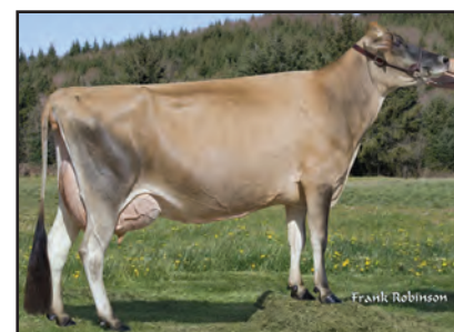
WOODSTOCK LEGION TINA MARIE-ET Sister to the Grandam of Lot 1471

4TH DAM: WOODSTOCK DUNCAN TINA {5} 95% 8-02 305 2 23600 4.7 1100 3.3 778 100DCR 2526C