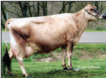
WOODSTOCK ALF LESLIE Great-Grandam of Lot 1548

BORN 07/11/2014 TATTOO W1548 / W1548 DHIA HERD # 35-01-0118 CONTROL # 1548 FEMALE EFI 6.6%