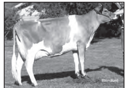
GEN RELIANT REVA {4}, E-91% Seventh Dam of Lot 1326

4TH DAM: WOODSTOCK ALF ROULETTE-ET 88% 5-05 305 2 21430 4.3 928 3.6 764 96DCR 2544C