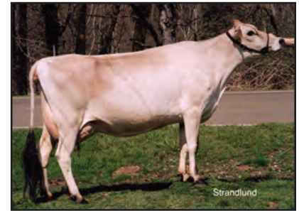
HALLMARK MAID-ET Great-Grandam of Lot 1616

4TH DAM: TENN HAUG E MAID 93% 6-00 365 2 26014 7.0 1820 4.3 1107 DHIR 3605C