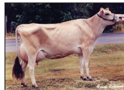
WOODSTOCK LESTER RUBY {6}-ET, E-93% Seventh Dam of Lots 1745 & 1746

4TH DAM: WOODSTOCK PARADE RINDI 86% 2-01 305 2 16600 4.4 725 3.6 593 100DCR 1982C