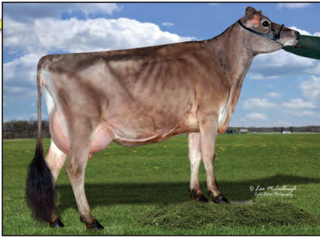
WOODSTOCK ARROW MA MERRI LYNN, VG-88% Dam of Lot 1657