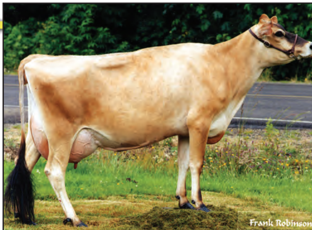
WOODSTOCK BERRETTA LESLIE, E-90% Fifth Dam of Lot 1759