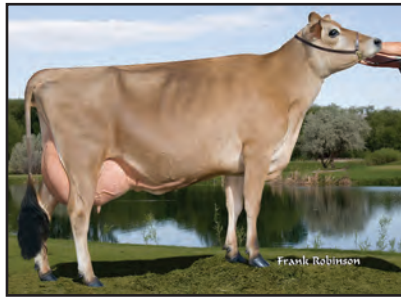
WILLARDS FIRST PRIZE BOOGY BOOTS {6}-ET Sister to the Grandam of Lot 1767