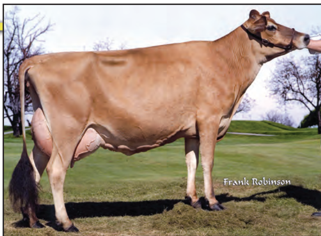
WOODSTOCK THUNDER TINA LOUISE {6}-ET, VG-88% Fifth Dam of Lot 1710