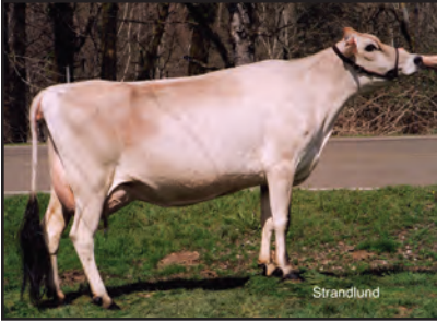
HALLMARK MAID-ET Great-Grandam of Lot 1699

WOODSTOCK DAIRY IOLA, WI BREEDER & OWNER