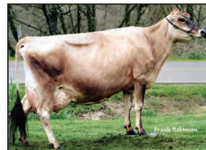
WOODSTOCK ALF LESLIE, E-90% Fifth Dam of Lot 1647

SUNSET CANYON MERCHANTS I MAID-ET EX 90-2E (CAN) USA 117763650 GT50K BBR 100 JH1C JH2F TATTOO / C84 1-08 305 2 14979 5.9 886 3.9 584 CAN 2022C 3-01 305 2 17241 5.8 1008 4.0 697 CAN 2414C 4-06 305 2 17812 5.9 1050 4.0 714 CAN 2473C 5-06 305 2 18010 6.4 1144 4.3 774 CAN 2683C CDCB GPTA 05/01/2018 ORECS 85%R 86%ILE 64M 58F 18P 301CM$ 277NM$ 219FM$ 187GM$ 2.1PL -2.7DPR -2.1CCR -0.5HCR 3.06SCS AJCA 05/01/2018 GPTAT 82%R 1.0 GJUI 7.0 GJPI 80%R 72