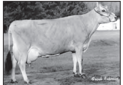
WOODSTOCK BOOMER SOONER ROBIN {5}, E-90% Sixth Dam of Lot 1326

SISTER(S): WOODSTOCK IMPULS RITA 91% 6-01 305 2 18510 5.5 1026 4.2 782 102DCR 2709C