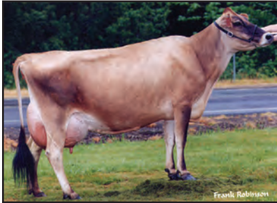
WOODSTOCK DUNCANTINA {5}, E-95% Fifth Dam of Lot 1585