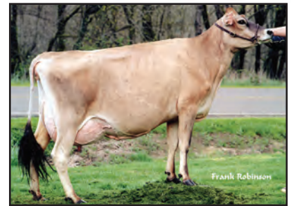
WOODSTOCK LEMVIG LINDY Sister to the Grandam of Lot 1595

4TH DAM: GAYPEGS DUNCAN MERINGUE 91% 4-01 305 2 22060 4.5 996 3.4 752 DHIR 2443C