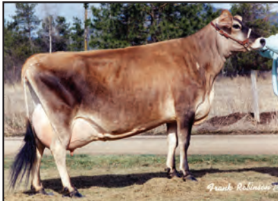
BETTYDON LESTER RITZY {6}, E-90% Seventh Dam of Lot 1302

BORN 02/14/2011 TATTOO W1302 / W1302 DHIA HERD # 35-01-0118 CONTROL # 1302 FEMALE EFI 6.8%