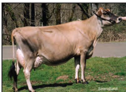
WOODSTOCK THUNDER TINA MARIE {6}-ET Sister to the Grandam of Lot 1388