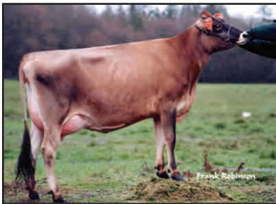
WILLARDS PRIMETIME JUNE 3 {6}-ET Sister to the Grandam of Lot 1767

BORN 09/19/2017 P2 FEMALE EFI 8.0% AMERICAN ID 1767 / 1767