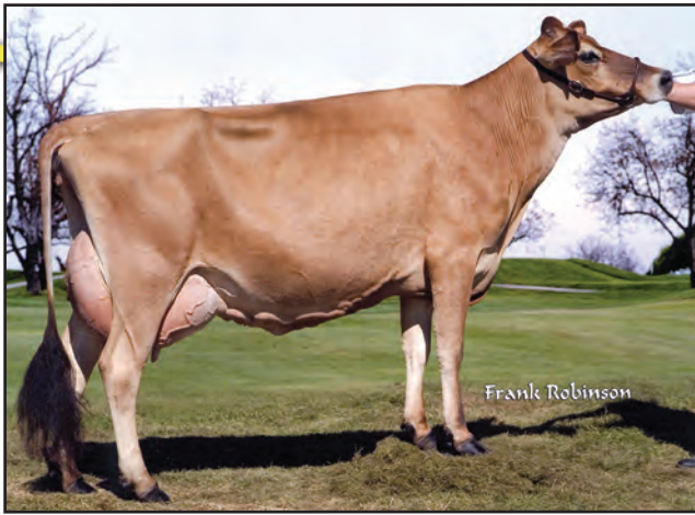
WOODSTOCK THUNDER TINA LOUISE {6}-ET, VG-88% Fifth Dam of Lot 1775