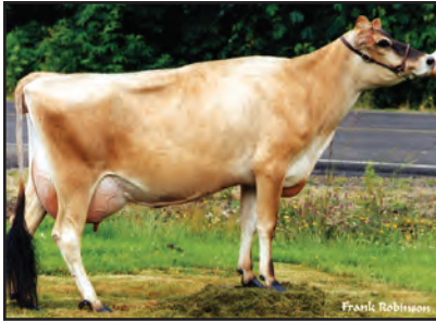
WOODSTOCK BERRETTA LESLIE Fourth Dam of Lot 1548