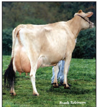
TENN HAUG E MAID Fourth Dam of Lot 1290