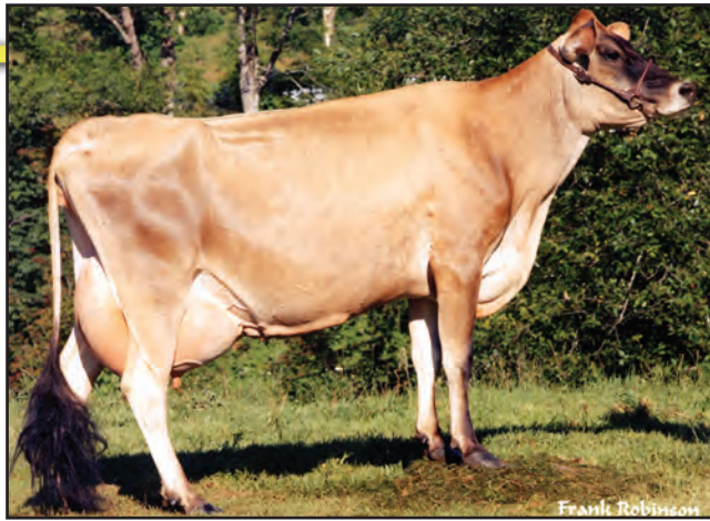
SUNSET CANYON STORM REQUEST-ET, E-90% Fourth Dam of Lot 1607