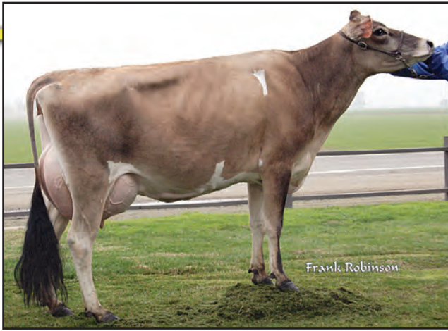
WOODSTOCK HALLMARK TINA TORI {6}-ET, VG-88% Fourth Dam of Lot 1341