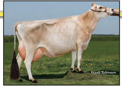
WOODSTOCK MATINEE RINDI-ET Sister to the Dam of Lot 1326

FRESH: 04/01/2017 BRED: 09/06/2017 DUE: 06/12/2018 TO RIVER VALLEY CIRCUS CRAZE-ET USA 075341001 200JE10001 CDCB GPTA 04/01/2018 0%RIP 76%R 891M 0.09% 61F 100%ILE 76%R 0.03% 38P 647CM$ 626NM$ 578FM$ 581GM$ 6.4PL 1.3DPR 2.3CCR 3.0HCR 2.91SCS AJCA 04/01/2018 ODAUS GPTAT 77%R 1.9 GJUI 25.1 GJPI 72%R 187