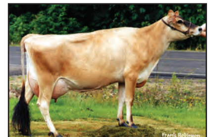
WOODSTOCK BERRETTA LESLIE Great-Grandam of Lot 1595