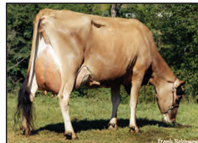
WOODSTOCK BERRETTA TINA {6} Sister to the Dam of Lot 1400