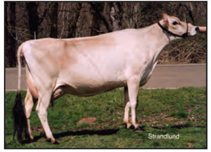
HALLMARK MAID-ET Great-Grandam of Lot 1290

4TH DAM: TENN HAUG E MAID 93% 6-00 365 2 26014 7.0 1820 4.3 1107 DHIR 3605C