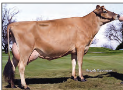
WOODSTOCK THUNDER TINA LOUISE {6}-ET Sister to the Grandam of Lot 1388