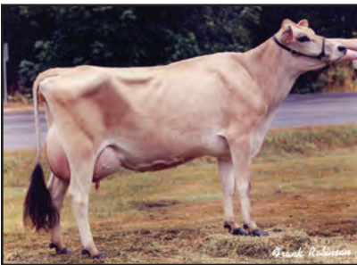
WOODSTOCK LESTER RUBY {6}-ET Great-Grandam of Lot 1669