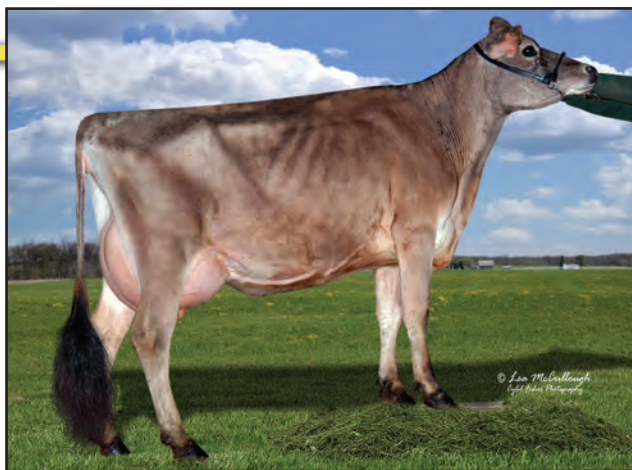
WOODSTOCK ARROW MA MERRI LYNN, VG-88% Selling as Lot 1373