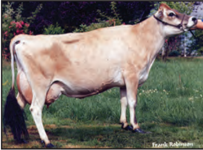
WOODSTOCK ALF ROULETTE-ET Sister to the Grandam of Lot 1669