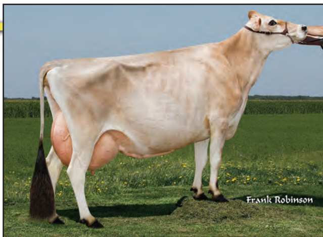
WOODSTOCK MATINEE RINDI-ET, VG-88% Full Sister to the Great-Grandam of Lot 1680