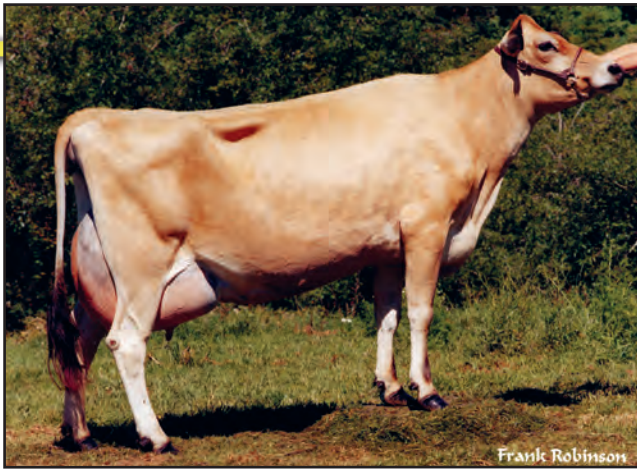
WOODSTOCK MONTANA KACEE (5), VG-85% Seventh Dam of Lot 1703