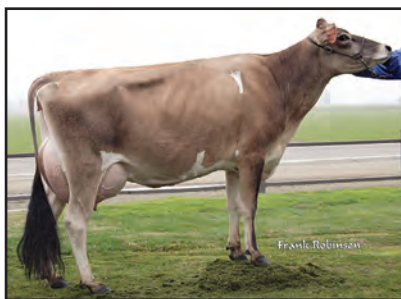
WOODSTOCK HALLMARK TINA TORI {6}-ET, E-92% Remington Silveira, NM