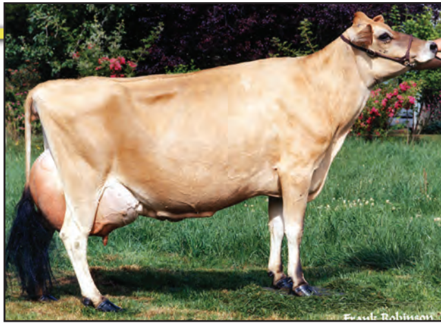
WOODSTOCK BERRETTA REVA {6}, E-90% Fourth Dam of Lot 1648