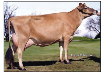
WOODSTOCK THUNDER TINA LOUISE {6}-ET Sister to the Grandam of Lot 1542