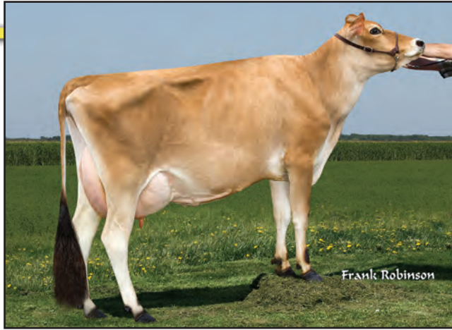
WOODSTOCK HULK LUNA, VG-84% Grandam of Lot 1643