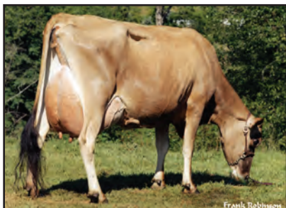
WOODSTOCK BERRETTA TINA {6} Sister to the Grandam of Lot 1388