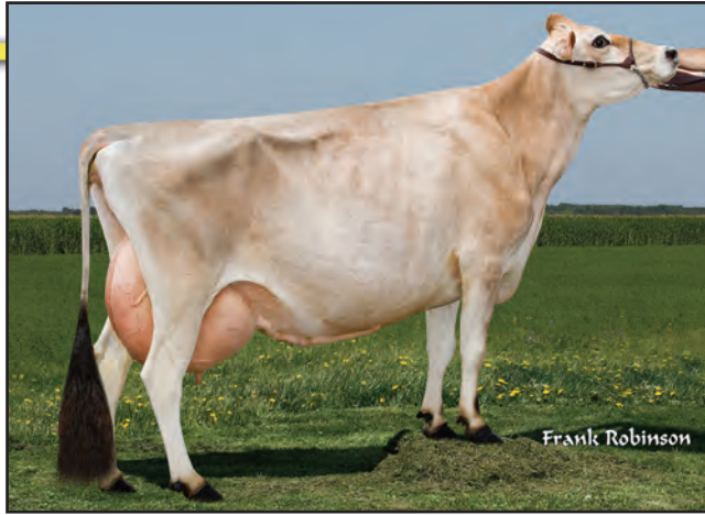
WOODSTOCK MATINEE RINDI, VG-88% Full sister to the Great-Grandam of Lot 1745