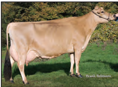
SUNSET CANYON LEMVIG MAID 4-ET Sister to the Grandam of Lot 1560