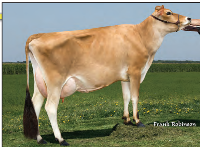
WOODSTOCK HULK LUNA, VG-84% Great-Grandam of Lot 1752