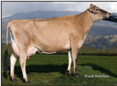
WILLARDS FP BOGE {6}-ET Sister to the Grandam of Lot 1767