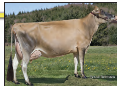
WOODSTOCK LEGION TINA MARIE-ET Dam of Lot 1356

4TH DAM: QS LEGEND TINA {4} 94% 9-10 305 2 20950 4.8 997 3.6 760 DHIR 2471C