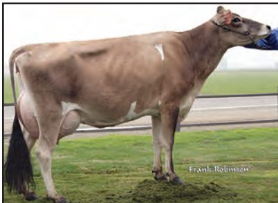
WOODSTOCK HALLMARK TINA TORI {6}-ET Sister to the Grandam of Lot 1466