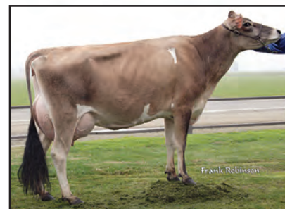
WOODSTOCK HALLMARK TINA TORI {6}-ET Fourth Dam of Lot 1502

4TH DAM: WOODSTOCK HALLMARK TINA TORI {6}-ET 88% 3-01 305 3 21750 4.5 972 3.5 769 91DCR 2620C