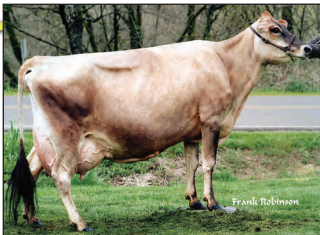
WOODSTOCK ALF LESLIE, E-90% Fourth Dam of Lot 1697