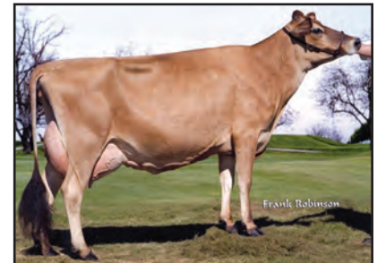
WOODSTOCK THUNDER TINA LOUISE {6}-ET Sister to the Grandam of Lot 1625