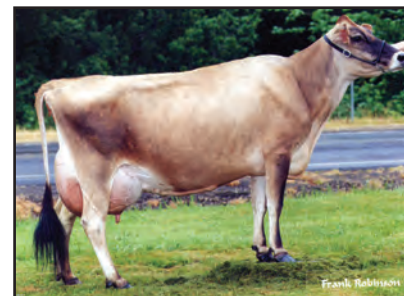
WOODSTOCK DUNCAN TINA {5} Great-Grandam of Lot 1356