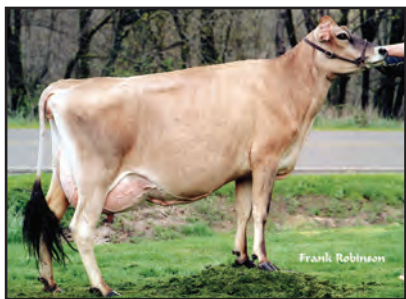
WOODSTOCK LEMVIG LINDY, E-90% Owned by Tollenaar Jerseys, OK