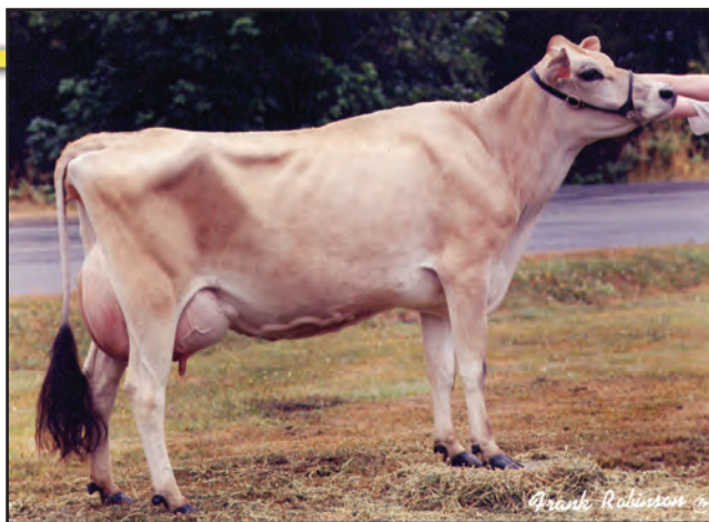
WOODSTOCK LESTER RUBY {6}-ET, E-93% Fifth Dam of Lot 1712