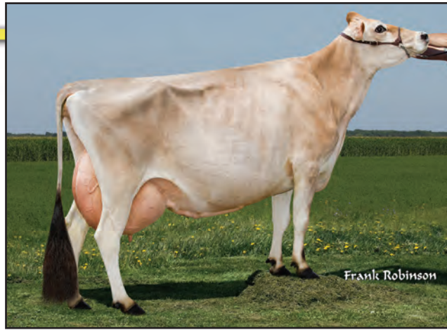
WOODSTOCK MATINEE RINDI-ET, VG-88% Grandam of Lot 1702