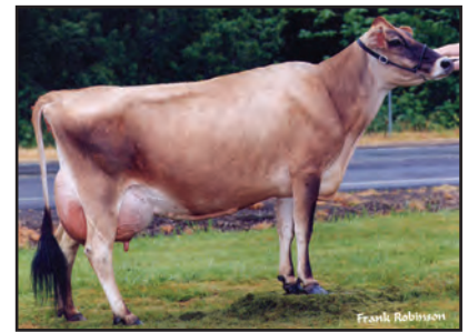
WOODSTOCK DUNCAN TINA {5}, E-95% Sixth Dam of Lot 1775

SUNSET CANYON DZZLER V MAID 2348 87% USA 118706113 GT8K BBR 100 JH1F JH2F TATTOO / C348 DHIA HERD # 46-34-0120 CONTROL # 2348 1-10 305 2 19100 5.6 1066 3.7 702 103DCR 2428C 2-11 305 2 24380 6.4 1566 4.0 983 103DCR 3404C 305 2X ME AVG 2L 26150M 1528F 996P 3448C PPA 2881M 194F 126P / YD 1538M 128F 79P CDCB GPTA 05/01/2018 3RECS 83%R 99%ILE 311M 46F 23P 516CM$ 488NM$ 424FM$ 407GM$ 5.9PL -0.7DPR 0.6CCR 3.3HCR 2.80SCS AJCA 05/01/2018 GPTAT 80%R 1.9 GJUI 33.5 GJPI 76%R 151