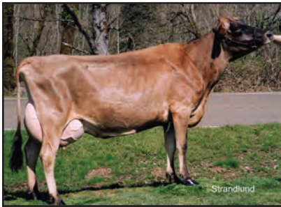
WOODSTOCK SAMBO TINA-ET Great-Grandam of Lot 1585