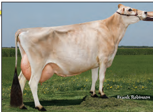
WOODSTOCK MATINEE RINDI-ET, VG-88% Grandam of Lot 1621