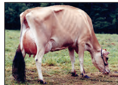
WOODSTOCK BVD CELIA-P, E-92% From the Same Family as Lot 1519

ST SR DF RA RW RL FA 0.4 0.1 1.6 L0.2 -0.2 S0.5 L0.7 FU RH RUW UC UD TP TL -0.4 0.6 1.2 0.6 D1.4 C1.5 S0.6