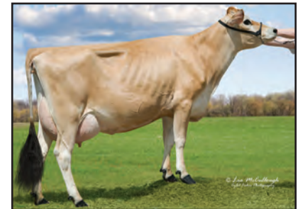
WOODSTOCK JACE LESLIE 3-ET Full Sister to the Grandam of Lot 1595