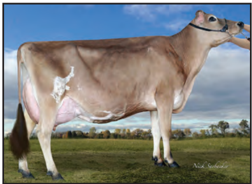
WOODSTOCK PLUS BUTTON {6}, E-91% Dam of Woodstock Critic Buxton at Accelerated Genetics; sire of several daughters in the sale.