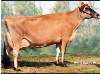
WOODSTOCK BOGART JUNE {5} Great-Grandam of Lot 1767