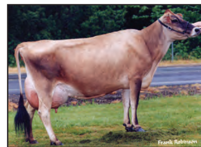
WOODSTOCK DUNCANTINA {5}, E-95% Fifth Dam of Lot 1630

4TH DAM: WOODSTOCK CHASE TINA TILLY {6}-P 83% 2-02 295 2 13370 4.5 606 3.5 473 100DCR 1624C