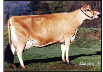
QS LEGEND TINA {4} Great-Grandam of Lot 1462