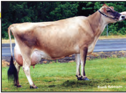
WOODSTOCK DUNCAN TINA {5} Great-Grandam of Lot 1466