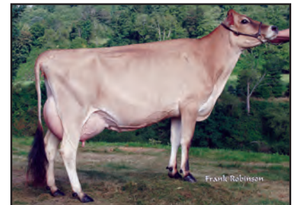
SUNSET CANYON CENTURION MAID Sister to the Dam of Lot 1106