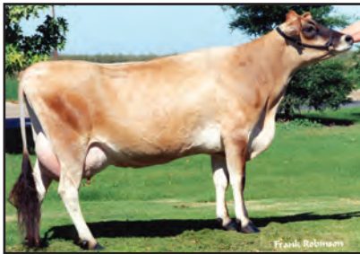
BERRETTA TOIYABI OF OFF BETTYDON-ET, VG-84% Fifth Dam of Lot 1607