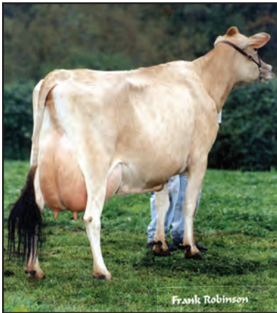
TENN HAUG E MAID Great-Grandam of Lot 1560