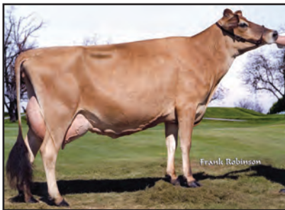
WOODSTOCK THUNDER TINA LOUISE {6}-ET Sister to the Grandam of Lot 1466