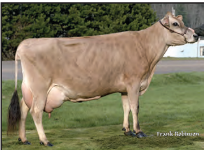
WOODSTOCK BOOMER SOONER ROBIN {5} Fourth Dam of Lot 1669

PA 286M 27F 20P 313CM$ 289NM$ 236FM$ 3.3PL -0.1DPR 0.2CCR 2.0HCR 2.83SCS PA TYPE 0.6 JPI 40%R 89 ST SR DF RA RW RL FA 0.9 0.3 0.2 L0.4 0.5 S0.1 S0.5 FU RH RUW UC UD TP TL 0.7 0.1 0.2 0.3 S0.8 C0.5 L0.0