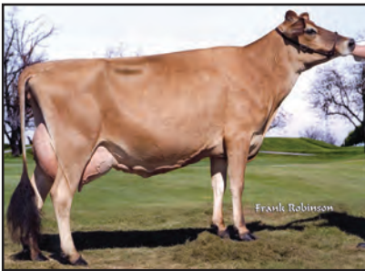
WOODSTOCK THUNDER TINA LOUISE {6}-ET Sister to the Grandam of Lot 1422

DAUGHTER(S): WOODSTOCK ALVIN PS TINA 1673 SELLING AS LOT 1673