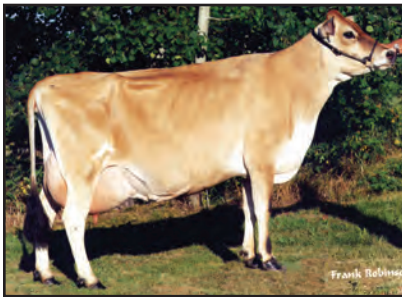
BETTYDON BOLD RENO, VG-84% Sixth Dam of Lot 1302