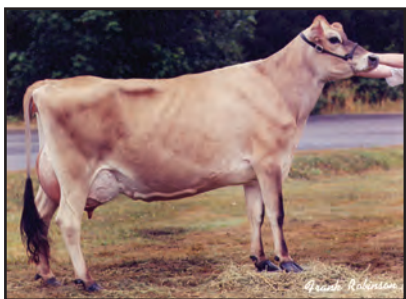
WOODSTOCK DARIAN ANN {5}, E-94% Owned by Wilsonview Dairy, OR