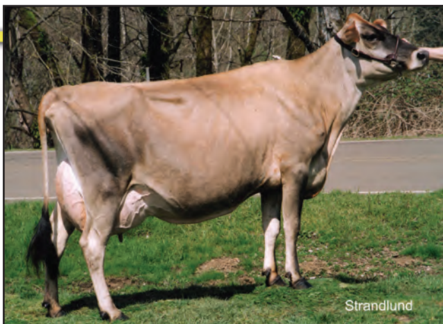
WOODSTOCK THUNDER TINA MARIE {6}-ET, E-91% Great-Grandam of Lot 1471