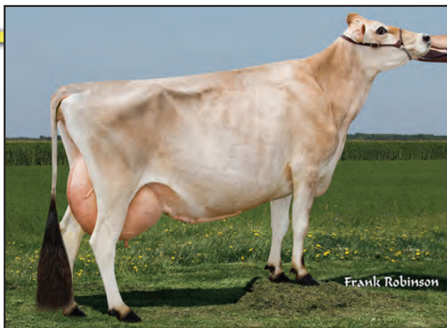
WOODSTOCK MATINEE RINDI, VG-88% Great-Grandam of Lot 1746