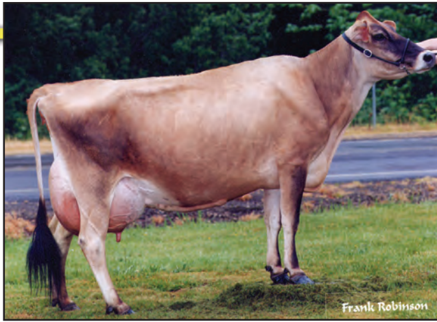
WOODSTOCK DUNCAN TINA {5}, E-95% Fourth Dam of Lot 1766