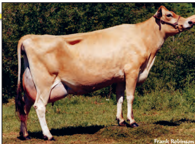
WOODSTOCK MONTANA KACEE {5}, VG-85% Sixth Dam of Lot 1640