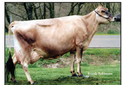
WOODSTOCK ALF LESLIE Sister to the Grandam of Lot 1595