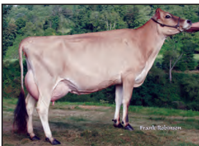
SUNSET CANYON CENTURION MAID Sister to the Grandam of Lot 1560

BORN 09/28/2014 TATTOO W1560 / W1560 P2 DHIA HERD # 35-01-0118 CONTROL # FEMALE EFI 6.9%