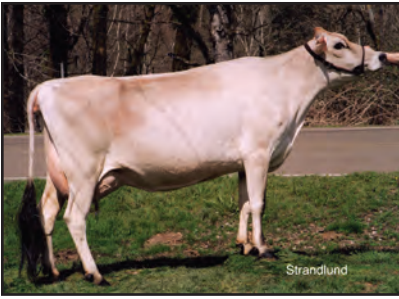
HALLMARK MAID-ET Great-Grandam of Lot 1717

WOODSTOCK DAIRY BREEDER & OWNER IOLA, WI