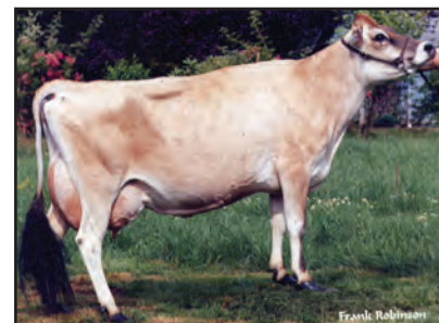
WOODSTOCK ALF ROULETTE-ET, VG-88% Fifth Dam of Lot 1601

SUNSET CANYON DOMINICAN-ET USA 117013483 GT 50K BBR 100 JH1F JH2F 1JE770 CDCB GPTA 04/01/2018 5547DAUS 516HRDS 4%RIP 99%R 542M 0.06% 37F 43%ILE 99%R 0.01% 22P 283CM$ 270NM$ 242FM$ 250GM$ 2.8PL 0.5DPR 0.4CCR 4.2HCR 2.89SCS AJCA 04/01/2018 1531DAUS GPTAT 99%R -0.5 GJUI -3.0 GJPI 99%R 82