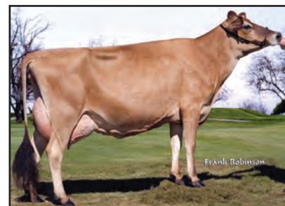
WOODSTOCK THUNDER TINA LOUISE {6}-ET Sister to the Dam of Lot 1400