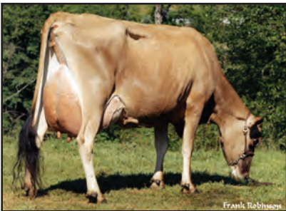
WOODSTOCK BERRETTA TINA {6} Sister to the Grandam of Lot 1422

SIRE: HAWARDEN IMPULS PREMIER USA 067107510 GT50K BBR 100 JH1C JH2F 29J23756 CDCB GPTA 04/01/2018 5918DAUS 900HRDS 9%RIP 99%R -545M 0.25% 23F 42%ILE 99%R 0.14% 8P 299CM$ 262NM$ 173FM$ 242GM$ 3.9PL 1.3DPR 0.0CCR 0.4HCR 3.07SCS AJCA 04/01/2018 3321DAUS GPTAT 99%R 1.0 GJUI 11.7 GJPI 99%R 75