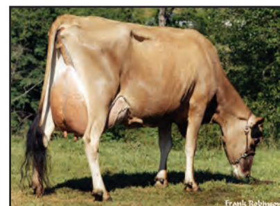
WOODSTOCK BERRETTA TINA {6} Sister to the Grandam of Lot 1356