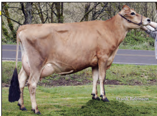
WOODSTOCK LV MORGAN LEXIE-ET, VG-81% Great-Grandam of Lot 1647