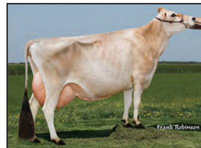
WOODSTOCK MATINEE RINDI-ET Grandam of Lot 1601

HEARTLAND NATHAN TEXAS-ET 95% USA 067041437 GT50K BBR 100 JH1F JH2F DHIA HERD # 48-89-0168 CONTROL # 1437 2-10 305 3 21850 4.6 1008 3.9 843 93DCR 2785C 3-11 305 3 26340 4.3 1130 3.8 991 92DCR 3185C 5-01 305 3 25940 4.6 1185 3.7 963 94DCR 3232C 7-00 183 3 17610 4.8 844 3.5 610 79DCR 2108C 305 2X ME AVG 5L 21944M 1006F 828P 2737C PPA 1728M 27F 71P / YD 1259M 26F 57P CDCB GPTA 05/01/2018 5RECS 92%R 51%ILE 456M 11F 23P 164CM$ 150NM$ 118FM$ 82GM$ 1.3PL -2.5DPR -1.5CCR 0.5HCR 3.05SCS AJCA 05/01/2018 GPTAT 89%R 1.6 GJUI 20.1 GJPI 88%R 54