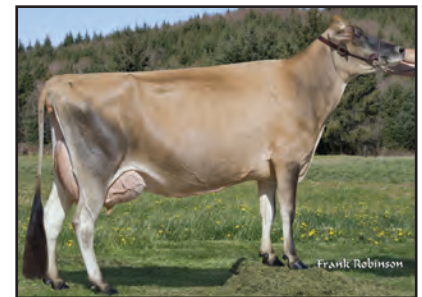
WOODSTOCK LEGION TINA MARIE-ET Sister to the Grandam of Lot 1689