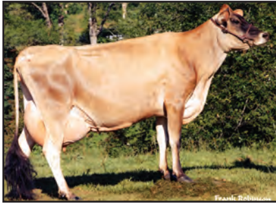
SUNSET CANYON STORM REQUEST-ET Fourth Dam of Lot 1302