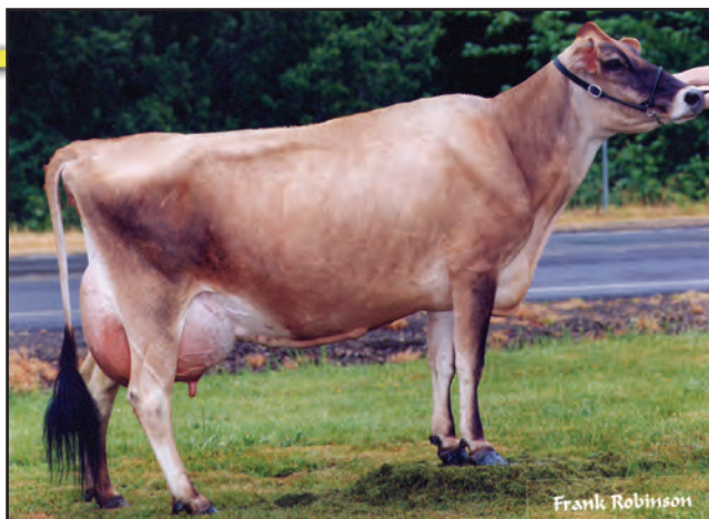
WOODSTOCK DUNCAN TINA {5}, E-95% Fifth Dam of Lot 1700