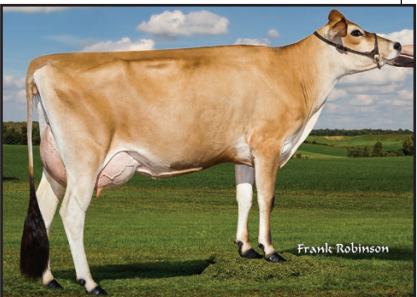
DUPAT MAGNUM 2847-P Dam of Lot B