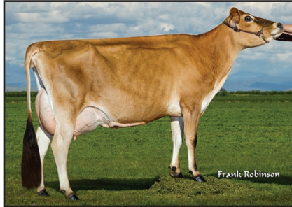
DUPAT CRITIC 406-P-ET Grandam of Lot B