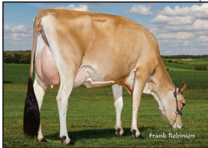
DUPAT MAGNUM 2847-P Dam of Lot B

7TH DAM: DUPAT LYNX ZIPPY {5} 80% 6-11 305 2 20000 4.3 854 3.7 749 DHIA 2343C