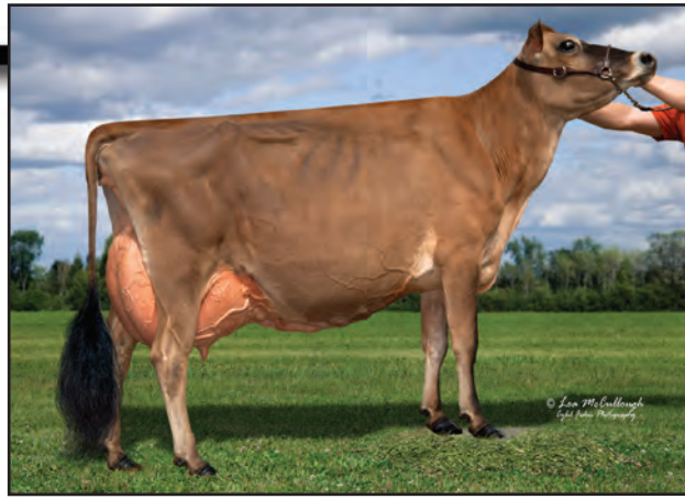
COVINGTON REBEL BABYBELL, E-94% Dam of Lot 16