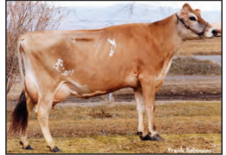
Avon Road Select Libby, E-91% 4-1 305 3x 17,870 4.8% 851 3.6% 649 Sold in 1999