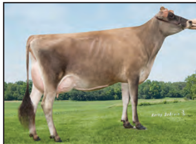
RATLIFF GOVERNOR ASHTYN-ET Sister to Dam of Lot 24