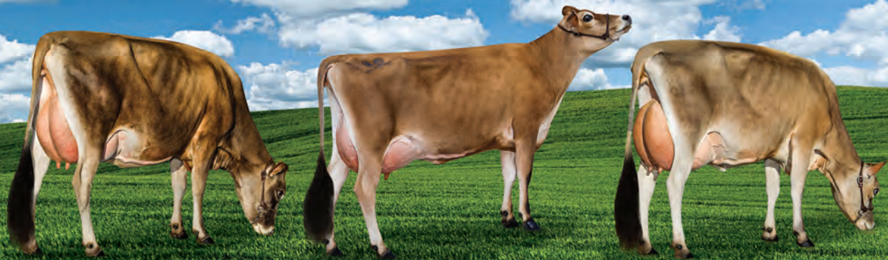
Ahlem Machete Princess 41157-ET, Jer-Z-Boyz Dividend 41589, VG-83% and Ahlem Machete Princess 41161-ET.

WE'VE WITNESSED THE PROFITABILITY OF THE JERSEY COW. WE ARE EXCITED TO BE A PART OF THE JERSEY GENERATION. Visit: http://genex.crinet.com .