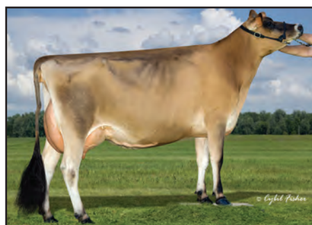
Camille Nevada of Edgebrook, E-91% 3-0 305 15,710 5.0% 791 4.1% 643 Sold in 2010