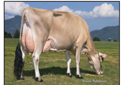
SUNSET CANYON DC NADINE-ET Sister to the Dam of Lot 5