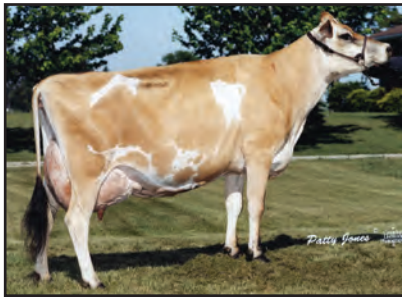
CHARLYN IMPERIAL NELLY Fourth Dam of Lot 12