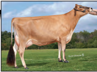
FAMILY HILL REN CARLY-ET Dam of Lot 4