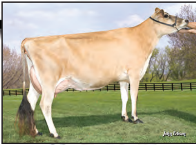
WF COUNCILLER ANAKORNIKOVA-ET Dam of Lot 2