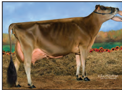
WF COUNCILLER ANANICOLE-ET Sister to Dam of Lot 2