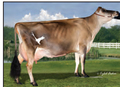
JUSTINES VALIANT JEMINI-ET Sister to the Grandam of Lot 9