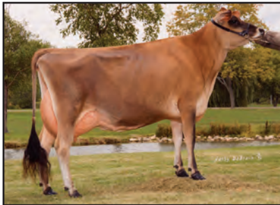
FAMILY HILL JADE CAROLINA-ET Sister to the Dam of Lot 4