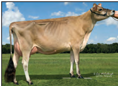
FAMILY HILL COMERICA CHANCE-ET Sister to the Dam of Lot 4