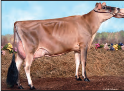
BILLINGS JADE BRYANT Grandam of Lot 20