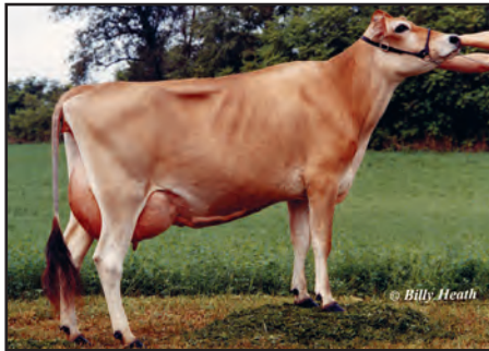
Reich-Dale Future Sierra, E-90% 2-9 305 19,410 5.2% 1,008 3.7% 716 Sold in 2005