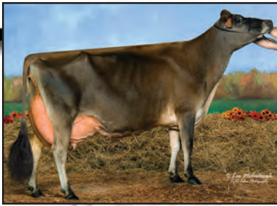
RATLIFF PRICE ALICIA Grandam of Lot 24