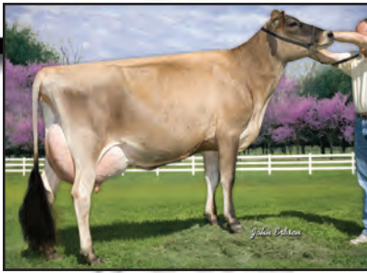
DAVE-RON IATOLA SYLVIA-ET Great-Grandam of Lots 30A-30C