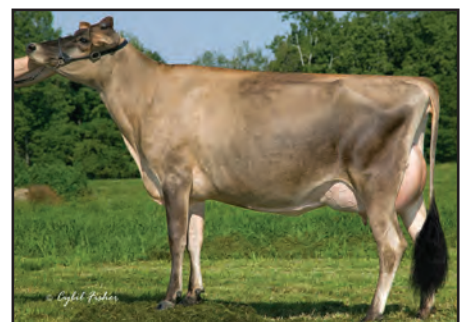
Jurisdiction Jenny, E-90% 2-5 303 18,410 4.8% 890 3.5% 652 Sold in 2008