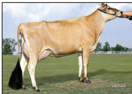
Unique HP Action Sasha, E-90% 4-2 305 18,810 4.2% 792 3.8% 710 Sold in 2012