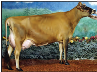
CHARLYN REMAKE SENSATION Sister to the Grandam of Lot 12