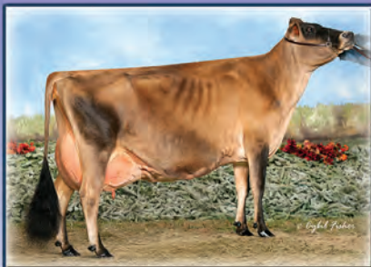
Huronian Centurion Veronica 20J, E-97% She is the third dam of lot 7!