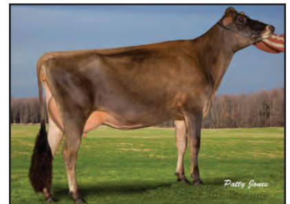
BRIDON VINCENT EXPEL Sister to the Dam of Lot 13