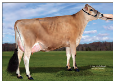
Ahlem Topeka Maid 40257-ET, VG-86% Sold in 2013