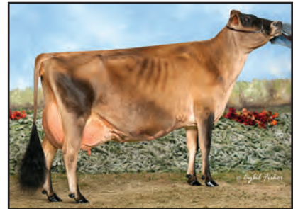
HURONIA CENTURION VERONICA 20J Great-Grandam of Lot 7