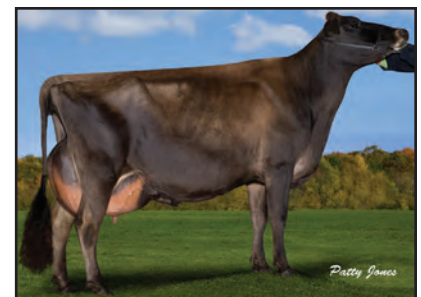
BRIDON LEGION ESSENCE Sister to the Dam of Lot 13