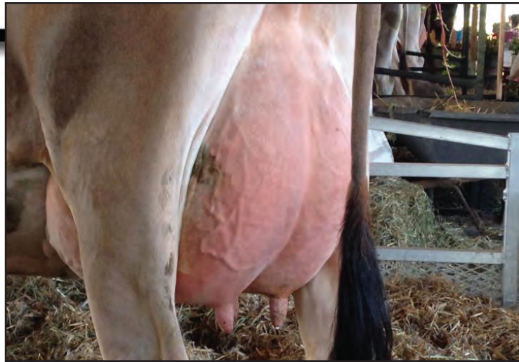
Udder of Lot 26