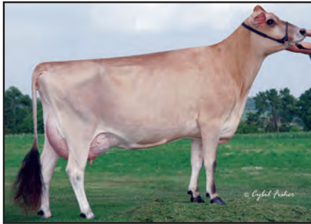
SHF Duke Flicker, E-92% 8-2 305 21,400 5.3% 1,142 3.8% 813 Sold in 2005