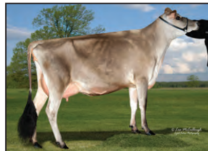
AVON ROAD VALIANT JEN-ET Grandam of Lot 9