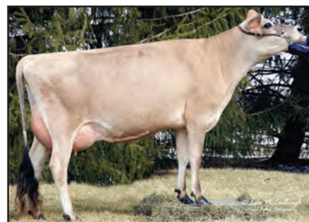
Cloverfield Evander Fiona, VG-85% 3-7 291 13,130 4.4% 573 3.7% 481 Sold in 2009