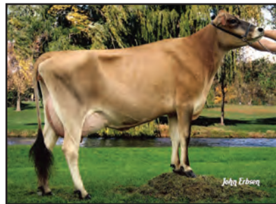
NOBLEDALE VICTORIAS SYDNEY-ET Fourth Dam of Lots 30A-30C