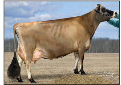
BRIDON ETHAN GABBY Dam of Lot 29

LESTER SAMBO USA 000658836 GT50K JH1F JH2F 7JE356 CDCB GPTA 08/01/2015 9193DAUS 2264HRDS 4%RIP 99%R -681M 0.06% -22F 6%ILE 99%R 0.01% -23P -114CM$ -106NM$ -86FM$ -94GM$ 1.0PL -0.1DPR 1.7CCR 1.3HCR 3.15SCS AJCA 08/01/2015 4438DAUS GPTAT 99%R 1.2 GJUI 16.7 GJPI 99%R -59