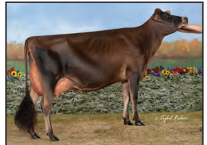
ARETHUSA ON TIME VOGUE-ET Sister to the Grandam of Lot 7