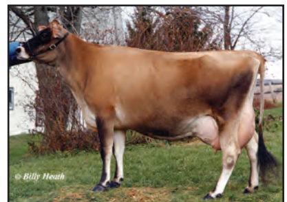
NOBLEDALE JUNO VERMONT Sixth Dam of Lots 30A-30C