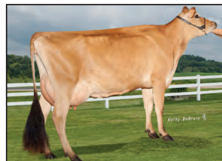
Spring Creek T-Bone Netty-ET, VG-84% Projected to 23,214 --- 972 --- 838 at 1-11 Sold in 2010