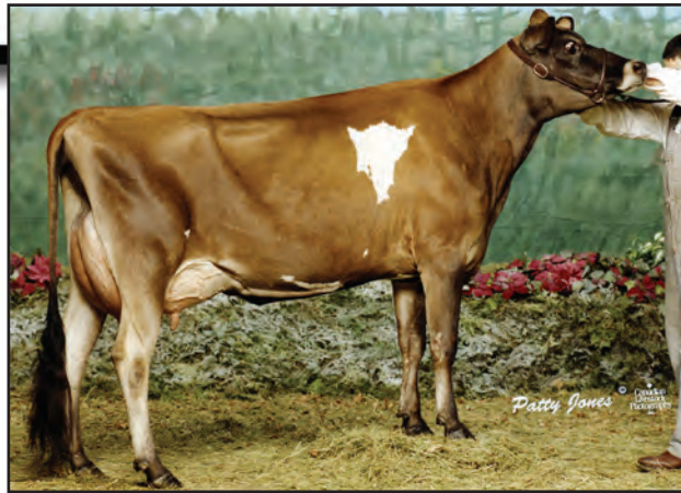
CHARLYN REGAL SALLY, EX 93-5E (CAN) Great-Grandam of Lot 12