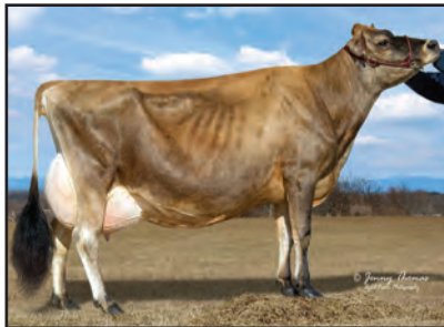
BILLINGS LS BOO BOO Great-Grandam of Lot 20