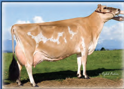
Pleasant Nook F Prize Circus, E-97% Her granddaughter sells as lot 4!

Tuesday, September 29, 2015 ■ Madison, Wis. ■ 7:00 PM CDT