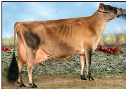
HURONIA CENTURION VERONICA 20J, E-97% Daughter of Lot 32 National Grand Champion, 2004