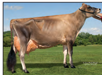
AHLEM LEGAL HALEY 36102 Dam of Lot 11

HEARTLAND NATHAN TEXAS-ET 95% USA 067041437 GT50K JH1F JH2F DHIA HERD # 48-89-0168 CONTROL # 1437 2-10 305 3 21850 4.6 1008 3.9 843 93DCR 2785C 3-11 305 3 26340 4.3 1130 3.8 991 92DCR 3185C 5-01 305 3 25940 4.6 1185 3.7 963 94DCR 3232C 7-00 183 3 17610 4.8 844 3.5 610 79DCR 2108C 305 2X ME AVG 5L 21944M 1006F 828P 2737C PPA 1672M 25F 67P / YD 734M 14F 39P CDCB GPTA 09/01/2015 5RECS 88%R 62%ILE 78M -2F 9P 118CM$ 105NM$ 73FM$ 13GM$ 2.3PL -2.8DPR -2.2CCR -0.3HCR 2.95SCS AJCA 09/01/2015 GPTAT 82%R 1.1 GJUI 18.1 GJPI 82%R 40