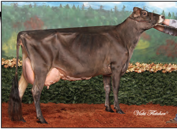
VANDBERG AMEDEO NATASHA, EX 95-5E (CAN) Grandam of Lot 23