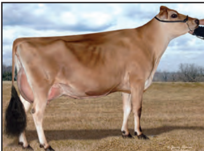
BILLINGS SULTAN BRYCE Sister to the Grandam of Lot 20