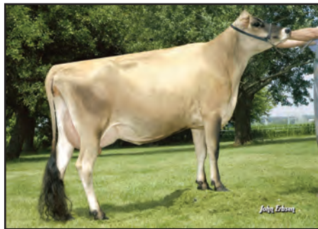
Miss Sherona Remake Jade, VG-85% 2-1 305 12,120 4.5% 541 3.6% 434 Sold in 2008