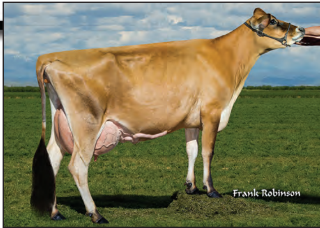
AHLEM LEGAL WYN 35647, VG-86% Dam of Lot 10