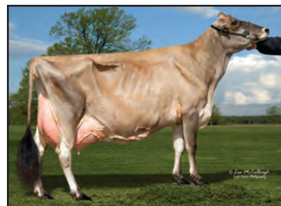
JUSTINES FUROR JULIANNE-ET Sister to the Grandam of Lot 9