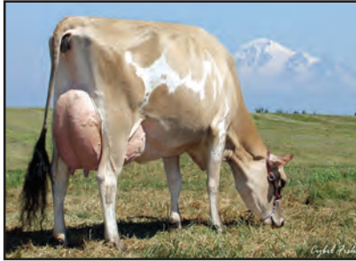
PLEASANT NOOK F PRIZE CIRCUS Grandam of Lot 4