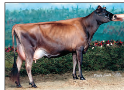
JASPAR RENAISSANCES EVENING Full Sister to the Great-Grandam of Lot 19

ENTERED IN 2017 WORLD DAIRY EXPO FUTURITY