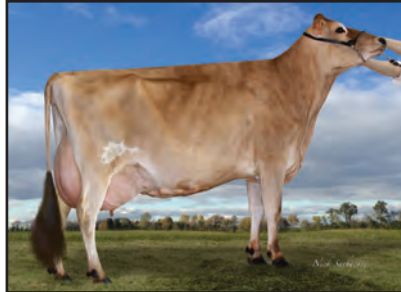
STEINHAUERS RENEGADE CHERRYPIE-ET Sister to the Dam of Lot 22

DP IATOLA FLOWER 16 90% USA 115517123 GT3K JH1F TATTOO / D016 DHIA HERD # 92-20-7001 CONTROL # 16 2-09 288 2 18910 5.0 937 3.6 674 103DCR 2330C 3-08 305 2 20400 5.7 1171 3.7 764 104DCR 2643C 305 2X ME AVG 2L 21920M 1158F 798P 2758C PPA 3482M 210F 119P / YD 2576M 167F 95P CDCB GPTA 09/01/2015 2RECS 85%R 90%ILE 302M 34F 14P 245CM$ 232NM$ 200FM$ 222GM$ 1.2PL 0.5DPR 0.0CCR 0.8HCR 2.84SCS AJCA 09/01/2015 GPTAT 79%R 1.1 GJUI 13.4 GJPI 78%R 94