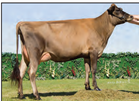
Senn-Sational Iatola Petrina, VG 89 (CAN) 3-0 305 18,664 4.3% 837 3.8% 751 Sold in 2008