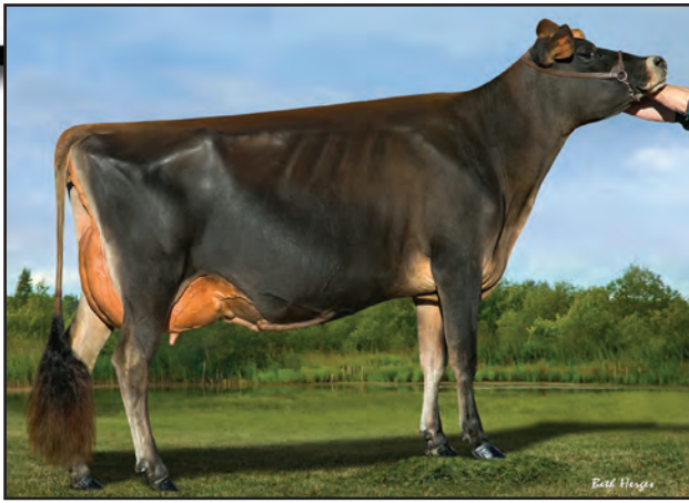
WOODMOHR JADE MYLA, E-90% Dam of Lot 25