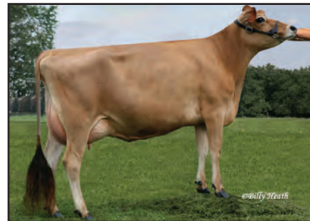
G&S Justice Cinderella, VG-88% 4-5 253 11,500 5.1% 582 4.0% 463 Sold in 2009