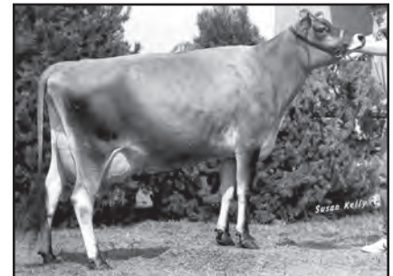
PATRICKS MAJESTIC MANDY Fourth Dam of Lot 25