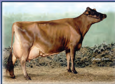
Duncan Belle, EX 3E CAN She is the fourth dam of lot 16!