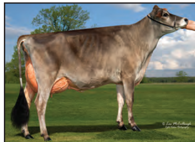
RATLIFF IMPRESSION ANNABELLA-ET Sister to Dam of Lot 24