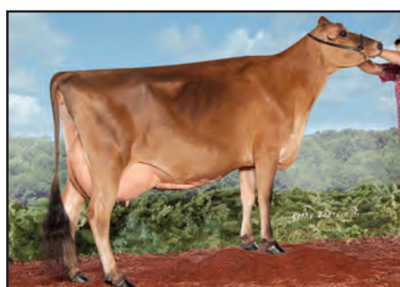
Rapid Bay Shyster Rachel 6th Senior Yearling, 2010 Ontario Spring Sold in 2009