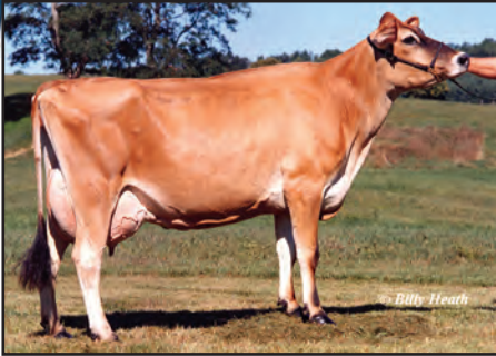
Twin Haven Berretta Linda, E-95% 6-1 305 24,540 4.8% 1,179 3.8% 928 Sold in 1997