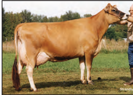
Willavals Lucky Lady, E-93% 3-6 305 19,780 3.8% 745 3.6% 705 Sold in 1997