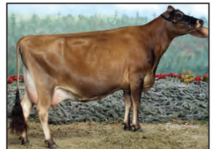
WAYMAR RENAISSANCE NADINE Sister to the Grandam of Lot 5