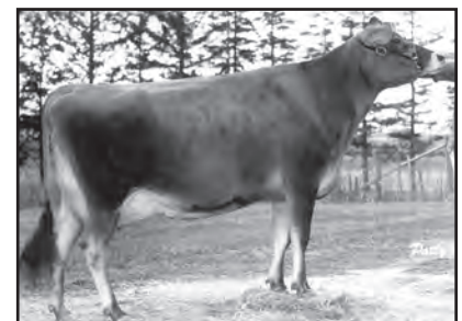
ELMLINE TITLES ELIZA 14R Great-Grandam of Lot 1