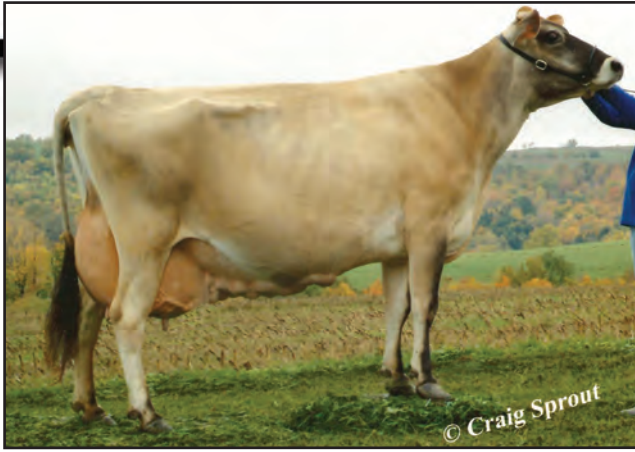
TY-LY-VIEW GG GRACIE, E-90% Great-Grandam of Lot 3