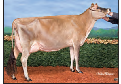
ARETHUSA VERONICAS CUPID-ET Grandam of Lot 7