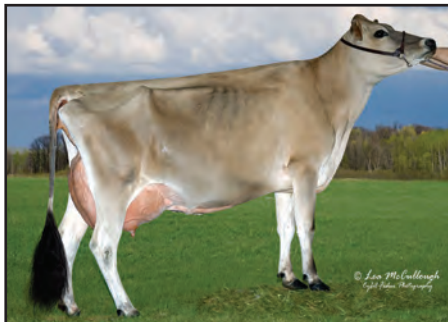
Senn-Sational Signature Joey, E-90% 3-3 305 20,120 4.4% 893 3.3% 654 Sold in 2008