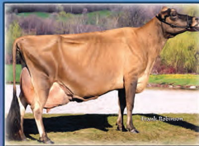
Waymar Patrick Nadine SUP-EX 97 CAN Her granddaughter sells as lot 5!