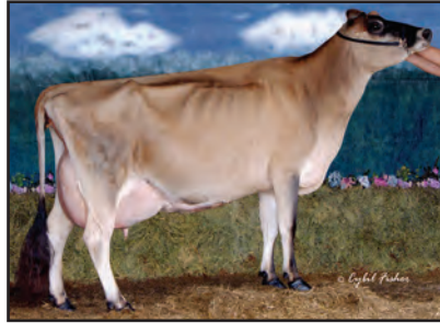
GIPRAT RENN ANASTASIA-ET Grandam of Lot 2