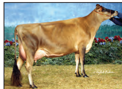
JULIANNAS DELUXE JUSTINE-ET Great-Grandam of Lot 9