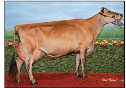
LOOKOUT COMERICA NESTEA Dam of Lot 23

NEXT DAM: VANDBERG JADE NIBS EX 92-5E (CAN) 7-11 305 2 17446 4.3 743 4.0 701 CAN 2167C SIRE: GIPRAT BELLES JADE-ET JPI -24 17%ILE