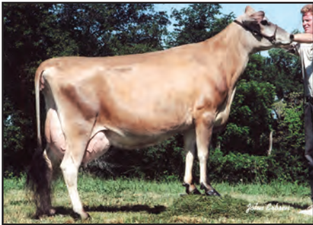
Legion Denny Diane, E-91% 7-7 305 3x 23,100 4.7% 1085 3.3% 765 Sold in 2004