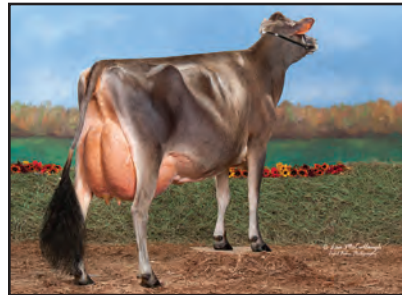
RATLIFF ACTION ANGEL Sister to the Dam of Lot 24