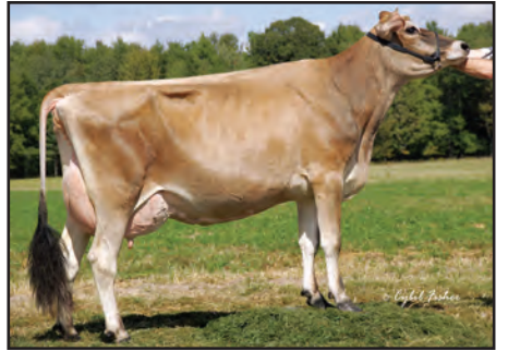
Flambeau Manor F Candance, E-93% 4-4 301 20,700 3.9% 814 3.1% 633 Sold in 2005