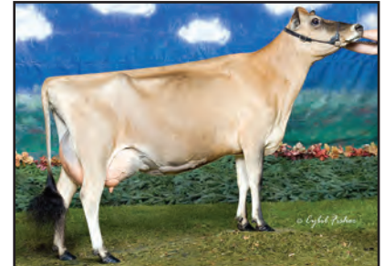
JASPAR R EVENING MOON-ET Dam of Lot 1