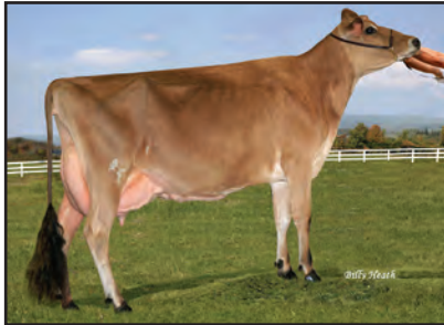
FAMILY HILL CONNECTION CHILLI-ET Sister to the Dam of Lot 4 Dam of Chilli Action Colton-ET at Select Sires