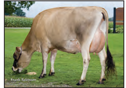
BRIDON LS ECHO-ET Grandam of Lot 13