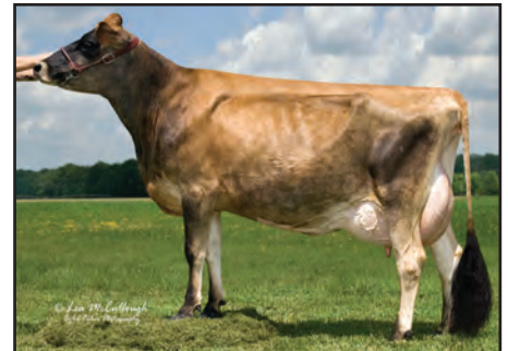
Bryersquart Chairman Belles, VG-88% 3-9 305 16,300 4.9% 793 3.9% 634 Sold in 2008