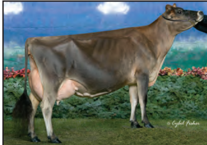
RATLIFF SAMBO MARTINA, E-94% Daughter of Lot 31 Winner, 2007 National Jersey Jug Futurity