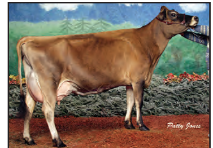
JASPAR RENAISSANCES ENVISION Sister to the Dam of Lot 1