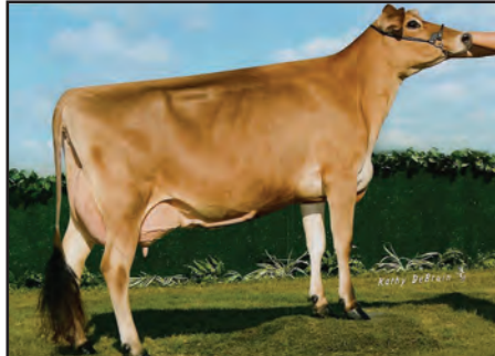
Jewels Vegas Nevada, E-90% 3-1 305 14,180 4.6% 649 4.1% 586 Sold in 2008