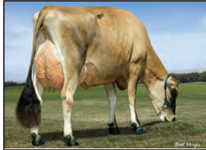
FREEMANS LEGAL SYLVIA-ET Sister to the Grandam of Lots 30A-30C