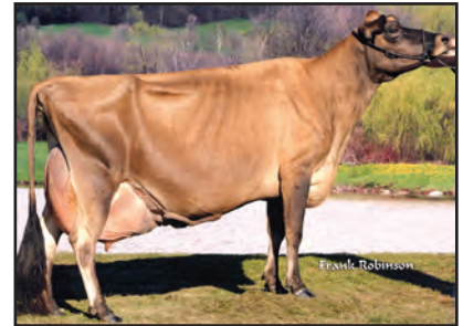
WAYMAR PATRICK NADINE Grandam of Lot 5