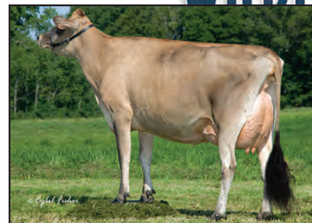
Kimbles Flora, E-91% 4-1 305 21,070 4.5% 956 3.1% 647 Sold in 2008