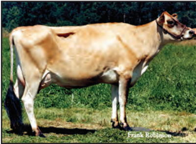
GOLDUST BARBER LEA Great-Grandam of Lot 6