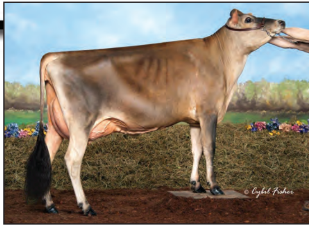
BILLINGS VINCENT BRECK, E-90% Dam of Lot 20