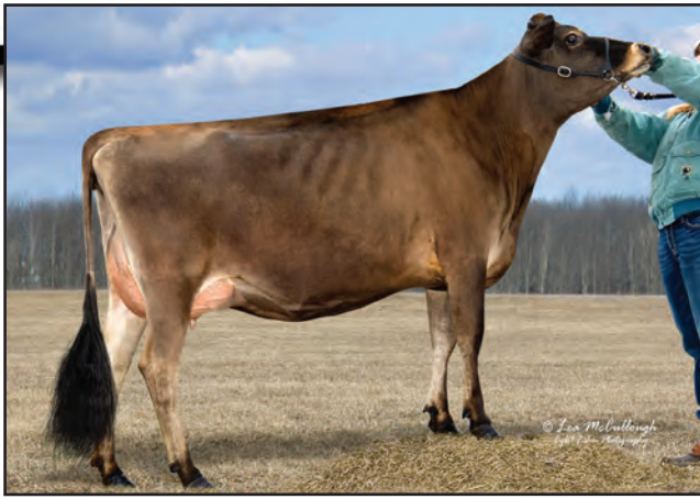
CLOVER FIELD EXCITATION GODIVA, E-92% Sister to Lot 29