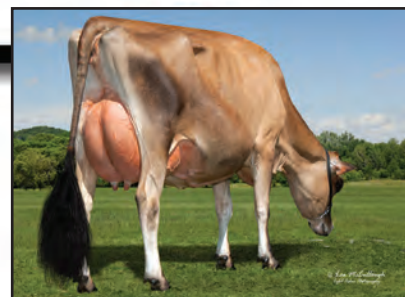
AVON ROAD HG JOLIE-ET Dam of Lot 9

SISTER(S): JUSTINES VINDICATION JUSTICE 90% 5-01 305 2 19150 5.1 984 3.6 696 98DCR 2407C JUSTINES CENTURION JINELLE-ET 91% 2-10 305 2 17590 5.0 880 3.6 634 95DCR 2192C 1ST MILKING YEARLING & BU, 2007 MID-ATLANTIC REGIONAL 6TH SR TWO-YEAR-OLD, 2008 MID-ATLANTIC REGIONAL 3RD SR THREE-YEAR-OLD, 2009 EASTERN STATES EXPO JUSTINES CENTURION JANINE-ET 90% 2-00 305 2 11210 5.1 572 3.6 406 95DCR 1404C 3RD MILKING SENIOR YEARLING, 2007 ALL AMERICAN SHOW JUSTINES VALIANT JEMINI-ET 93% 4-08 305 2 22120 4.9 1094 3.6 786 97DCR 2717C JUNIOR CHAMPION & BB&O, 2007 NY SPRING CAROUSEL 1ST SENIOR YEARLING, 2007 MID-ATLANTIC REGIONAL JUSTINES VALIANT JYPSY-ET 90% JUSTINES FUROR JULIANNE-ET 92% 5-01 305 2 19700 5.0 987 3.6 711 100DCR 2458C JUSTINES CONNECTION JUSTINA-ET 90% 2-01 305 2 16470 4.3 716 3.5 571 104DCR V 1936C 1ST JR 2 & PRODUCTION AWARD, 2008 SC STATE FAIR JUSTINES CGAR JINGLE-ET 90% 4-08 266 2 17510 4.3 751 3.8 667 87DCR 2129C 2ND INTERMEDIATE YEARLING, 2008 CA SPRING JERSEY SHOW 9TH SR THREE-YEAR-OLD, 2010 CA STATE FAIR JR SHOW JUSTINES CGAR JOLLY-ET 92% 4-05 305 2 21320 5.6 1190 3.6 769 98DCR 2659C 4TH SR TWO-YEAR-OLD, 2009 CENTRAL NATIONAL JR SHOW