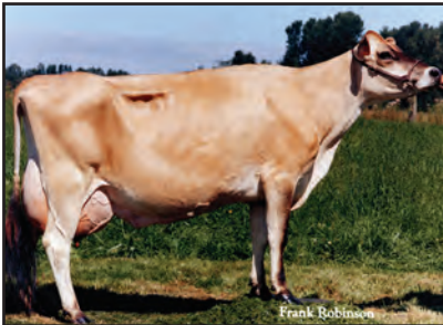
GOLDUST SOONER LEA Fourth Dam of Lot 6

BROTHER(S): GOLDUST JACINTO LARAMIE AT SELECT SIRES GJPI 6 18%ILE GR GOLDUST GARDEN LUCKY{3}-ET AT SEMEX ALLIANCE GJPI 29 17%ILE GOLDUST VALENTINO LAYNE-ET AT ALTA GENETICS GJPI 87 41%ILE GOLDUST KARBALA LADD-ET AT ALTA GENETICS GJPI 100 51%ILE GOLDUST LEGAL LANSING-ET AT ABS GLOBAL GJPI 106 43%ILE GOLDUST LEGAL LAWSON-ET AT ABS GLOBAL GJPI 102 42%ILE GOLDUST VERNON LEN-ET AT SELECT SIRES GJPI 110 57%ILE GOLDUST PLUS LAZARO-ET AT ALTA GENETICS GJPI 121 47%ILE