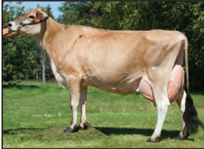
STEINHAUERS H MARK APPLEPIE Gramdam of Lot 22