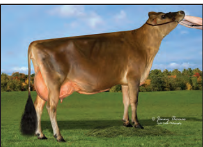
BILLINGS MINISTER BREIGH Sister to the Grandam of Lot 20

BORN 11/05/2013 PO FEMALE EFI 4.9% AMERICAN ID 128 / 128