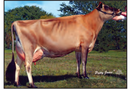
PREMONITION GRACE Grandam of Lot 17