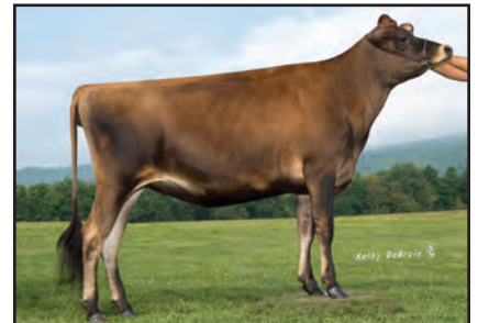
ARETHUSA VALIANT GUESS-ET Sister to Lot 17