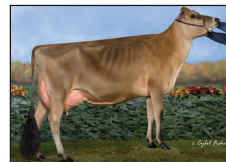
Avonlea Salty Kisses-ET, E-93% 2-9 297 15,551 5.4% 833 3.9% 612 Sold in 2011