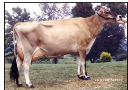
NOBLEDALE PITINO VICTORIA-ET Fifth Dam of Lots 30A-30C