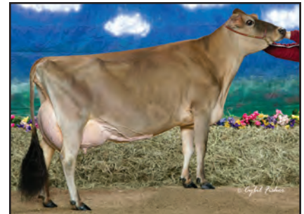
COWBELL COUNCILLOR PRALINE Great-Grandam of Lot 21

SELECT-SCOTT MINISTER-ET JECAN000101483843 GT HD JH1F JH2F 200JE427 CDCB GPTA 08/01/2015 1568DAUS 729HRDS 9%RIP 99%R -1713M 0.21% -43F 1%ILE 99%R 0.09% -45P -299CM$ -306NM$ -321FM$ -246GM$ -0.2PL 1.4DPR 2.2CCR -1.5HCR 3.17SCS AJCA 08/01/2015 1120DAUS GPTAT 98%R 0.3 GJUI 16.1 GJPI 97%R -138