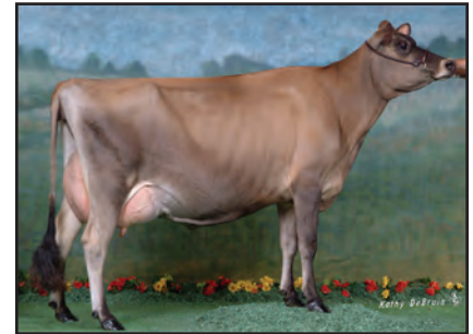
MILLERS MAJESTIC MELISSA Great-Grandam of Lot 25

4TH DAM: PATRICKS MAJESTIC MANDY 1-11 241 2 10160 3.9 396 3.3 337 DHIR 1071C GRAND CHAMPION, 1993 INDIANA STATE FAIR RESERVE GRAND CHAMPION, 1993 KENTUCKY STATE FAIR 1ST SENIOR YEARLING IN MILK, 1991 ALL AMERICAN OPEN & JUNIOR SHOW 2ND SR TWO-YEAR-OLD, 1992 ALL AMERICAN JUNIOR SHOW 5TH SR TWO-YEAR-OLD, 1992 ALL AMERICAN JERSEY SHOW