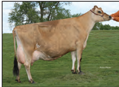
IMPULS BELLE Sister to the Grandam of Lot 13