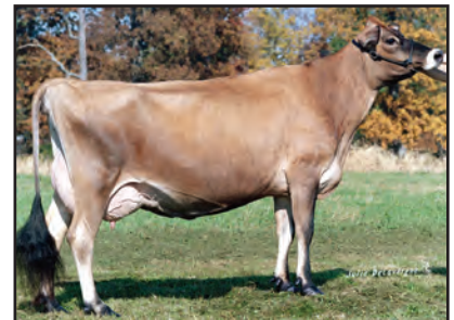
HURONIA GD GRACE 24J Grandam of Lot 29

4TH DAM: HURONIA GB GERTIE 39C EX 92-2E (CAN) 4-06 305 2 17232 4.5 781 3.7 646 CAN 2147C 1ST 4-YEAR-OLD, 1998 ONT DAIRY DISCOVER 3RD PLACE, 1998 ROYAL JERSEY FUTURITY