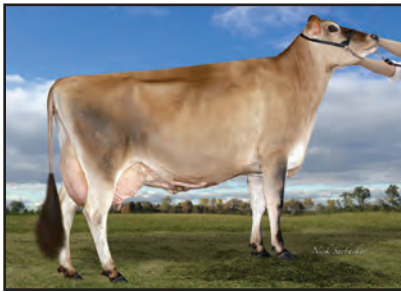
STEINHAUERS RENEGADE LEMONPIE-ET Sister to the Dam of Lot 22

STEINHAUERS H MARK APPLEPIE 92% USA 113506044 GT 50K JH1F JH2F TATTOO S42 / S42 DHIA HERD # 35-59-1096 CONTROL # 42 2-04 305 2 17010 4.8 822 3.8 638 94DCR 2200C 3-04 278 2 18020 5.1 927 3.7 664 94DCR 2296C 4-03 305 2 23540 4.7 1117 3.8 888 94DCR 3020C 5-03 305 2 20350 4.6 926 3.6 729 98DCR 2491C 6-03 305 2 17130 4.6 796 3.7 628 98DCR 2144C 305 2X ME AVG 5L 21394M 1022F 786P 2698C PPA -42M 30F 17P / YD 142M 32F 21P CDCB GPTA 09/01/2015 5RECS 88%R 49%ILE -148M -1F -2P 63CM$ 62NM$ 59FM$ 95GM$ 1.0PL 1.5DPR 1.4CCR -0.4HCR 3.13SCS AJCA 09/01/2015 GPTAT 85%R 1.1 GJUI 19.2 GJPI 83%R 20