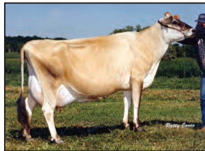
STARHEART DUNCAN ALPHA Great-Grandam of Lot 2