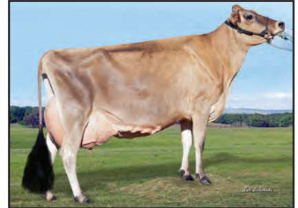
ARETHUSA VERIFY PEANUT Grandam of Lot 21

PLEASANT NOOK SAMBO TEAL 94% JECAN000010202602 TATTOO D8W / 8J 3-11 305 2 17540 5.3 923 3.5 615 94DCR 2125C 5-00 305 3 19040 5.2 990 3.5 662 94DCR 2288C 6-06 305 2 21960 5.9 1287 3.4 755 94DCR 2609C 8-00 305 2 25000 6.0 1501 3.5 869 95DCR 3003C 305 2X ME AVG 6L 19008M 1065F 676P 2335C PA -1018M -25F -31P -228CM$ -225NM$ -219FM$ -0.8PL -0.3DPR 0.6CCR 0.7HCR 3.07SCS PA TYPE 0.5 JPI 39%R -95