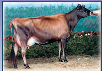
Jaspar Renaissances Evening, EX 91 CAN Several family members sell. Lots 1, 13 & 19!