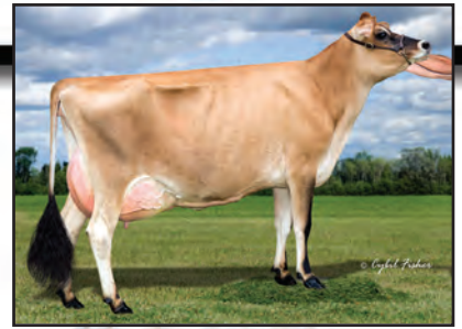
ARETHUSA REAGAN CATRINA-ET Dam of Lot 7

SISTER(S): ELLIOTT'S GOLDEN VISTA-ET 95% 3-04 365 2 22399 6.7 1502 4.2 939 DHIA 3254C 1ST 100,000 LB CLASS, 2012 INTERNATIONAL JERSEY SHOW ELLIOTT'S GOLDEN VANESSA-ET 93% 7-04 305 2 12110 4.7 574 3.3 401 101DCR 1384C ARETHUSA PRIMETIME DEJA VU-ET 95% 5-00 305 2 20000 5.0 996 3.8 763 96DCR 2640C ARETHUSA VERONICAS DASHER-ET 95% 7-04 305 3 27720 5.9 1643 3.6 1007 90DCR 3482C RESERVE GRAND CHAMPION, 2012 NY SPRING CAROUSEL ARETHUSA VERONICAS COMET-ET 95% 4-06 305 2 19970 6.5 1292 3.6 710 96DCR 2454C GRAND CHAMPION, 2010 ROYAL WINTER FAIR RES. GRAND CHAMPION, 2009 ROYAL WINTER FAIR ARETHUSA VERONICAS DONNER-ET 90% 6-06 304 2 25980 5.6 1464 4.0 1049 98DCR 3633C ARETHUSA RESURRECTION VERSACE-ET 93% 7-09 305 2 22150 5.4 1190 4.0 877 96DCR 3036C ARETHUSA RESPONSE VANITY-ET 93% 5-10 305 2 22760 6.4 1465 3.3 751 98DCR 2593C ARETHUSA RESPONSE VIVID-ET 94% 6-00 305 2 22670 6.5 1482 3.5 790 97DCR 2730C RESERVE SUPREME CHAMPION, 2012 WORLD DAIRY EXPO SUPREME CHAMPION, 2012 EASTERN STATES EXPOSITION ARETHUSA ON TIME VOGUE-ET EX 94 (CAN) 2-00 305 2 26264 3.0 778 2.0 529 CAN 1809C INTERMEDIATE CHAMPION, 2013 ROYAL WINTER FAIR ALL CANADIAN JUNIOR THREE-YEAR-OLD, 2013 ALL CANADIAN JUNIOR TWO-YEAR-OLD, 2012 ARETHUSA VAUDEVILLE EXCITEMENT-ET 91% 2-04 305 2 14310 6.2 881 4.2 595 97DCR 2061C HIGH SELLER, 2015 AVONLEA/ARETHUSA SUMMER SPLASH