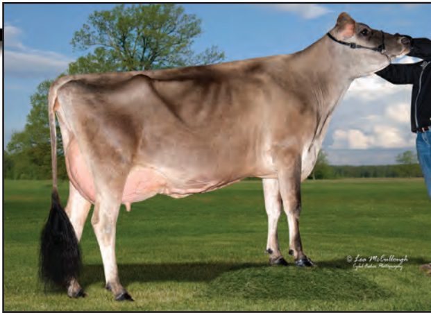
DREAMCREEK JADE GADGET, E-94% Dam of Lot 27