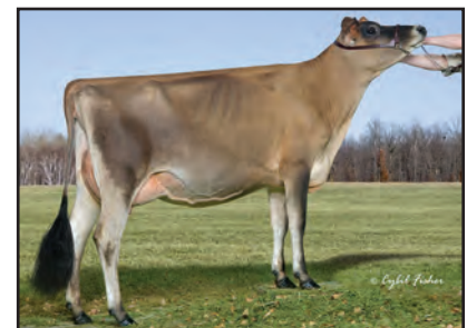
SUNSET CANYON SULTAN NADINE 111-ET Sister to the Dam of Lot 5