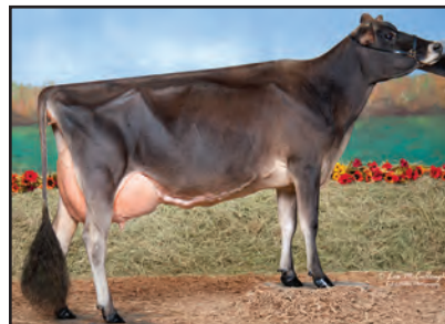
WF IATOLA ANAROSA Sister to Dam of Lot 2