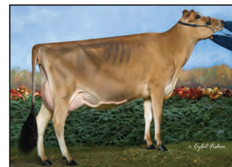
Moon Valley Cadillac, E-90% 1-11 305 3x 12,420 4.0% 502 3.8% 469 Sold in 2010