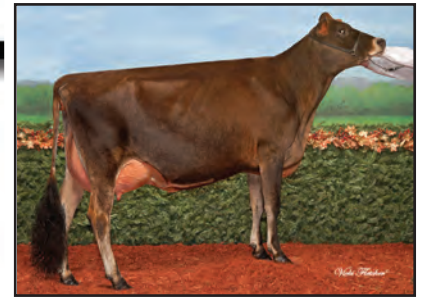
BRIDON ROCKET AMUSE Sister to Lot 13