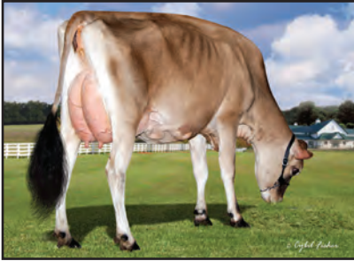
GOLDUST KARBALA LAINA-ET Sister to Lot 6

ST SR DF RA RW RL FA 0.1 0.6 -0.2 H0.3 0.2 PO.1 SO.2 FU RH RUW UC UD TP TL 1.3 0.5 0.4 0.4 51.7 CO.3 LO.2