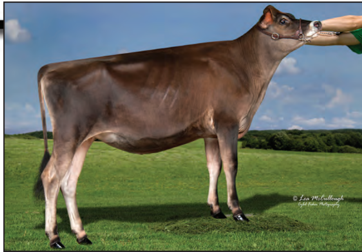
Selling as Lot 18