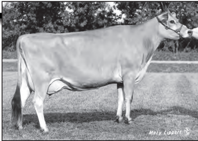
GIL-BAR KEYNOTE HARMONY, E-93% Seventh Dam of Lot 8