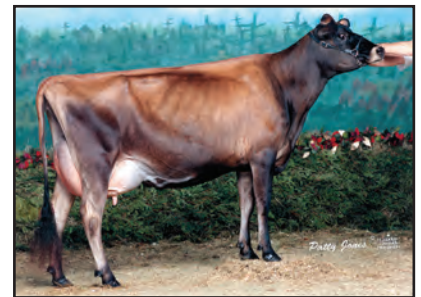
JASPAR RENAISSANCES EVENING Great-Grandam of Lot 13