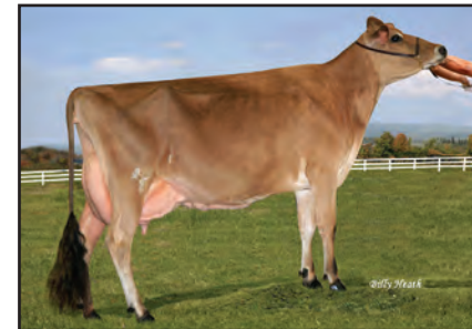
FAMILY HILL CONNECTION CHILLI-ET Fifth Dam of Lot 9B

ELLIOTTS REGENCY CASINO-ET JE840003125141657 GT50K BBR 100 JH1F G A2A2 14JE725 CDCB GPTA S 08/01/2023 6163DAUS 1120HRDS 19%RIP 99%R -299M 0.06% -1F 17%ILE 99%R 0.11% 12P 114CM$ 104NM$ 10FM$ 50GM$ 2.4PL 0.1LIV -0.3DPR 0.0CCR 1.2HCR 3.12SCS -0.1MFV 0.3DAB -0.1KET -0.9MAS 0.5MET 0.1RPL -1.10HTI AJCA 08/01/2023 3536DAUS GPTAT 99%R 2.0 GJUI 17.1 GJPI 99%R 29