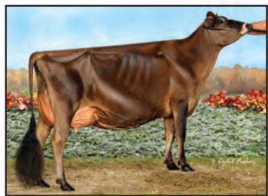
MB LUCKY LADY FELIZ NAVIDAD-ET Sister to the Dam of Lot E

ALL LYNNS LOUIE VALENTINO-ET USA 116279413 GT50K BBR 100 JH1C F A2A2 7JE1038 CDCB GPTA S 08/01/2023 23664DAUS 2642HRDS 4%RIP 99%R 324M -0.10% -5F 15%ILE 99%R -0.03% 5P 76CM$ 78NM$ 99FM$ -42GM$ 2.4PL 3.4LIV -2.2DPR -2.9CCR -0.2HCR 2.95SCS 0.3MFV 0.6DAB 0.4KET 1.1MAS 1.1MET 0.4RPL 8.77HTI AJCA 08/01/2023 10319DAUS GPTAT 99%R 1.0 GJUI 6.6 GJPI 99%R 9