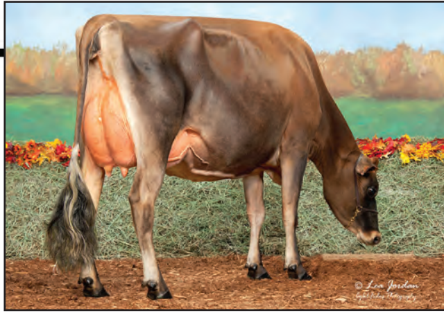
TLJ TEQUILA CARAMEL-ET, E-91% Daughter of Family Hill Ren Carly-ET