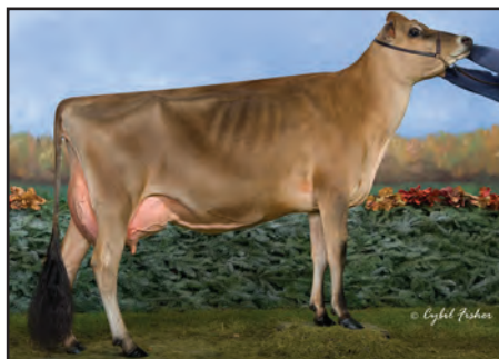
Avonlea Salty Kisses-ET, E-93% 2-9 297 15,551 5.4% 833 3.9% 612 Sold in 2011