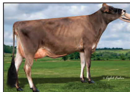
DISCOVERYS SHOWDOWN GIOVANNA Sister to the Dam of Lot 17