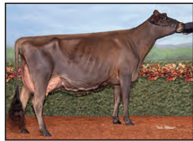
MB LUCKY LADY FIRED UP-ET Sister to the Dam of Lot E

MARLAU VINDICATION FARREN VG 85 (CAN) 6-01 305 2 23137 7.0 1625 4.0 919 CAN 3182C 4 STAR BROOD COW, MAY 2019 PLATINUM AWARD, DECEMBER 2013 SILVER AWARD, NOVEMBER 2011 GOLD AWARD, DECEMBER 2009 MARLAU RESSURECTION FAMOUS VG 85 (CAN) 8-06 289 2 14776 4.9 721 3.9 578 CAN 1957C MARLAU TEQUILA FABY VG 85 (CAN) 5-03 305 2 18800 7.4 1385 3.9 739 CAN 2559C MARLAU TEQUILA FARREN-ET VG 87 (CAN) 1-11 305 2 11515 5.9 684 4.2 478 CAN 1656C ALL CANADIAN JR 2-YEAR-OLD, 2015 1ST JR 2-YEAR-OLD, 2015 ROYAL WINTER FAIR MARLAU TEQUILA FABIENNA EX 91 (CAN) 5-09 305 2 12917 6.4 827 4.1 525 CAN 1818C MARLAU BEAUTIFUL FANCY EX 91-4E (CAN) 4-08 305 2 15420 6.1 933 4.1 633 CAN 2193C MARLAU JOEL FLICKA-ET EX 90-3E (CAN) 3-02 305 2 16463 6.0 992 4.2 692 CAN 2398C SILVER AWARD, AUGUST 2021