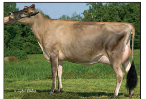
Jurisdiction Jenny, E-90% 2-5 303 18,410 4.8% 890 3.5% 652 Sold in 2008