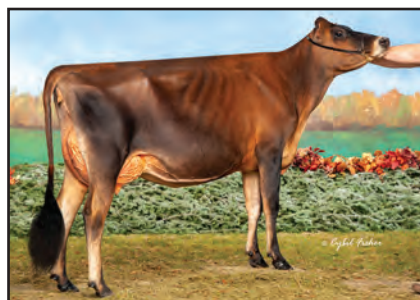
DISCOVERYS JEDI EMPRESS Sister to the Dam of Lot 19