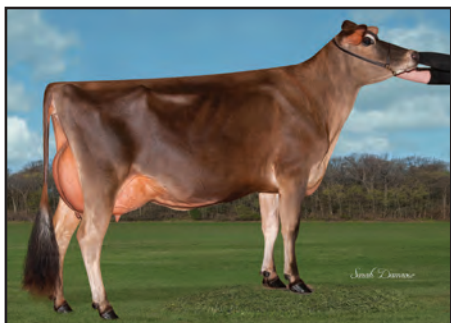
Mead-Manor Tequila Pryia, E-91% 3-0 305 20,390 4.9% 1,000 3.7% 751 "Peaches" is sister to her dam | Sold in 2015