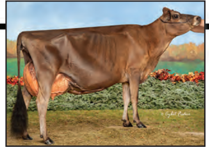
SOUTH MOUNTAIN VOLTAGE RADIANT-ET Sister to the Dam of Lot 15

4TH DAM: SHF PF ROSA 88% 3-11 267 2 11190 4.8 536 3.8 430 90DCR 1455C 5TH DAM: SHF BROOK ROSEBUD 88% 6TH DAM: ROSALEA IMPS S J BEAUTY 91%