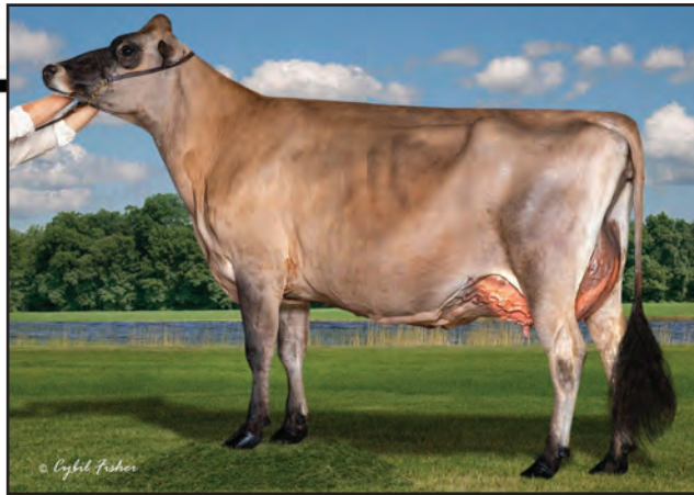
GONE HAYWIRE COLTONS CONFETTI, VG-88% Dam of Lot D