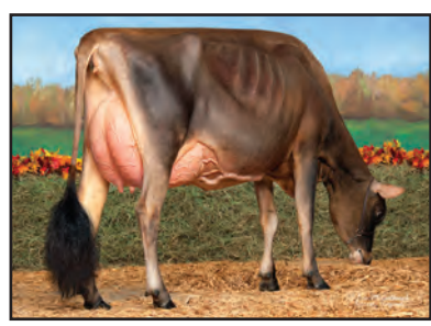
MB LUCKY LADY FIREBALL-ET Sister to the Dam of Lot E

MARLAU COMERICA FABIENNE SUP EX 94-3E (CAN) JECAN000105710282 1-10 305 2 14310 5.8 833 4.0 578 CAN 2002C 4-06 305 2 16196 5.9 953 4.0 646 CAN 2237C 5-10 305 2 17783 6.1 1091 4.0 719 CAN 2490C 8-04 305 2 20057 6.0 1195 4.0 796 CAN 2756C 10-05 305 2 17713 5.9 1043 4.2 743 CAN 2575C CDCB PTA 08/01/2023 ORECS 60%R 5%ILE -2023M 0.49% -3F 0.10% -55P -442CM$ -445NM$ -471FM$ -2.4PL -2.0LIV 0.9DPR 1.5CCR -0.8HCR 3.01SCS -406GM$ -0.1MFV -0.7DAB -0.9KET 1.2MAS 0.5MET 0.4RPL -2.79HTI AJCA 08/01/2023 PTAT 47%R 0.7 JUI 7.0 JPI 53%R -90