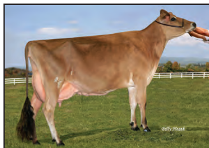
FAMILY HILL CONNECTION CHILLI-ET Fourth Dam of Lot 12

TJ CLASSIC MINISTER VENUS-ET 95% USA 117243875 GT13K BBR 100 JH1F F A1A2 TATTOO M15/M15 DHIA HERD # 33-87-0722 CONTROL # 4 3-05 280 2 13050 5.1 671 3.9 506 98DCR 1751C 4-05 269 2 13980 5.7 794 3.9 542 101DCR 1876C 5-04 305 2 16090 6.3 1006 3.5 567 103DCR 1960C 8-00 305 3 14990 4.8 727 3.5 528 104DCR 1825C 305 2X ME AVG 4L 15235M 845F 557P 1926C CDCB GPTA S 09/05/2023 ORECS 88%R 1%ILE -1952M 0.08% -80F 0.05% -62P -668CM$ -664NM$ -645FM$ 0.8PL 2.2LIV 1.3DPR 1.7CCR -1.4HCR 3.11SCS -706GM$ 0.0MFV -0.5DAB -0.5KET -1.5MAS 0.5MET 0.4RPL -5.09HTI AJCA 09/05/2023 GPTAT 86%R 0.6 GJUI 10.0 GJPI 83%R-151