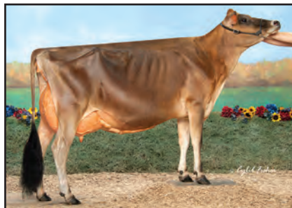
REICH-DALE VADEN STROLLIN From the Same Family as Lot 5