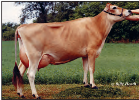
Reich-Dale Future Sierra, E-90% 2-9 305 19,410 5.2% 1,008 3.7% 716 Sold in 2005