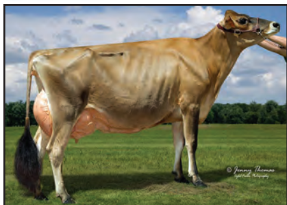
CHILLI PT CHEYENNE-ET Great-Grandam of Lot 12