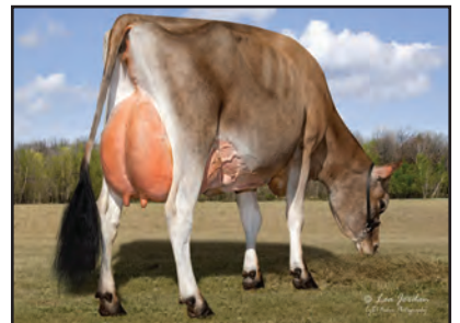
ELLIOTTS CHAVEZ RENEE-ET Sister to the Dam of Lot 15