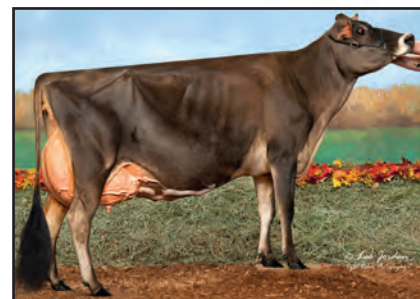
DISCOVERYS TEQUILA JEWELENE Grandam of Lot 17

4TH DAM: THOMSEN 4226 CADILLAC JAY {5} 95% 5-08 365 2 23683 5.3 1250 4.1 963 DHIR 3336C GRAND CHAMPION, 2008 MIDWEST JAMBOREE RESERVE GRAND CHAMPION, 2009 MN STATE FAIR