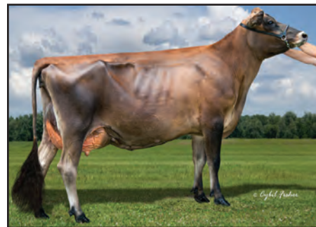
Klus-Grove Shoutout Capresha, VG-87% 1-11 287 13,180 5.0% 655 3.7% 492 Sold in 2019