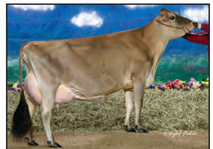
COWBELL COUNCILLOR PRALINE Sixth Dam of Lot 13