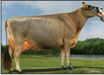
BUDJON-VAIL JADE GIANNA-ET Grandam of Lot 18