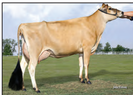
Unique HP Action Sasha-ET, E-90% 5-3 305 19,610 4.4% 870 3.8% 737 Sold in 2012