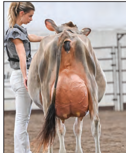
DASHES DELUSION Full Sister to Lot C (pictured August 2023)

NEXT FIVE DAMS ARE VERY GOOD OR EXCELLENT IN CANADA