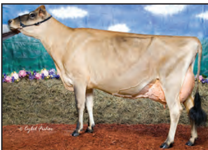
LLOLYN JUDE GRIFFEN-ET Great-Grandam of Lot 18