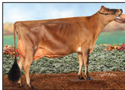
DISCOVERYS TEQUILA ESCAPE-ET Grandam of Lot 19