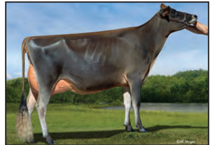
WOODMOHR V DIAMOND-ET Sister to the Grandam of Lot 4