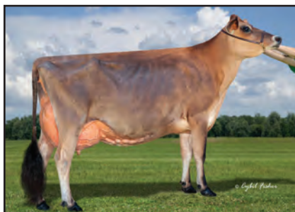
WOODMOHR GENTY GINGER-ET Sister to the Grandam of Lot 16