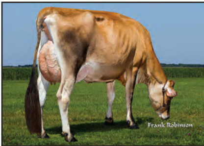
AHLEM TITAN VANITY 1245 From the Same Family as Lot 2

CDCB GPTA S 09/05/2023 ORECS 73%R 99%ILE 737M 0.12% 62F 0.06% 41P 727CM$ 711NM$ 615FM$ 5.6PL 0.8LIV 0.3DPR 0.6CCR 1.3HCR 2.74SCS 653GM$ 0.0MFV 0.3DAB -0.1KET 0.8MAS 0.2MET -0.1RPL 2.64HTI AJCA 09/05/2023 GPTAT 77%R 0.6 GJUI 3.5 GJPI 71%R 158 ST SR DF RA RW RL FA FU 0.4 -0.2 1.3 L0.1 -0.2 S0.3 S0.4 0.3 RH RUW UC UD TP TL RTR RTS 0.7 0.6 0.4 D0.4 C1.0 S0.3 C1.0 B0.3