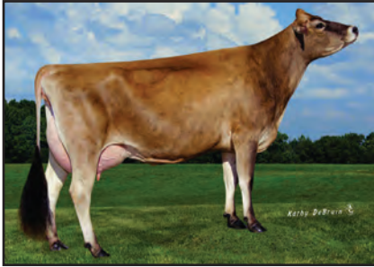
AHLEM VIABULL VANITY 5057-ET Great-Grandam of Lot 2