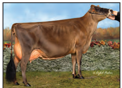
MISS VIOLET Grandam of Lots 8A and 8B