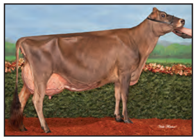
MARLAU COMERICA FABIENNE Grandam of Lot E

BROOKBORA STANDARD LADY 255 JEAUS00000600997 GT BBR 100 JH1C F TATTOO N2H/4569 CDCB GPTA S 09/05/2023 ORECS 76%R 18%ILE -976M 0.18% -11F 0.11% -13P -93CM$ -105NM$ -184FM$ -1.0PL -0.9LIV 2.1DPR 2.0CCR -0.2HCR 2.88SCS -31GM$ -0.2MFV -0.4DAB -0.1KET 1.1MAS 0.0MET 0.0RPL -2.03HTI AJCA 09/05/2023 GPTAT 79%R -0.3 GJUI -4.8 GJPI 74%R -12