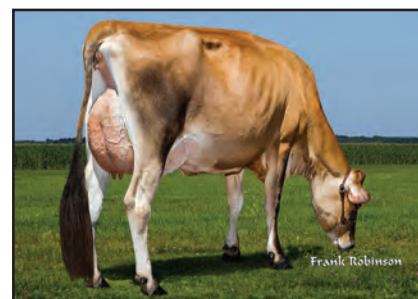
AHLEM TITAN VANITY 1245 From the Same Family as Lot 11