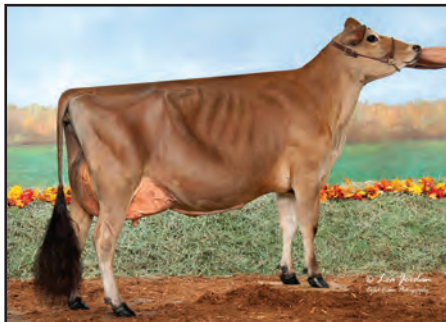
Intense Gentry Priceless, VG-86% 2-1 305 12,570 4.4% 557 3.5% 443 Sold in 2017