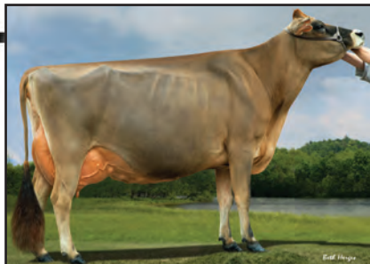
BUDJON-VAIL JADE GIANNA-ET Great-Grandam of Lot 16