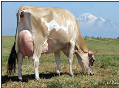
PLEASANT NOOK F PRIZE CIRCUS Fifth Dam of Lot 14