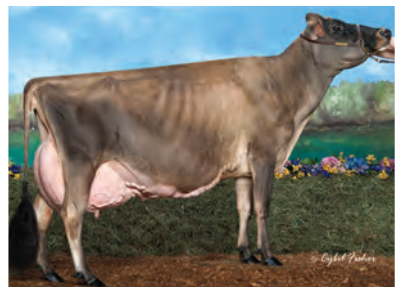
HURONIA CENTURION VERONICA 20J Fourth Dam of Lots 8A and 8B