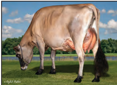
GONE HAYWIRE COLTONS CONFETTI Dam of Lot D

SISTER(S): OURWAY RESPONSE PARADISE 4TH WINTER YEARLING, 2017 WORLD DAIRY EXPO 4TH WINTER CALF, 2016 ALL AMERICAN JERSEY SHOW ALL WISCONSIN WINTER CALF, 2016 OURWAY RESPONSE PARIS 92% 4-05 305 2 35132 5.9 2090 3.7 1306 DHIA 4518C