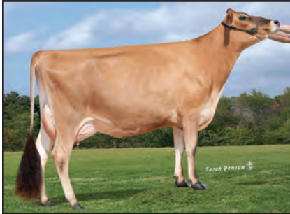
FAMILY HILL REN CARLY-ET Fourth Dam of Lot 14