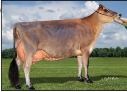
WOODMOHR GENTLE GINGER-ET Dam of Lot 18