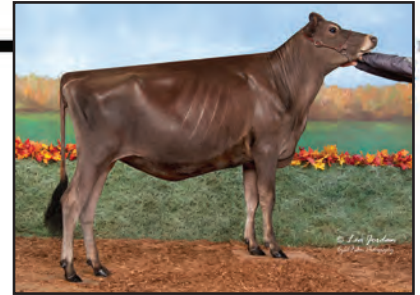
MEAD-MANOR FIZZ POPSICLE Dam of Lot 13

NEXT DAM: MEAD-MANOR PREMIER PENNY 86% 1ST JR 3-YEAR-OLD, 2019 MICHIGAN JERSEY STATE SHOW RES INTERMEDIATE CHAMPION, 2019 MI JERSEY STATE SHOW RES GRAND CHAMPION, 2019 MICHIGAN JERSEY STATE SHOW SIRE: HAWARDEN IMPULS PREMIER GJPI 13 13%ILE 4TH DAM: MEAD-MANOR TEQUILA PEACHES 87% 2-00 305 2 14233 4.8 686 3.6 515 DHIA 1781C 5TH DAM: ARETHUSA VERIFY PEANUT 94% 5-11 305 2 25441 4.6 1176 3.5 891 DHIR 3080C 6TH DAM: COWBELL COUNCILLOR PRALINE 94% 5-08 305 2 23320 5.7 1332 3.4 798 97DCR 2757C 2ND AGED COW, 2008 NEW YORK SPRING CAROUSEL 2ND 5-YEAR-OLD, 2007 NEW YORK SPRING CAROUSEL 3RD AGED COW, 2010 WI SPRING SPECTACULAR JR SHOW & CENTRAL NATIONAL JR SHOW 3RD AGED COW, 2010 CENTRAL NATIONAL JUNIOR SHOW 10TH AGED COW, 2009 CENTRAL NATIONAL 7TH DAM: COWBELL BARBER PECAN 93% 9-06 305 2 21840 4.9 1063 3.4 752 98DCR 2598C NEXT TWO DAMS ARE EXCELLENT