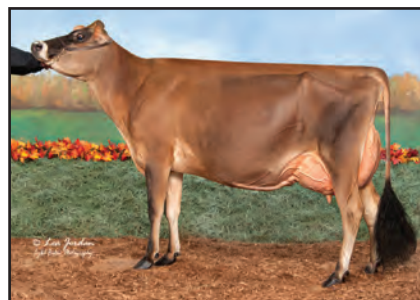
DISCOVERYS JOEY EVA-ET Sister to the Grandam of Lot 19