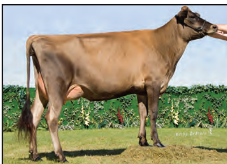
Senn-Sational Iatola Petrina, VG 89 (CAN) 3-9 305 18,664 4.3% 837 3.8% 751 Sold in 2008