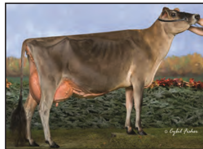
ARETHUSA VERONICAS DASHER-ET Great-Grandam of Lot C