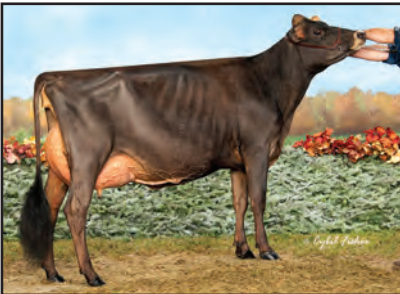
MI WIL VITALITY SECRET Sister to the Grandam of Lot 1

SISTER(S): MI WIL GEM PRINCESSBELLASPARKLES-ET 87% 3-01 305 2 13160 6.2 810 4.3 564 97DCR 1954C