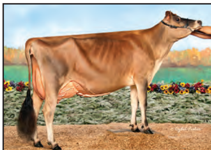
WOODMOHR GENTY GIN-ET Sister to the Grandam of Lot 16