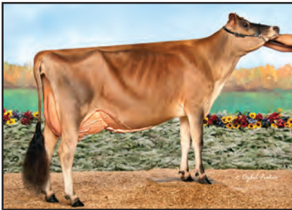
WOODMOHR GENTY GIN-ET Sister to the Dam of Lot 18