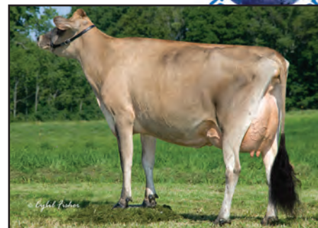
Kimbles Flora, E-91% 4-1 305 21,070 4.5% 956 3.1% 647 Sold in 2008