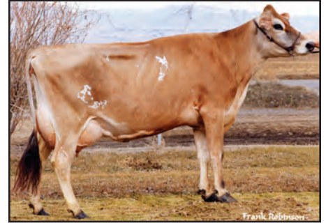
Avon Road Select Libby, E-91% 4-1 305 3x 17,870 4.8% 851 3.6% 649 Sold in 1999