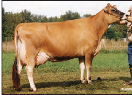
Willavals Lucky Lady, E-93% 3-6 305 19,780 3.8% 745 3.6% 705 Sold in 1997