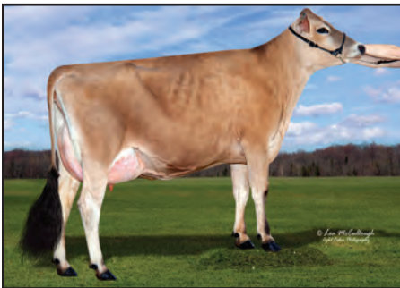
Ahlem Topeka Maid 40527-ET, E-91% 3-2 305 17,680 5.2% 921 3.7% 650 Sold in 2013