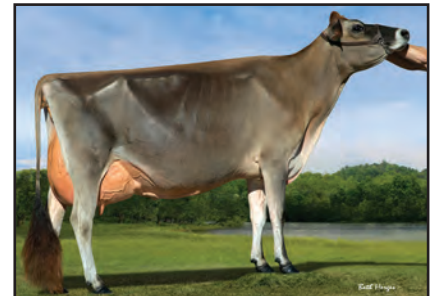
WOODMOHR MARLOS ULTRA DEVINE-ET Sister to the Grandam of Lot 4