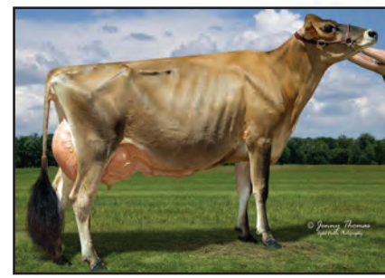
CHILLI PT CHEYENNE-ET Fourth Dam of Lot 9B

AVONLEA IATOLA VICTORIA 94% JECAN000010989478 GT8K BBR 100 JH1F F TATTOO /428X DHIA HERD # 33-87-0722 CONTROL # 16 2-00 305 2 12880 4.9 633 3.6 464 100DCR 1604C 3-01 305 2 17409 4.6 808 3.6 629 102DCR 2165C 305 2X ME AVG 3L 15062M 739F 558P 1926C PPA -1621M -54F -44P / YD -2361M -81F -60P CDCB GPTA S 09/05/2023 5RECS 90%R 12%ILE -1268M 0.10% -42F 0.07% -32P -238CM$ -240NM$ -265FM$ 1.1PL 1.3LIV 0.2DPR 0.2CCR -0.7HCR 3.08SCS -265GM$ -0.2MFV -0.4DAB -0.5KET 1.0MAS 0.2MET 0.3RPL -2.44HTI AJCA 09/05/2023 GPTAT 87%R 1.3 GJUI 13.3 GJPI 86%R -60