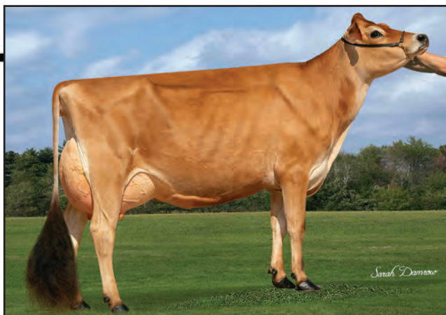
PINE-TREE VETO-P-ET, VG-86% Dam of Lot 11