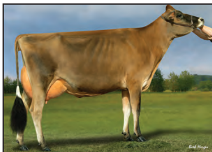
WOODMOHR GENTLE GINNY-ET Sister to the Grandam of Lot 16