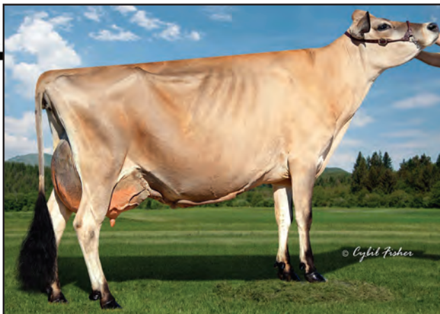
FAMILY HILL JADE FIREY-ET, E-95% Great-Grandam of Lot 10