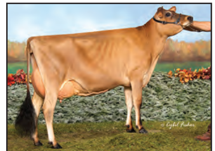
MEAD-MANOR TEQUILA PEACHES Fourth Dam of Lot 13