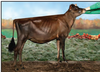
REDHOT VICTORY PARADE Same Family as Lot D All-Wisconsin Spring Calf, 2020 Sold for $14,000 in Music City Celebration Sale IV