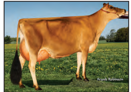
MEAD-MANOR PREMIER PENNY Great-Grandam of Lot 13