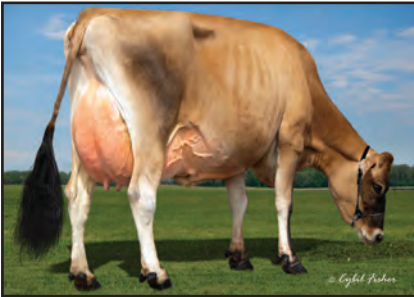
DUTCH HOLLOW TOPEKA CHARLIZE Fourth Dam of Lot 7

6TH DAM: DUTCH HOLLOW GM CHERISH-P 90% 4-09 305 3 28810 4.2 1207 3.6 1023 102DCR 3350C