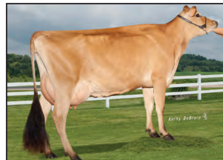
Spring Creek T-Bone Netty-ET, E-92% 4-1 305 3x 33,460 4.2% 1,412 3.5% 1,161 Sold in 2010