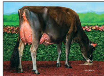
CROSSBROOK HG DIXIE-ET Grandam of Lot C