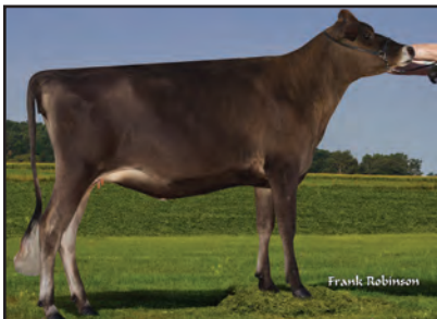
OURWAY RESPONSE PARADISE Sister to the Dam of Lot D