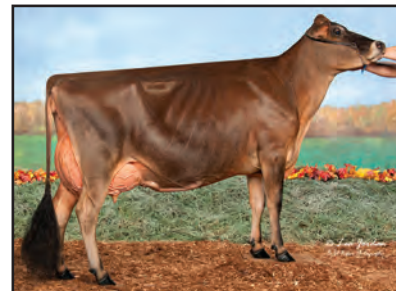
RATLIFF RICOCHET VEGAS Dam of Lots 8A and 8B

ARETHUSA PRIMETIME VOILA-ET 92% 5-09 305 2 20350 6.5 1313 4.1 832 DHIR 2882C SIRE: GIL-BAR SPARKLER PRIMETIME JPI -176 1%ILE