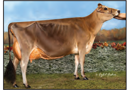
MARYNOLE EXCITE ROSEY Grandam of Lot 15