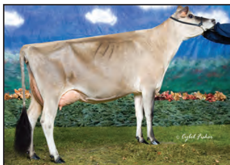
Renaissance Key Goldie, E-93% 2nd Five-Year-Old, 2008 NC State Fair Sold in 2008