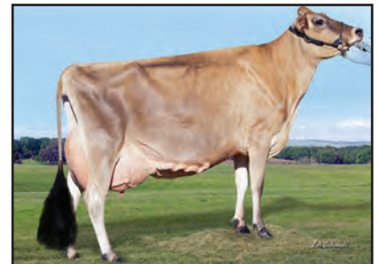
ARETHUSA VERIFY PEANUT Fifth Dam of Lot 13