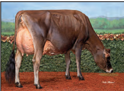
SCHULTE BROS TEQUILA SHOT-ET Same Family as Lot 1

JARS OF CLAY BARNABAS USA 067342492 GT80K BBR 100 JH1F F A2A2 7JE1294 CDCB GPTA S 08/01/2023 7916DAUS 1368HRDS 6%RIP 99%R 279M -0.02% 10F 9%ILE 99%R -0.01% 7P -18CM$ -16NM$ -8FM$ -121GM$ 0.2PL -3.0LIV -3.8DPR -4.1CCR 1.2HCR 3.05SCS 0.0MFV -0.1DAB 0.7KET 0.3MAS 0.7MET 0.1RPL 1.25HTI AJCA 08/01/2023 3684DAUS GPTAT 99%R 1.7 GJUI 11.5 GJPI 99%R -12