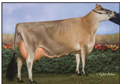
FAMILY HILL AVERY FIRE Fourth Dam of Lot 10