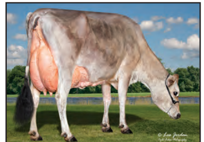
SOUTH MOUNTAIN CASINO HIGHROLLER-ET Sister to the Dam of Lot 15