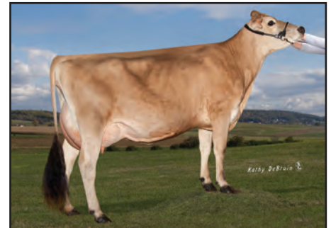
JX TLJ Visionary Bree {4}-ET, E-91% 3-8 305 3x 25,830 4.3% 1,098 3.3% 852 Sold in 2014