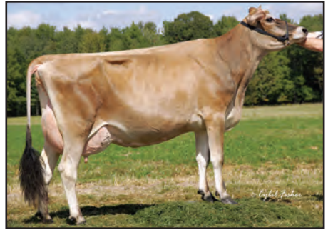
Flambeau Manor F Candance, E-93% 4-4 301 20,700 3.9% 814 3.1% 633 Sold in 2005