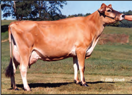
Twin Haven Berretta Linda, E-95% 6-1 305 24,540 4.8% 1,179 3.8% 928 Sold in 1997