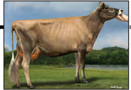
WOODMOHR PURE IMPRESSION Sister to the Grandam of Lot 4

SISTER(S): GB JADE DIVA OF WOODMOHR 95% 7-07 305 2 23100 6.2 1426 3.6 821 97DCR 2838C WOODMOHR JADE LADY DIVA-ET 94% 12-07 305 2 23990 5.6 1344 3.4 814 98DCR 2812C WOODMOHR JADE LA DIVA-ET 94% 10-11 305 2 21610 4.2 910 3.5 763 98DCR 2513C WOODMOHR GODIVAS DELIGHT 94% 5-10 305 2 22810 5.8 1320 3.7 853 96DCR 2951C WOODMOHR PRINCESS DIVA-ET 93% 4-06 305 2 22552 5.8 1313 3.7 832 96DCR 2878C WOODMOHR QUEEN DIVA-ET 92% 5-03 305 3 21320 5.6 1200 3.6 761 104DCR 2631C WOODMOHR PURE DELIGHT-ET 95% 6-10 305 2 23470 5.3 1235 3.8 885 97DCR 3062C WOODMOHR MARLOS DIVINE-ET 94% 10-06 305 2 23580 5.1 1200 3.5 821 98DCR 2837C WOODMOHR MARLOS ULTRA DIVINE-ET 95% 5-11 305 2 25830 5.6 1440 3.7 949 98DCR 3282C WOODMOHR JADE DANCING DIVA-ET 94% 6-08 305 2 22500 5.5 1227 3.7 828 97DCR 2864C WOODMOHR PRIME DESTINY-ET 94% 7-06 305 2 24010 4.7 1119 3.6 869 98DCR 2994C WOODMOHR DEAR FEVER-ET 95% 5-11 305 2 25830 5.4 1385 3.3 856 98DCR 2956C WOODMOHR V DIAMOND-ET 96% 8-07 305 2 25280 6.3 1595 3.7 933 96DCR 3227C WOODMOHR PREE DESTINY-ET 95% 7-10 305 2 23480 7.2 1684 4.2 989 96DCR 3427C WOODMOHR DELTA-BELL-ET 91% 5-08 305 2 20000 6.0 1199 3.7 734 98DCR 2538C