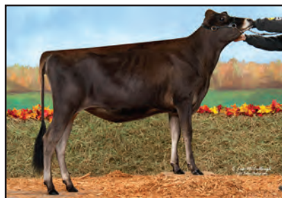
ROYALTY RIDGE FIREYS FERRARI Grandam of Lot 10