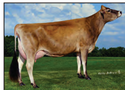
AHLEM VIABULL VANITY 5057-ET Grandam of Lot 11

5TH DAM: AHLEM ACTION VANITY 16031 85% 3-10 305 3 21520 4.6 1000 3.7 790 97DCR 2695C