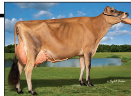
DISCOVERYS VELOCITY EMBER-ET Dam of Lot 19

NEXT DAM: BRIDON VINDICATION EVELYN-ET 93% 4-10 348 2 17982 4.6 834 3.4 608 DHIA 2101C 2ND JR 3-YEAR-OLD, 2011 MINNESOTA STATE FAIR SIRE: VINDICATION GJPI -75 2%ILE