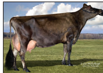
THOMSEN 4226 CADILLAC JAY {5} Fourth Dam of Lot 17