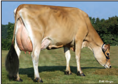
DUTCH HOLLOW VALENTINO CHERYL Fifth Dam of Lot 7