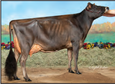
MI WIL TEQUILA BEE Grandam of Lot 1