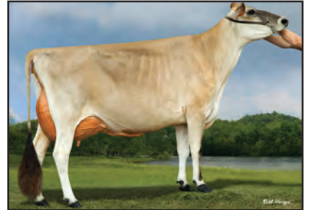
WOODMOHR DEAR FEVER-ET Sister to the Grandam of Lot 4