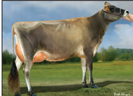
Woodmohr Jamaica Mystery, E-90% 1-11 301 16,160 5.1% 832 3.4% 543 Sold in 2014