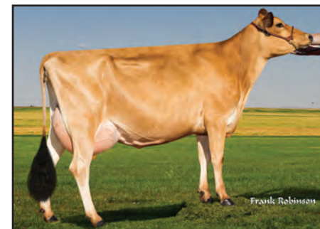
JX Ahlem Badger Carol 45700 {4}-ET, VG-84% 4-6 305 2x 19,790 5.1% 1,003 4.0% 790 Sold in 2016