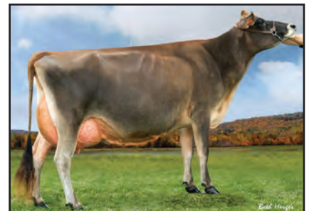
GB JADE DIVA OF WOODMOHR Sister to the Grandam of Lot 4