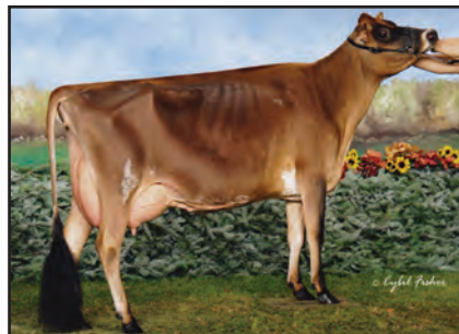
BRIDON VINDICATION EVELYN-ET Great-Grandam of Lot 19