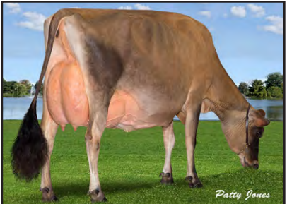
STONEY POINT COMERICA KATHIE Grandam of Lot 9