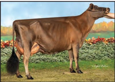
BIG GUNS ANDREAS VICTORY-ET Sister to the Grandam of Lot 13

BORN 06/02/2022 TATTOO S7/ P0 FEMALE EFI 4.4%