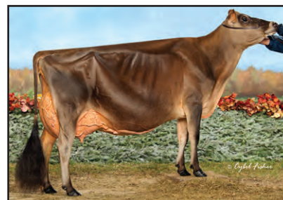
ELLIOTTS BLACKSTONE CHARLOTTE-ET Sister to the Grandam of Lots 17 & 18