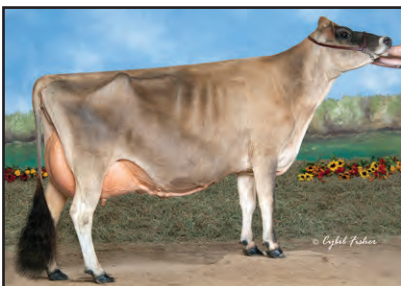
GB JADE DIVA OF WOODMOHR Sister to the Dam of Lot 11