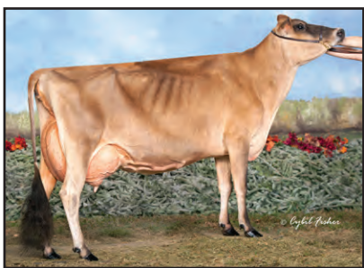
ELLIOTTS VIVID DELUXE Great-Grandam of Lots 4A-D