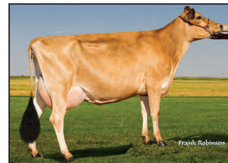
JX Ahlem Badger Carol 45700 {4}-ET, VG-84% 4-6 305 2x 19,790 5.1% 1,003 4.0% 790 Sold in 2016