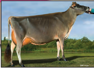
WOODMOHR MARLOS LA T DA Dam of Lot 19