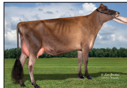
ARTHURACRES VIP MARTINA Dam of Lots 5 & 6

ARTHURACRES TEQUILA MOXIE-ET 85% 2-04 305 2 10020 5.2 518 3.4 338 90DCR 1167C ARTHURACRES TEQUILA MOTTLE-ET 87% ARTHURACRES TEQUILA MIRACLE-ET 93% 6-05 305 2 25000 4.8 1208 3.1 786 98DCR 2712C ARTHURACRES TEQUILA MARGO-ET 88% 1-11 305 2 14750 5.5 817 3.6 529 95DCR 1829C 2ND JR 2-YEAR-OLD, 2019 SOUTHERN NATIONAL ARTHURACRES TEQUILA MARIA-ET 94% 4-01 305 2 18600 4.8 902 3.4 637 97DCR 2201C