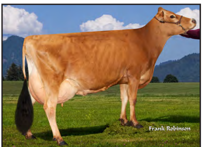
JX MM MACKENZIE MANHATTAN 1511 {3} Great-Grandam of Lot 3

RIVER VALLEY LEMONHEAD CARNIVAL-ET USA 067393764 GT13K BBR 100 JH1F JNS-TF CDCB GPTA S 09/03/2024 ORECS 93%R 90%ILE 292M 0.06% 26F 0.01% 12P 411CM$ 406NM$ 386FM$ 5.3PL 2.5LIV 1.5DPR 3.2CCR 2.1HCR 2.84SCS 360GM$ 0.2MFV 0.7DAB -0.6KET -0.4MAS 0.6MET -0.5RPL AJCA 09/03/2024 GPTAT 92%R 1.2 GJUI 21.2 GJPI 91%R 125