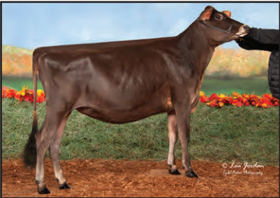
KASH-IN JOEL KNOCKIN BOOTS-ET Dam of Lot 9 (2022)