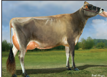
Woodmohr Jamaica Mystery, E-90% 1-11 301 16,160 5.1% 832 3.4% 543 Sold in 2014