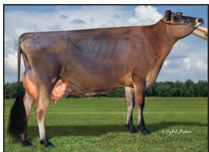
ARTHURACRES TEQUILA MARIA-ET Sister to the Grandam of Lots 5 & 6