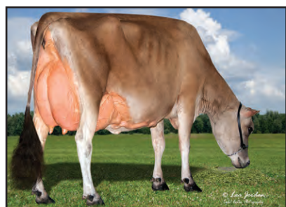
ARTHURACRES TEQUILA MARTHA-ET Grandam of Lots 5 & 6