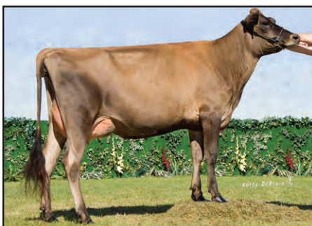
Senn-Sational Iatola Petrina, VG 89 (CAN) 3-9 305 18,664 4.3% 837 3.8% 751 Sold in 2008