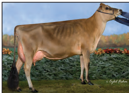
Avonlea Salty Kisses-ET, E-93% 2-9 297 15,551 5.4% 833 3.9% 612 Sold in 2011