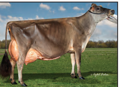
ARETHUSA HG VICTORIA-ET Sister to the Grandam of Lot 7