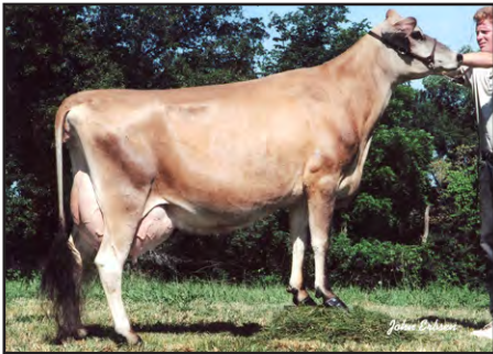
Legion Denny Diane, E-91% 7-7 305 3x 23,100 4.7% 1085 3.3% 765 Sold in 2004