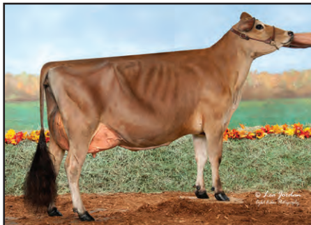
Intense Gentry Priceless, VG-86% 2-1 305 12,570 4.4% 557 3.5% 443 Sold in 2017