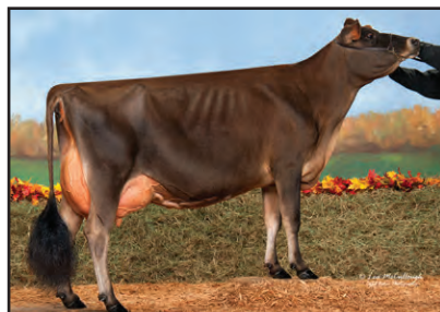
ELLIOTTS FAXON COMICAL-ET Sister to the Grandam of Lots 17 & 18