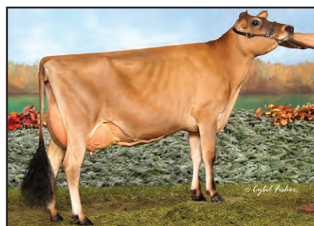
Mead-Manor Tequila Peaches, VG-87% Sister to the dam of "Pryia" and Dam of "Penny" Sold in 2016