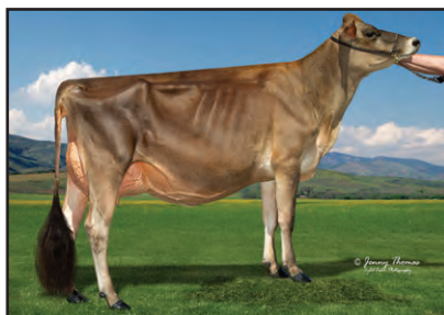
SOUTH MOUNTAIN FIZZ CHABLIS Sister to the Dam of Lots 17 & 18