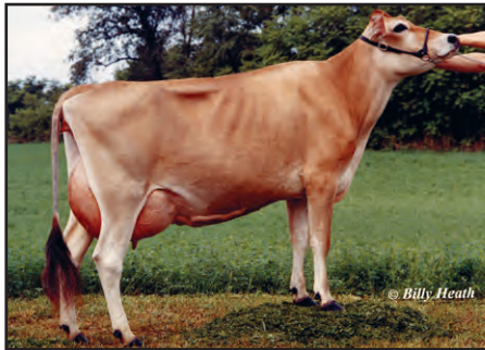
Reich-Dale Future Sierra, E-90% 2-9 305 19,410 5.2% 1,008 3.7% 716 Sold in 2005