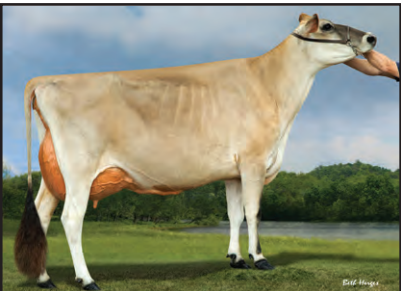
WOODMOHR DEAR FEVER-ET Full Sister to the Dam of Lot 11