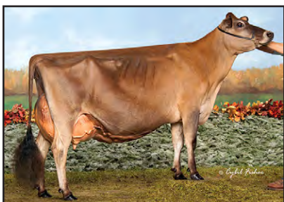
ARETHUSA VERONICAS COMET-ET Great-Grandam of Lots 17 & 18