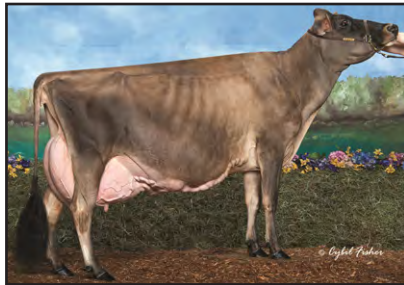
HURONIA CENTURION VERONICA 20J Fourth Dam of Lot 7