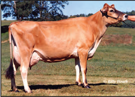
Twin Haven Berretta Linda, E-95% 6-1 305 24,540 4.8% 1,179 3.8% 928 Sold in 1997