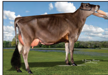
UFASHION IATOLA SASHA-ET Sister to the Grandam of Lot 8

RIVER VALLEY VENUS VIP-ET JE840003126479167 GT99K BBR100 JH1F JNS-TF A1A2 777JE10003 CDCB GPTA S 08/01/2024 1509DAUS 476HRDS 16%RIP 99%R -2077M 0.13% -79F 1%ILE 99%R 0.06% -66P -636CM$ -631NM$ -609FM$ -693GM$ 0.2PL 3.0LIV -0.5DPR -0.1CCR -1.2HCR 3.14SCS 0.0MFV 0.1DAB 0.3KET 1.2MAS 0.0MET 0.6RPL AJCA 08/01/2024 1166DAUS GPTAT 99%R 1.4 GJUI 15.9 GJPI 97%R -150