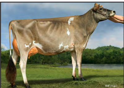
WOODMOHR DELTA-BELL-ET Sister to the Dam of Lot 11

BORN 10/28/2022 TATTOO WMF441/WMF441 PO FEMALE EFI 5.6%