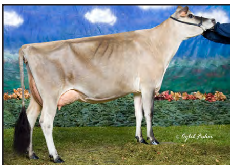
Renaissance Key Goldie, E-93% 2nd Five-Year-Old, 2008 NC State Fair Sold in 2008