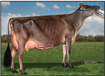
ARETHUSA PREMIER VENTOSA-ET Sister to the Grandam of Lot 7