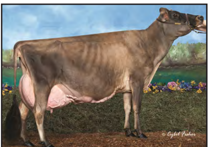
HURONIA CENTURION VERONICA 20J Fifth Dam of Lots 4A-D

A BORN 03/04/2024 TATTOO /W39 PO FEMALE EFI 5.7%