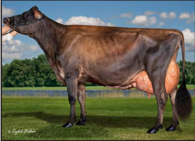
PVF CHROME REEVA-ET Dam of Lots 15A-C

A BORN 07/02/2024 TATT00 /PV02 P1 FEMALE EFI 8.3%