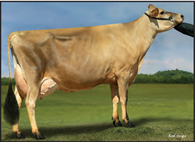
OAKLANE CHISEL DELLA 2130-ET Fourth Dam of Lot 2