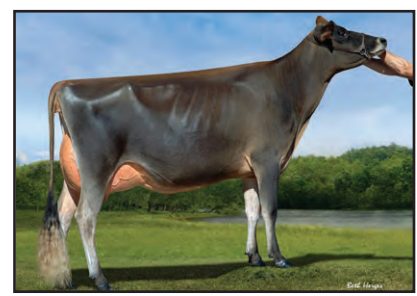
WOODMOHR V DIAMOND-ET Sister to the Grandam of Lot 1