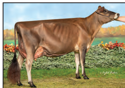
ARETHUSA GENTRY CHEVELLE-ET Sister to the Grandam of Lots 17 & 18