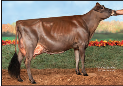
BIG GUNS ANDREAS VEGAS BOMB-ET Sister to the Grandam of Lot 13