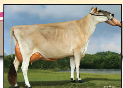
WOODMOHR DEAR FEVER-ET Full Sister to the Grandam of Lot 1

SISTER(S): GB JADE DIVA OF WOODMOHR 95% 7-07 305 2 23100 6.2 1426 3.6 821 97DCR 2838C WOODMOHR JADE LADY DIVA-ET 94% 12-07 305 2 23990 5.6 1344 3.4 814 98DCR 2812C WOODMOHR JADE LA DIVA-ET 94% 10-11 305 2 21610 4.2 910 3.5 763 98DCR 2513C WOODMOHR GODIVAS DELIGHT 94% 5-10 305 2 22810 5.8 1320 3.7 853 96DCR 2951C WOODMOHR PRINCESS DIVA-ET 93% 4-06 305 2 22552 5.8 1313 3.7 832 96DCR 2878C WOODMOHR QUEEN DIVA-ET 92% 5-03 305 3 21320 5.6 1200 3.6 761 104DCR 2631C WOODMOHR PURE DELIGHT-ET 95% 6-10 305 2 23470 5.3 1235 3.8 885 97DCR 3062C WOODMOHR MARLOS DIVINE-ET 94% 10-06 305 2 23580 5.1 1200 3.5 821 98DCR 2837C WOODMOHR MARLOS ULTRA DIVINE-ET 95% 5-11 305 2 25830 5.6 1440 3.7 949 98DCR 3282C WOODMOHR JADE DANCING DIVA-ET 94% 6-08 305 2 22500 5.5 1227 3.7 828 97DCR 2864C WOODMOHR PRIME DESTINY-ET 94% 7-06 305 2 24010 4.7 1119 3.6 869 98DCR 2994C WOODMOHR DEAR FEVER-ET 95% 5-11 305 2 25830 5.4 1385 3.3 856 98DCR 2956C WOODMOHR V DIAMOND-ET 96% 8-07 305 2 25280 6.3 1595 3.7 933 96DCR 3227C WOODMOHR PREE DESTINY-ET 95% 7-10 305 2 23480 7.2 1684 4.2 989 96DCR 3427C WOODMOHR DELTA-BELL-ET 91% 5-08 305 2 20000 6.0 1199 3.7 734 98DCR 2538C