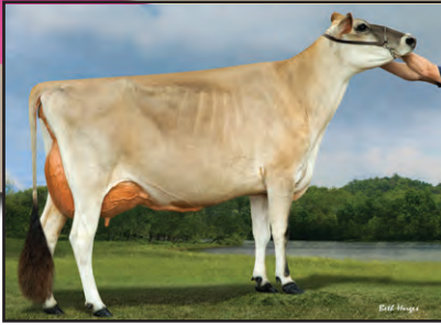
WOODMOHR DEAR FEVER-ET Full Sister to the Dam of Lot 11