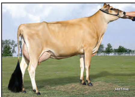
Unique HP Action Sasha-ET, E-90% 5-3 305 19,610 4.4% 870 3.8% 737 Sold in 2012