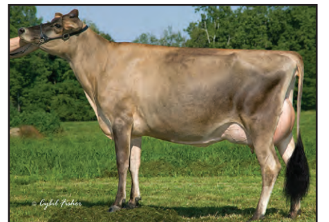
Jurisdiction Jenny, E-90% 2-5 303 18,410 4.8% 890 3.5% 652 Sold in 2008