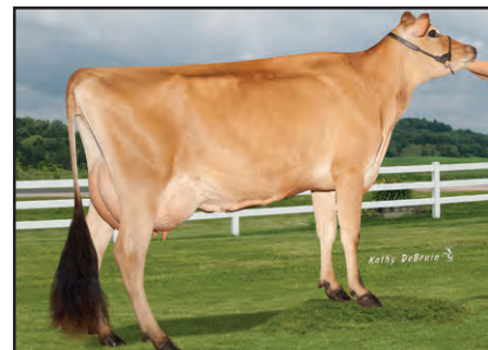
Spring Creek T-Bone Netty-ET, E-92% 4-1 305 3x 33,460 4.2% 1,412 3.5% 1,161 Sold in 2010