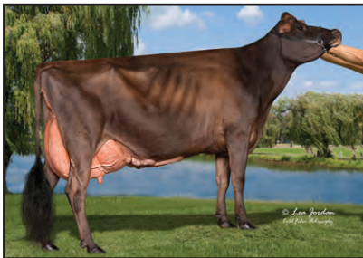
CIRCLEHAWK KYROS RIZZO OF PVF Grandam of Lots 15A-C

BUYER CHOOSES BETWEEN THREE (3) JULY 2024 CALVES SIRE BY VICTORY RHONDAS BIG RED-ET AND OUT OF PVF CHROME REEVA-ET. SALE TERMS: PAYMENT DUE AT TIME OF SALE.