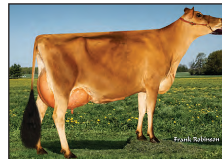
Mead-Manor Premier Penny, VG-86% Daughter of "Peaches" Sold in 2018