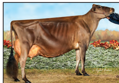
EDGEBROOK TEQUILA MADISON-ET Sister to the Grandam of Lots 5 & 6