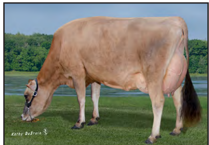
JX MM THRASHER MANHATTAN 13947 {5}-ET Dam of Lot 3

JX CLOVER PATCH AVON ENZO {3} USA 119904055 GT45K BBR100 JH1F JNS-TF A2A2 100JE7400 CDCB GPTA S 08/01/2024 305DAUS 48HRDS 3%RIP 98%R 2383M -0.31% 50F 78%ILE 98%R -0.15% 56P 421CM$ 432NM$ 506FM$ 276GM$ 2.4PL -2.0LIV -4.5DPR -4.6CCR -2.0HCR 3.07SCS -0.1MFV -0.3DAB -0.1KET -3.8MAS -0.6MET -0.3RPL AJCA 08/01/2024 148DAUS GPTAT 97%R 1.5 GJUI 15.4 GJPI 96%R 84