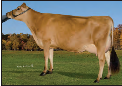
PINE-TREE LISTOWEL DELLA 1598-P-ET Great-Grandam of Lot 2

PINE-TREE 1598 PROMO 2015-P-ET 87% 4-05 305 2 21190 5.6 1184 4.0 852 93DCR 2950C PINE-TREE 1598 PHAROAH 2114-P-ET 84% 4-01 305 2 19220 5.6 1074 3.7 720 93DCR 2491C PINE-TREE 1598 PHAROAH 2125-P-ET 80% 4-00 305 2 18090 5.7 1036 4.2 764 93DCR 2647C PINE-TREE 1598 PHAROAH 2140-P-ET 84% 1-11 305 2 17450 5.8 1005 3.8 669 93DCR 2315C PINE-TREE DELLA KAY-PP-ET 90% 2-10 305 2 17400 3.9 670 3.5 612 95DCR 1921C PINE-TREE 1598 VERN 2371-P-ET 83% 1-11 305 2 18280 4.6 846 3.5 635 91DCR 2194C PINE-TREE 1598 VERN 2377-PP-ET 83% 3-01 293 2 17930 5.9 1066 4.1 730 88DCR 2528C PINE-TREE 1598 KIAWA 2427-P-ET 88% 2-00 305 2 19820 4.4 881 3.5 701 91DCR 2380C PINE-TREE 1598 OSCAR 2433-P-ET 82% 2-00 305 2 18770 5.6 1058 3.6 681 91DCR 2355C PINE-TREE 1598 THRASHER 2507-ET 84% 2-01 305 3 18570 4.1 763 3.9 733 86DCR 2242C RANKS ON THE TOP 1-1/2% LIST FOR JPI PINE-TREE 1598 THRASHER 2522-P-ET 85% 1-10 305 2 16650 5.8 963 3.7 623 89DCR 2155C RANKS ON THE TOP 1-1/2% LIST FOR JPI