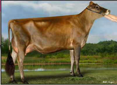
BIG GUNS ANDREAS VIVA-ET Dam of Lot 13