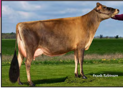
ARETHUSA PREMIER VAHLING-ET Grandam of Lot 7