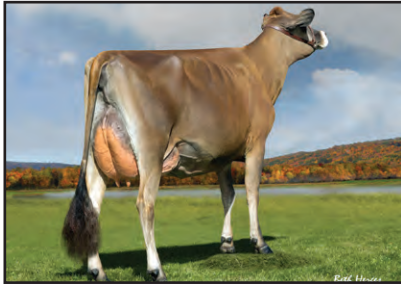
WOODMOHR LA DIVA LA JAMAH Sister to the Dam of Lot 17