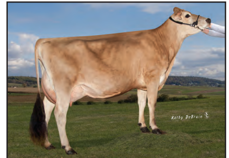
JX TLJ Visionary Bree {4}-ET, E-91% 3-8 305 3x 25,830 4.3% 1,098 3.3% 852 Sold in 2014