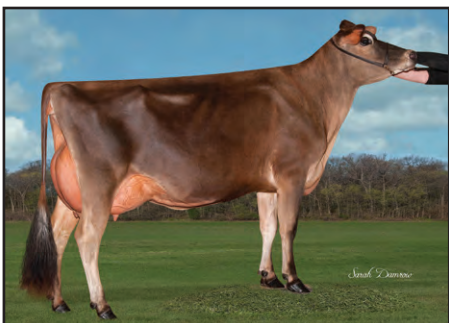
Mead-Manor Tequila Pryia, E-91% 3-0 305 20,390 4.9% 1,000 3.7% 751 "Peaches" is sister to her dam | Sold in 2015