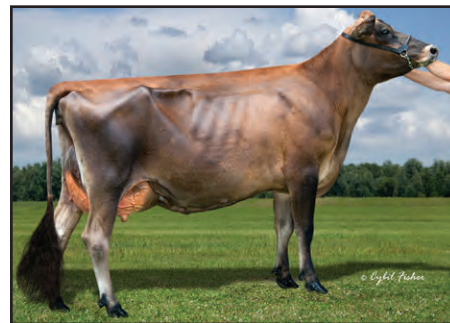
Klus-Grove Shoutout Capresha, VG-87% 1-11 287 13,180 5.0% 655 3.7% 492 Sold in 2019