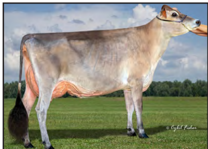
KASH-IN JOEL KITTY KAT-ET Sister to Dam of Lot 9

BORN 05/01/2023 PO BBR 100 FEMALE EFI 7.1% AMERICAN ID 37/37 JH1F JNS-TF