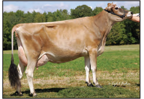
Flambeau Manor F Candance, E-93% 4-4 301 20,700 3.9% 814 3.1% 633 Sold in 2005