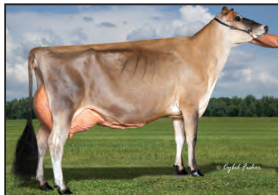
EK-RR TEQUILA VARIETY-ET Grandam of Lots 4A-D

MELONKALI VICTORIOUS VIOLA-ET USA 175154584 MELONKALI VICTORIOUS VAL-ET USA 175154557 MELONKALI VICTORIOUS VICKY-ET USA 175154566 MELONKALI VICTORIOUS VIVIAN-ET USA 175154575