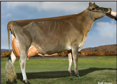
WOODMOHR PURE DELIGHT-ET Sister to the Dam of Lot 11