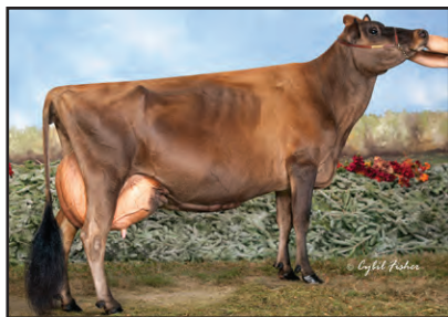
ELLIOTTS GOLDEN VISTA-ET Fourth Dam of Lots 4A-D