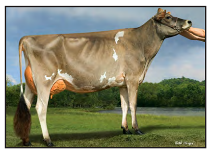
WOODMOHR DELTA-BELL-ET Sister to the Grandam of Lot 1