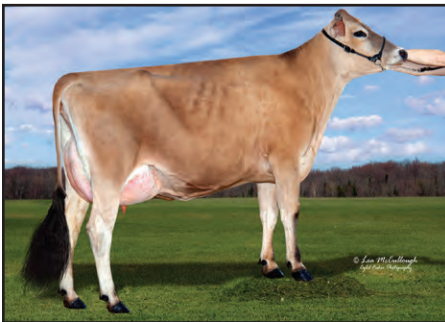
Ahlem Topeka Maid 40527-ET, E-91% 3-2 305 17,680 5.2% 921 3.7% 650 Sold in 2013