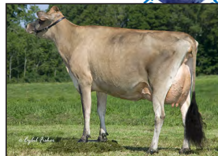
Kimbles Flora, E-91% 4-1 305 21,070 4.5% 956 3.1% 647 Sold in 2008