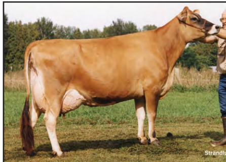
Willavals Lucky Lady, E-93% 3-6 305 19,780 3.8% 745 3.6% 705 Sold in 1997