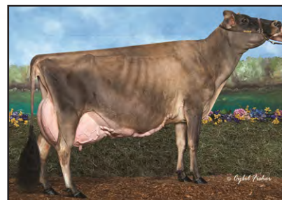
HURONIA CENTURION VERONICA 20J Fourth Dam of Lots 17 & 18

SISTER(S): ELLIOTTS GOLD CONFETTI 92% 3-00 305 2 16780 5.7 956 3.9 652 96DCR 2257C ELLIOTTS CORONA ACTION-ET 94% 9-05 214 2 16230 4.5 729 3.3 534 84DCR 1844C ELLIOTTS EXCITING CABERNET-ET 91% 6-00 305 2 20560 4.5 923 3.4 700 96DCR 2418C ELLIOTTS EXCITING CHAMPAGNE-ET 85% 4-11 305 2 21250 5.4 1144 3.8 817 98DCR 2827C ELLIOTTS BLACKSTONE CHARLOTTE-ET 94% 5-02 305 2 23600 6.2 1454 3.6 844 95DCR 2918C ELLIOTTS FAXON COMICAL-ET 91% 4-01 305 2 17880 4.8 855 3.6 644 98DCR 2227C ARETHUSA PREMIER CHAMPAGNE-ET 94% 6-00 305 2 22340 5.4 1206 3.7 823 96DCR 2846C ARETHUSA SHOWDOWN CRYSTAL-ET 93% 4-09 305 2 21000 5.0 1057 3.9 819 98DCR 2829C ARETHUSA COLTON CADBURY-ETS 93% 4-04 305 2 15920 5.6 889 3.6 574 102DCR 1985C ARETHUSA JOEL CARDI-ET 94% 4-00 305 2 15340 5.2 792 3.8 577 98DCR 1996C ARETHUSA GENTRY CHAVONNE-ET 93% 3-04 264 2 15540 6.0 926 3.7 568 97DCR 1964C ARETHUSA GENTRY CHEVELLE-ET 93% 3-04 305 3 19160 5.3 1016 3.7 718 89DCR 2484C ARETHUSA JOEL CREME FRAICHE-ET 91% 3-02 305 2 18940 5.5 1041 3.9 743 92DCR 2572C