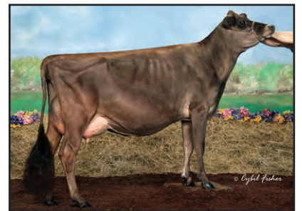
ARETHUSA SOCRATES VALENE-ET Full Sister to the Great-Grandam of Lot 12