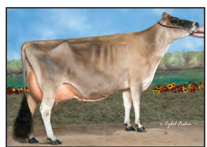
GB JADE DIVA OF WOODMOHR Sister to the Grandam of Lot 1