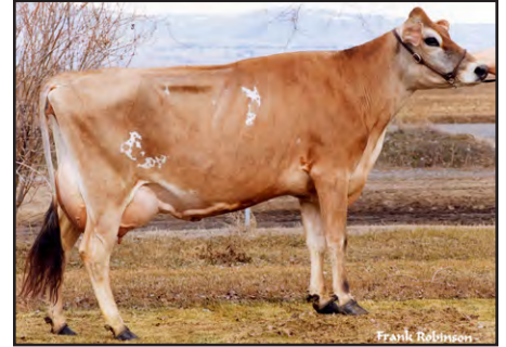
Avon Road Select Libby, E-91% 4-1 305 3x 17,870 4.8% 851 3.6% 649 Sold in 1999