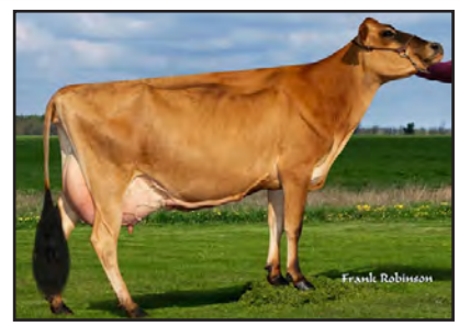
JX PROGENESIS PELE CLASSY {4}-ET Grandam of Lot 16

CAL-MART MEDALIST PILGRIM USA118113935 GT50K BBR 100 JH1F JNS-TF A1A2 29JE3860 CDCB GPTA S 08/01/2024 4201DAUS 497HRDS 5%RIP 99%R 817M -0.14% 11F 60%ILE 99%R -0.04% 23P 339CM$ 340NM$ 348FM$ 321GM$ 4.3PL 3.9LIV 2.3DPR 3.2CCR 2.6HCR 3.02SCS 0.2MFV 1.0DAB 0.4KET -2.7MAS 0.6MET 0.1RPL AJCA 08/01/2024 1965DAUS GPTAT 99%R 0.4 GJUI 8.7 GJPI 99%R 87