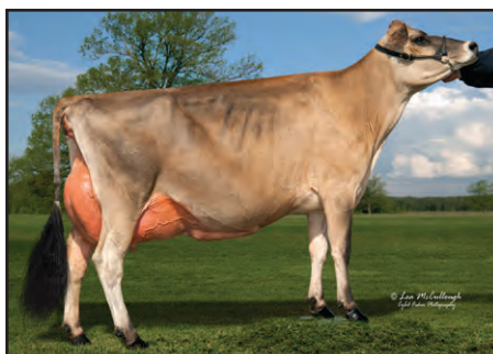
Edgebrook Shyster Chelsea 43, VG-88% Sold in 2014