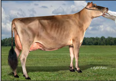
KASH-IN JOEL KNOCKIN BOOTS-ET Dam of Lot 9 (2024)