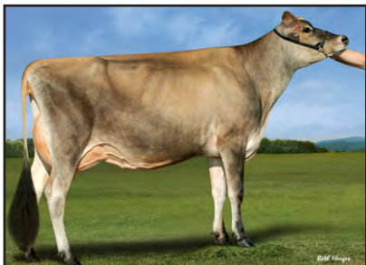
SOUTH MOUNTAIN COLTON COUNTESS Sister to the Dam of Lots 17 & 18