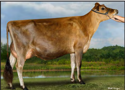
BIG GUNS VARSITY SWAG-ET Sister to the Dam of Lot 13