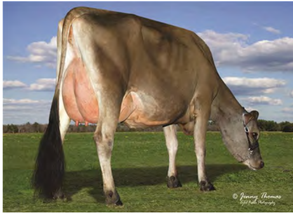
HER-MAN TEXAS BELLE, E-90% SISTER TO LOT 41