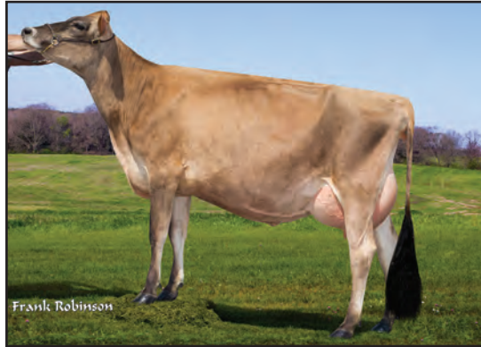
BERRYS BARNABAS SAPPHIRE-ADALYNN, VG-87% DAM OF LOT 20