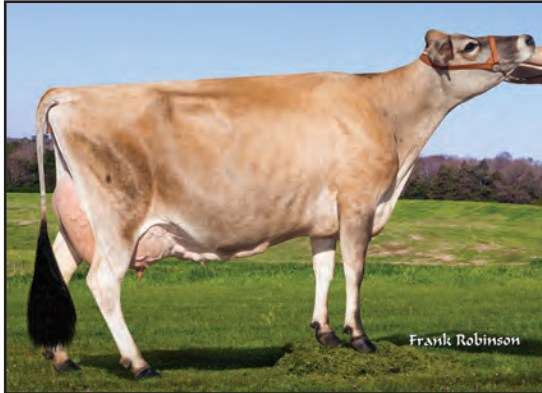
WILL DO HEADLINE HORIZON-ET, E-93% GRANDAM OF LOT 1