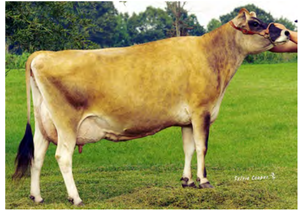
MOLLY BROOK FASCINATOR HOPE, E-90% SIXTH DAM OF LOT 22