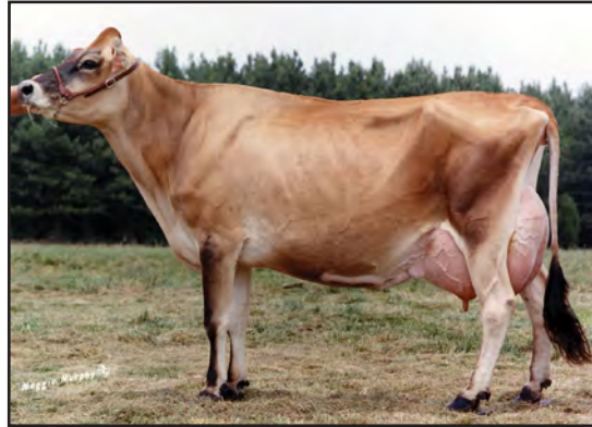
DEERVIEW ALF GALAXY-ET, E-94% GREAT-GRANDAM OF LOT 61