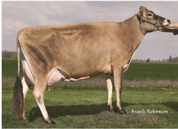
WILL DO IMPULS KISS, E-90% GREAT-GRANDAM OF LOT 2