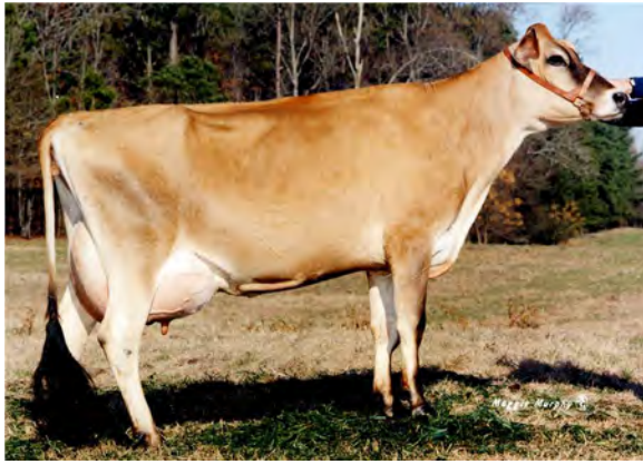
WILL DO BERRETTA HYDE-ET, E-91% FIFTH DAM OF LOT 7