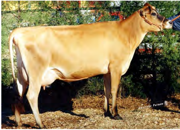
WILL DO DUNCAN HOUDINI, E-92% FIFTH DAM OF LOT 11