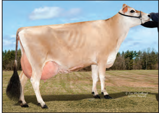
HER-MAN B GRAND BLINKY, E-91% GRANDAM OF LOT 41