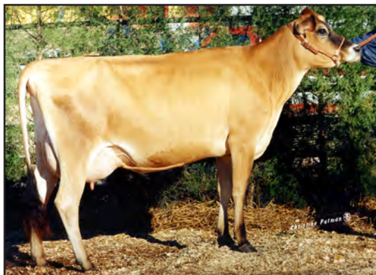
WILL DO DUNCAN HOUDINI, E-92% FIFTH DAM OF LOT 14