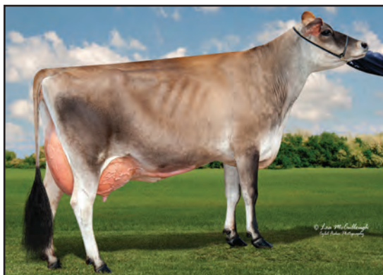
SUNSET CANYON HG ANTHEM-ET, E-90% GRANDAM OF LOT 32