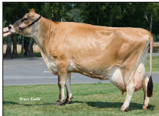
BERRYS PITINO MARVELOUS, E-91% SIXTH DAM OF LOT 17