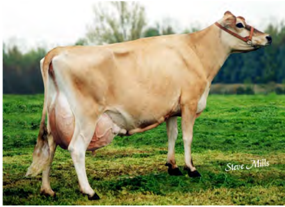
WILL DO ALF HYDRO, E-91% FIFTH DAM OF LOT 4