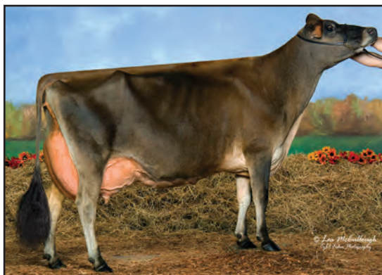
RATLIFF PRICE ALICIA, E-95% GREAT-GRANDAM OF LOT 36