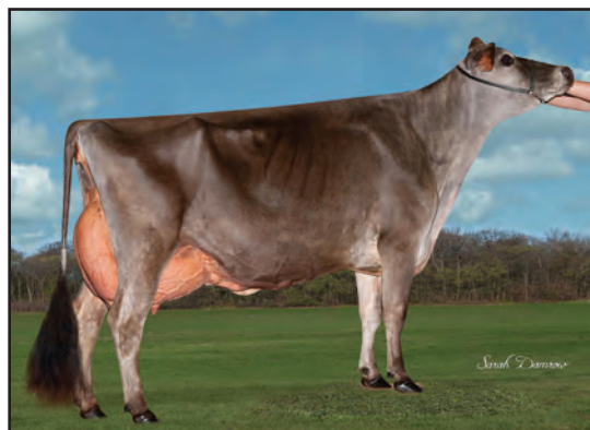
RATLIFF IMPRESSION ANNABELLA-ET, E-93% SISTER TO THE GRANDAM OF LOT 36