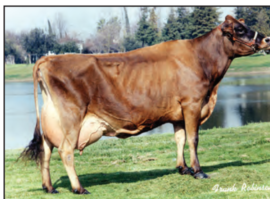
GOODNOW MIDNIGHT BLUE-ET, E-93% SIXTH DAM OF LOT 32