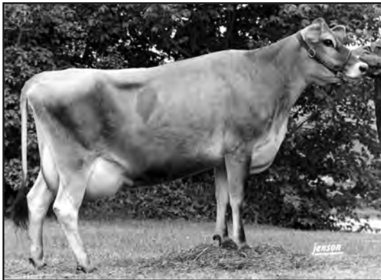
HIGHLAND DUNCAN Y DELORES DEB-ET, E-91% FIFTH DAM OF LOT 92