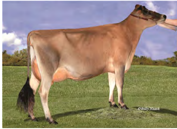
PIEDMONT LEGION EXPLOSION, VG-89% FROM THE SAME FAMILY AS LOT 31