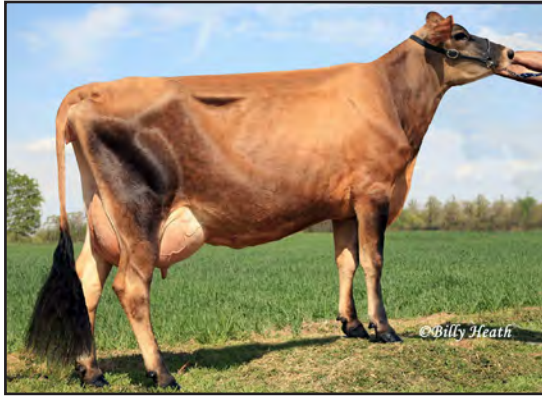
SUNBOW JACE TOPAZ-ET, E-91% GRANDAM OF LOT 94