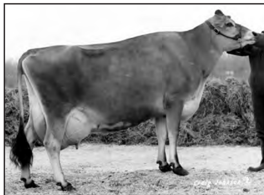
SUN VALLEY LESTER ROXANNE, E-91% FIFTH DAM OF LOT 94