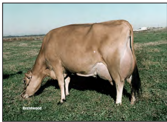
BW BERRETTA PRIZE G525, E-92% FIFTH DAM OF LOT 75