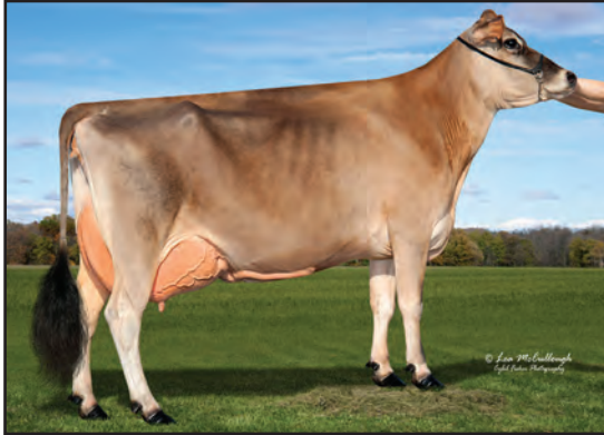
HER-MAN ACADEMY BELLE, E-91% DAM OF LOT 41