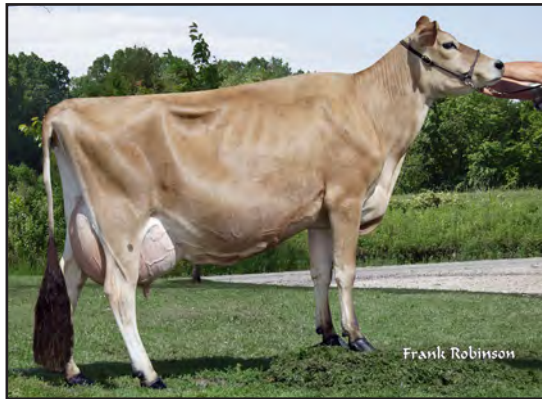
SUNBOW JACE LADY-ET, VG-84% SISTER TO THE GRANDAM OF LOT 94