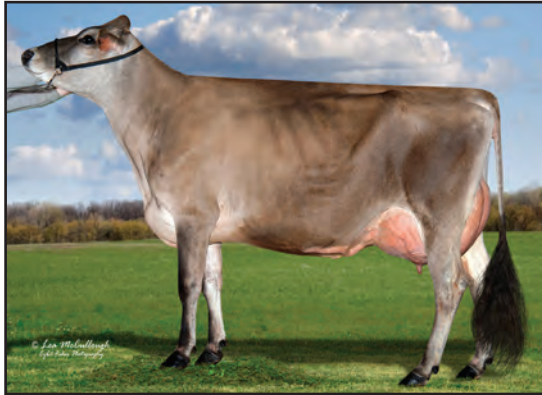
DEERVIEW PERMIER COGIRL {6}-ET, E-90% GRANDAM OF LOT 71