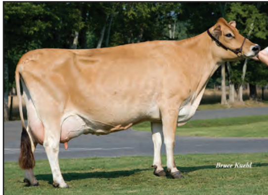
BERRYS DANIEL MINDI, E-90% GREAT-GRANDAM OF LOT 19