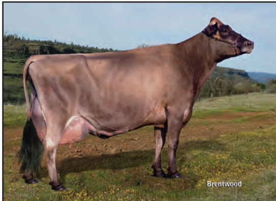
BW AVERY KATIE ET121-ET, E-93% FOURTH DAM OF LOT 71