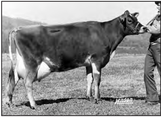
HIGHLAND YANKEE S.B. DELORES, VG-83% SIXTH DAM OF LOT 92