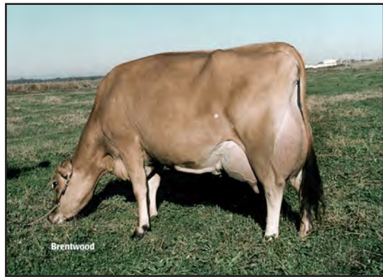
BW BERRETTA PRIZE G525, E-92% FOURTH DAM OF LOT 59