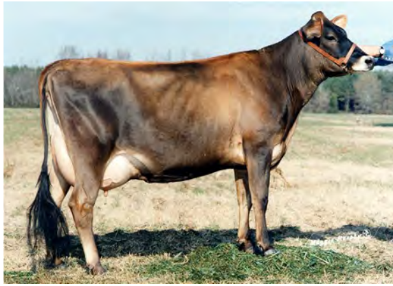
WILL DO ADONIS GARDINIA, E-90% FIFTH DAM OF LOT 16