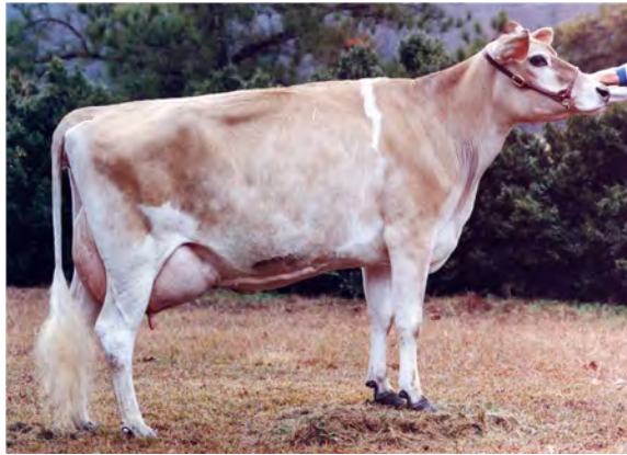
SOONERS YANKEE BRASS, E-91% FIFTH DAM OF LOT 42