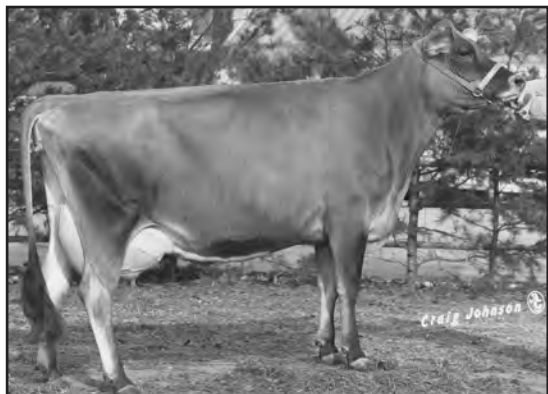
WILL DOS ASM HOOPIE, E-90% SIXTH DAM OF LOT 14