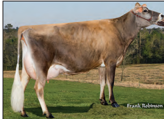
JX BERRYS GANNON FOSHIZZLE {3}, E-91% GRANDAM OF LOT 17