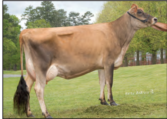
BERRYS LEGACY SNOW-ET, VG-82% GRANDAM OF LOT 19