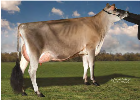
HER-MAN WHOPPER GLORIOUS, E-92% GRANDAM OF LOT 35