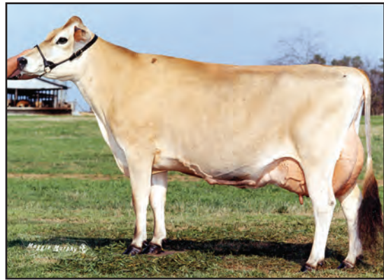
SHANE BELLA-ET, E-90% SIXTH DAM OF LOT 41