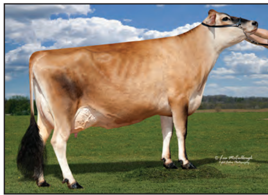
HEARTLAND IRWIN TASHA-ET, E-90% SISTER TO THE GRANDAM OF LOT 96