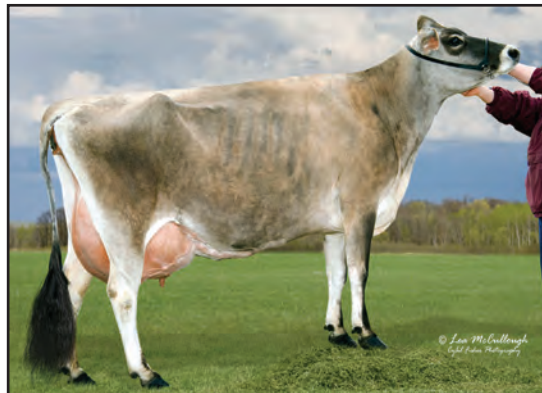
SAR APOLLO ALLURE, E-91% FOURTH DAM OF LOT 34