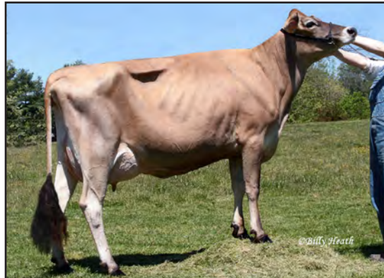
SAR PIEDMONT ANNIE, E-90% GREAT-GRANDAM OF LOT 33