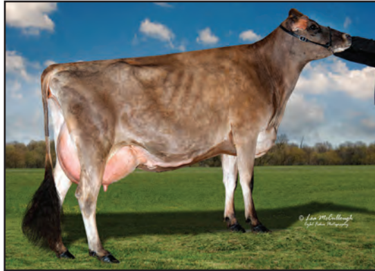
HER-MAN SHOCKER ALLEGRA-ET, E-90% GRANDAM OF LOT 34