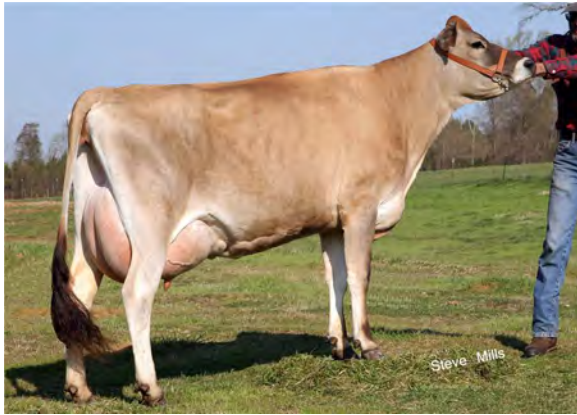
WILL DO JACE HUGHES, E-92% GREAT-GRANDAM OF LOT 10