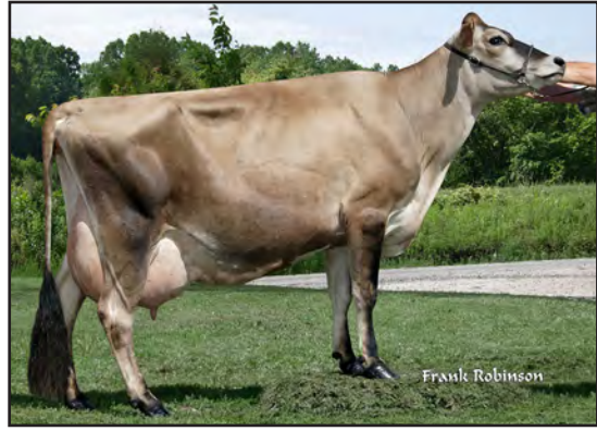
SUNBOW DUNKIRK EMPRESS-ET, E-92% SISTER TO THE GRANDAM OF LOT 94