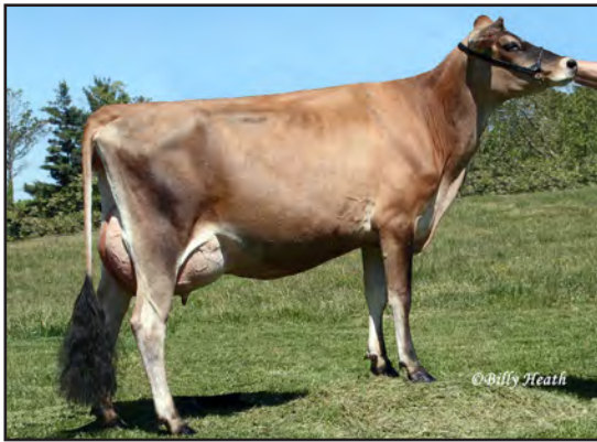
ASPEN GROVE GOLDEN BELLA-ET, E-90% FOURTH DAM OF LOT 41