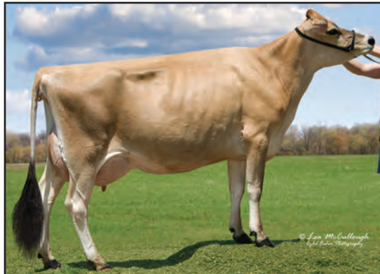
SAR CHAIRMAN ALLURE, E-94% GREAT-GRANDAM OF LOT 34