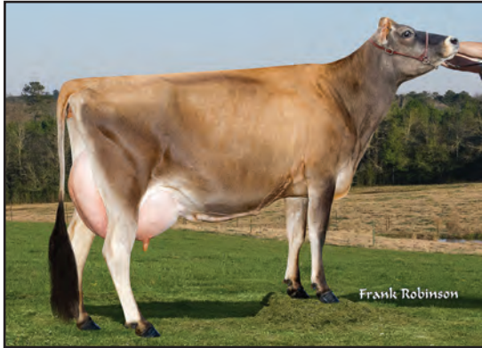
JX BERRYS GANNON AUTUMN {3}, E-90% DAM OF LOT 19