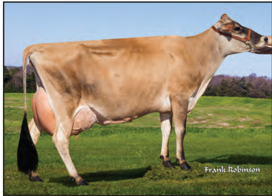
WILL DO HEADLINE HURRY-ET, E-93% SISTER TO THE GRANDAM OF LOT 1