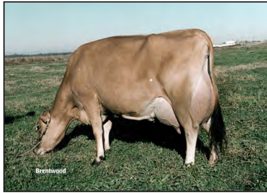
BW BERRETTA PRIZE G525, E-92% FIFTH DAM OF LOT 71