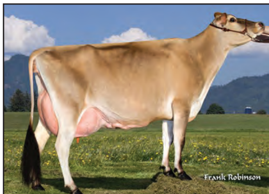
SUNSET CANYON FINALIST ANTHEM-ET, E-94% GREAT-GRANDAM OF LOT 32