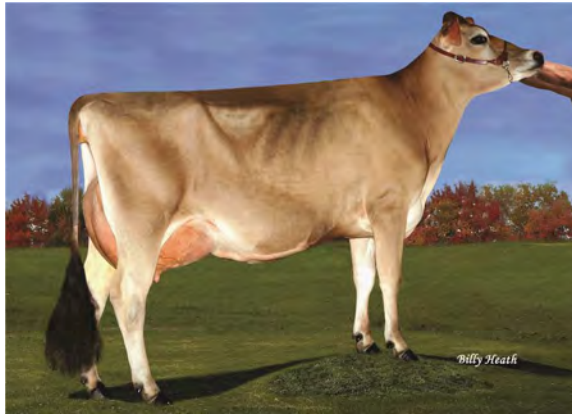
PIEDMONT REGION BEAM, E-91% SISTER TO LOT 25