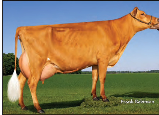
JX BERRYS RENO FIREBALL {4}, VG-84% DAM OF LOT 17