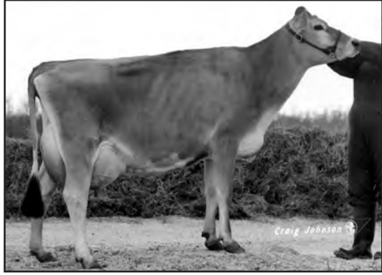
BERRETTA CHARITY OF SUNBOW, E-91% FOURTH DAM OF LOT 92