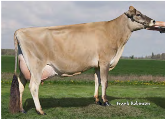
WILL DO RAINIER HEATHER, E-92% GREAT-GRANDAM OF LOT 15