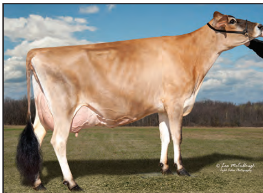
HER-MAN EXCITATION ANNIE, E-91% SISTER TO THE GRANDAM OF LOT 33