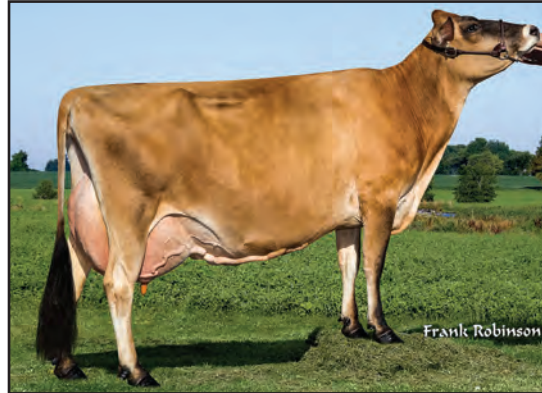
BERRYS JEVON SAPPHIRE ADDISON, E-90% GRANDAM OF LOT 18