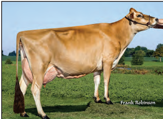
BERRYS ACADEMY ESPERANZA-ET, E-92% SISTER TO THE DAM OF LOT 19