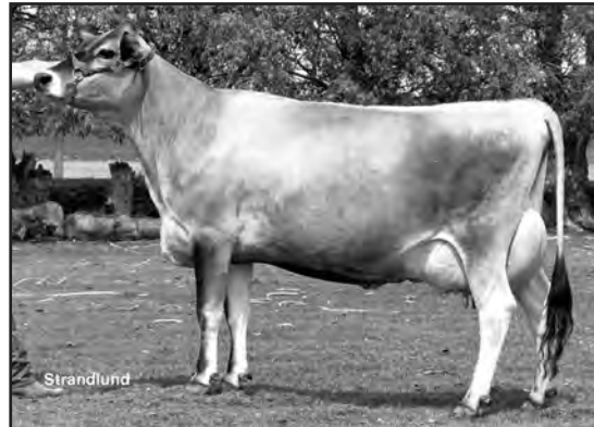
SWEET GRASS BRASS GULKA, VG-85% FIFTH DAM OF LOT 67