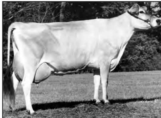
BERRYS SOONER SAPPHIRE, E-92% FIFTH DAM OF LOT 18