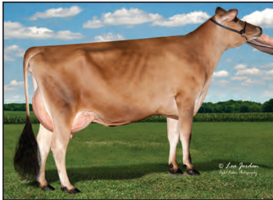
HEARTLAND CHARLEMANGE TARPLEY-ET, VG-83% FULL SISTER TO THE DAM OF LOT 96