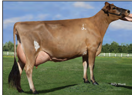
HER-MAN IATOLA ANNIVERSARY, E-93% SISTER TO THE DAM OF LOT 33