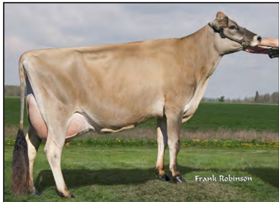
WILL DO RAINIER HEATHER, E-92% SISTER TO THE GREAT-GRANDAM OF LOT 1