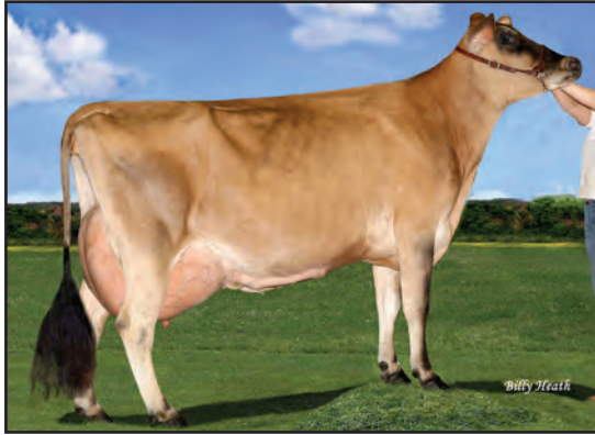
BW LEGION COED-ET, E-92% GRANDAM OF LOT 59