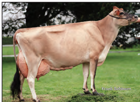
SUNSET CANYON MBSB ANTHEM-ET, E-95% FOURTH DAM OF LOT 32