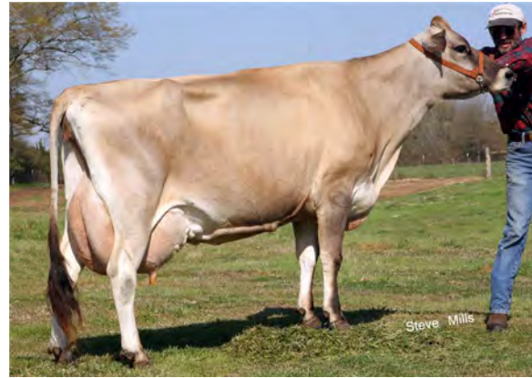
WILL DO PITINO HEAVEN, E-92% FOURTH DAM OF LOT 10