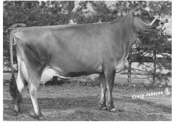
WILL DOS ASM HOOP, E-90% SIXTH DAM OF LOT 11