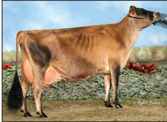
HURONIA CENTURION VERONICA 20J, E-97% FOURTH DAM OF LOT 77