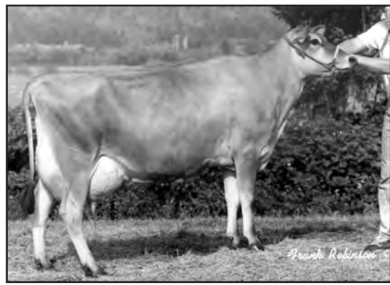
SUN VALLEY CHIEF ROXANNE, E-92% SIXTH DAM OF LOT 94