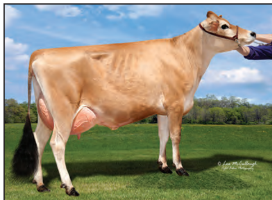
HEARTLAND IMPRESS TAMPA-ET, E-91% SISTER TO THE GRANDAM OF LOT 96