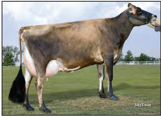
HEARTLAND IMPRESS TULIP-ET, E-92% SISTER TO THE GRANDAM OF LOT 96