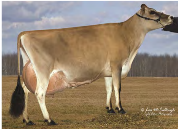
PIEDMONT SAMBO HOPE, VG-89% FOURTH DAM OF LOT 26