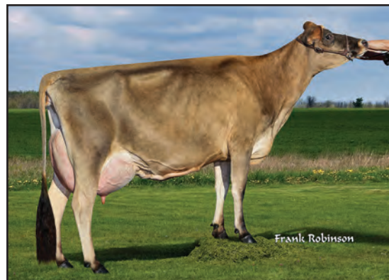
BERRYS PRESCOTT EVE-ET, VG-88% SISTER TO THE DAM OF LOT 19