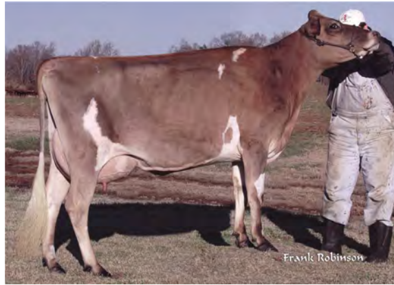
DEERVIEW MARK NANNY, E-90% SIXTH DAM OF LOT 53