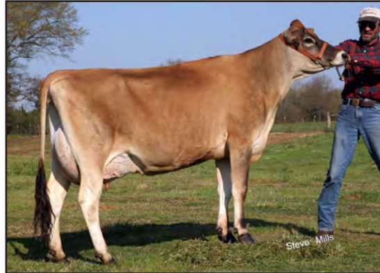
WILL DO JACE HEALER-ET, E-95% GREAT-GRANDAM OF LOT 1