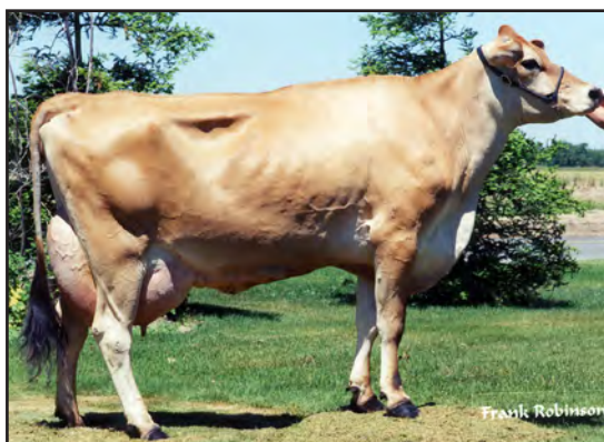
SUNSET CANYON BROOK AMITY-ET, E-90% FIFTH DAM OF LOT 32