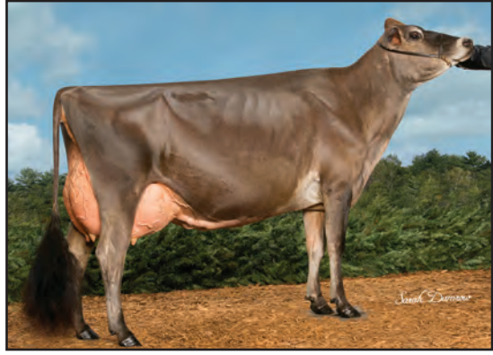
RATLIFF IMPRESSION DONNER-ET, E-91% SISTER TO THE GRANDAM OF LOT 77