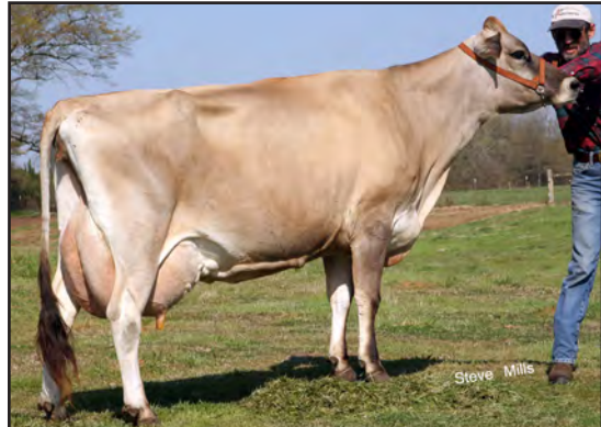
WILL DO PITINO HEAVEN, E-92% SISTER TO THE GREAT-GRANDAM OF LOT 14