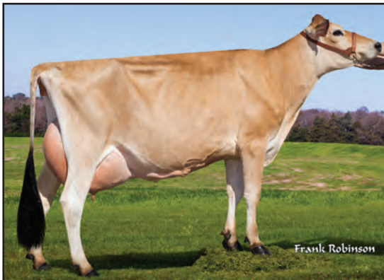
WILL DO PLUS HOPE {6}, E-92% SISTER TO THE GRANDAM OF LOT 1