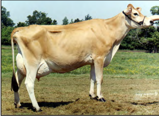
SUNBOW SHANE GLORY-ET, E-91% GREAT-GRANDAM OF LOT 92