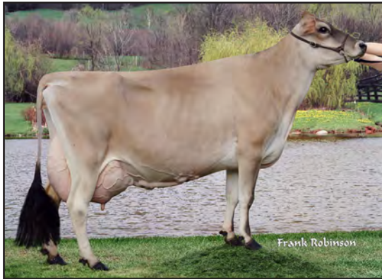
DEERVIEW MONTANA GALAXY-ET, E-94% SISTER TO GRANDAM OF LOT 61