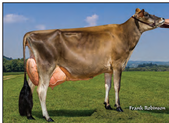
SUNSET CANYON HG FINAL ANTHEM, E-91% SISTER TO THE GRANDAM OF LOT 32