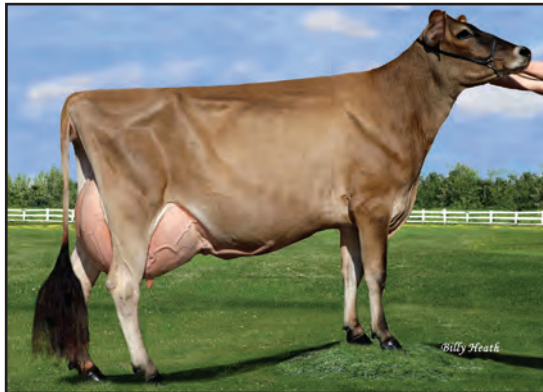
HER-MAN ACTION AGAIN, E-91% DAM OF LOT 33