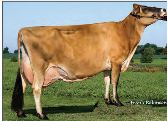
BERRYS JEVON SAPPHIRE ADDISON, E-90% GRANDAM OF LOT 20