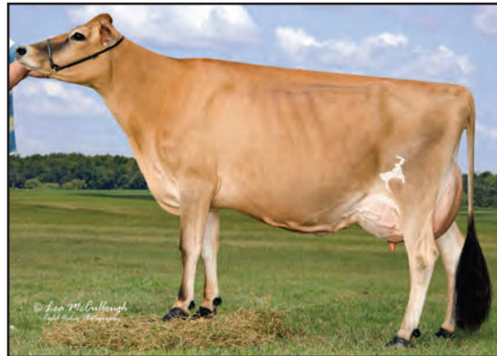
SAR CONNECTION P ANNIE, E-91% GRANDAM OF LOT 33