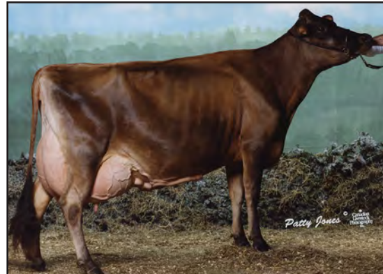
DUNCAN BELLE, E-92% EIGHTH DAM OF LOT 41