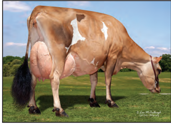
HEARTLAND NATHAN TEXAS-ET, E-95% GREAT-GRANDAM OF LOT 96