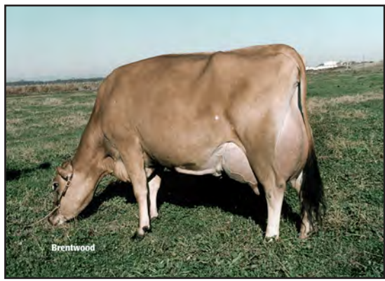
BW BERRETTA PRIZE G525, E-92% FIFTH DAM OF LOT 89