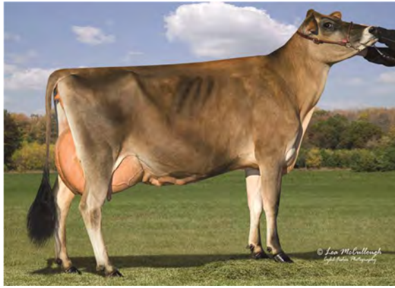
PIEDMONT SULTAN BELL, E-91% FROM THE SAME FAMILY AS LOT 21