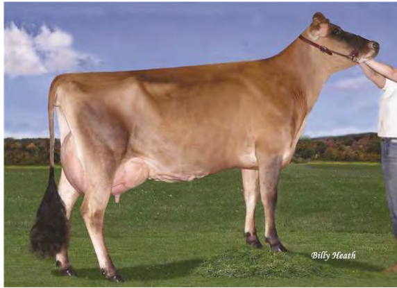
DEERVIEW TBONE JASPER, E-93% DAM OF LOT 63