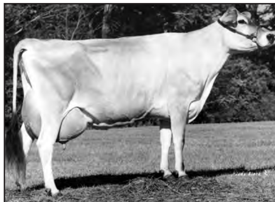
BERRYS SOONER SAPPHIRE, E-92% FIFTH DAM OF LOT 20