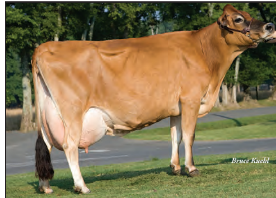
BERRYS PARADE MEDLEY, E-91% FOURTH DAM OF LOT 19