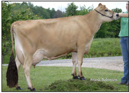
SUNBOW JACE MAJESTY-ET, VG-88% SISTER TO THE GRANDAM OF LOT 94