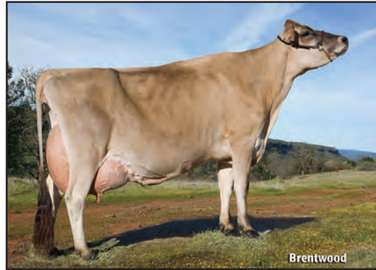
BW JACE JENNY ET336-ET, E-91% SISTER TO THE GRANDAM OF LOT 59