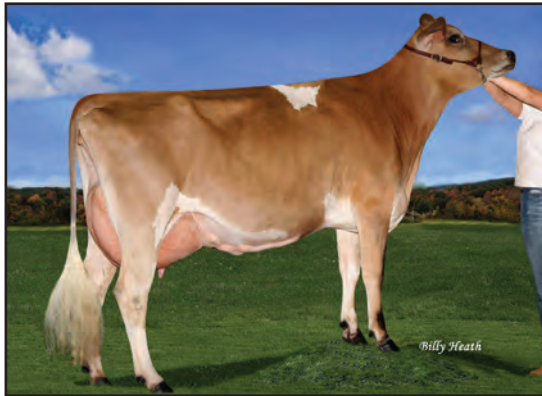
DEERVIEW MERCHANT COED-ET, E-91% SISTER TO THE GRANDAM OF LOT 71