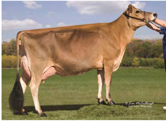
GILLERS GEORGINA, E-93% GRANDAM OF LOT 52