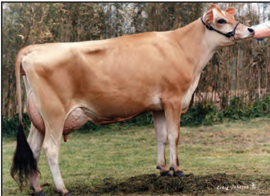
BOOMER BELLE, E-93% SEVENTH DAM OF LOT 41