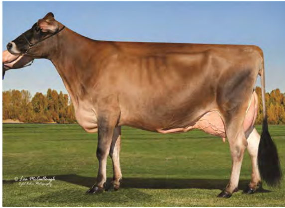
HER-MAN/SAR IRWIN DOLL DAM OF LOT 37