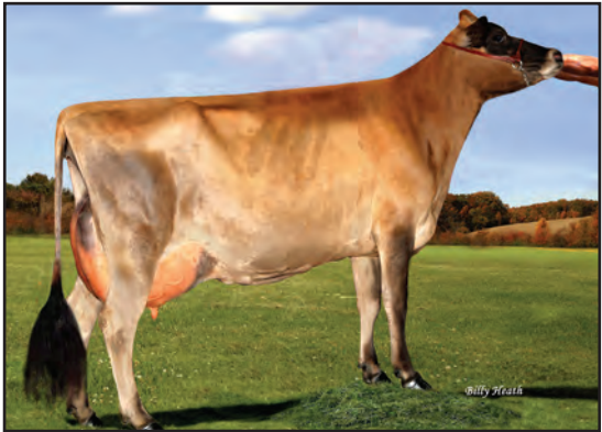
DEERVIEW REACTION KATIE-ET, E-93% SISTER TO THE GRANDAM OF LOT 71