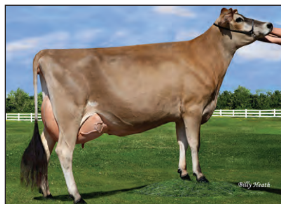
HER-MAN BUMMER ANNIE, E-91% SISTER TO THE GRANDAM OF LOT 33