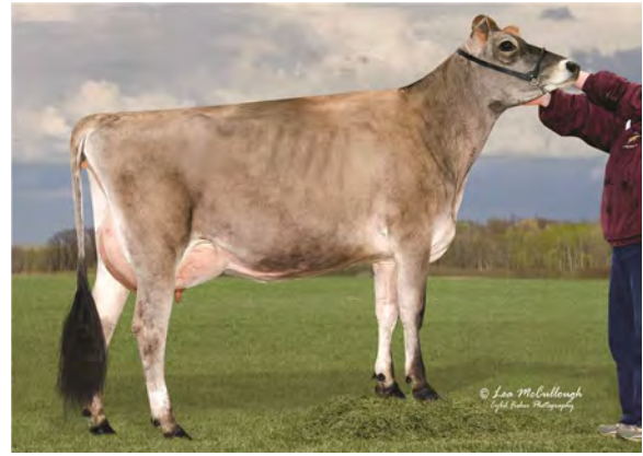
BRIDON SHYSTER GILDA, VG-89% FOURTH DAM OF LOT 35