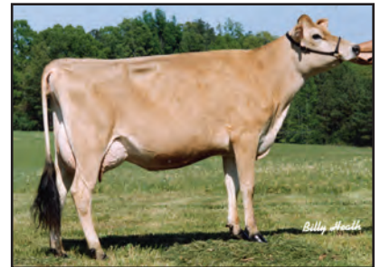
SUNNY DAY SKYLINE BANGLES Sister to Grandam of Lot 670