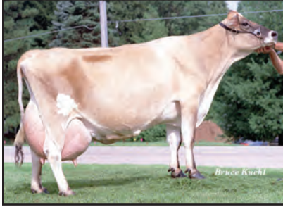
HILLVIEW TRADER BABKA Fourth Dam of Lot 3275