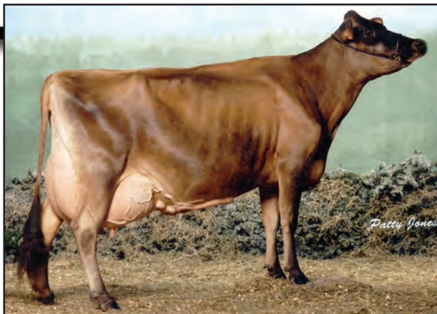
DUNCAN BELLE, EX 3 (CAN) Fifth Dam of Lot 3283

SORENSENS HILLVIEW JERSEY FARM, INC. MILKING HERD DISPERSAL