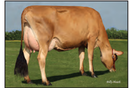
HILLVIEW LOUIE KATI-KI-P Sister to the Embryo Carried by Lot 3298

DP VALENTINO SAMSON USA 067106977 GT50K JH1F JH2F 14JE576 CDCB GPTA 08/01/2015 43DAUS 19HRDS 100%RIP 87%R 841M 0.02% 43F 75%ILE 88%R -0.01% 27P 383CM$ 376NM$ 360FM$ 296GM$ 3.6PL -1.6DPR -0.8CCR 0.9HCR 2.89SCS AJCA 08/01/2015 23DAUS GPTAT 82%R 2.2 GJUI 22.9 GJPI 82%R 145