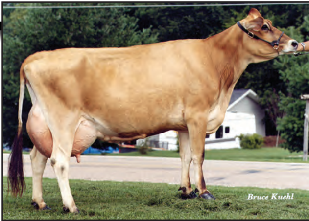
HILLVIEW SAMBO BRIANNE, E-90% Grandam of Lot 3112

SORENSENS HILLVIEW JERSEY FARM, INC. MILKING HERD DISPERSAL