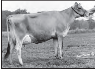
DUNCAN BRAVE SANDY-ET, E-90% Fifth Dam of Lot 3288