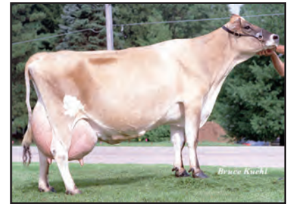
HILLVIEW TRADER BABKA Great-Grandam of Lot 3089

4TH DAM: HILLVIEW SOONER BON BON 90% 4-11 305 2 18800 4.6 858 3.8 707 DHIR 2294C