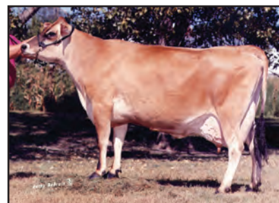
ROCK ELLA B SOONER BELLE-ET Great-Grandam of Lot 3164