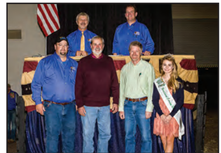
HILLVIEW NIKON KEY-LADY-PP-ET Full Sister to Lot 5