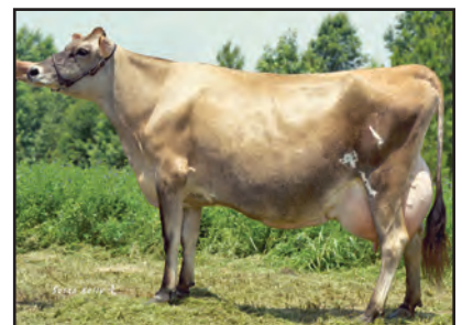
SUNNY DAY YANKEE BECKY Great-Grandam of Lot 670