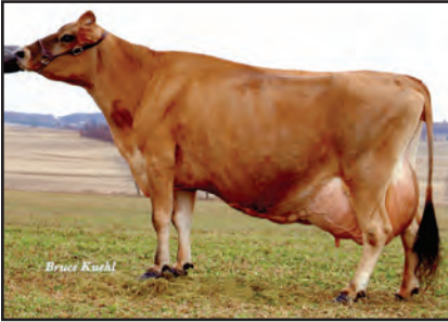
AVON ROAD DC POP Great-Grandam of Lot 3361

SORENSENS CHRIS & CHERYL BREEDER & OWNER PINE RIVER, WI