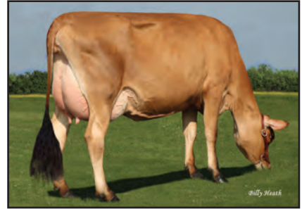
HILLVIEW LOUIE KATI-KI-P Sister to Lot 7

SCHULTZ LEGAL CRITIC-P USA 117217618 GT50K JH1C JH2F 11JE1098 CDCB GPTA 08/01/2015 1479DAUS 168HRDS 51%RIP 99%R 499M 0.05% 34F 59%ILE 99%R 0.01% 21P 325CM$ 310NM$ 274FM$ 214GM$ 3.0PL -2.5DPR -1.7CCR 0.5HCR 2.83SCS AJCA 08/01/2015 900DAUS GPTAT 98%R 1.4 GJUI 21.9 GJPI 94%R 116