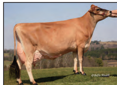
JUNIPER JACE BECCA-ET Sister to Grandam of Lot 3164