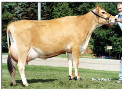
HILLVIEW BERRETTA BOOKOO Sister to the Grandam of Lot 3295