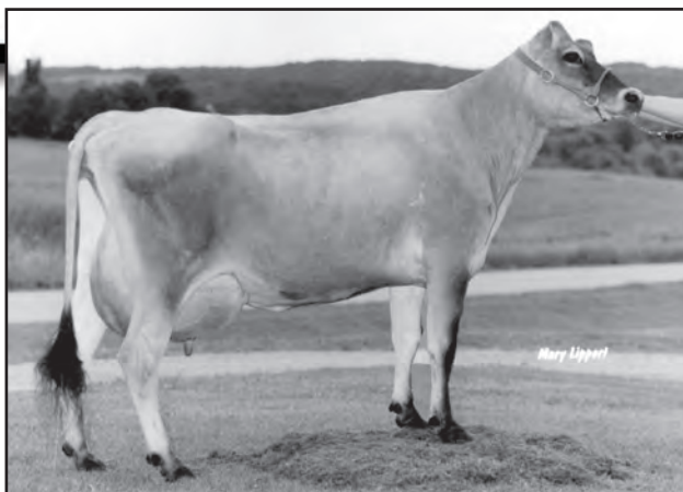
HILLVIEW BERRETTA MALYNN, VG-88% Fourth Dam of Lot 3123

SORENSONS HILLVIEW JERSEY FARM, INC. MILKING HERD DISPERSAL