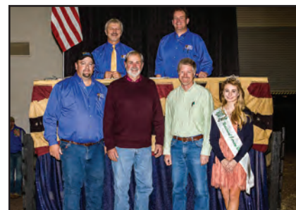
HILLVIEW NIKON KEY-LADY-PP-ET Full Sister to Lot 14