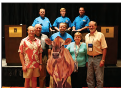
HILLVIEW MACHETE KEY-CHAR-M-P-ET Full Sister to Lot 4

BORN 12/10/2014 TATTOO / N60 P9 FEMALE EFI 8.2% AMERICAN ID 3419 / 3419 JH1F JH2F