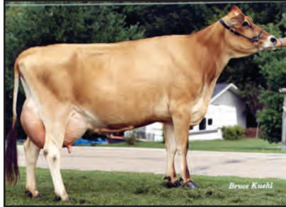
HILLVIEW SAMBO BRIANNE Great-Grandam of Lot 3313