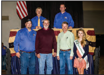
HILLVIEW NIKON KEY-LADY-PP-ET Full Sister to Lot 7

CDCB GPTA 09/01/2015 ORECS 68%R 99%ILE 1163M 34F 31P 379CM$ 384NM$ 396FM$ 301GM$ 4.5PL -1.1DPR -0.7CCR -0.5HCR 2.93SCS AJCA 09/01/2015 GPTAT 68%R 1.1 GJUI 13.5 GJPI 64%R 144 ST SR DF RA RW RL FA -1.0 -0.4 1.1 L0.2 -0.4 S0.3 S0.1 FU RH RW UC UD TP TL 0.7 1.4 1.1 0.7 S0.5 C1.2 S0.6