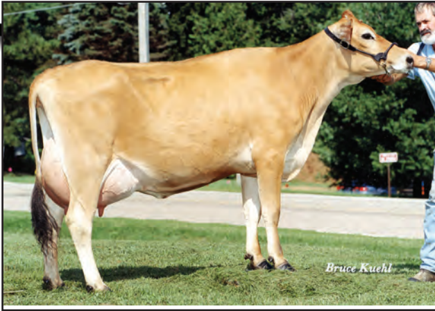
HILLVIEW BERRETTA BOOKOO, E-90% Fourth Dam of Lot 3136