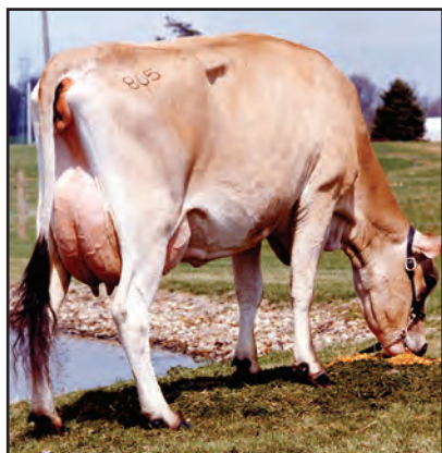
YELLOW ROSE FELINA BELLE-ET Grandam of Lot 3228