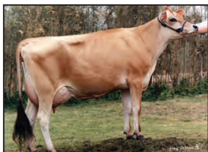
BOOMER BELLE Fifth Dam of Lot 3228

BORN 07/18/2011 DHIA HERD # 35-70-0033 CONTROL # 3228 FEMALE EFI 8.5% AMERICAN ID 3228 / 3228 JH1F JH2F