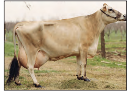
SUNNY DAY RIGHT RESULT BECKY-ET Grandam of Lot 670