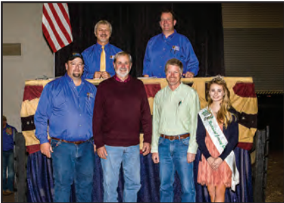
HILLVIEW NIKON KEY-LADY-PP-ET Full Sister to Lot 6