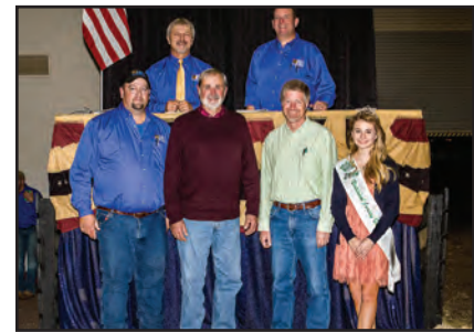
HILLVIEW NIKON KEY-LADY-PP-ET Full Sister to Lot 7

AHLEM ALLSTAR NITA 36001 87% USA 070047475 GT3K JH1F TATTOO / L6001 DHIA HERD # 93-24-0224 CONTROL # 36001 1-09 269 2 14460 5.6 811 4.1 586 97DCR 2029C 2-08 305 3 19330 5.9 1149 4.0 774 96DCR 2680C 305 2X ME AVG 2L 22244M 1255F 887P 3071C PPA -160M 202F 60P / YD -578M 135F 31P CDCB GPTA 09/01/2015 3RECS 77%R 91%ILE -329M 52F 13P 277CM$ 236NM$ 137FM$ 195GM$ 0.1PL -1.1DPR -1.3CCR -0.5HCR 2.96SCS AJCA 09/01/2015 GPTAT 76%R 0.8 GJUI 11.8 GJPI 72%R 78