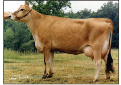
SUNNY DAY BERRETTA BETHANY-ET Sister to Grandam of Lot 670