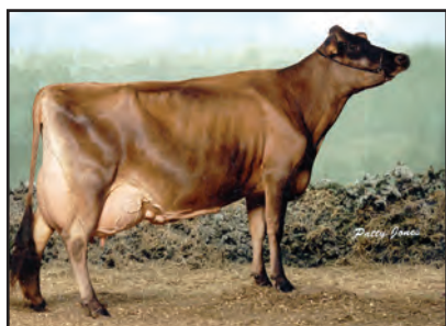
DUNCAN BELLE Sixth Dam of Lot 3228