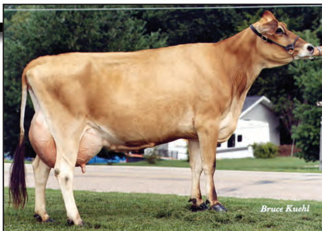
HILLVIEW SAMBO BRIANNE, E-90% Great-Grandam of Lot 3186

SORENSENS HILLVIEW JERSEY FARM, INC. MILKING HERD DISPERSAL