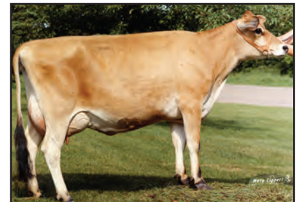
HILLVIEW BEACON BEST Fourth Dam of Lot 3112

4TH DAM: HILLVIEW BEACON BEST 90% 4-01 305 2 15730 5.9 934 4.3 679 DHIR 2213C