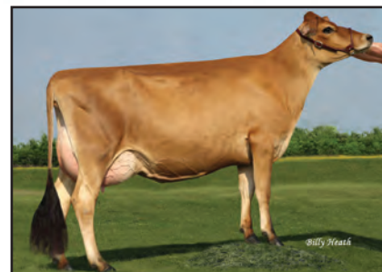
HILLVIEW LOUIE KATI-KI-P Sister to Lot 14

4TH DAM: CIRCLE S BARBER KYRI-P 90% 3-09 301 2 18140 5.8 1049 3.9 714 95DCR 2472C 1ST AGED COW, 2006 MASSACHUSETTS STATE SHOW