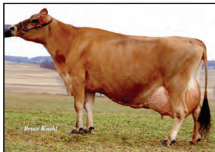
AVON ROAD DC POP Grandam of Lot 642