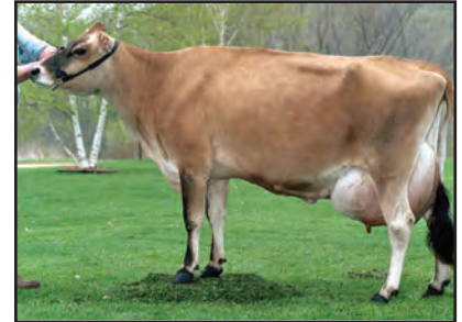
CAVE CREEK 815 BERRETTA KAVA-ET Fourth Dam of Lot 3270

4TH DAM: CAVE CREEK 815 BERRETTA KAVA-ET 90% 4-02 365 2 31827 3.9 1239 3.2 1011 DHIR 3378C