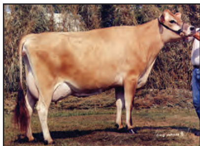
TH BOOMER BELLE-ET Fourth Dam of Lot 3228