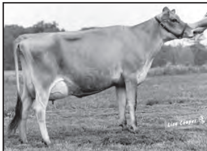
DUNCAN BRAVE SANDY-ET, E-90% Fifth Dam of Lot 3238