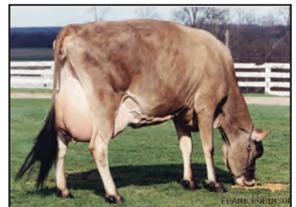
SUNNY CENTURION BECKY III-ET Sister to Grandam of Lot 670