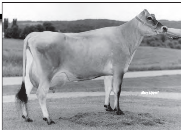
HILLVIEW BERRETTA MALYNN, VG-88% Fourth Dam of Lot 3104