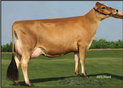
HILLVIEW LOUIE KATIKI-P Sister to Lot 6

SISTER(S): HILLVIEW PLUS KEY-LOCKET-P SELLING AS LOT 9 HILLVIEW SPARTAN KEY-LACKIE-P-ET SELLING AS LOT 10 HILLVIEW SPARTAN KEY-LADY-P-ET SELLING AS LOT 11