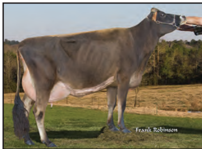
SEACORD FARM LOVABULL LISA-P Sister to the Dam of Lot 687