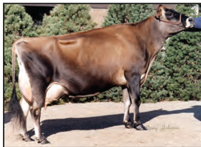
SEACORD FARM EXPO ELAINE Great-Grandam of Lot 690