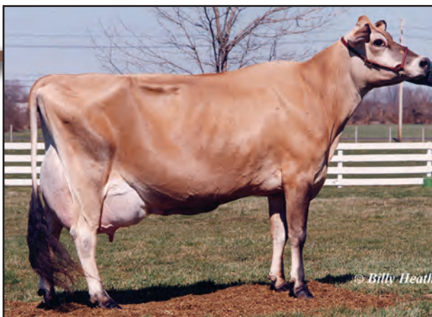
GRAND BELL I GABRIEL, E-94% Fifth Dam of Lot 679