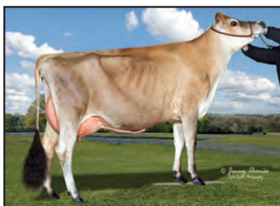
ARETHUSA HG LIBBY-ET Sister to Lot 436