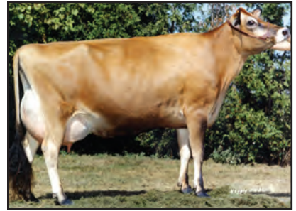
SILVERDENE SHAMROCKS JULIE Great-Grandam of Lot 597

4TH DAM: SILVERDENE CAPTAINS JULIA 90% 7-00 305 2 17650 5.2 923 4.3 760 DHIR 2472C