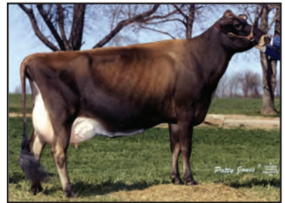
SILVERDENE REVELATION JEWEL Sister to the Grandam of Lot 597