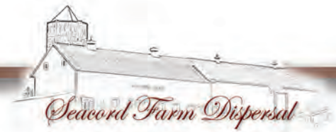
SEACORD FARM COMERICA CLASSY, E-94% Sister to the Dam of Lot 742