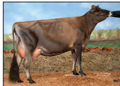
SEACORD FARM GATOR VANNA Sister to Lot 688

SHF CENTURION SULTAN USA 110404026 GT50K JH1C JH2C 200JE303 CDCB GPTA 04/01/2016 13177DAUS 2545HRDS 5%RIP 99%R -274M 0.11% 9F 14%ILE 99%R 0.03% -4P 24CM$ 19NM$ 7FM$ -36GM$ 0.7PL -2.1DPR -1.4CCR -0.8HCR 3.05SCS AJCA 04/01/2016 8183DAUS GPTAT 99%R 1.0 GJUI 15.1 GJPI 99%R -2