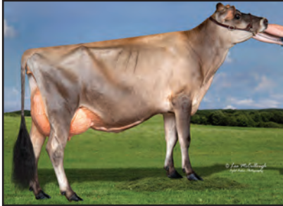
SEACORD FARM ACTION ALISON Selling as Lot 643

BORN 10/05/2012 TATTOO / J643 DHIA HERD # 21-52-0241 CONTROL # 643 FEMALE EFI 6.8% 2-02 305 2 16080 5.0 797 3.4 552 95DCR 1907C 3-05 75 2 5826 4.3 253 3.2 186 RIP 18682 851 617 PME 305 2X ME AVG 1L 19473M 971F 681P 2354C 2-04 88% 3-07 91% ST SR DF RA RW RL FA FU RH RUW UC UD TP TL RTR RTS 37 38 43 22 42 29 35 42 45 48 37 33 26 24 36 35 PPA -1111M -32F -54P / YD -1482M -42F -71P CDCB PTA 04/01/2016 1RECS 49%R 26%ILE -688M -18F -26P -11CM$ -1NM$ 22FM$ OGM$ 3.7PL 1.2DPR 1.2CCR 1.6HCR 3.02SCS AJCA 04/01/2016 PTAT 43%R 0.9 JUI 19.0 JPI 42%R -31 ST SR DF RA RW RL FA -0.1 -0.2 -0.1 H1.0 0.0 P0.1 S0.3 FU RH RUW UC UD TP TL 1.7 1.2 0.4 0.6 S2.0 C0.1 L0.7