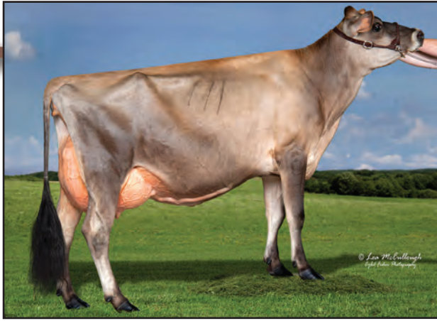
SEACORD FARM ACTION ALISON, E-91% Sister to Lot 757