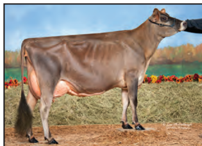
SEACORD FARM COMERICA CLASSY Dam of Lot 661

BORN 06/02/2013 TATTOO / J661 DHIA HERD # 21-52-0241 CONTROL # 661 FEMALE EFI 6.4%