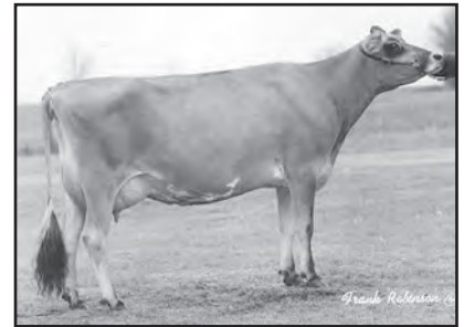
OAKLEA FLASH CAMIE Sister to the Grandam of Lot 684

AVONLEA REMAKE GINGER ALE-ET 91% JECAN000010019512 GT TATTOO ENL / 14G DHIA HERD # 21-52-0241 CONTROL # 7804 2-06 305 2 14130 4.4 619 3.4 481 83DCR 1655C 3-08 305 2 16770 5.0 834 3.5 580 94DCR 2004C 4-08 305 2 17680 4.4 785 3.5 617 93DCR 2110C 5-11 297 2 18980 4.4 831 3.5 659 93DCR 2241C 305 2X ME AVG 4L 18280M 826F 630P 2157C PPA -1348M -79F -58P / YD -3353M -136F -109P CDCB PTA 04/01/2016 5RECS 57%R 0%ILE -1976M -74F -62P -457CM$ -458NM$ -458FM$ -304GM$ -1.8PL 4.5DPR 3.2CCR 0.5HCR 2.83SCS AJCA 04/01/2016 PTAT 52%R -1.8 JUI 9.9 JPI 48%R-179