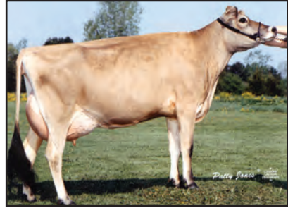
THERIHOF JAMES LAURIE Great-Grandam of Lot 614

FRESH: 03/15/2015 BRED: 05/02/2016 DUE: 02/05/2017 TO SEACORD FARM KOOP CLASSIC USA 119678752 PA -1104M -18F -26P -218CM$ -229NM$ -253FM$ -1.8PL -2.3DPR -3.1CCR -1.1HCR 3.09SCS PA TYPE 1.0 JPI 31%R -95 30 LBS. MILK ON MAY TEST SCCS: 5.7 2ND SR 3-YEAR-OLD, 2015 NY STATE FAIR JR SHOW 2ND BU, 2015 NY STATE FAIR JR SHOW