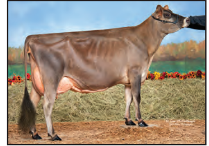
SEACORD FARM COMERICA CLASSY Sister to the Dam of Lot 665

FRESH: 07/03/2015 BRED: 01/13/2016 DUE: 10/18/2016 TO CAL-MART PLUS ZAYD {5} USA 117349003 1JE794 CDCB GPTA 04/01/2016 1283DAUS 118HRDS 79%RIP 99%R 961M 0.00% 46F 28%ILE 99%R -0.03% 28P 201CM$ 202NM$ 204FM$ 158GM$ -0.7PL -0.9DPR -1.9CCR -5.5HCR 2.99SCS AJCA 04/01/2016 205DAUS GPTAT 95%R 1.2 GJUI 3.3 GJPI 94%R 88 3RD JR 2-YEAR-OLD, 2015 NY STATE FAIR JERSEY SHOW