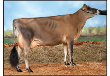
FORTRESS JUSTICE JAN Selling as Lot 150

FRESH: 09/18/2015 BRED: 05/30/2016 DUE: 03/05/2017 TO COLTON FLAME FIREMAN USA 118155636 94JE4004 CDCB GPTA 04/01/2016 73%R -973M 0.22% -6F 9%ILE 73%R 0.11% -16P 7CM$ -12NM$ -59FM$ -25GM$ 1.9PL -0.2DPR -0.3CCR 1.2HCR 3.10SCS AJCA 04/01/2016 ODAUS GPTAT 72%R 1.4 GJUI 24.7 GJPI 69%R -16