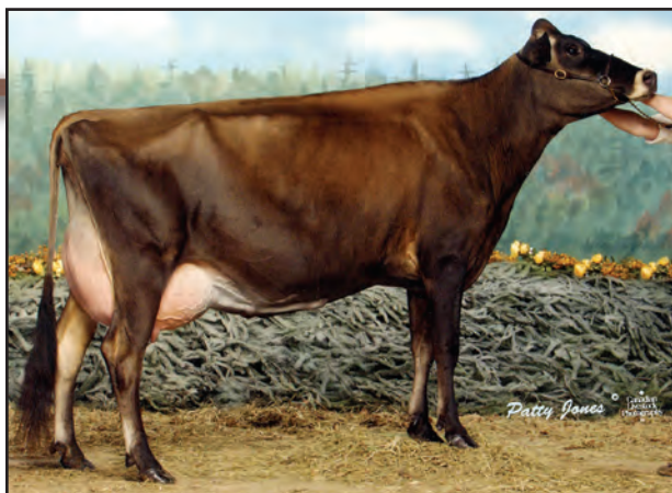
JUST A FEW RENAISSANCE ELISA, E-94% Fourth Dam of Lot 640