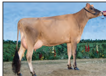
SEACORD FARM JADE VEE III-ET Sister to the Grandam of Lot 688

SEACORD FARM JADE VEE II-ET 90% USA 115053074 GT TATTOO / J331 DHIA HERD # 21-52-0241 CONTROL # 331 2-00 305 2 13590 4.8 647 3.8 513 96DCR 1747C 3-00 305 2 14290 4.5 647 3.8 547 96DCR 1795C 4-00 294 2 17010 5.0 845 3.7 634 95DCR 2193C 4-11 305 2 16420 5.0 820 3.9 635 97DCR 2194C 6-00 305 2 16460 4.4 725 3.8 618 96DCR 2018C 305 2X ME AVG 5L 17332M 805F 647P 2180C PPA -1782M -87F -55P / YD -1853M -79F -54P CDCB PTA 04/01/2016 5RECS 61%R 9%ILE -988M -38F -28P -115CM$ -119NM$ -127FM$ -89GM$ 2.8PL 2.0DPR 2.0CCR -0.1HCR 2.98SCS AJCA 04/01/2016 PTAT 56%R 0.2 JUI 3.8 JPI 51%R -66