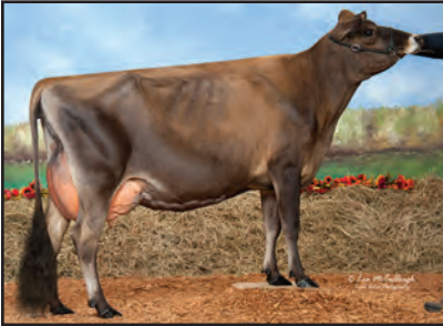
SEACORD FARM GATOR VANNA Dam of Lot 632