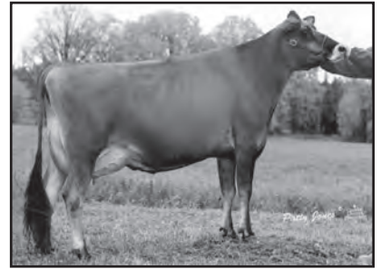
AVONLEA RENAISSANCE GLOW Sister to the Grandam of Lot 684

BW CENTURION PEGGY K798 92% USA 111926011 GT50K JH1C JH2F TATTOO K798 / K798 DHIA HERD # 93-52-0150 CONTROL # 1197 3-07 305 3 25500 5.2 1327 3.3 833 95DCR 2876C 365 3 28650 5.1 1471 3.3 957 DHIR 3306C 5-05 305 3 24100 5.0 1198 3.4 831 102DCR 2871C 365 3 27800 4.8 1342 3.5 964 DHIR 3332C 305 2X ME AVG 3L 23294M 1103F 774P 2672C PPA 1382M 62F 29P / YD 1816M 89F 49P CDCB GPTA 05/03/2016 3RECS 95%R 83%ILE 836M 39F 21P 206CM$ 216NM$ 239FM$ 123GM$ 1.8PL -2.3DPR -3.1CCR -1.5HCR 3.09SCS AJCA 05/03/2016 GPTAT 92%R 0.7 GJUI 9.3 GJPI 92%R 78