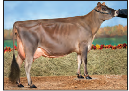
SEACORD FARM COMERICA CLASSY Selling as Lot 562

GRAND CHAMPION, 2014 NY SPRING JUNIOR SHOW 2ND 5-YEAR-OLD, 2015 NY STATE FAIR JERSEY SHOW 5TH 5-YEAR-OLD, 2015 NY SPRING SHOW 8TH 4-YEAR-OLD, 2014 ALL AMERICAN JERSEY SHOW 1ST 4-YEAR-OLD, 2014 NY SPRING JUNIOR SHOW 2ND 4-YEAR-OLD, 2014 NY SPRING SHOW 6TH JR 3-YEAR-OLD, 2013 ALL AMERICAN JERSEY SHOW 3RD JR 3-YEAR-OLD, 2013 ALL AMERICAN JUNIOR SHOW 1ST JR 3-YEAR-OLD, 2013 NY STATE FAIR JUNIOR SHOW RESERVE GRAND, 2013 NY STATE FAIR JUNIOR SHOW