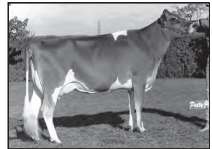
OAKLEA GEMNI GINGER 1T Great-Grandam of Lot 684

4TH DAM: SPRUCE AVENUE M A GLORIA VG 86 (CAN)