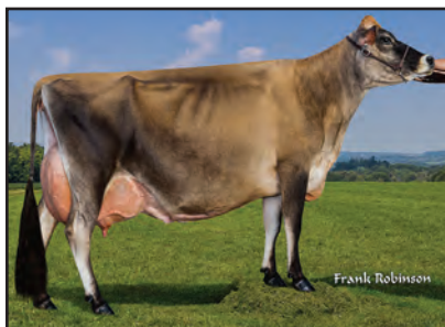
SEACORD FARM LEGACY LISA 933-P, 94% Daughter of Seacord Farm Lovabull Lisa-P

BORN 03/04/2014 TATTOO / J687 P0 FEMALE EFI 4.7%