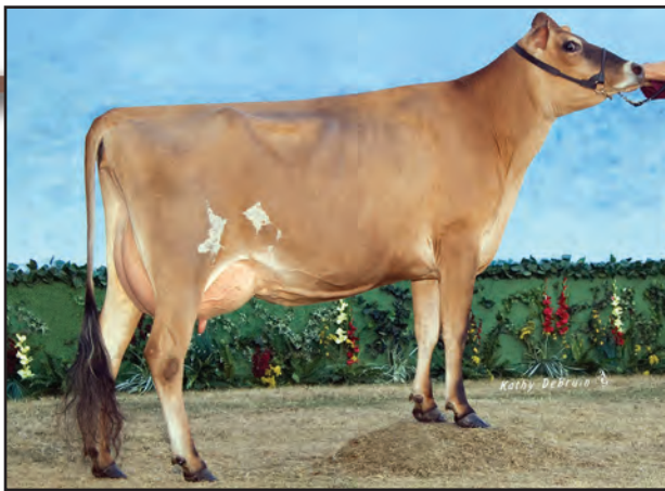
SEACORD FARM VINDICATION EVE, E-92% Sister to the Grandam of Lot 690