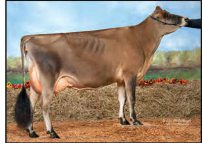
FORTRESS JUSTICE JAN Sister to the Grandam of Lot 650

4TH DAM: FORTRESS LL SHAHRA 92% 8-00 305 2 16450 5.8 960 4.2 688 93DCR 2383C