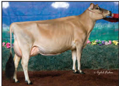
SEACORD FARM COMERICA CLASSY Sister to Lot 527

BORN 05/11/2009 TATTOO / J527 DHIA HERD # 21-52-0241 CONTROL # 527 FEMALE EFI 5.9%