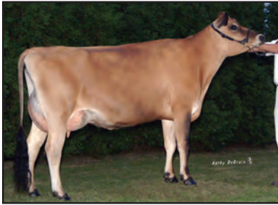
SEACORD FARM JADE VIVIAN Sister to the Grandam of Lot 766