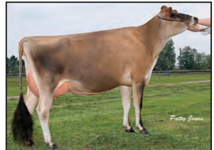
SELECT JADES GOLD 4-ET Sister to the Grandam of Lot 547