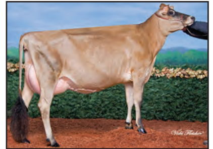
ARETHUSA DELUXE LYRIC-ET Grandam Lot 739

ARETHUSA DELUXE LYRIC-ET 92% USA 115835748 GT TATTOO AF39 / AF39 DHIA HERD # 23-61-0039 CONTROL # 333 1-10 305 2 15200 5.3 809 4.0 608 92DCR 2105C 2-10 305 2 19730 5.9 1170 3.8 750 95DCR 2595C 305 2X ME AVG 3L 20306M 1090F 776P 2685C PPA -1503M 27F 8P / YD -2590M -26F -35P CDCB PTA 04/01/2016 5RECS 65%R 6%ILE -1485M -23F -24P -132CM$ -169NM$ -255FM$ -97GM$ -1.7PL 1.6DPR 0.8CCR 1.7HCR 2.98SCS AJCA 04/01/2016 PTAT 55%R 0.4 JUI 14.0 JPI 54%R -62