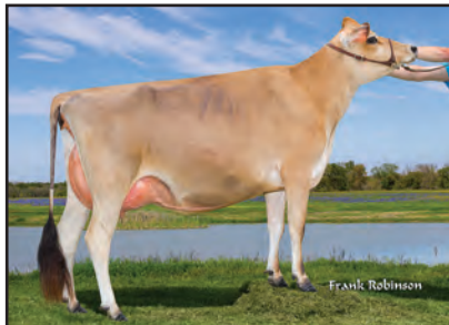
SOUTH MOUNTAIN COMERICA LIVELY-ET Sister to Lot 436