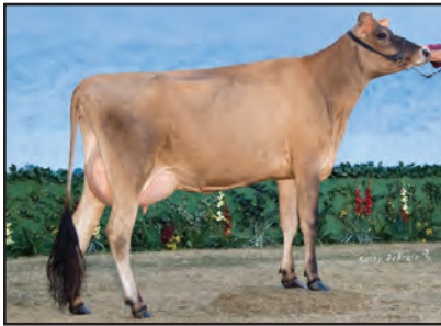
SEACORD FARM JADE VEE III-ET Sister to the Grandam of Lot 766

BORN 04/02/2016 TATTOO / J766 P2 FEMALE EFI 5.6%