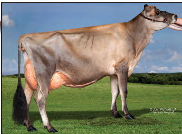
SEACORD FARM ACTION ALISON, E-91% Dam of Lot 901