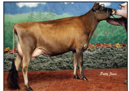
SELECT JADES GOLD 2-ET Sister to the Grandam of Lot 547