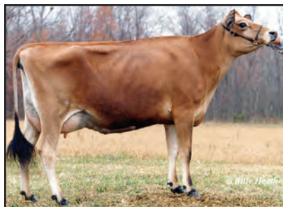
MAR-KEHOE GALAXY JUBILEE Sister to the Grandam of Lot 573

BORN 09/02/2010 TATTOO / J573 DHIA HERD # 21-52-0241 CONTROL # 573 FEMALE EFI 4.1% 2-09 299 2 14940 5.6 841 4.1 618 95DCR 2141C 3-07 305 2 12920 6.4 823 4.6 595 97DCR 2063C 5-01 207 2 14071 5.4 753 4.0 566 RIP 19119 988 752 PME 305 2X ME AVG 2L 16016M 948F 690P 2390C 2-05 84% 3-00 90% 5-08 91% ST SR DF RA RW RL FA FU RH RUW UC UD TP TL RTR RTS 53 41 36 22 45 28 34 36 38 42 33 28 25 22 34 36