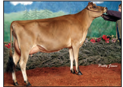
SELECT JW BABYGOLD-ET Sister to the Grandam of Lot 547

SELECT JW GOLDIE-ET VG 86 (CAN) 2-09 305 2 14509 4.2 613 3.7 531 CAN 1718C RESERVE ALL-CANADIAN INTERMEDIATE CALF, 2004 HM ALL-CANADIAN INTERMEDIATE YEARLING, 2005 SELECT VIN JUDYGOLD-ET EX 91-3E (CAN) 4-11 305 2 15574 4.8 754 3.8 595 CAN 2033C 1ST FIVE-YEAR-OLD, 2011 BBQ BELLECHASSE 3RD MATURE COW, 2012 EXPO BBQ 2ND SENIOR THREE-YEAR-OLD, 2009 EXPO QUEBEC SELECT JADE JUSTINE-ET VG 85 (CAN) 4-05 305 2 14615 4.1 604 3.6 529 CAN 1701C