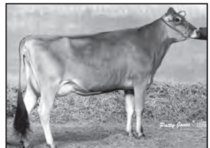
LLOLYN FRED'S GOLD 31B Fourth Dam of Lot 547