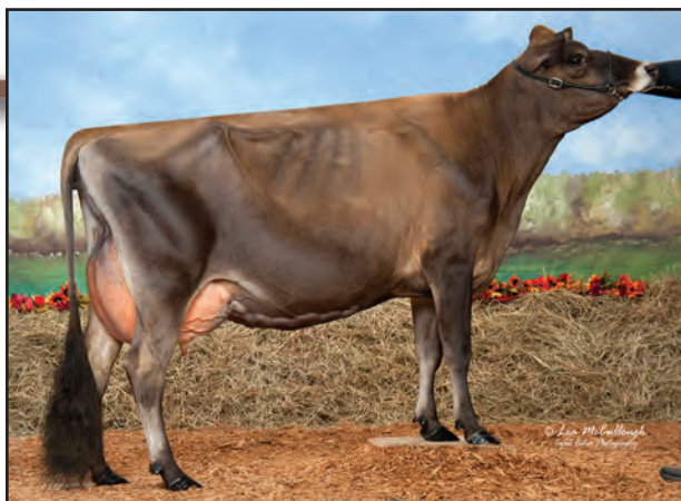
SEACORD FARM GATOR VANNA, VG-89% Dam of Lots 720, 721 and 722