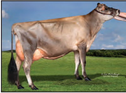
SEACORD FARM ACTION ALISON Daughter to Lot 172

BORN 07/27/2010 TATTOO / C172 DHIA HERD # 21-52-0241 CONTROL # 172 FEMALE EFI 5.2% 2-02 305 2 15570 5.6 868 3.5 543 93DCR 1876C 3-02 305 2 14390 6.1 873 3.9 557 95DCR 1928C 4-03 305 2 18810 5.5 1026 3.5 651 96DCR 2249C 5-04 165 2 9972 5.2 523 3.5 346 RIP 15372 788 535 PME 305 2X ME AVG 3L 17909M 1000F 641P 2217C