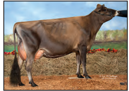
SEACORD FARM GATOR VANNA Grandam of Lot 703

ALL LYNNS LOUIE VALENTINO-ET USA 116279413 GT50K JH1C JH2F 7JE1038 CDCB GPTA 04/01/2016 7618DAUS 849HRDS 20%RIP 99%R 854M -0.07% 27F 61%ILE 99%R -0.01% 28P 358CM$ 353NM$ 340FM$ 233GM$ 5.2PL -2.3DPR -2.7CCR 0.0HCR 2.98SCS AJCA 04/01/2016 3483DAUS GPTAT 99%R 2.0 GJUI 19.3 GJPI 99%R 129