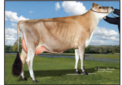
ARETHUSA HG LIBBY-ET Sister to the Dam of Lot 739

DUNCAN BELLE 92% USA 003534492 GI JH1F TATTOO J531 / J531 DHIA HERD # 52-33-0019 CONTROL # 2094 2-00 305 2 14210 5.3 752 4.0 563 DHIR 1833C 3-01 305 2 16860 5.4 905 4.0 676 DHIR 2201C 4-05 305 2 20417 5.2 1067 4.0 825 CAN 2855C 6-00 305 2 21029 5.5 1162 4.2 888 CAN 3077C 305 2X ME AVG 2L 18976M 978F 732P 2380C PPA -827M 36F -12P / YD -1653M 2F -32P CDCB GPTA 05/03/2016 2RECS 94%R 13%ILE -1091M -16F -28P -65CM$ -75NM$ -98FM$ -18GM$ 1.1PL 2.2DPR 2.3CCR 0.4HCR 2.93SCS AJCA 05/03/2016 GPTAT 92%R 0.7 GJUI 13.8 GJPI 92%R -46