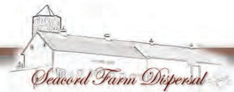
SEACORD FARM GATOR VANNA, VG-89% Sister to the Dam of Lot 762