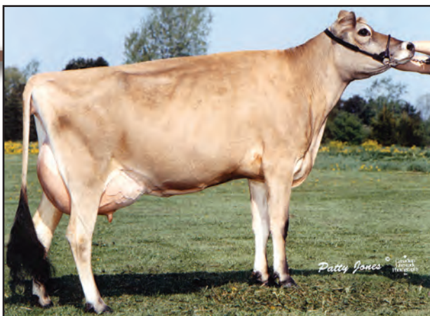
THERIHOF JAMES LAURIE, E-91% Grandam of Lot 539