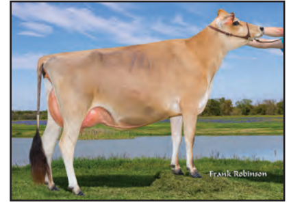
SOUTH MOUNTAIN COMERICA LIVELY-ET Sister to the Dam of Lot 739

VALLEYSTREAM J I S JUNO JECAN000000137836 GT50K JH1F JH2F 73JE33 CDCB GPTA 04/01/2016 7126DAUS 1925HRDS 4%RIP 99%R -1503M 0.01% -70F 1%ILE 99%R 0.04% -47P -344CM$ -337NM$ -320FM$ -268GM$ 2.1PL 2.4DPR 3.5CCR 0.9HCR 3.17SCS AJCA 04/01/2016 3610DAUS GPTAT 99%R -1.4 GJUI 0.7 GJPI 98%R -152