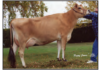
AVONLEA DJ GLAMOUR Sister to the Grandam of Lot 684

SC GOLD DUST PARAMOUNT IATOLA-ET USA 112118277 GT50K JH1F JH2F 29JE3301 CDCB GPTA 04/01/2016 18033DAUS 2441HRDS 6%RIP 99%R -298M 0.11% 7F 17%ILE 99%R 0.05% -2P 105CM$ 91NM$ 58FM$ 93GM$ 0.8PL 0.3DPR 0.1CCR 0.2HCR 2.96SCS AJCA 04/01/2016 9309DAUS GPTAT 99%R 1.2 GJUI 15.2 GJPI 99%R 24