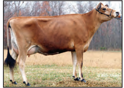
MAR-KEHOE GALAXY JUBILEE Sister to the Grandam of Lot 597