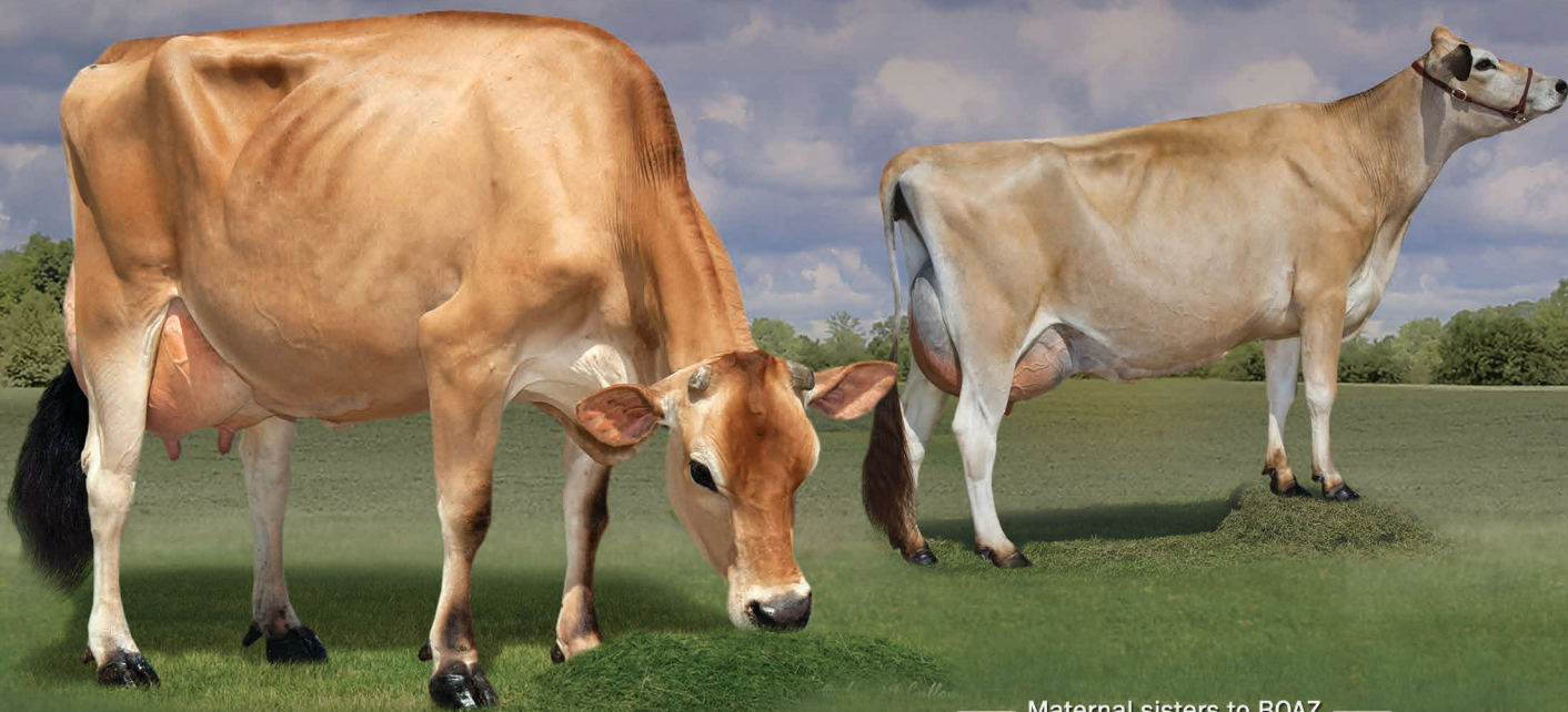
— Maternal sisters to BOAZ —

Dam: Jars of Clay Valentino Bridget, E-91% 1-9 305 3x 20,640 4.3% 893 3.3% 684 2-11 305 3x 26,210 4.6% 1,194 3.4% 903 YD: +3,421M +98F +84P | Type +1.9 GJUI +20.1 GJPI +156 CDCB: GPTA 9/16 83%R