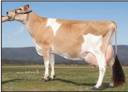
DUTCH HOLLOW SCHOLAR CHARM Great-Grandam of Lot 116