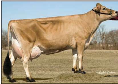
DUTCH HOLLOW JACKSON CHARITY Fourth Dam of Lot 116