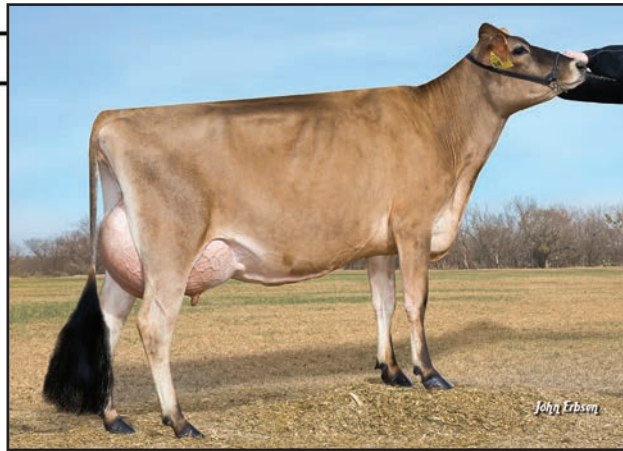
ILLINI BLACKSTONE CANYON, E-90% Grandam of Lot 118