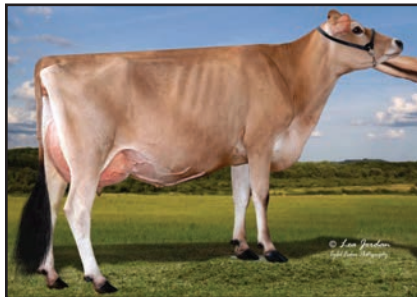
JX PVF PROP JOE ZIP {4}-ET Dam of Lot 106