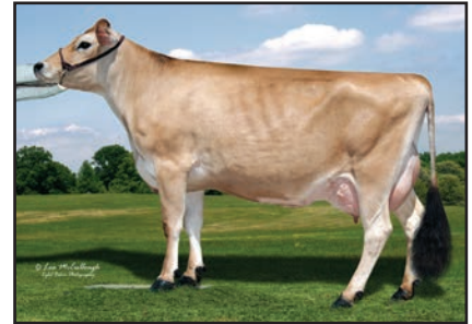
NORSE STAR RENEGADE MARLEY Grandam of Lot 137