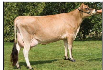
STEINHAUERS TRACE APPLETORT Sister to the Grandam of Lot 113