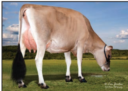
JX PVF PROP JOE ZAP {4}-ET Full Sister to the Dam of Lot 106