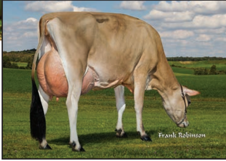
Sold in the 2014 Pot O'Gold Sale Schirm Plus Saturn {6}, VG-84% 2-11 305 3x 24,830 4.9% 1,219 3.6% 895