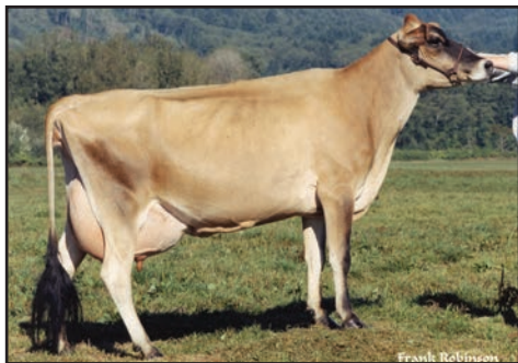
Sold in the 1997 Pot O'Gold Sale Rebob Barber Hurrah, E-90% 1-11 305 19,070 5.4% 1,021 372% 702 Winner, 2000 Pot O' Gold Production Contest