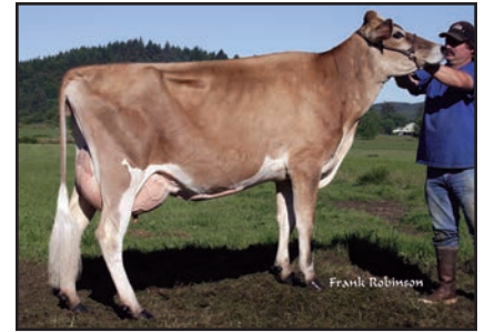
ROCHA HALLMARK WHISTLE Great-Grandam of Lot 117