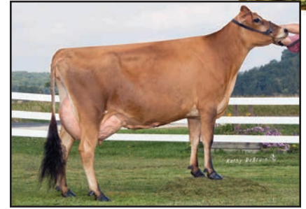
ROCHA IMPULS WHITNEY Grandam of Lot 117

4TH DAM: ROCHA LIMVIG WHITNEY-ET 92% 5-08 305 2 24120 4.5 1097 3.6 860 100DCR 2946C