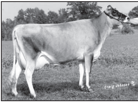
Sold in the 1986 Pot O'Gold Sale Greenwood Chief Glad Tidings, VG-85% 4-6 305 22,590 4.9% 1,097 3.6% 806 Winner, 1989 Pot O'Gold Production Contest