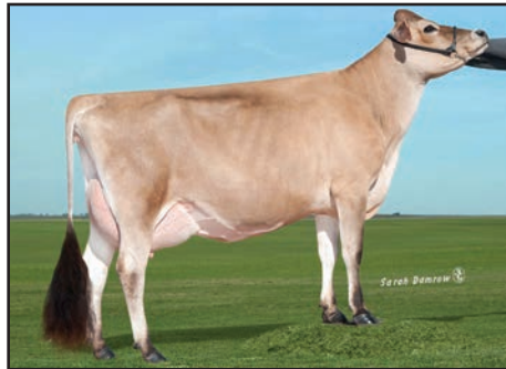
Sold in the 2010 Pot O'Gold Sale Lyon Impuls Eternity, VG-86% 3-2 298 20,130 5.5 1,100 3.9% 779