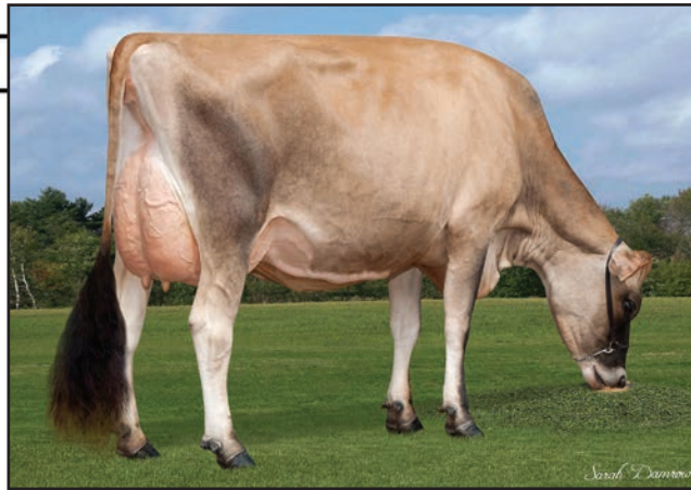
CLARESHOE ALLSTAR ZOOM ZOOM, E-91% Grandam of Lot 106