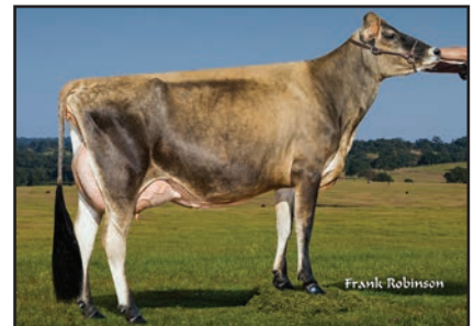
NORSE STAR TOPEKA MIDNIGHT-ET Sister to the Grandam of Lot 137