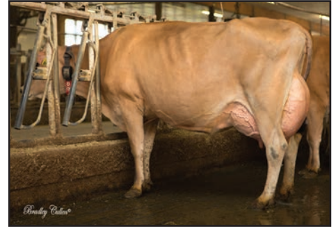
Sold in the 2013 Pot O'Gold Sale JX Shan-Mar Fastrack Cherita {4}, VG-86% 1-11 305 3x 21,390 5.5% 1,173 3.5% 752