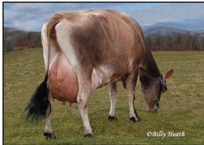
QA/WF HALLMARK DELIRIOUS Great-Grandam of Lot 128