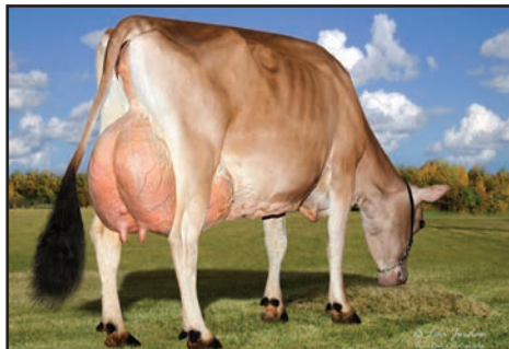
Sold in the 2012 Pot O'Gold Sale Waunakee Plus Jolt 3277 {6}-ET, E-92% 4-5 305 31,380 4.3% 1,362 3.8% 1,200