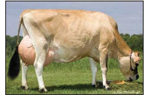
Sold in the 2005 Pot O'Gold Sale Ahlem Jace Charm 15069-ET, VG-88% 2-1 305 3x 33,550 4.6% 1,546 3.1% 1,048 Winner, 2008 Pot O'Gold Production Contest