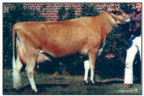
Sold in the 1967 Pot O'Gold Sale Ettas Master Babe, E-94% 11-4 365 17,550 5.3% 922 Winner, 1970 Pot O'Gold Production Contest 1970 National Jersey Jug Futurity Winner