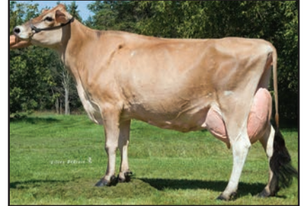
STEINHAUERS H MARK APPLEPIE Great-Grandam of Lot 113