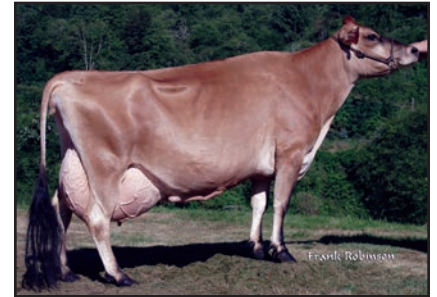
SUNSET CANYON LEMVIG TONAPAH-ET Fifth Dam of Lot 109

4TH DAM: SUNSET CANYON FUTURITY TONAPAH 2-ET 85% 2-09 305 2 17750 5.4 956 4.1 728 97DCR 2521C