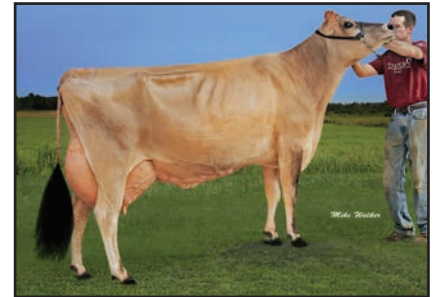
LAWTONS ACTION VICTORIA Grandam of Lot 119

ALL LYNNS VALENTINO MARVEL USA 117422971 GT50K BBR 100 JH1C JH2F 11JE1118 CDCB GPTA 08/08/2017 7430DAUS 260HRDS 24%RIP 99%R 766M -0.01% 36F 55%ILE 99%R -0.02% 25P 390CM$ 386NM$ 377FM$ 285GM$ 5.2PL 1.6LIV -2.0DPR -0.5CCR 0.2HCR 2.96SCS AJCA 08/08/2017 3218DAUS GPTAT 99%R 1.7 GJUI 21.1 GJPI 99%R 107