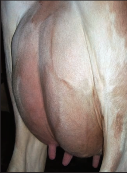
LAST CHANCE ACADEMY MAYFLOWER Grandam of Lot 102

4TH DAM: DA-VEW TERMINATOR MARY {6} 80% 2-02 301 2 14510 5.5 802 4.1 600 92DCR 2078C