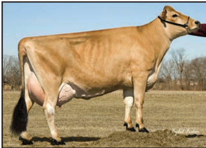
DUTCH HOLLOW LOUIE CHARITY, VG-86% Sister to the Fourth Dam of Lot 116