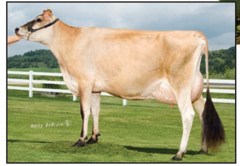
Sold in the 2009 Pot O'Gold Sale Jars of Clay latola 16710 2751, VG-87% 2-3 305 3x 20,230 4.6% 924 3.6% 727