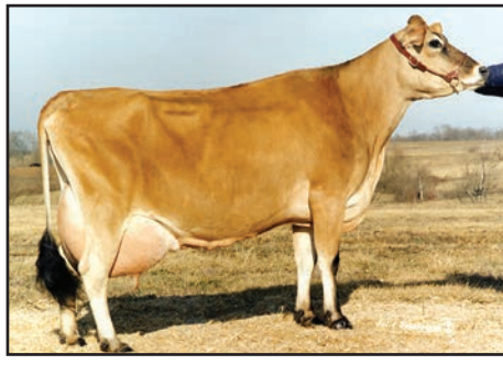
Sold in the 1994 Pot O'Gold Sale LJF2 SB Berretta Haley, E-90% 4-2 365 32,420 5.2% 1,678 4.3% 1,386 Former #1 PTI Cow Winner, 1997 Pot O'Gold Production Contest