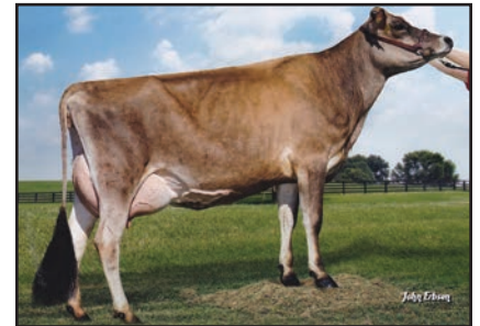
COVINGTON METALICA DIVA-ET Sister to the Dam of Lot 121

ALL LYNNS LEGAL VISIONARY-ET USA 117222740 GT50K BBR 100 JH1C JH2F 29JE3761 CDCB GPTA 08/08/2017 2808DAUS 418HRDS 13%RIP 99%R 1040M -0.05% 39F 78%ILE 99%R 0.04% 46P 504CM$ 475NM$ 409FM$ 376GM$ 6.9PL -0.4LIV -1.8DPR 1.1CCR 4.5HCR 2.87SCS AJCA 08/08/2017 1390DAUS GPTAT 99%R 1.0 GJUI 14.9 GJPI 97%R 148