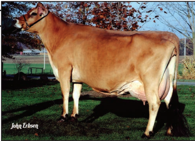
VANTAGE LEMVIG MAMME, E-90% Fourth Dam of Lot 129