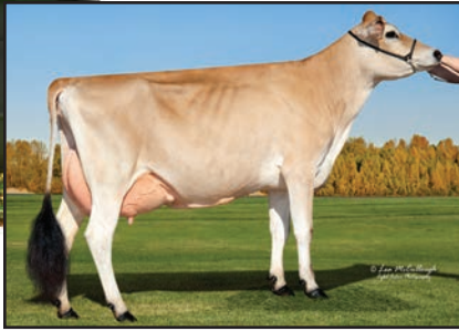
HER-MAN/SDF SANTANA BRIGHT-P-ET Dam of Lot 136