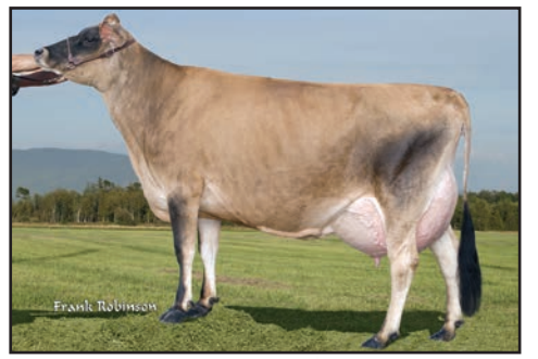
Sold in the 2005 Pot O'Gold Sale Schirm Rocket Vintage-ET, E-90% 4-2 365 40,210 4.8% 1,927 3.6% 1,451