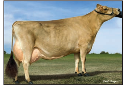
HILL TOP ACE MORGAN Great-Grandam of Lot 137