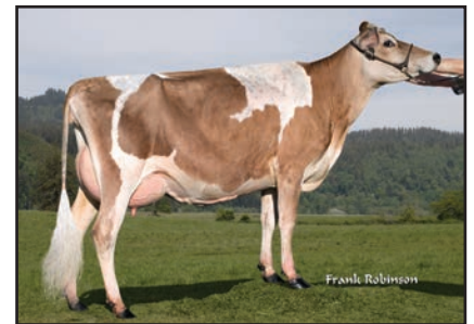
ROCHA FUTURITY WINNIFRED-ET Sister to the Grandam of Lot 117