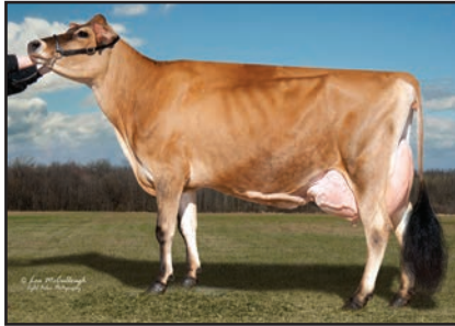
JVB RED HOT TB BEL-ET Grandam of Lot 136