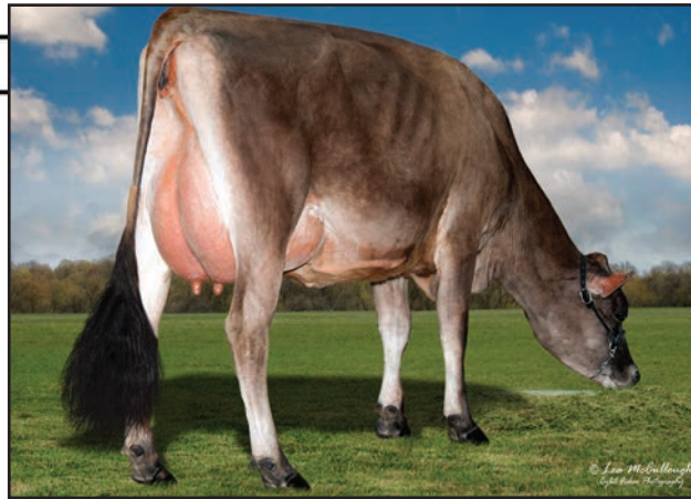
HER-MAN IRWIN ANSLEY, E-90% Dam of Lot 132