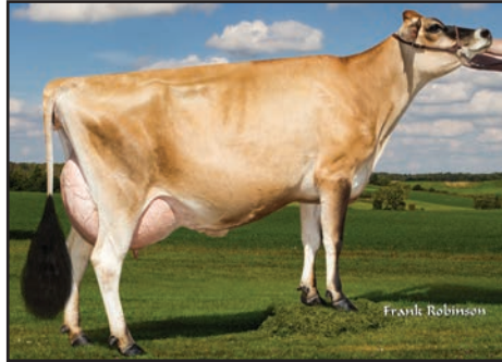
Sold in the 2014 Pot O'Gold Sale JX Buttercrest Clark Goblet {4}, E-90% 1-11 305 3x 20,450 4.5% 919 3.9% 802