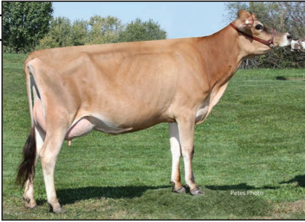
COVINGTON ZUMA DELLA, VG-86% Grandam of Lot 121