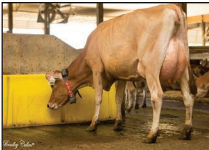
JX SCHIRM HARRIS BELLAMY {5} Dam of Lot 112