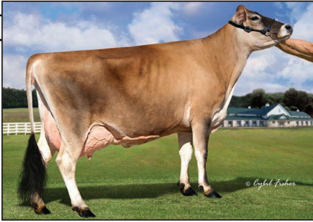
SHOT OF NAT DIMENSION TIRAMISU, VG-87% Dam of Lot 109