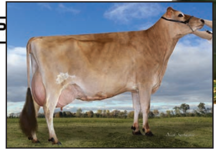
STEINHAUERS RENEGADE CHERRYPIE-ET Grandam of Lot 113

4TH DAM: STEINHAUERS CEASAR APPLETON 91% 3-02 305 3 22030 4.5 998 3.3 725 97DCR 2354C