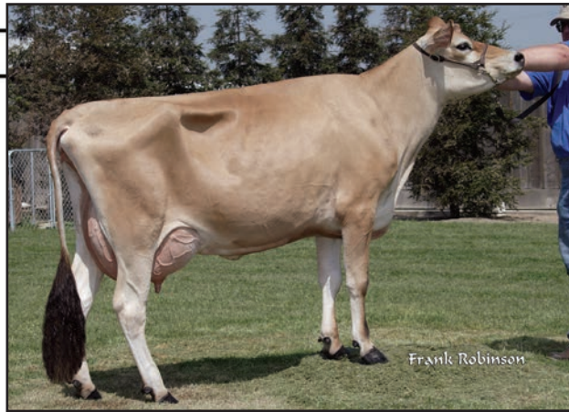
D&E PARAMOUNT VIOLET-ET, E-90% Fourth Dam of Lot 114