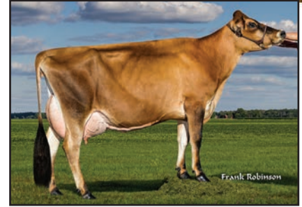
AHLEM JUPITER PRINCESS 40390 Dam of Lot 133

BRED: 08/05/2017 DUE: 05/11/2018 TO JX LEGENDAIRY MONEYBAG {5} USA 119392427 200JE1065 CDCB GPTA 08/08/2017 75%R 1820M -0.11% 63F 89%ILE 75%R 0.00% 65P 550CM$ 534NM$ 498FM$ 402GM$ 4.3PL -1.0LIV -3.2DPR -1.9CCR 0.7HCR 3.02SCS AJCA 08/08/2017 ODAUS GPTAT 75%R 1.0 GJUI 7.9 GJPI 70%R 158 BRED USING SEXED SEMEN