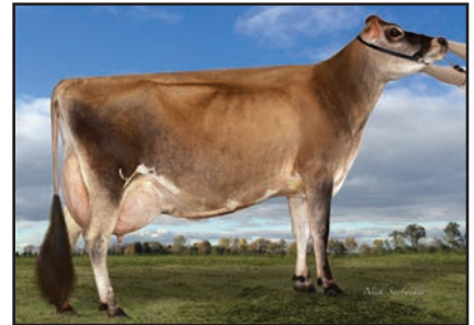
STEINHAUERS VANCE PUDDINGPIE-ET Sister to the Grandam of Lot 113