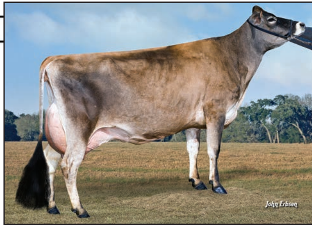
QA/WF VALENTINO DEVINE, E-90% Dam of Lot 128