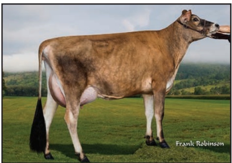
Sold in the 2013 Pot O'Gold Sale Lost Hill Dimension Holly, VG-84% 1-10 291 19,680 6.7% 1,325 3.7% 737 Winner, 2016 Pot O'Gold Production Contest