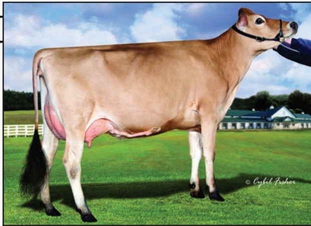
JX SCHIRM HARRIS BELLAMY {5}, VG-87% Dam of Lot 112