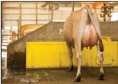
JX SCHIRM HARRIS BELLAMY {5} Dam of Lot 112