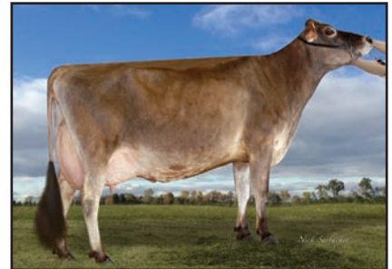
STEINHAUERS VANCE CREAMPIE-ET Sister to the Grandam of Lot 113