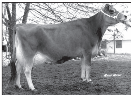
Sold in the 1971 Pot O'Gold Sale Generators Faustine of Ogston, E-93% 4-3 365 24,440 4.3% 1,059 Dam of A-Nine Top Brass Winner, 1974 Pot O'Gold Production Contest