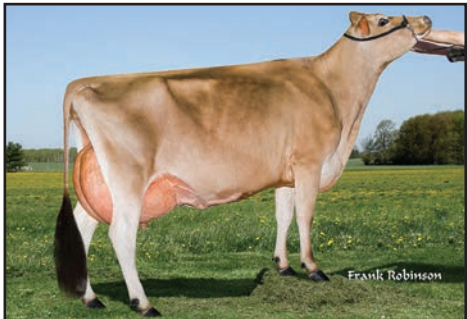
Sold in the 2011 Pot O'Gold Sale Heinz Lotto Linette 7132 {4}, VG-88% 4-10 305 3x 21,770 4.8% 1,039 3.7% 797