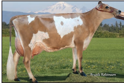
Sold in the 2007 Pot O'Gold Sale Havs latola Topaz, E-91% 3-1 365 43,110 5.0% 2,144 3.5% 1,522 Winner, 2010 Pot O'Gold Production Contest