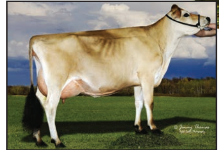
HEARTLAND IRWIN MYRA-ET Dam of Lot 137

NEXT DAM: HILL TOP ACE MORGAN 90% 2-10 365 2 32904 4.5 1480 3.8 1244 DHIR 4097C SIRE: SENN-SATIONAL PARAMOUNT ACE GJPI 13 13%ILE 4TH DAM: HILL TOP IMPULS MONIQUE 88% 2-10 305 2 11730 5.0 582 3.6 421 97DCR 1455C