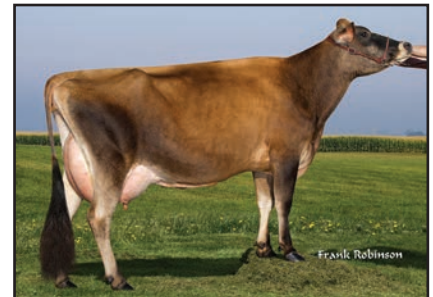
AHLEM IATOLA PRINCESS 33280 Grandam of Lot 133

KASH IN SANTANA-P-ET USA 067253405 GT50K BBR 100 JH1F JH2F 7JE1273 CDCB GPTA 08/08/2017 171DAUS 63HRDS 76%RIP 95%R 705M -0.01% 31F 31%ILE 95%R 0.02% 29P 278CM$ 260NM$ 220FM$ 181GM$ 1.8PL -0.6LIV -2.4DPR -1.9CCR 2.8HCR 2.86SCS AJCA 08/08/2017 98DAUS GPTAT 92%R 1.3 GJUI 14.3 GJPI 87%R 85