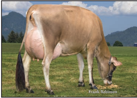
Sold in the 2008 Pot O'Gold Sale Boyd-Lee Matinee Holly-ET, VG-86% 1-11 305 19,120 4.7% 904 3.4% 655