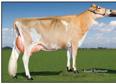
Sold in the 2012 Pot O'Gold Sale JX Grazeland Plus Krystaleen{4}, E-90% 3-0 305 23,550 4.9% 1,161 3.8% 889