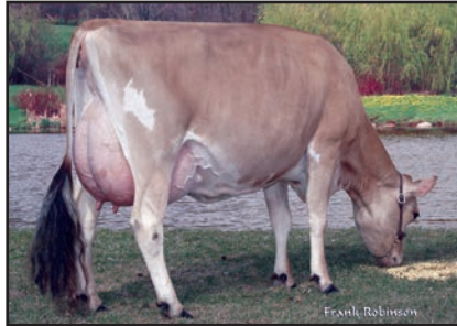
JVB RED HOT MOR BELINDA-ET Great-Grandam of Lot 136