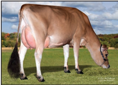
HER-MAN/SDF SUCCESSION BELINDA Sister to the Dam of Lot 136