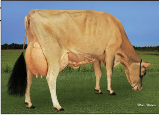
LAWTONS ACTION VICTORIA, E-93% Grandam of Lot 119