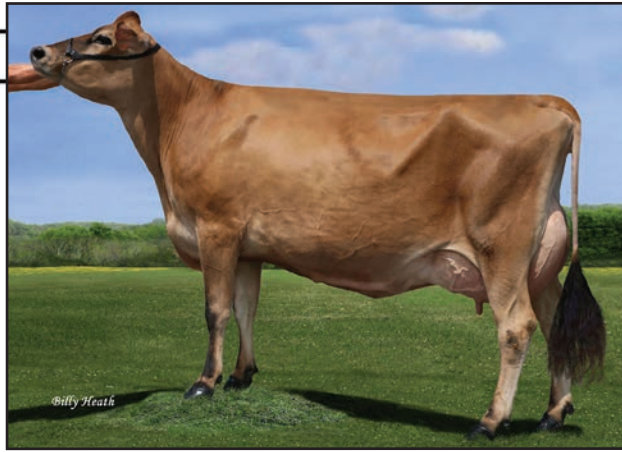
DUTCH HOLLOW VALENTINO CHEER, E-90% Grandam of Lot 116