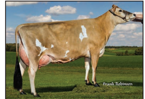
Sold in the 2013 Pot O'Gold Sale Hilmar Vermeer 39176 {6}, E-92% 3-10 297 3x 27,050 4.3% 1,157 3.7% 1,010