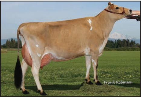
Sold in the 2009 Pot O'Gold Sale Kilgus Finalist Gem, VG-87% 1-11 365 36,400 5.0% 1,816 3.4% 1,226 Winner, 2011 Pot O'Gold Production Contest