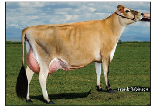
Sold in the 2012 Pot O'Gold sale Peelers Louie Presca, VG-87% 2-11 305 27,900 4.6% 1,274 3.4% 961 Winner, 2015 Pot O'Gold Production Contest