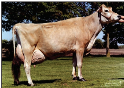
SUNNY DAY BOLD BELINDA-ET Fourth Dam of Lot 136