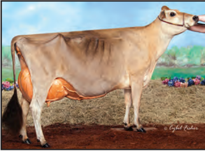
MARYNOLE EXCITE ROSEY Grandam of Lot 49