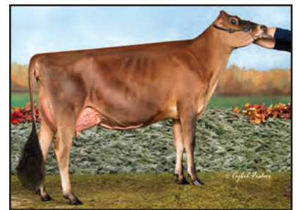
CROSSBROOK IMPRESSION DASHER-ET Sister to the Dam of Lot 58