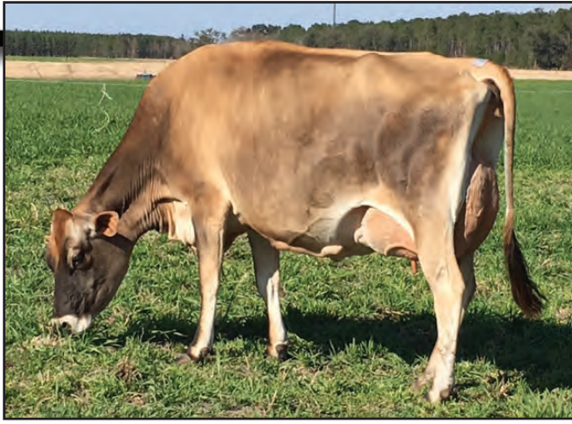
HUMMING BT FINALIST DOTTIE, E-91% Dam of Lot 64