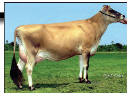
SHF SAMBO FUCHSIA Great-Grandam of Lot 20

STONEY POINT RESSURECTION FANCY-ET 93% USA 114839655 GT TATTOO M138 / M138 DHIA HERD # 51-04-4502 CONTROL # 138 3-02 283 2 12490 4.3 541 3.6 445 95DCR 1482C 4-01 305 2 16890 4.0 672 3.8 637 98DCR 1961C 5-03 305 2 20630 4.2 860 3.5 715 98DCR 2366C 6-03 305 2 21360 4.4 932 3.8 808 97DCR 2614C 7-04 303 2 19280 3.5 671 3.2 619 97DCR 1929C 305 2X ME AVG 6L 17553M 725F 627P 2030C PPA -247M -82F -11P / YD -733M -60F -28P CDCB PTA 04/01/2018 5RECS 60%R 16%ILE -442M -27F -17P -17CM$ -13NM$ -3FM$ -26GM$ 4.3PL 0.3DPR 0.8CCR 0.6HCR 2.93SCS AJCA 04/01/2018 PTAT 52%R 1.2 JUI 12.1 JPI 52%R -14 SIRE: RAPID BAY RESSURECTION-ET GJPI -37 7%ILE