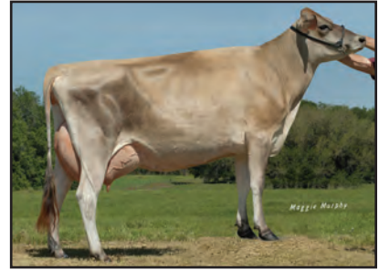
LYLESTANLEY CHRONICL MYFURY 1508-ET Dam of Lot 16

4TH DAM: DALHART LIBERTY 15681 {6} 86% 4-07 305 3 24840 5.0 1242 3.8 936 95DCR 3238C