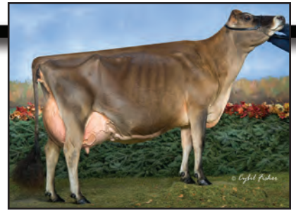
STEPHAN SPARKLER VERA-ET Grandam of Lot 80

5TH DAM: COTTONWOOD SAINT VANITY 90% 6TH DAM: COTTONWOOD NOBLE VIVO 92%