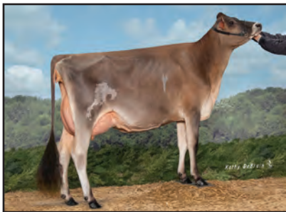
LYLESTANLEY TEQ HELLO DOLLY 3620-ET Sister of Lot 27