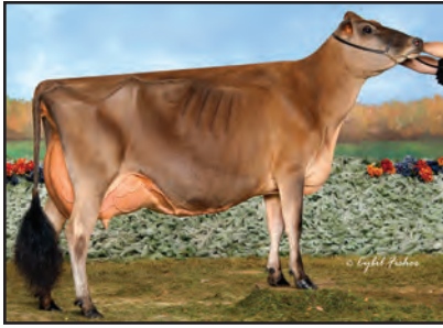
MISS TRIPLE T SERENITY-ET Sister to the Dam of Lot 45