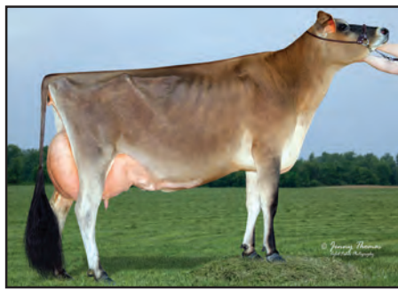
Sold in the 2009 sale Marhaven Justice Sugar-ET, E-91% Intermediate Champ, 2009 Mid-Atlantic Regional Jr.