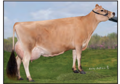
HEI-BRI JACINTO NANA Great-Grandam of Lot 8

4TH DAM: HEI-BRI LEGIONAIRE NAN 91% 9-05 305 2 20630 5.5 1134 3.9 795 98DCR 2751C