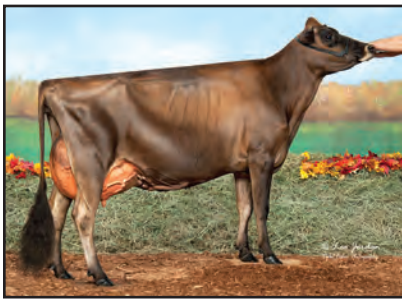
STONEY POINT IMPRESSION BELINDA, E-92%

From the Same Family as Lot 37 HM Senior Champion, 2018 New York Spring Show