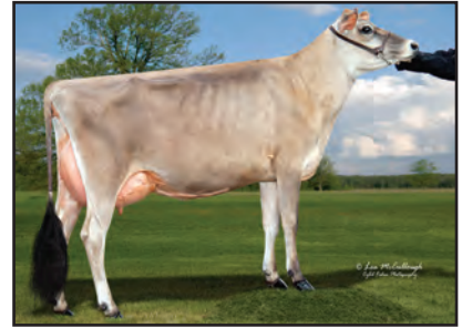
TOWNSIDE FEVER NATALIE, E-91% Dam of Lot 60

4TH DAM: WAYMAR PATRICK NADINE SUP-EX 97-6E (CAN) 10-11 365 2 28476 4.8 1375 3.5 1009 DHIR 3496C RES SUPREME CHAMPION, 1998 & 2000 WORLD DAIRY EXPO SENIOR & GRAND CHAMPION, 1997, 1998 & 2000 CENTRAL NATIONAL RESERVE GRAND CHAMPION, 2004 WESTERN NATIONAL RES SENIOR & GRAND CHAMPION, 2000 ROYAL WINTER FAIR ALL CANADIAN MATURE COW, 1997, 1998, & 2000 LIFETIME PRODUCTION AWARD WINNER, 2004 WESTERN NATIONAL 1ST AGED COW, 2004 WESTERN NATIONAL JERSEY SHOW 1ST AGED COW, 1997, 1998 & 2000 CENTRAL NATIONAL ALL CANADIAN FIVE-YEAR-OLD, 1996