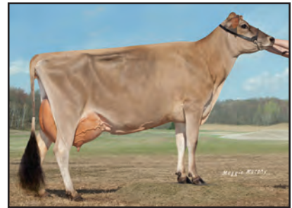
HILMAR KILOWATT 32102 Grandam of Lot 16