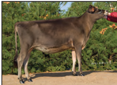
SELECT MINISTER ELODIE-ET Sister to the Grandam of Lot 71