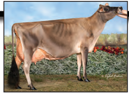
ARETHUSA VERONICAS COMET-ET Grandam of Lot 44

4TH DAM: GENESIS RENAISSANCE VIVIANNE VG 87 (CAN) 5-00 305 2 12110 4.2 514 3.8 461 CAN 1464C 7 STAR BROOD COW IN CANADA, SEPTEMBER 2012