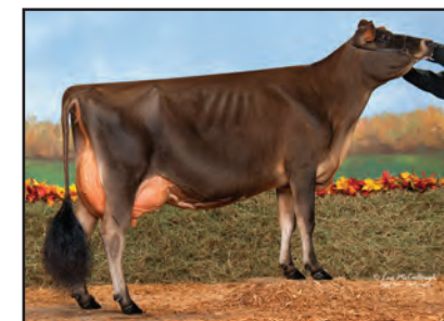
ELLIOTTS FAXON COMICAL-ET Sister to the Dam of Lot 12