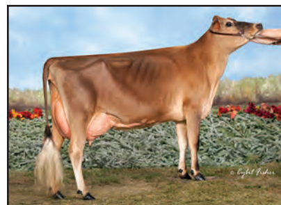
GARHAVEN I DREAM OF THE SPLASH-ET Sister to the Grandam of Lot 22