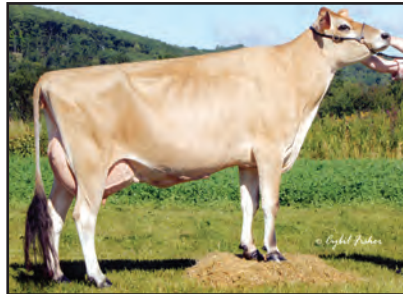
SHF JUDES FORTUNE Sister to the Grandam of Lot 33