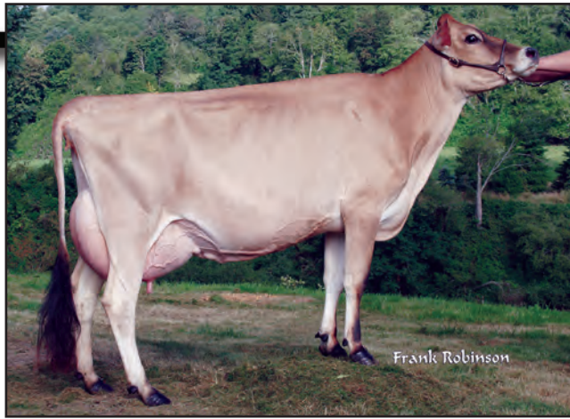
SUNSET CANYON CENTURION MAID, E-91% Fourth Dam of Lot 7