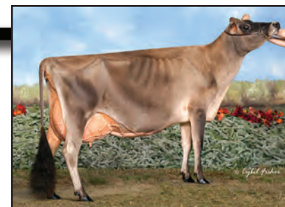
ARETHUSA VERONICAS COMET-ET Grandam of Lot 12

4TH DAM: GENESIS RENAISSANCE VIVIANNE VG 87 (CAN) 5-00 305 2 12110 4.2 514 3.8 461 CAN 1464C 7 STAR BROOD COW IN CANADA, SEPTEMBER 2012