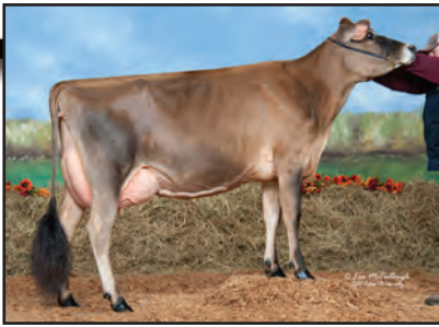
CHILLI MINISTER CINNAMON-ET Dam of Lot 63