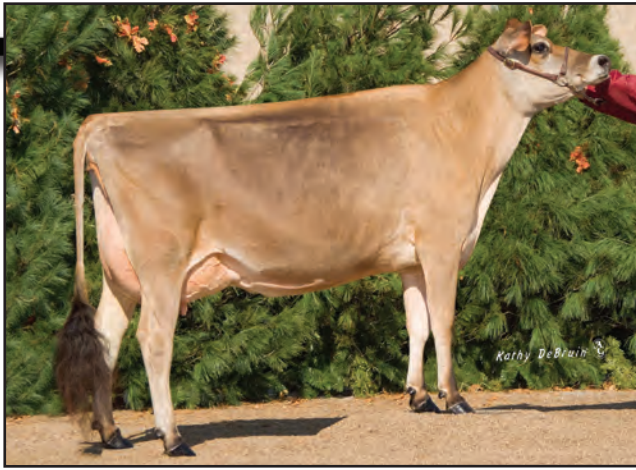
DKG VINDICATION APRICOT, VG-88% Great-Grandam of Lot 26