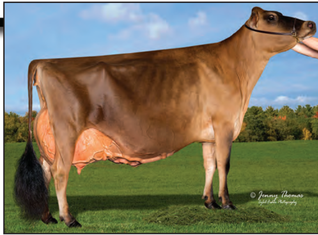
PAGE-CREST EXCITATION KARLIE, E-94% Full Sister to the Dam of Lot 13