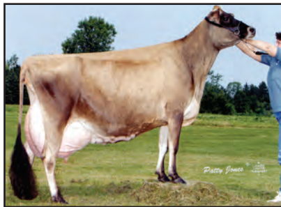
SHF RENAISSANCE FANTASTIC Sister to the Grandam of Lot 33