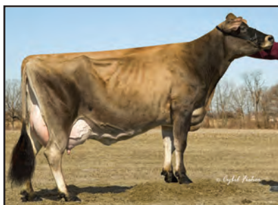
JX OOMSDALE GRATITUDE COUNTRY CASEY {2}-ET Great-Grandam of Lot 59