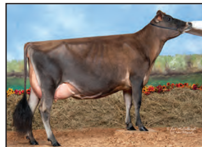
TOWER VUE KOOKIES KRUNCH-ET Sister to the Dam of Lot 34