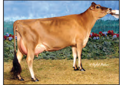
JULIANNAS DELUXE JUSTINE-ET Fourth Dam of Lot 24