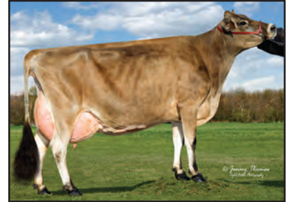
JX JER BEL HEADLINE AMEN {4} Sister to the Dam of Lot 28