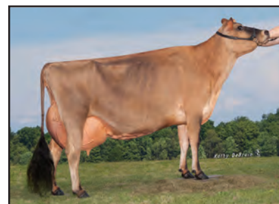
STONEY POINT VINDICATION FIFI Sister to the Grandam of Lot 20