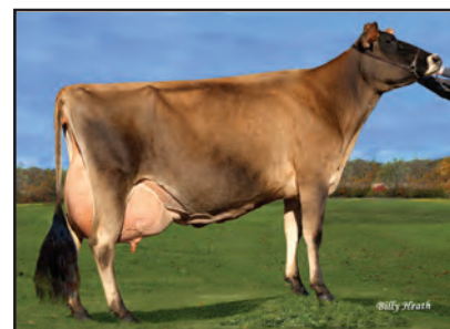
STONEY POINT VINDICATION FEEBEE-ET Sister to the Grandam of Lot 20