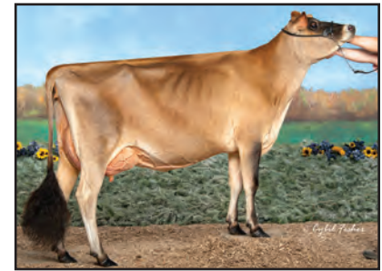
CROSSBROOK HG DAISY-ET Sister to the Dam of Lot 58