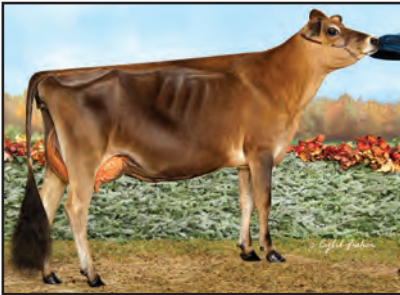
SOUTH MOUNTAIN VOLTAGE RADIANT-ET Sister to the Dam of Lot 49