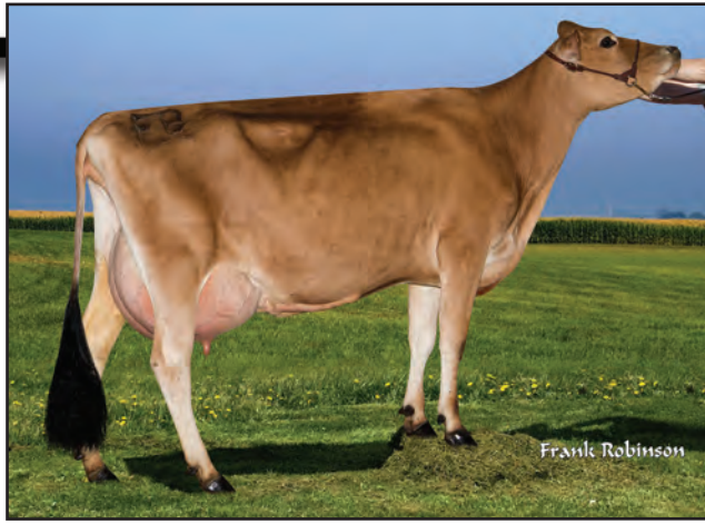
JX FARIA BROTHERS HARRIS JUVENTUS {5}-ET, VG-82% Grandam of Lot 3