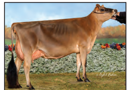
ELLIOTTS VOLTAGE SAHARA-ET Sister to the Dam of Lot 62