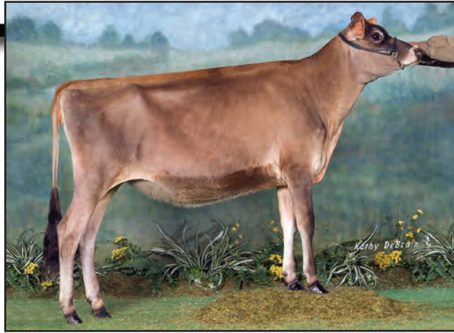
KEK DUAISEIR FAITH Sister to the Dam of Lot 17