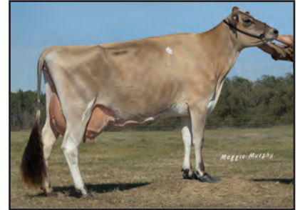
JX OOMSDALE LOUIE GARYN GINA {4}-ET Grandam of Lot 18

JX OOMSDALE GRATITUDE COUNTRY CASEY {2}-ET 90% 3-08 305 3 25680 4.4 1124 3.5 905 100DCR 3052C