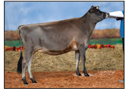
DKG JADE WILD PLUM Sister to the Grandam of Lot 26

DKG MOTION CHERRY 86% RESERVE ALL AMERICAN JR YEARLING, 2016 RESERVE JR ALL AMERICAN JR YEARLING, 2016 2ND JR YEARLING, 2016 KY STATE FAIR 2ND JR YEARLING, 2016 OH SPRING DAIRY EXPO JR SHOW JUNIOR ALL AMERICAN JUNIOR CALF, 2015 3RD JUNIOR CALF, 2015 ALL AMERICAN JERSEY SHOW 3RD JUNIOR CALF, 2015 OHIO STATE FAIR 1ST JUNIOR CALF, 2015 OH STATE FAIR JUNIOR SHOW