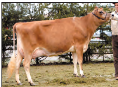
AVONLEA VALIANT KITTY 15N Sixth Dam of Lot 53

BORN 03/05/2017 TATTOO TJ89 / TJ89 P0 FEMALE EFI 4.8%