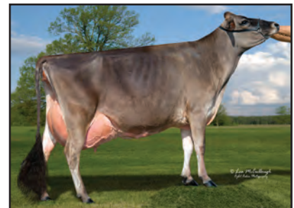
ELLIOTTS VALIANT RAQUEL-ET Sister to the Grandam of Lot 46