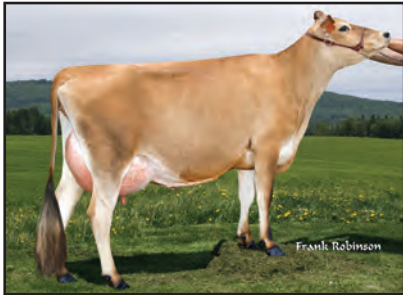
THREE VALLEYS F RENEGADE MAID-ET Sister to the Grandam of Lot 7