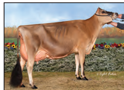
STONEY POINT GILLER FARAH-ET Sister to the Grandam of Lot 20