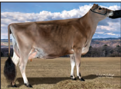
WOODMOHR INDIANA ROSEBUD Great-Grandam of Lot 49

BORN 04/02/2017 TATTOO HM41 / HM41 P0 FEMALE EFI 6.5% AMERICAN ID 375 / 375