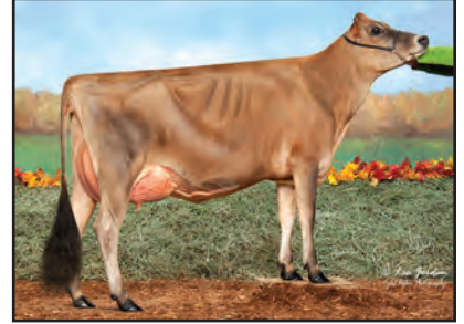
J-KAY APPLEJACK FREYNI-ET Sister to the Dam of Lot 32