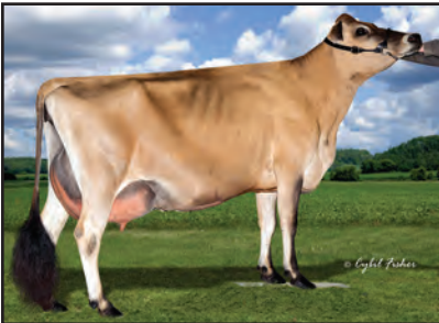
MORNINGSIDE BS CHARLOTTE Grandam of Lot 1