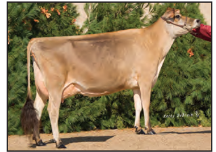
DKG VINDICATION APRICOT Sister to the Dam of Lot 71