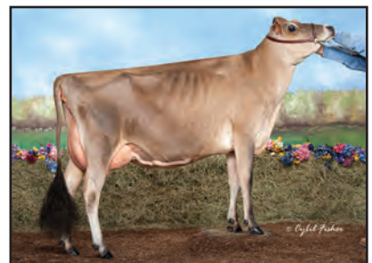
SOUTH MOUNTAIN SOCRATES JERICA-ET Sister to the Grandam of Lot 24