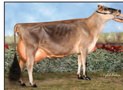
HILLACRES MORRAE MARYLAND Grandam of Lot 14

4TH DAM: HILLACRES MONAS MONIQUA 91% 4-11 305 2 18550 4.7 865 3.8 705 94DCR 2363C