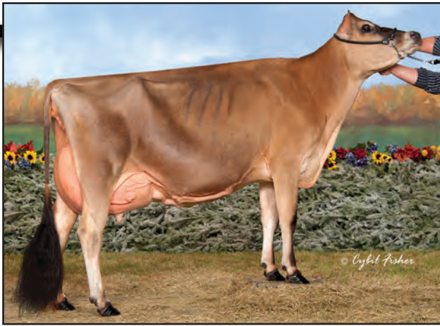
STONEY POINT GILLER FARRAH-ET, E-93% From the Same Family as Lot 2