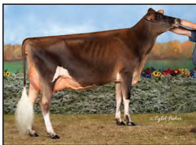
SOUTH MOUNTAIN TEQUILA JEM Great-Grandam of Lot 35