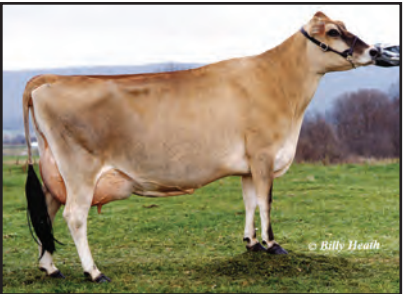
KINLAND TROY MARY Fourth Dam of Lot 9