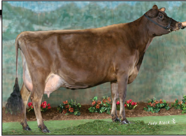
BRI-LIN RENS SOPHIE, E-90% Fifth Dam of Lot 41