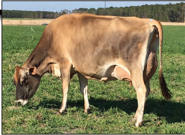
HUMMING BT FINALIST DOTTIE, E-91% Dam of Lot 27