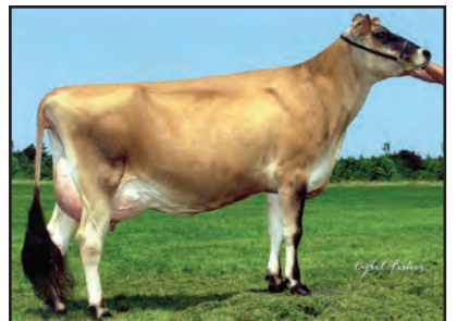
SHF SAMBO FUSCHIA, E-92% Fifth Dam of Lot 2

Sixth dam: SHF Grove Fantasia, E-92% Seventh dam: Sooner Frosty, VG-88% Eighth dam: Imperial Frost of SSF, E-90%