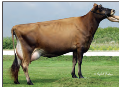
BRIDON FIRST ERUPT-ET Grandam of Lot 23