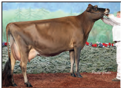
POTWELL WHISTLERS EMILY Great-Grandam of Lot 71

BORN 06/01/2016 PO FEMALE EFI 3.7% AMERICAN ID 66 / 66