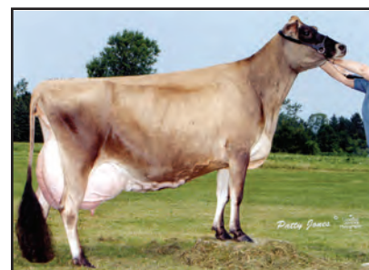
SHF RENAISSANCE FANTASTIC, E-95% Same Family As Lot 20