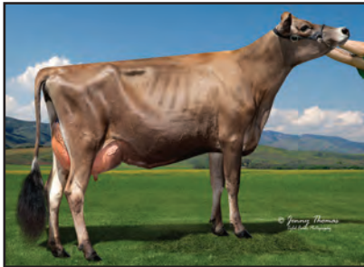
MISS TRIPLE T MPH SATIN-ET Sister to the Dam of Lot 45