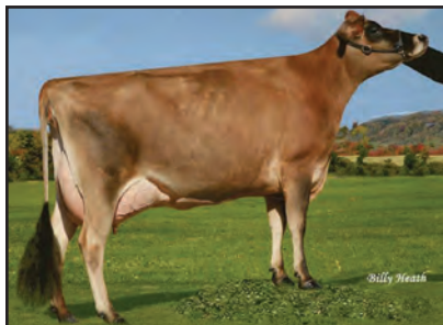
UNDERGROUND DUASEOIR C MAMIE-ET Sister to the Grandam of Lot 11