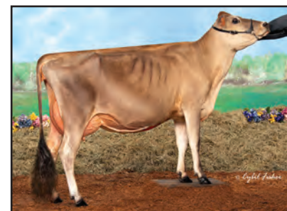
BUDJON-VAIL TEQUILA MACKENZIE Sister to the Dam of Lot 14