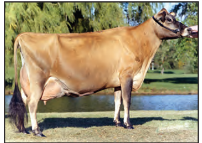
WAYMAR PATRICK NADINE Fourth Dam of Lot 60