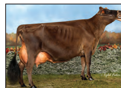
ARETHUSA PRIMETIME DEJA VU-ET Sister to the Grandam of Lot 12