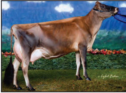
INFINITY SHADE OF WF Sister to the Grandam of Lot 61