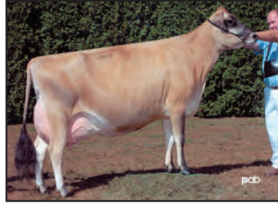
SHF RENAISSANCE FALINE-ET Grandam of Lot 33