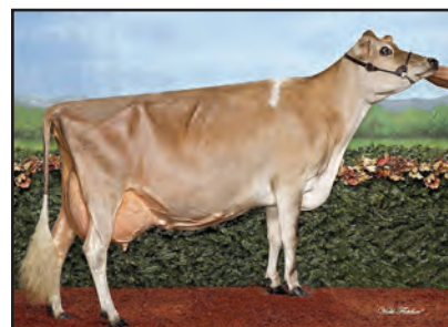
GARHAVEN FUROR DOMINATRIX-ET Sister to the Grandam of Lot 22