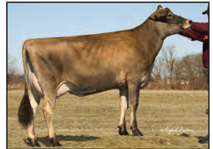
JX OOMSDALE CASEY IATOLA GARYN {3} Great-Grandam of Lot 18