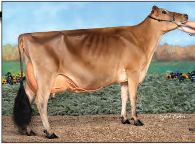
SHO-ME GILLER TRINA, E-95% Dam of Lot A