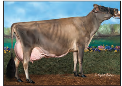
HURONIA CENTURION VERONICA 20J Great-Grandam of Lot 44