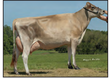
LYLESTANLEY CHRONICL MYFURY 1508-ET Dam of Lot 52

4TH DAM: DALHART LIBERTY 15681 {6} 86% 4-07 305 3 24840 5.0 1242 3.8 936 95DCR 3238C