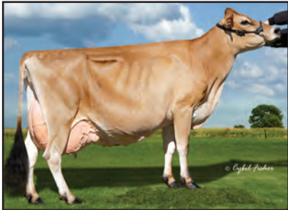
THREE VALLEYS TBONE F MAGGIE-ET Grandam of Lot 7