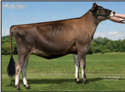
ELECTRAS EVOLUTION-ET Sister of Lot 21

BORN 09/08/2017 PO FEMALE EFI 3.0% AMERICAN ID 63 / 63