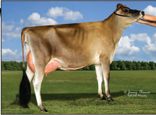
GD ON-TIME SOPHIA, VG-84% Dam of Lot 68