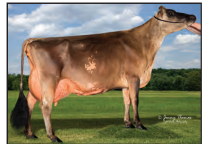
DF SULTAN TINKA Grandam of Lot A

NEXT DAM: SANCREST MEDALLION TRICK 81% SIRE: SANCREST PRIZE MEDALLION JPI -101 1%ILE