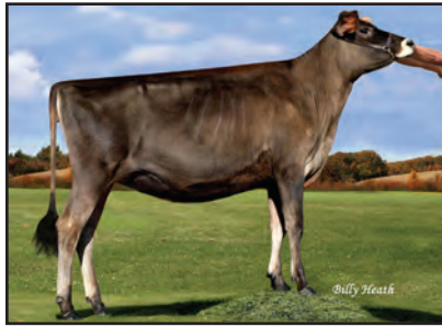
MINISTER GAIL-ET Sister to Lot 79