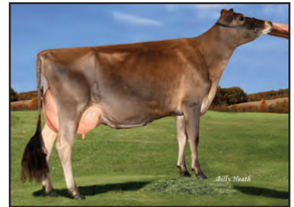
TJ CLASSIC VERBATIM VICTORIA-ET Sister to the Dam of Lot 80