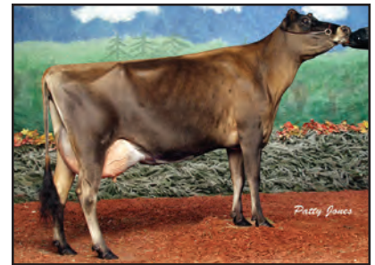
ROSALEA RENS SYBIL Fourth Dam of Lot 36