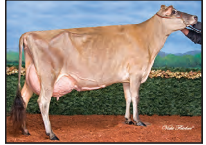
TIARO DELUXE RONDA-ET Fourth Dam of Lot 42

SUNSET CANYON MERCHANT-ET USA 114256027 GT50K BBR 100 JH1C JH2F 11JE884 CDCB GPTA 04/01/2018 2051DAUS 247HRDS 3%RIP 99R 70M 0.13% 29F 14%ILE 99R 0.03% 9P 68CM$ 57NM$ 33FM$ -66GM$ -0.1PL -5.0DPR -5.3CCR -2.6HCR 3.03SCS AJCA 04/01/2018 1401DAUS GPTAT 99R 1.4 GJUI 15.2 GJPI 99R 16