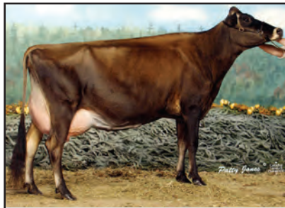
JUST A FEW RENAISSANCE ELISA Great-Grandam of Lot 23