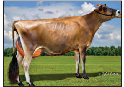
PLEASANT NOOK GUNS FOXY LADY Dam of Lot 38

4TH DAM: PLEASANT NOOK J IMP FLOWER EX 1 (CAN) 4-08 305 2 15653 5.0 789 4.0 628 CAN 2136C 1ST MATURE COW, 1998 GOLDEN HORSESHOE SHOW