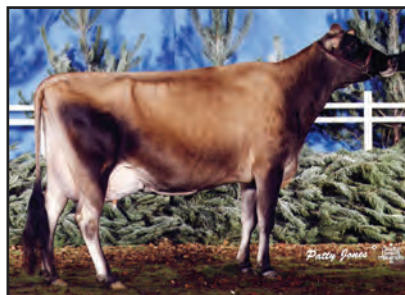
ENNISKILLEN SURVILLE MAMIE Eighth Dam of Lot 43

BORN 06/02/2017 PO FEMALE EFI 7.7% AMERICAN ID 282 / 282