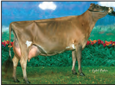
WINDRIFT BREEZE PLUM SARAH Grandam of Lot 45