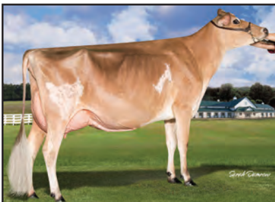
CHILLI NITRO CABO-ET Sister to the Dam of Lot 63