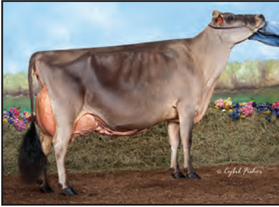
EXTREME ELECTRA Dam of Lot 21