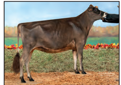
DKG MOTION CHERRY Sister to the Grandam of Lot 26