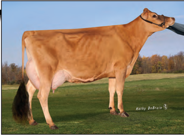
HEI-BRI IATOLA NEVAEH, VG-88% Grandam of Lot 8