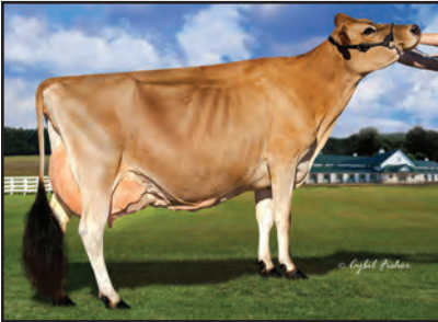
GABYS JACINTO ALYSSA Great-Grandam of Lot 75