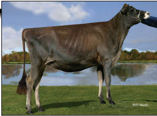
LOST-ELM TEQUILA CHEDDAR Dam of Lot 1