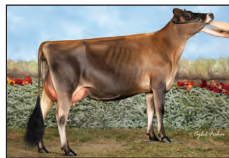
Sold in the 2011 sale Hixson Indiana Ilene, E-91% Reserve Junior All American Jr. 2-yr.-old, 2012