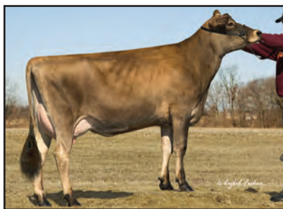
JX OOMSDALE CASEY IATOLA GARYN {3} Grandam of Lot 59