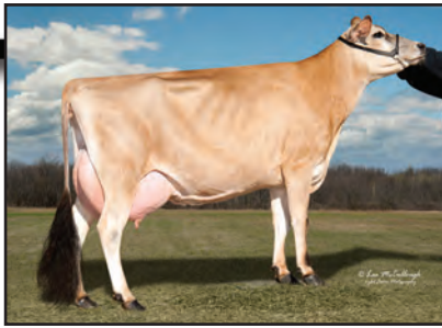
BILLINGS ACTION FAIRLEE-ET Dam of Lot 33