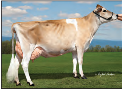
JEMI JAMMIN MARGARITA Grandam of Lot 9

4TH DAM: KINLAND TROY MARY 93% 6-01 305 2 19180 5.9 1138 4.3 822 94DCR 2679C