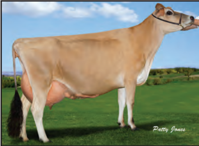
GABYS ARTIST AMBROSIA Fourth Dam of Lot 75