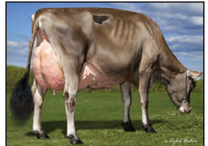
HARMONY CORNERS FOBIA Sister to the Grandam of Lot 32