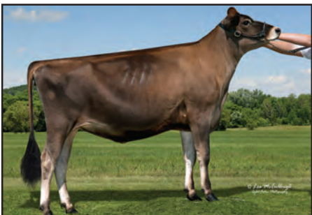
Sold in the 2014 sale Electras Evolution-ET, VG-87% Junior All American Winter Yearling, 2015