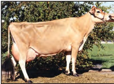
AHLEM BSB PRINCESS 6112 {6}, E-93% Fifth Dam of Lot 15