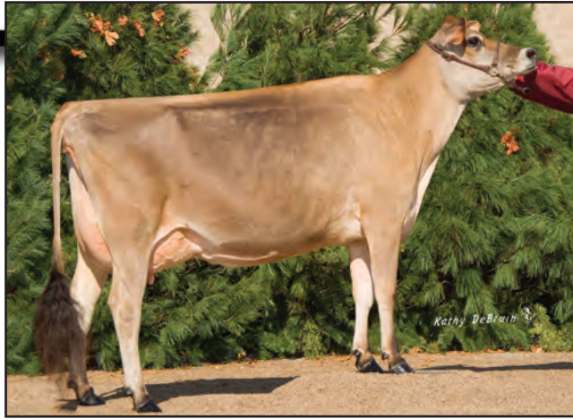
DKG VINDICATION APRICOT, VG-88% Fourth Dam of Lot 47