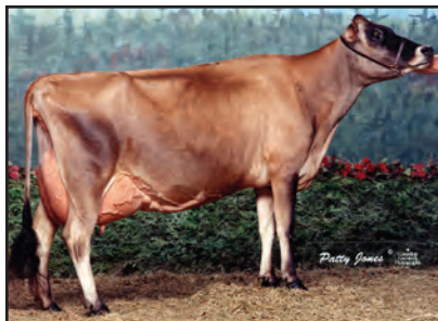
AVONLEA L MERIT KAPER Fourth Dam of Lot 53