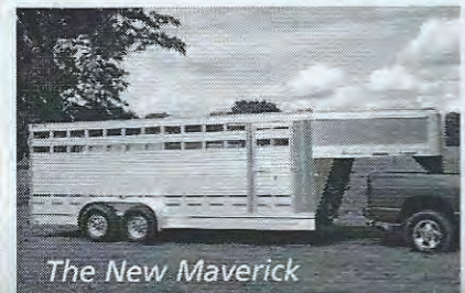
The New Maverick

M.H. EBY, Inc. | 4435 State Route 29 | P.O. Box 137 | West Jefferson, OH 43162 | 800-752-0507 | www.mheby.com