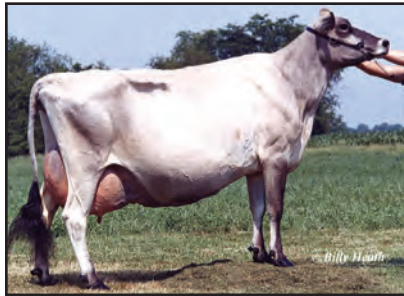
WESTER IMP NELL ISSY {5}-P Grandam of Lot 77