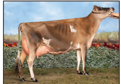
SOUTH MOUNTAIN R MASTER JAMAICA Sister to the Grandam of Lot 24