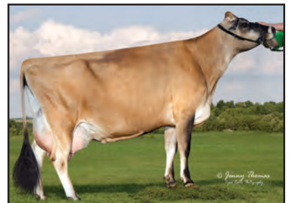
HARMONY CORNERS FREYNI-ET Great-Grandam of Lot 32