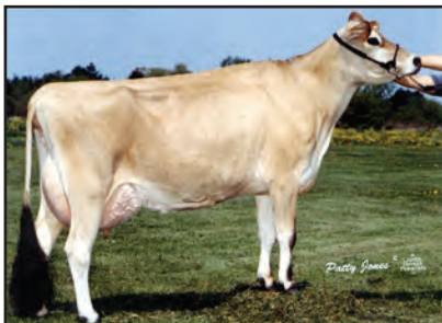
SHF DUNCAN JUDE FLAIR Sister to the Grandam of Lot 33