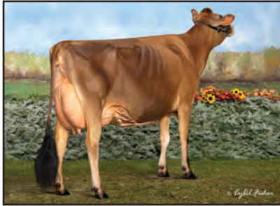
ELECTRAS ETERNAL STAR-ET Sister of Lot 21