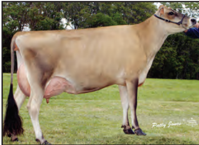
WALKABOUT SAMBO SHADOW Great-Grandam of Lot 61