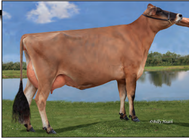
SOUTH HAVEN GOV ROSE, E-91% Grandam of Lot 25