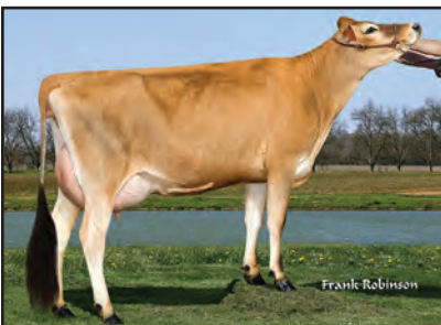
GABYS CHAMP AMANDA-ET Sister to the Grandam of Lot 75

BORN 01/27/2016 BBR 100 DHIA HERD # 31-38-4607 CONTROL # 182 FEMALE EFI 7.3% AMERICAN ID 182 / 182 JH1F JH2F