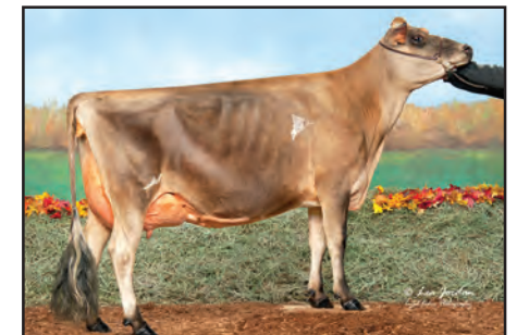
Sold in the 2014 sale Arethusa Excitation Jojo-ET, E-92% 2nd Sr. 3-yr.-old, 2017 Western National