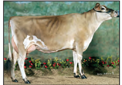
SHF FIRST PRIZE RITA Fifth Dam of Lot 42

HEARTLAND NATHAN TEXAS-ET 95% USA 067041437 GT50K BBR 100 JH1F JH2F DHIA HERD # 48-89-0168 CONTROL # 1437 2-10 305 3 21850 4.6 1008 3.9 843 93DCR 2785C 3-11 305 3 26340 4.3 1130 3.8 991 92DCR 3185C 5-01 305 3 25940 4.6 1185 3.7 963 94DCR 3232C 7-00 183 3 17610 4.8 844 3.5 610 79DCR 2108C 305 2X ME AVG 5L 21944M 1006F 828P 2737C PPA 1728M 27F 71P / YD 1259M 26F 57P CDCB GPTA 05/01/2018 5RECS 92R 51%ILE 456M 11F 23P 164CM$ 150NM$ 118FM$ 82GM$ 1.3PL -2.5DPR -1.5CCR 0.5HCR 3.05SCS AJCA 05/01/2018 GPTAT 89R 1.6 GJUI 20.1 GJPI 88R 54