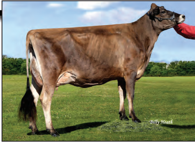
ZIMMANDALE ON TIME MILKSHAKE, E-90% Sister to Lot 9