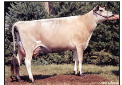
GD LORD SUSAN Fifth Dam of Lot 68

4TH DAM: GORDONS INDY SUE 5TH DAM: GD LORD SUSAN 87%