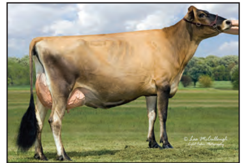
Sold in the 2008 sale HLF Excitation Evita, E-91% 2-9 305 3x 20,160 5.7% 1,141 3.6% 730