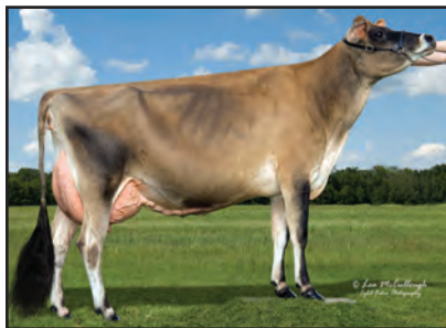
SELECT JADE EMY-ET Sister to the Grandam of Lot 71