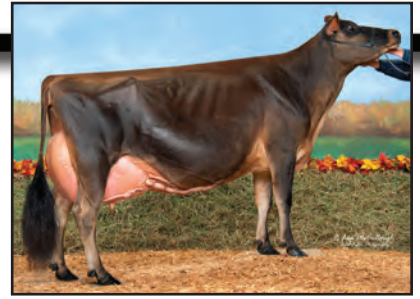
HARMONY CORNERS FOZZY-ET Grandam of Lot 32

4TH DAM: FAMILY HILL KJ FAVOR 94% 4-03 288 2 18390 5.8 1069 3.8 704 99DCR 2436C