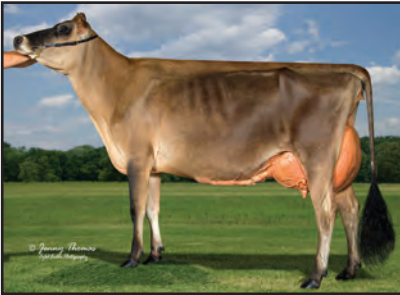
ELECTRAS ENCHANTING-ET Sister of Lot 21