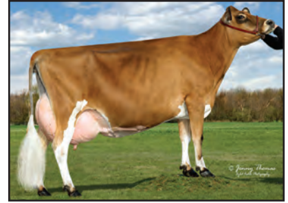
JX JER BEL DALE ABBY {3} Grandam of Lot 28

4TH DAM: JER BEL PARADE ASPEN 91% 4-01 305 2 21600 4.2 900 3.5 752 96DCR 2482C