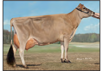
HILMAR KILOWATT 32102 Grandam of Lot 52