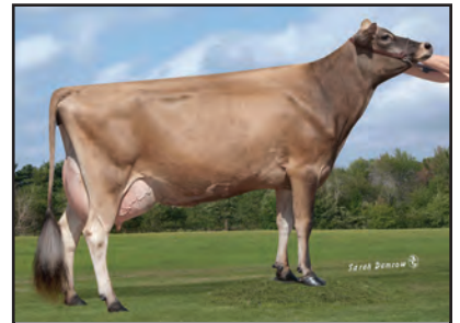
HARMONY CORNERS FELICIA Sister to the Grandam of Lot 32