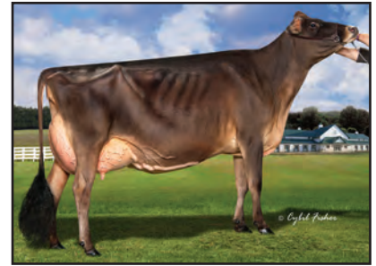
TJ CLASSIC MINISTER VENUS-ET Sister to the Dam of Lot 80