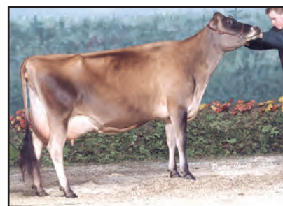
AVONLEA JUNO KRACKER-ET Fourth Dam of Lot 34