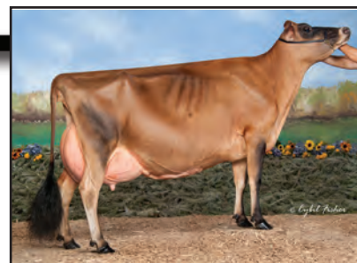
AVONLEA CONNECTED TO KANADA-ET Grandam of Lot 34

NEXT DAM: AVONLEA RENAISSANCE KOOKIE-ET SUP EX 92-5E (CAN) 5-01 305 2 18967 5.4 1017 3.8 714 CAN 2471C 7 STAR BROOD COW IN CANADA, FEBRUARY 2014 NOMINATED ALL-CANADIAN MATURE COW, 2006 RESERVE ALL CANADIAN MATURE COW, 2004 RESERVE ALL CANADIAN FIVE-YEAR-OLD, 2003 WINNER, 2001 ROYAL JERSEY FUTURITY GRAND CHAMPION, 2001 QUINTE CHAMPIONSHIP ALL CANADIAN JUNIOR TWO-YEAR-OLD, 2000 INTERMEDIATE CHAMPION, 2001 ROYAL AG WINTER FAIR HONORABLE MENTION GRAND CHAMPION, 2001 ROYAL AG WINTER FAIR SIRE: HOLLYLANE RENAISSANCE JPI -118 0%ILE