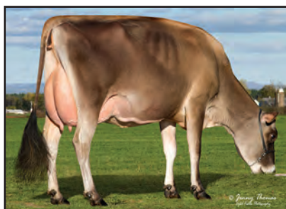
UNDERGROUND MADDIE MAMIE-ET Sister to the Grandam of Lot 11