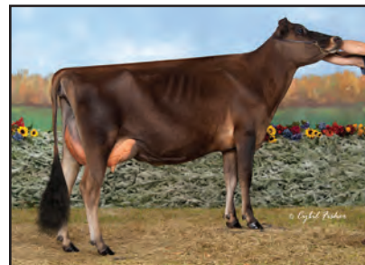
GARHAVEN IATOLA DUSK Dam of Lot 22