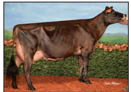
PLEASANT NOOK COMERICA FUTURE Sister to the Grandam of Lot 38