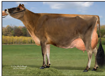
Sold in the 2005 sale Green Views Furor Jessica, E-94% Grand Champion, 2009 Ohio State Fair