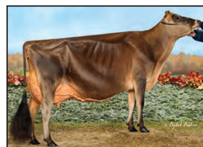
ELLIOTTS BLACKSTONE CHARLOTTE-ET Sister to the Dam of Lot 12