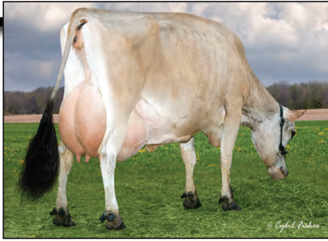
AHLEM B JOHN PRINCESS 3183-ET, E-91% Fourth Dam of Lot 15