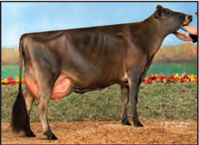
ARETHUSA TEQUILA VISION Sister to Lot 55