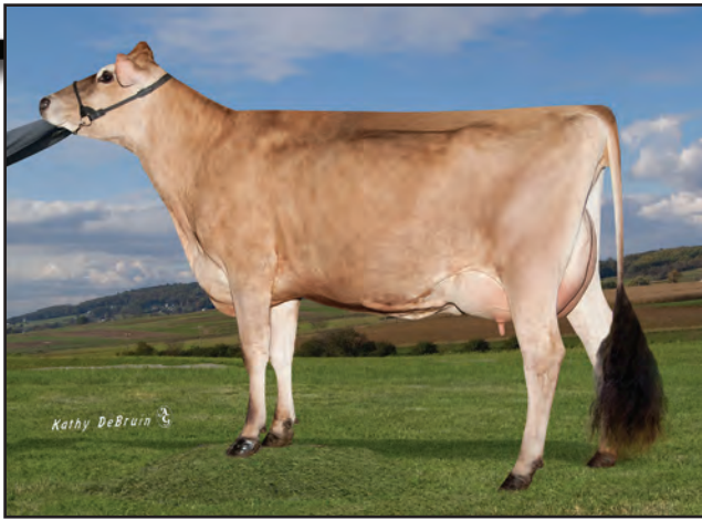
CAL-MART CRITIC PERIE 5958-P, VG-85% Great-Grandam of Lot 10