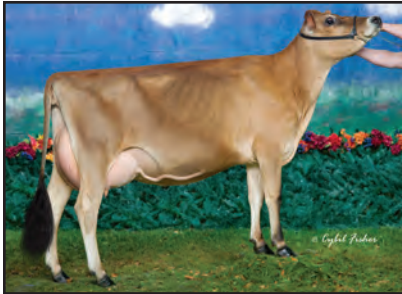
WF SULTAN SHADOWY Sister to the Grandam of Lot 61