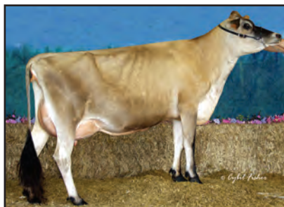
MID-DEL NATE MAMIE Fourth Dam of Lot 11