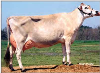
JEMI MADAM PITINO, E-94% Full Sister to the Great-Grandam of Lot 9