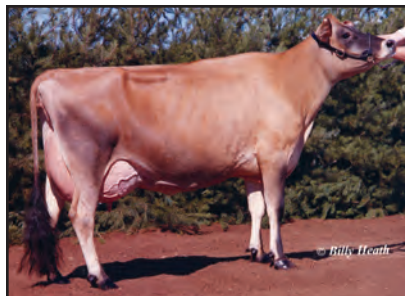
ENNISKILLEN REN MAMIE Sixth Dam of Lot 43