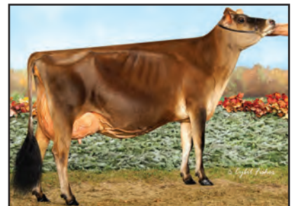
ARETHUSA HG SVANA-ET Sister to the Dam of Lot 62