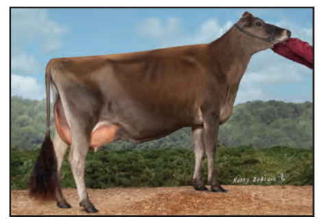
Sold in the 2010 sale Cooper Farm RBR Miss America-ET, E-91% 2 nd 4-year-old, 2013 Southern National Jersey Show