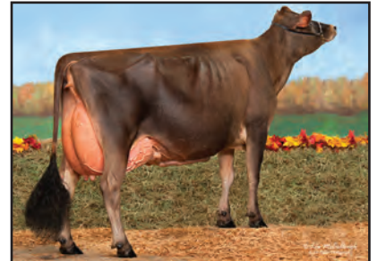
ELLIOTTS COMERICA SABLE-ET Sister to the Dam of Lot 62