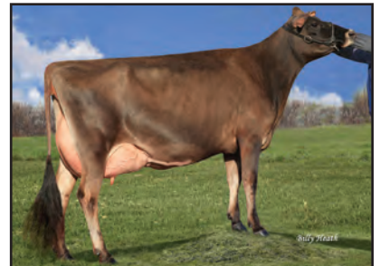
STONEY POINT VINDICATION FALINE, E-95% From the Same Family as Lot 2