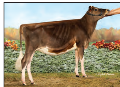
BUDJON-VAIL HP TEQUILA MADRA-ET Sister to the Dam of Lot 14