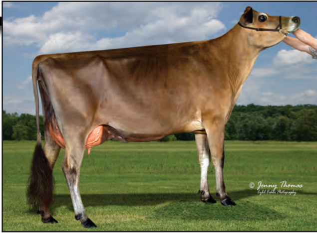
DKG MOTION BLINKY, E-91% Dam of Lot 71