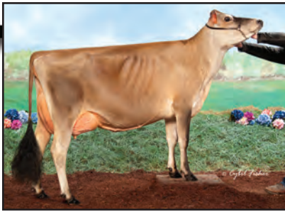
ELLIOTTS REGENCY CORRINA-ET Sister to Lot 65