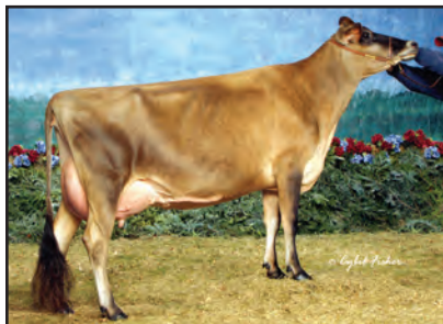
JULIANNAS DELUXE JUSTINE-ET Fifth Dam of Lot 35