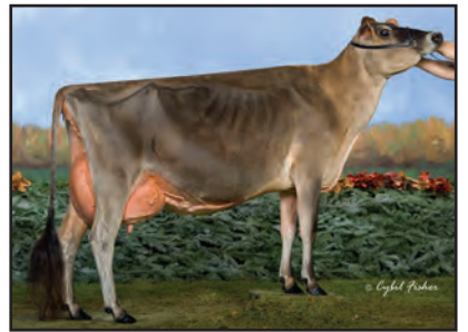
ARETHUSA VERONICAS DASHER-ET Grandam of Lot 58