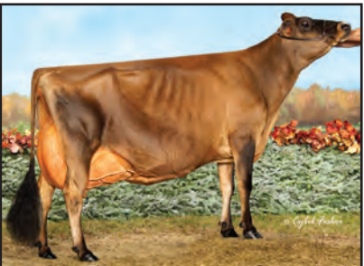
ARETHUSA RESPONSE VIVID-ET Sister to the Dam of Lot 55