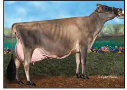
HURONIA CENTURION VERONICA 20J Great-Grandam of Lot 58