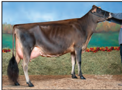
BUDJON-VAIL SAMBO GLENNA-ET Dam of Lot 79