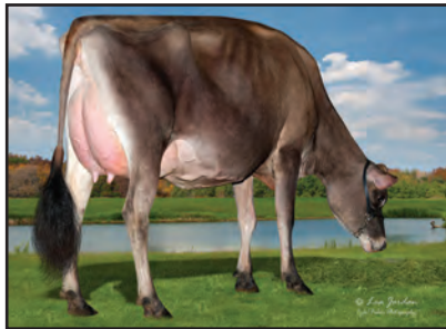
STONEY POINT GRAND BEA, VG-88%