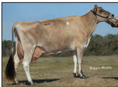
JX OOMSDALE LOUIE GARYN GINA {4}-ET Dam of Lot 59