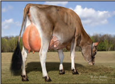
ELLIOTTS CHAVEZ RENEE-ET Dam of Lot 49