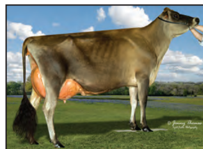
TOWER VUE LIL KOOKER-ET Sister to the Dam of Lot 34