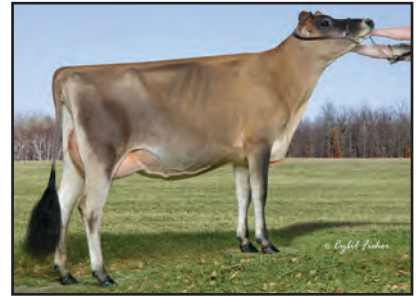
SUNSET CANYON SULTAN NADINE III-ET Great-Grandam of Lot 60