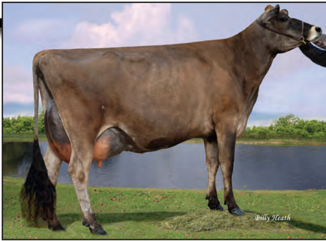
SVHEATH HIRED GUN SUGAR, E-92% Grandam of Lot 36