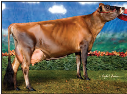
Sold in the 2003 sale Smart Remake Enchantment, E-93% Supreme Champ., 2005 World Dairy Expo Jr. Show

Celebrating a long history of selling the great ones. These are just a few of the well-known girls that have crossed the auction block in this annual spring sale.