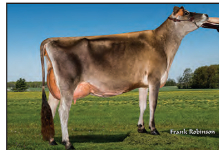
Sold in the 2014 sale M-Signiture Valentino Sophie-ETS 1st Sr. 2-yr.-old, 2015 Michigan Dairy Expo