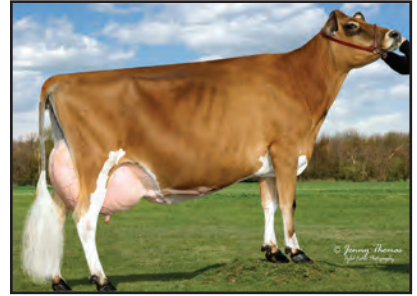
JX JER BEL DALE ABBY {3} Grandam of Lot 40

4TH DAM: JER BEL PARADE ASPEN 91% 4-01 305 2 21600 4.2 900 3.5 752 96DCR 2482C