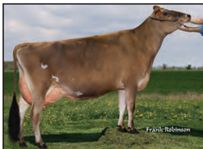
BUDJON-VAIL SULTAN GUCCI-ET Sister to the Dam of Lot 79