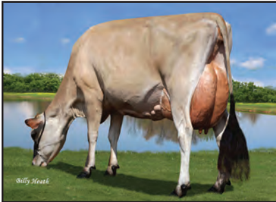
CHILLI ACTION COUTURE-ET Sister to the Dam of Lot 63