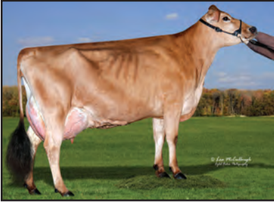
GABYS MEDALIST ALYMPIAN Dam of Lot 75