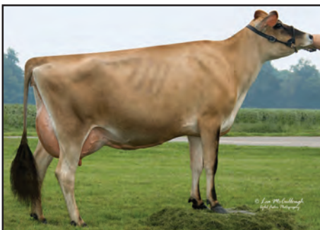
Sold in the 2009 sale Enniskillen Centurion Daisy, VG-87% 6-5 305 16,490 4.9% 802 3.4% 561