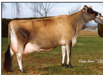
AVONLEA JUNO KRACKER-ET Fifth Dam of Lot 53