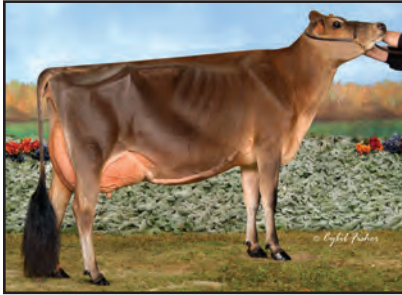
CHILLI PREMIER CINEMA-ET Dam of Lot 65