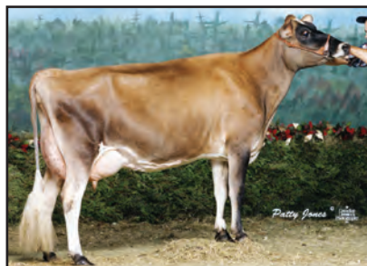
ENNISKILLEN MCT MAMIE Seventh Dam of Lot 43