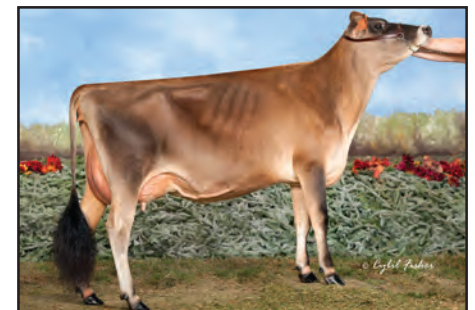
Sold in the 2012 sale Maple Ridge G Prix Jasmine, E-91% Reserve Intermediate Champ, 2012 Eastern States