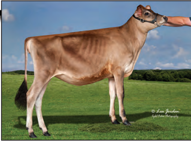
SSF ANDREAS NAOMI Selling as Lot 54