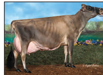
HURONIA CENTURION VERONICA 20J Great-Grandam of Lot 12