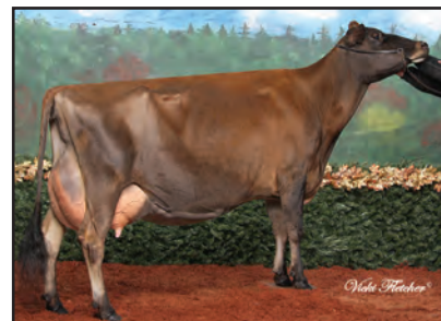
AVONLEA RENAISSANCE KOOKIE-ET Great-Grandam of Lot 34