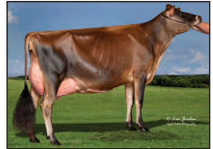
STONEY POINT BELMONT FASHION, E-94% From the Same Family as Lot 2

4TH DAM: STONEY POINT JURISDICTION FAIRY-ET 92% 5-04 305 2 18920 5.1 971 3.6 678 98DCR 2344C