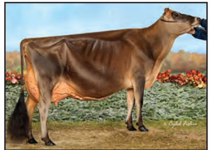
ELLIOTTS BLACKSTONE CHARLOTTE-ET Sister to the Dam of Lot 44