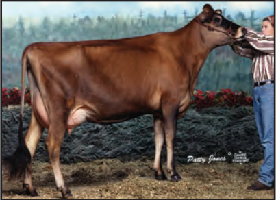
HOLLYLANE RENAISSANCE REBEL Fourth Dam of Lot 25