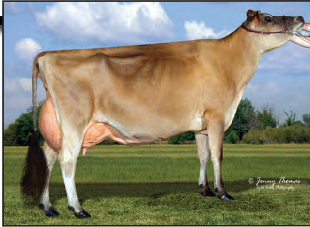
SA-FIRE HIRED GUNS BLAZE, E-93% Sister to the Dam of Lot 19