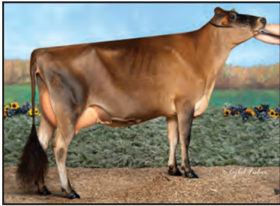
HEATHS PRIME ROSARIO-ET Sister to the Dam of Lot 25