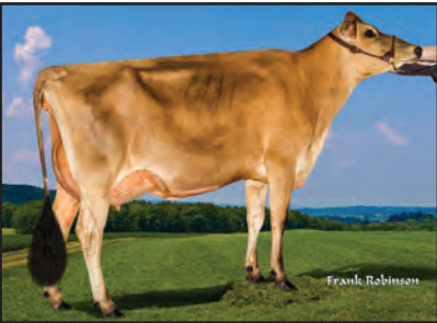
LOST-ELM TEQUILA CRAYAN Sister to the Dam of Lot 1