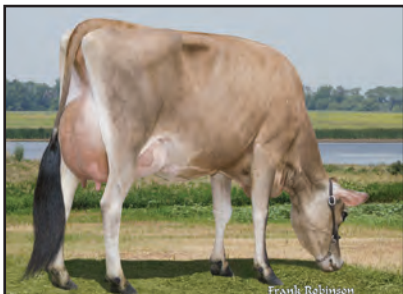
SUNSET CANYON FUTURITY C MAID 4-ET Great-Grandam of Lot 7