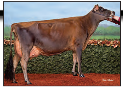
CROSSBROOK HG DIXIE-ET Dam of Lot 58

4TH DAM: GENESIS RENAISSANCE VIVIANNE VG 87 (CAN) 5-00 305 2 12110 4.2 514 3.8 461 CAN 1464C 7 STAR BROOD COW IN CANADA, SEPTEMBER 2012