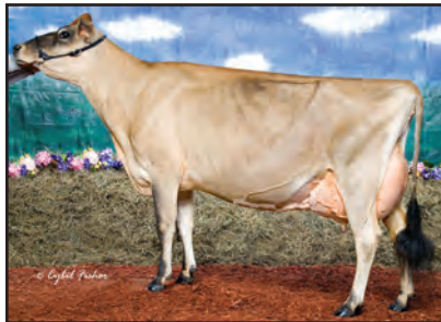
LLOLYN JUDE GRIFFEN-ET Grandam of Lot 79