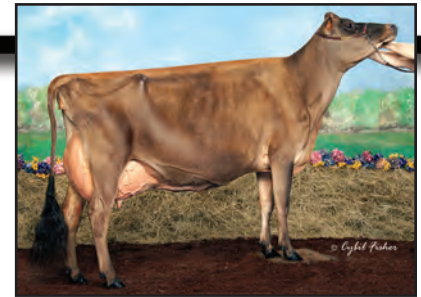
MILO VINDICATION SEASON-ET Grandam of Lot 62

NEXT DAM: BRI-LIN RENS SOFIE EX 90 (CAN) 4-04 305 2 21505 5.2 1117 3.8 815 DHIA 2820C 2012 JERSEY CANADA COW OF THE YEAR 7TH PLACE, 2015 GREAT COW CONTEST SIRE: HOLLYLANE RENAISSANCE JPI -118 0%ILE