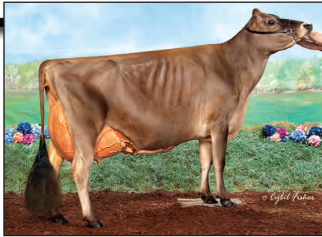
STONEY POINT VERB BLUSH, E-94%

From the Same Family as Lot 37 HM Senior Champion, 2018 New York Spring Show