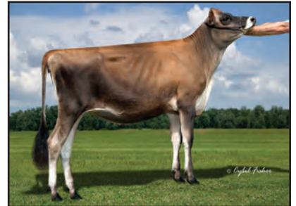
SCHULTE BROS FLASHY LADY Sister to Lot 38