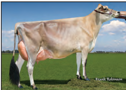
Sold in the 2011 sale Maple Ridge Nevada PearlI, E-92% Reserve Intermediate Champ, 2013 CA Spring Show