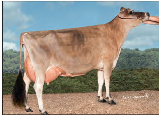
FVF MILITIA STARWISSH, E-94% FROM THE SAME FAMILY AS LOT 181