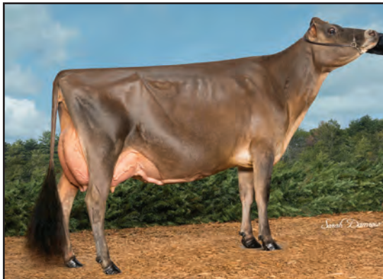
RATLIFF SAMBO ALISON-ET, E-91% SISTER TO THE GRANDAM OF LOT 202