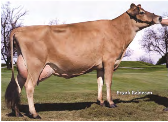
WOODSTOCK THUNDER TINA LOUISE {6}-ET, VG-88% FIFTH DAM OF LOT 1