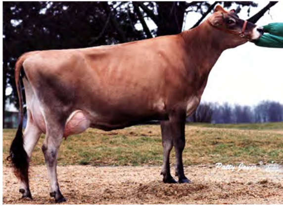
LLOLYN REN POLLYANN 3-ET, VG 87 (CAN) SIXTH DAM OF LOT 82