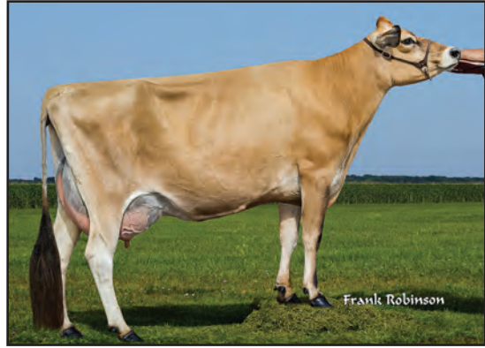
DEERVIEW BALLARD COED-ET, E-92% SISTER TO THE DAM OF LOT 167