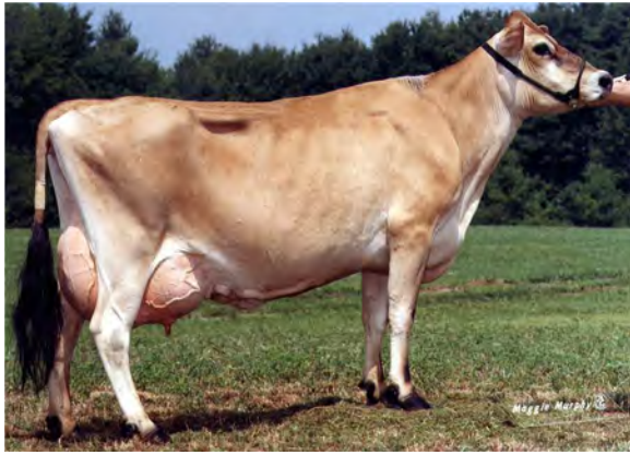
DUTCH HOLLOW BARBER MIMIC-P-ET, VG-81% SIXTH DAM OF LOT 125