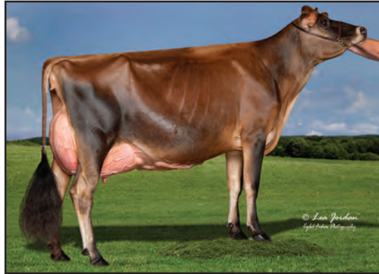
STONEY POINT BELMONT FASHION, E-94% SISTER TO THE DAM OF LOT 198