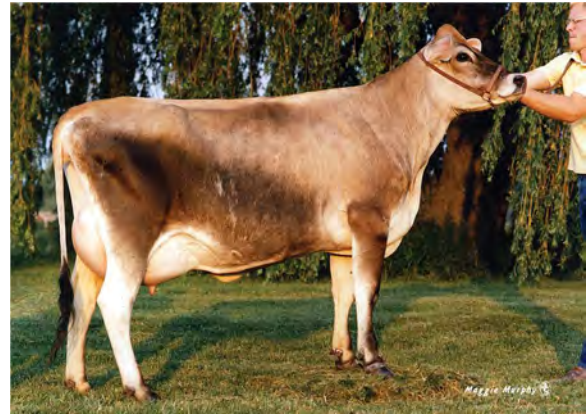
DUTCH HOLLOW LESTER MISCHIEF-P-ET, E-91% SEVENTH DAM OF LOT 125