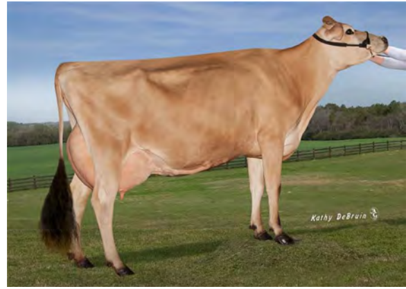
GRAZELAND PLUS WISHBONE (6), VG-87% FROM THE SAME FAMILY AS LOT 54