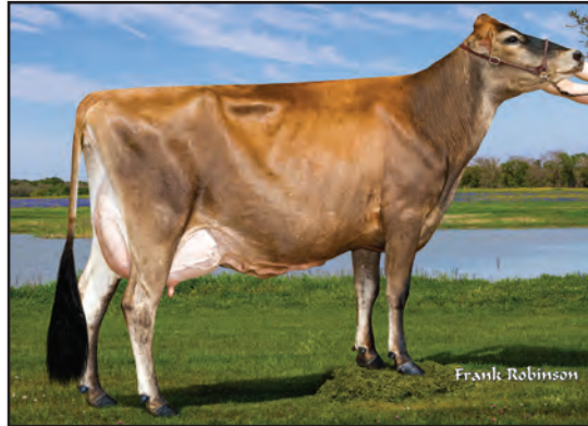
KY-HI TOPEKA HOPEFULL-P-ET, E-90% SISTER TO THE GRANDAM OF LOT 77