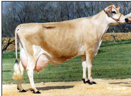
GABYS BOOMER ROXY (6), E-91% SIXTH DAM OF LOT 196