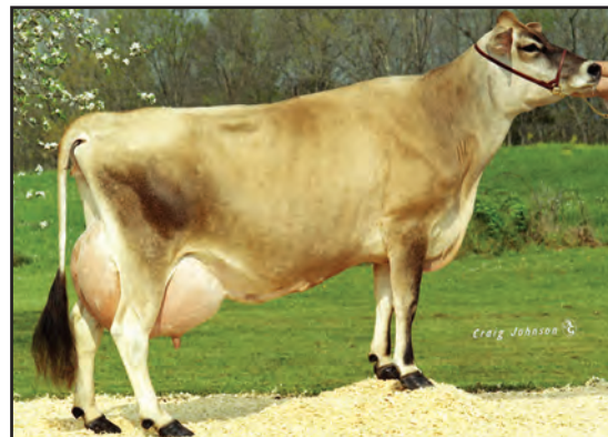
GABYS ALF BALLETT, E-90% FIFTH DAM OF LOT 79