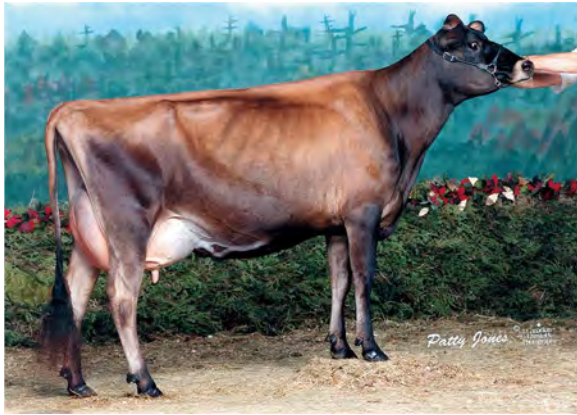
JASPAR RENAISSANCES EVENING, EX 91-3E (CAN) SIXTH DAM OF LOT 146