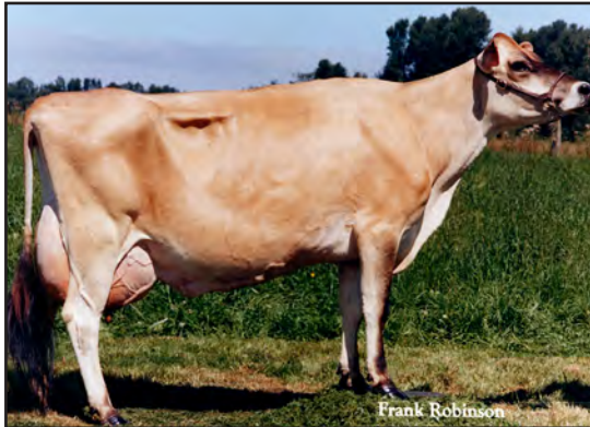
GOLDUST SOONER LEA {6}, E-93% FOURTH DAM OF LOT 12