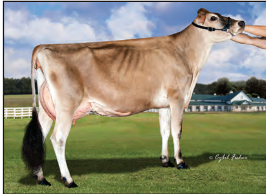
GOLDUST KARBALA LAINA-ET, E-92% SISTER TO THE DAM OF LOT 24