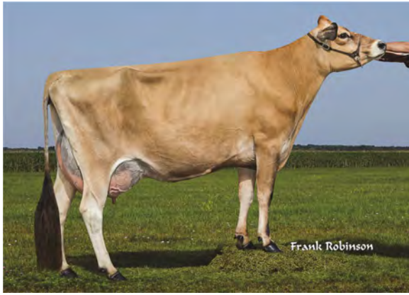
DEERVIEW BALLARD COED-ET, E-92% SISTER TO THE GRANDAM OF LOT 159