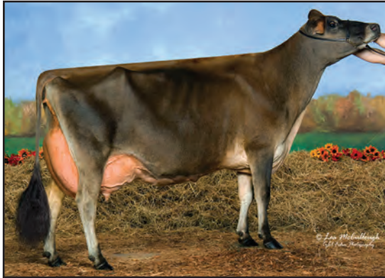
RATLIFF PRICE ALICIA, E-95% GREAT-GRANDAM OF LOT 202