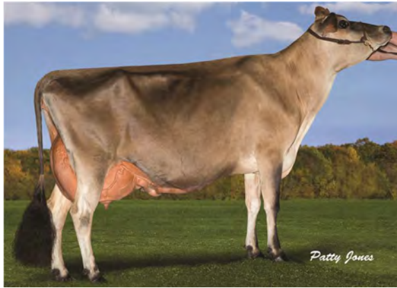
CHARLYN LEGACY SADIE, SUP-EX 94-6E (CAN) GREAT-GRANDAM OF LOT 13