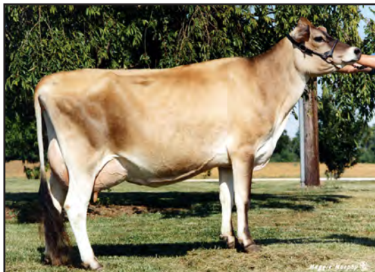
SWEET GRASS 2875 GURIT-ET, E-90% FOURTH DAM OF LOT 164