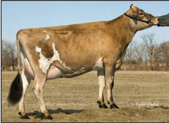
JX OOMSDALE CC IATOLA GALEN {3}, E-90% GRANDAM OF LOT 130