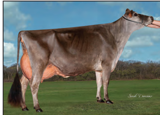
RATLIFF IMPRESSION ANNABELLA-ET, E-93% SISTER TO THE GRANDAM OF LOT 202