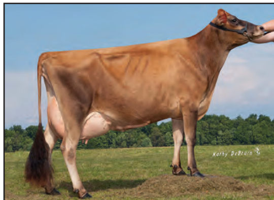
HAVS LOVABULL WATCHFULL-P, E-93% GREAT-GRANDAM OF LOT 77