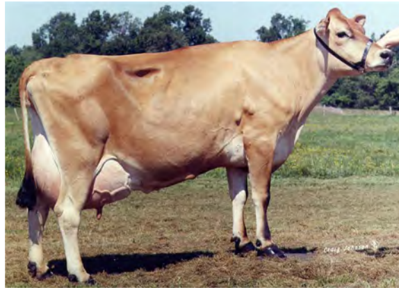
SUNBOW DECLO DENMARK, VG-88% FIFTH DAM OF LOT 200