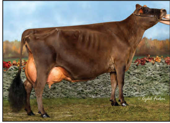
ARETHUSA PRIMETIME DEJA VU-ET, E-95% GREAT-GRANDAM OF LOT 168