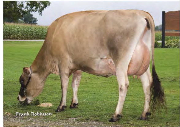
BRIDON LS ECHO-ET, EX 90 (CAN) FROM THE SAME FAMILY AS LOT 146