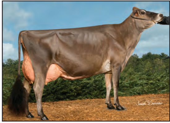
RATLIFF IMPRESSION DONNER-ET, E-91% SISTER TO THE GRANDAM OF LOT 168