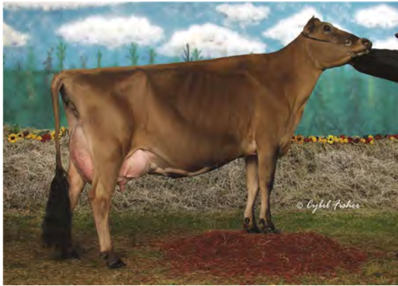
HOLLYLANE JEWELS JASMINE, E-94% FIFTH DAM OF LOT 21