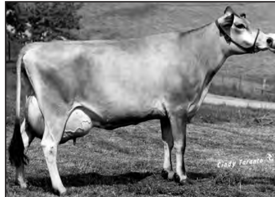
SCHULTZ QS NOBLE HARMONY {4}, VG-88% SIXTH DAM OF LOT 35