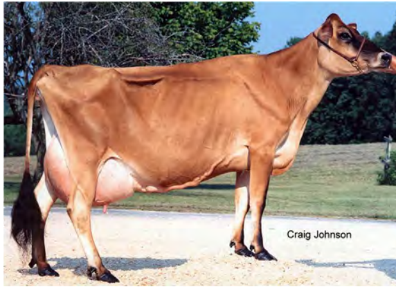
GABYS BARBER ROXALLIE, E-94% FIFTH DAM OF LOT 86