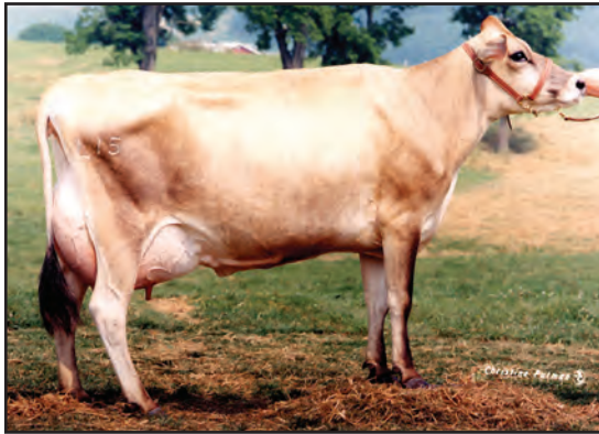
SCHULTZ DUNCAN HARMONY {5}, E-90% FIFTH DAM OF LOT 35