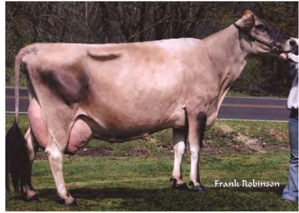
WOODSTOCK DUNCAN TINA LOUISE {5}, E-95% SIXTH DAM OF LOT 1