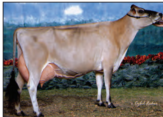
ROZEVIEV DORIE D RACHEL, E-95% FIFTH DAM OF LOT 202