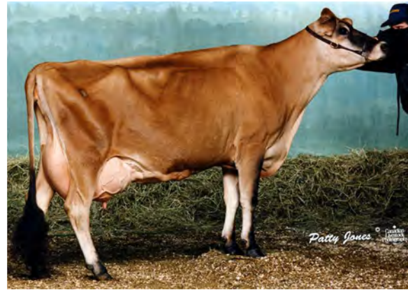
HOLLYLANE TREASURES JEWEL, EX 92-3E (CAN) SIXTH DAM OF LOT 21