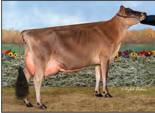
RATLIFF ACTION DEVA-ET, E-91% GRANDAM OF LOT 168