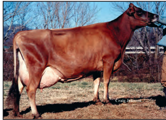
GABYS LEMVIG BARBIE, E-92% FOURTH DAM OF LOT 79