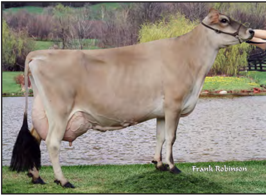
DEERVIEW MONTANA GALAXY-ET, E-94% SISTER TO GRANDAM OF LOT 164