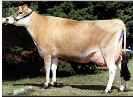
DEERVIEW FROSTY GALAXY-ET, E-91% SISTER TO GRANDAM OF LOT 164