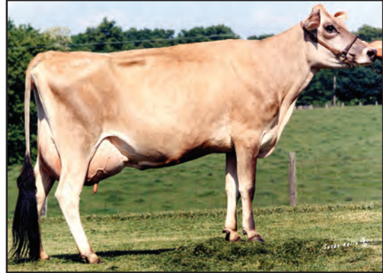
SCHULTZ SOONER HARMONY {6}, E-90% FOURTH DAM OF LOT 35