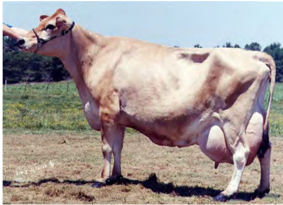
SUNBOW ALF NUTMEG, VG-84% FIFTH DAM OF LOT 201