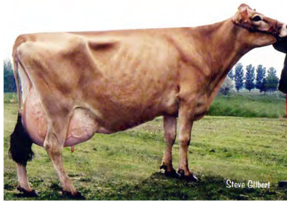
GRAZELAND BOLD DAVITA, E-91% FOURTH DAM OF LOT 40