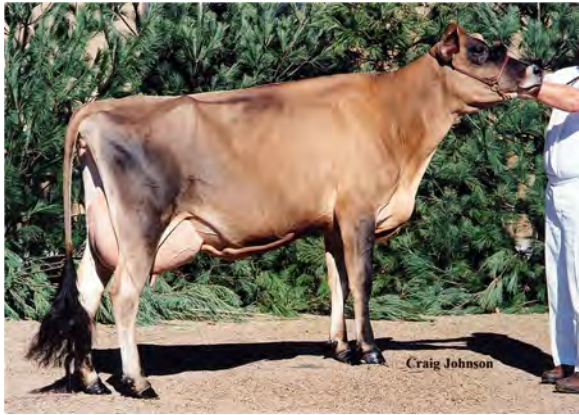
LADYHOLM N SYMPHONY, E-91% FIFTH DAM OF LOT 179