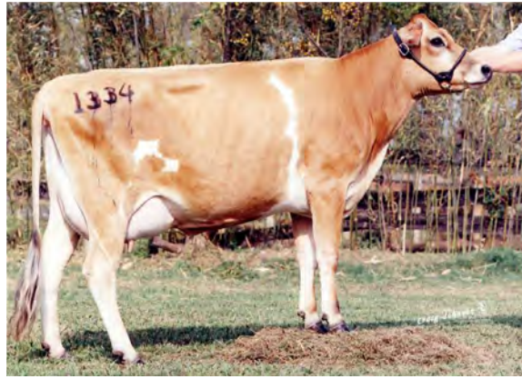
CJF DUNCAN BEE BABE, VG-87% SEVENTH DAM OF LOT 129