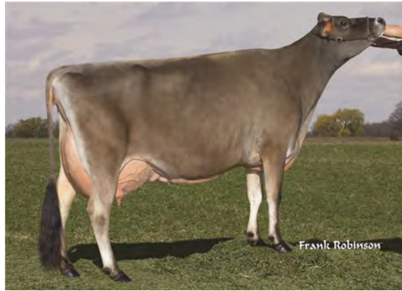
MRJ ROCKETS SUMMER GIRL, E-94% GRANDAM OF LOT 192