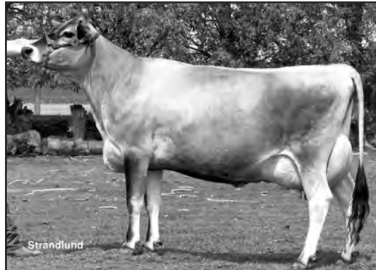
SWEET GRASS BRASS GULKA, VG-85% FIFTH DAM OF LOT 164