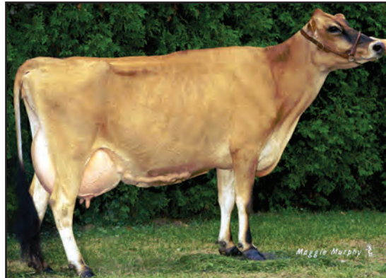
FRIENDLY VALLEY BRITA STARBRIGHT, E-92% EIGHTH DAM OF LOT 181