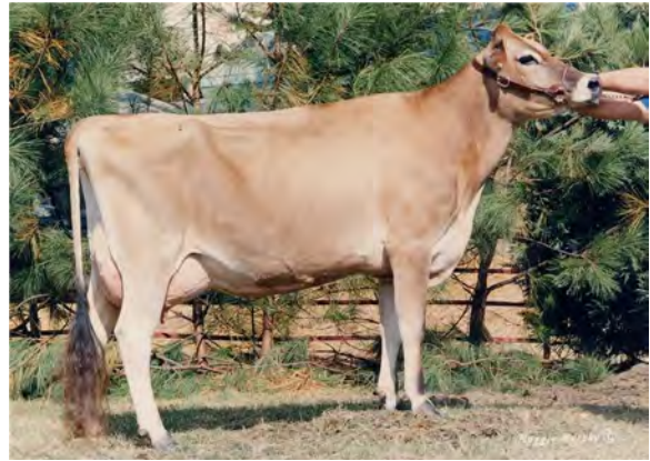
DEERVIEW BABES SOUND, E-93% SIXTH DAM OF LOT 179