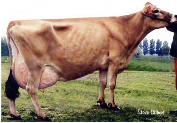
GRAZELAND BOLD DAVITA, E-91% FOURTH DAM OF LOT 54