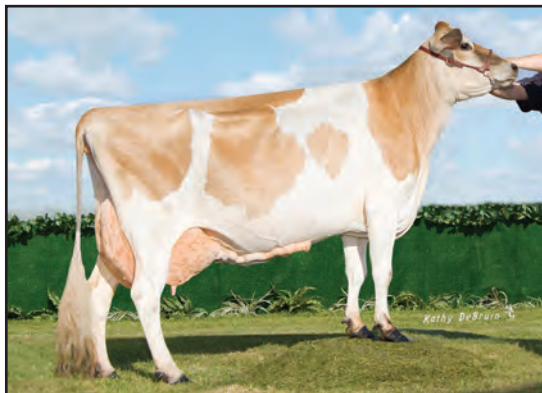
FVF STAR SAMMY, E-93% FROM THE SAME FAMILY AS LOT 181