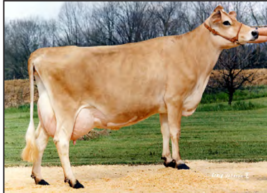
GABYS HERMITAGE ROXETTE, E-90% FIFTH DAM OF LOT 196