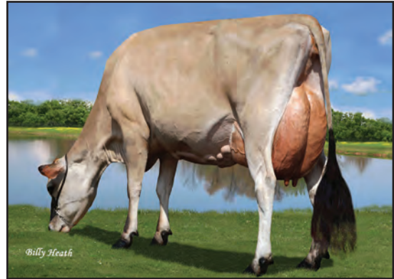
CHILLI ACTION COUTURE-ET, E-92% SISTER TO THE GRANDAM OF LOT 80