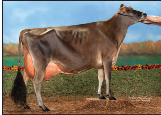
RATLIFF ACTION ANGEL, E-95% FULL SISTER TO THE GRANDAM OF LOT 202