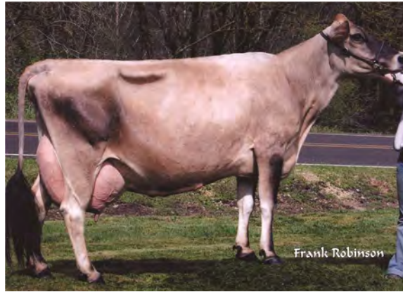
WOODSTOCK DUNCAN TINA (5), E-95% SIXTH DAM OF LOT 2