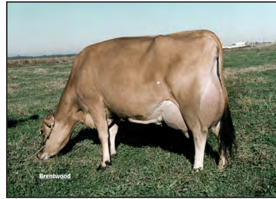
BW BERRETTA PRIZE G525, E-92% FOURTH DAM OF LOT 147