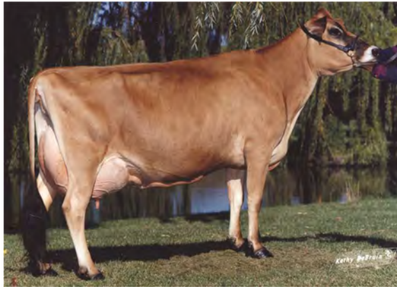
DUNCAN EILENE OF HLF, E-96% FIFTH DAM OF LOT 166