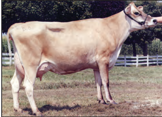
SCHULTZ AVERY HARM-ET, E-91% GREAT-GRANDAM OF LOT 35