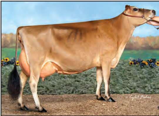
FVF HALLMARK STARSUN-TWIN, E-91% FROM THE SAME FAMILY AS LOT 181