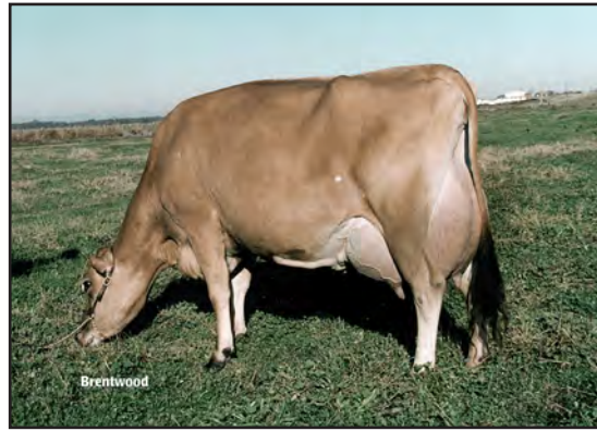
BW BERRETTA PRIZE G525, E-92% FIFTH DAM OF LOT 163