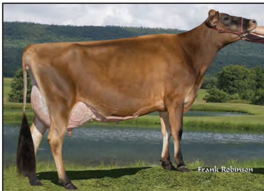
GABYS BLACKSTONE BRASSY-ET, E-92% SISTER TO THE GRANDAM OF LOT 79