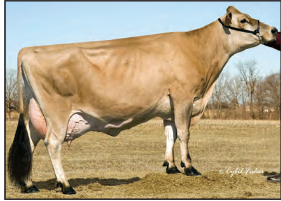
JX OOMSDALE GRATITUDE COUNTRY CC {2}-ET, E-90% GREAT-GRANDAM OF LOT 130