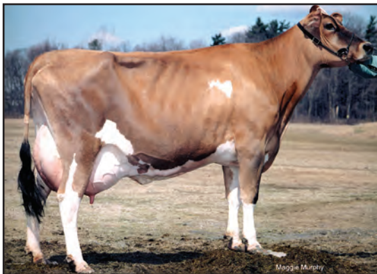
JX OOMSDALE GORDO GOLDIE GRATITUDE {1}, E-90% FOURTH DAM OF LOT 130