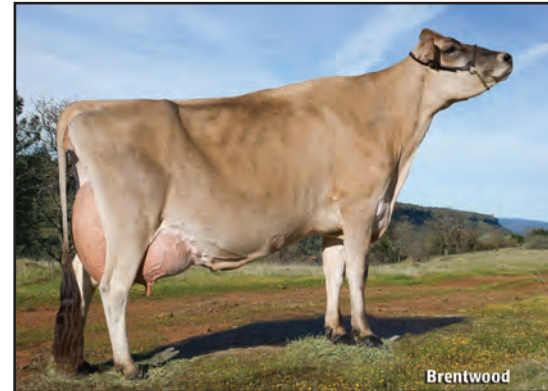
BW JACE JENNY ET336-ET, E-91% SISTER TO THE GRANDAM OF LOT 147