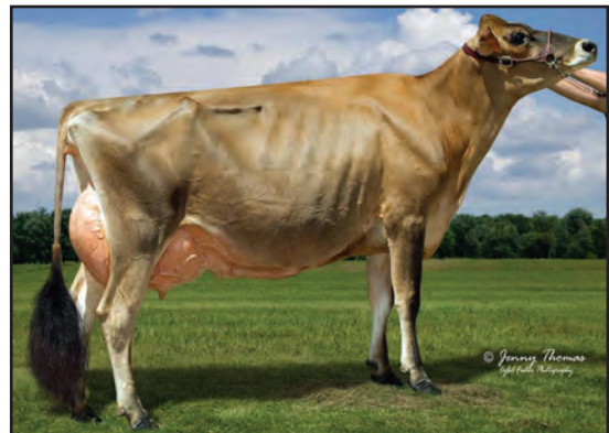
CHILLI PT CHEYENNE-ET, E92% SISTER TO THE GRANDAM OF LOT 80