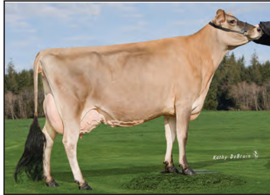
FVF EXTREME STARNIGHT {6}, E-94% FROM THE SAME FAMILY AS LOT 181