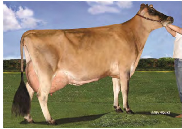
BW LEGION COED-ET, E-92% FOURTH DAM OF LOT 159