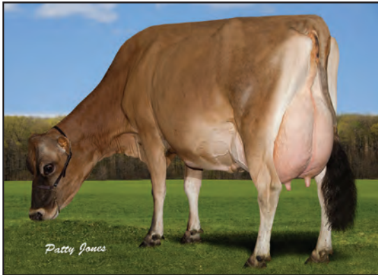
GABYS ACTION BABY0ET, EX 90-3E (CAN) GREAT-GRANDAM OF LOT 79