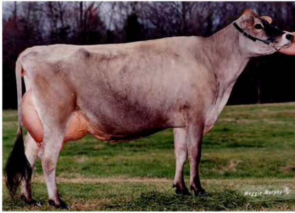
DEMENTS JUDE DOLLY, E-92% FIFTH DAM OF LOT 205