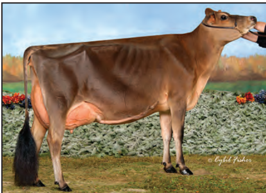
CHILLI PREMIER CINEMA-ET, E-93% SISTER TO THE GRANDAM OF LOT 80