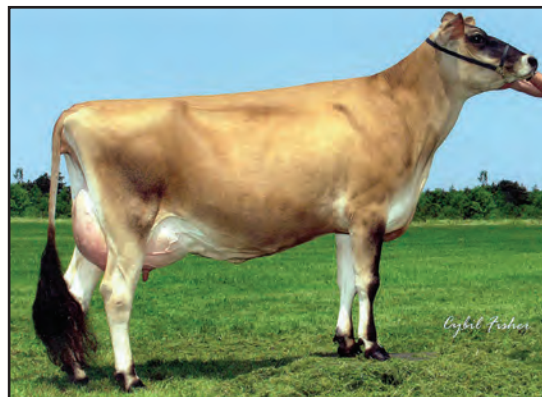
SHF SAMBO FUCHSIA, E-92% FOURTH DAM OF LOT 198