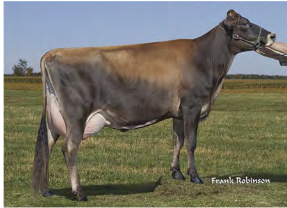
VALSIGNA KANOO 10408 {6}, VG-88% GREAT-GRANDAM OF LOT 111