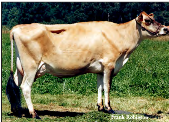
GOLDUST BARBER LEA, VG-89% FROM THE SAME FAMILY AS LOT 12