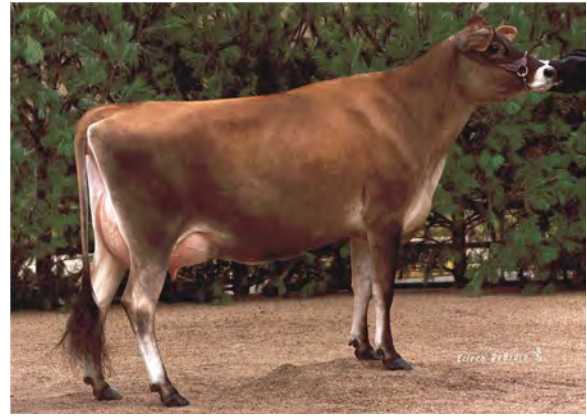
RRF BOOM DOREEN, E-91% SIXTH DAM OF LOT 205