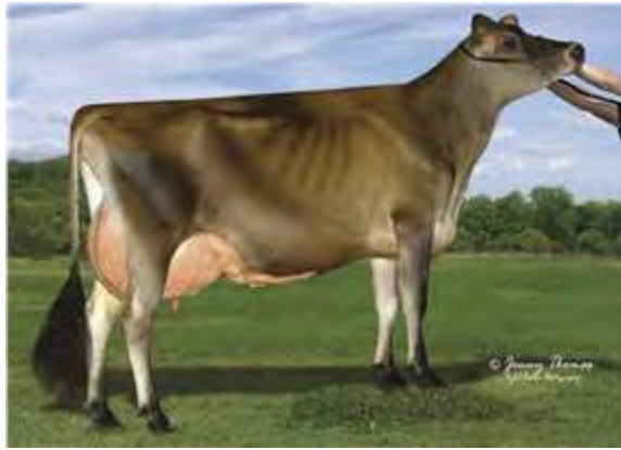
OSU-ATI TEXAS BUFFY 2521, E-91% FROM THE SAME FAMILY AS LOT 30