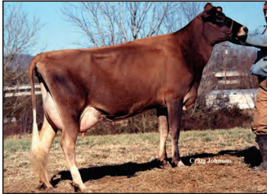
GABYS IATOLA ZIRCON-ET, E-90% FOURTH DAM OF LOT 196