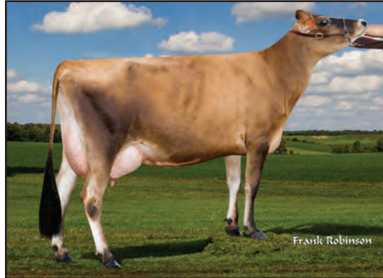
KY-HI TOPEKA FAITHFULL-ET, E-92% SISTER TO THE GRANDAM OF LOT 77