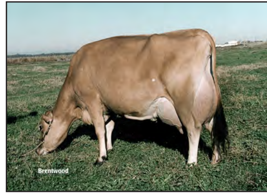
BW BERRETTA PRIZE G525, E-92% FIFTH DAM OF LOT 156