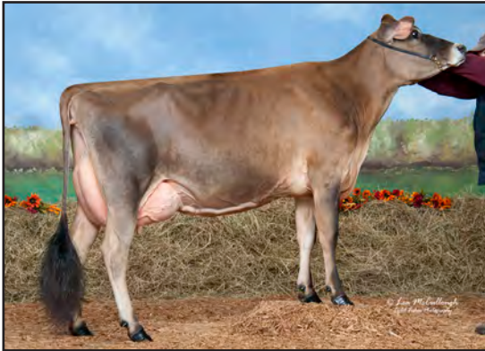
CHILLI MINISTER CINNAMON-ET, E-91% SISTER TO THE GRANDAM OF LOT 80