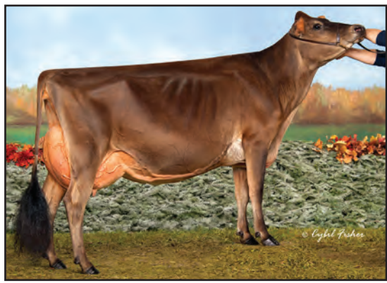
RATLIFF ACTION DABBLE-ET, E-94% FULL SISTER TO THE GRANDAM OF LOT 168