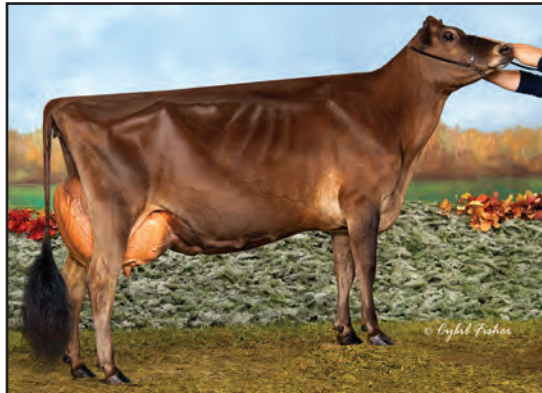
RATLIFF TEQUILA AVELANCHE-ET, E-93% SISTER TO THE GRANDAM OF LOT 202