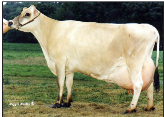
OOMSDALE HERM GROOVY GLORIA, E-92% SIXTH DAM OF LOT 130