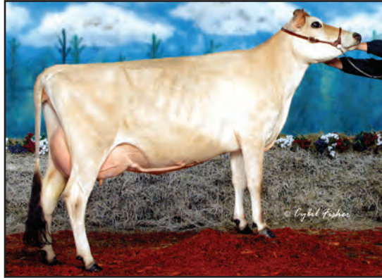
HIXSON JUDE ILLEANNA (6)-ET, E-92% SISTER TO THE DAM OF LOT 111