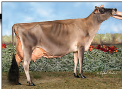
ARETHUSA VERONICAS COMET-ET Grandam of Lot 17