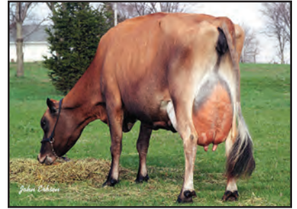
RESPONSES GIGI Great-Grandam of Lot 58

4TH DAM: REXS PATRICK GOLDIE 90% 10-00 305 2 22240 3.8 837 3.3 745 93DCR 2307C