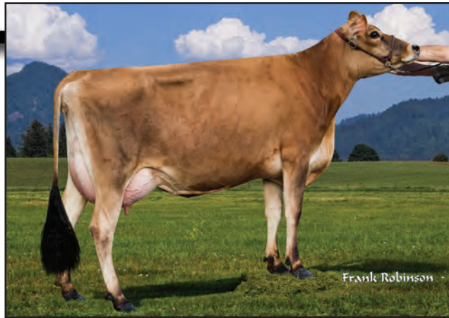
PINE HILL ZIPPER LUMINATE, VG-82% Sister to Lot 19