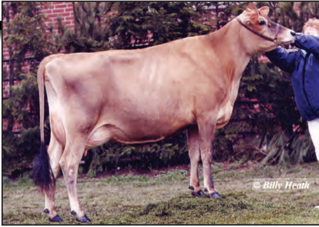
PINE HAVEN REMAKE JENNY, E-91% Great-Grandam of Lot 72