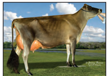
TOWER VUE LIL KOOKER-ET Sister to the Dam of Lot 40