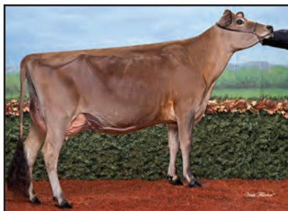
SOUTH MOUNTAIN SANTANAS SPIRIT-ET Sister to the Dam of Lot 45