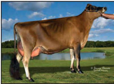
DREAM-VALLEY HIRED TIPSTER Sister to the Grandam of Lot 47