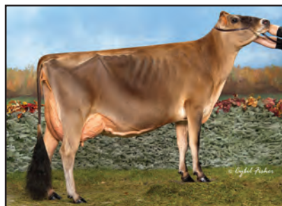
ELLIOTTS COSMO ACTION-ET Sister to the Dam of Lot 17