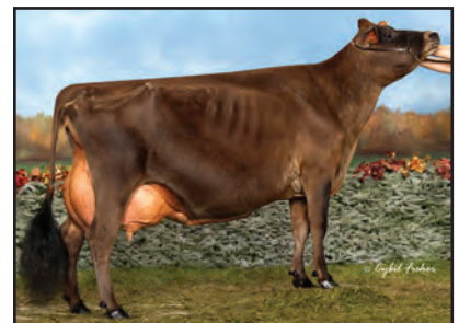
ARETHUSA PRIMETIME DEJA VU-ET Sister to the Grandam of Lot 20