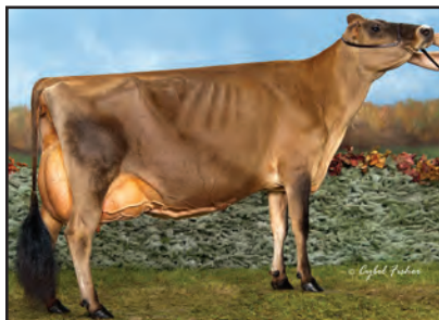
ARETHUSA RESPONSE VIVID-ET Sister to the Grandam of Lot 39