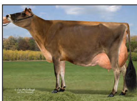
Sold in the 2005 sale Green Views Furor Jessica, E-94% Grand Champion, 2009 Ohio State Fair