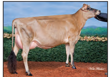
ARETHUSA DELUXE LIBERTY Sister to the Grandam of Lot 42