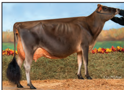
ELLIOTTS BLACKSTONE CHARLOTTE-ET Sister to the Dam of Lot 17