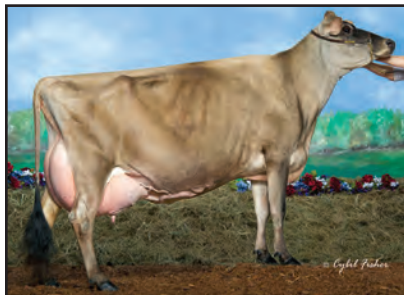
SOUTH MOUNTAIN SANTANA Grandam of Lot 45