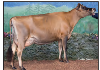
ENNISKILLEN REMAKE DAISY 21P Sister to the Dam of Lot 76