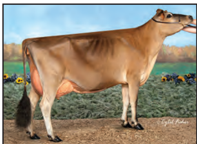
SVHEATHS JUSTICE JOELY Sister to the Dam of Lot 23