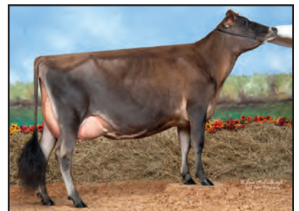
TOWER VUE KOOKIES KRUNCH-ET Sister to the Dam of Lot 40