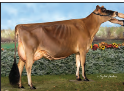
ELECTRAS ETERNAL STAR-ET Sister to the Dam of Lot 41