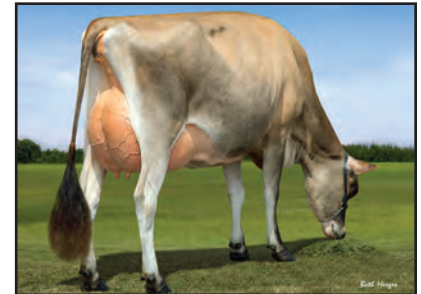
STEESHANIE IATOLA TINKERBELL Dam of Lot 24