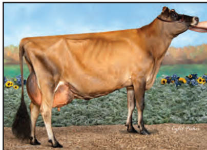
ARETHUSA HG BLESSING Sister to the Dam of Lot 39