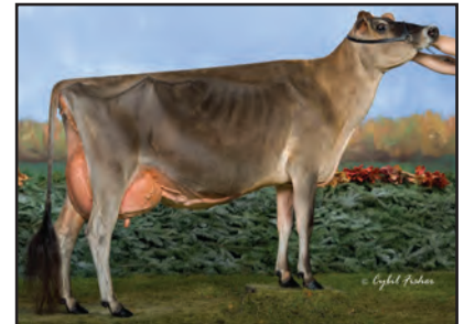
ARETHUSA VERONICAS DASHER-ET Sister to the Grandam of Lot 54