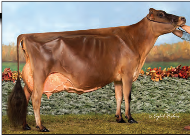
PAGE-CREST EXCITATION KARLIE, E-94% Sister to the Dam of Lot 29