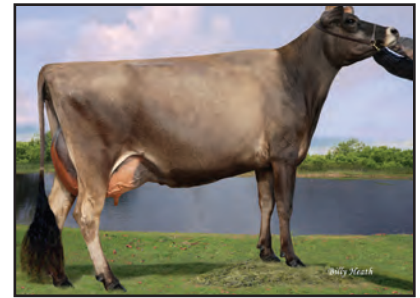
SV HEATHS VERBATIM ROMANIA-ET Sister to the Dam of Lot 60