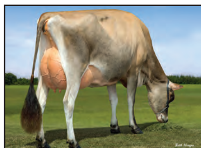
STEESSHANIE IATOLA TINKERBELL Dam of Lot 49