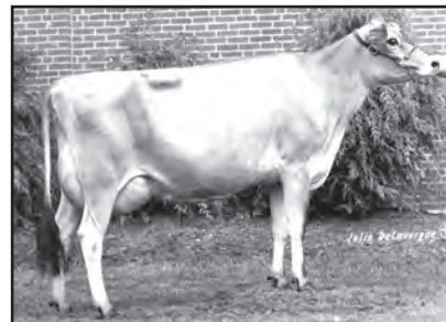
MASTER PATRICK RITA, E-90% Fifth Dam of Lot 68 Two-time Grand Champion, Ohio State Fair