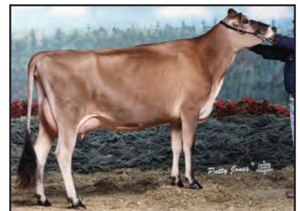
SHAMROCK JUDE JULIANNA Fourth Dam of Lot 56