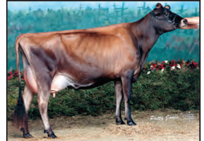
JASPAR RENAISSANCES EVENING EX 91-3E (CAN) Fifth Dam of Lot 16