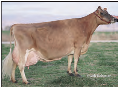
HAWARDEN ATLANTIS PIXY B Fourth Dam of Lot 31