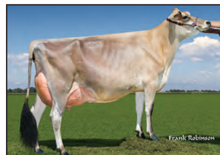
Sold in the 2011 sale Maple Ridge Nevada PearlII, E-92% Reserve Intermediate Champ, 2013 CA Spring Show