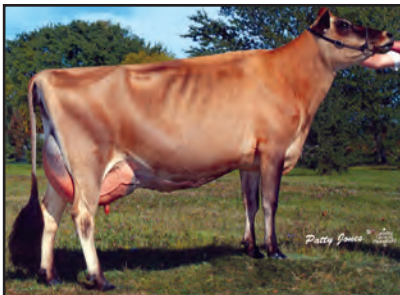
PREMONITION GRACE Fourth Dam of Lot 15