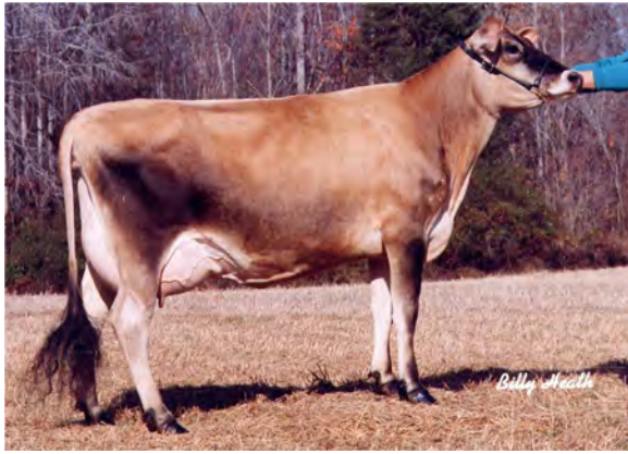
ALTHEAS 3M 141-ET, VG-88% FIFTH DAM OF LOT 150