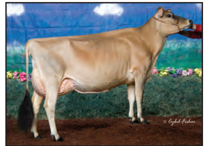
SILVER DREAMS CENTR LINDY Great-Grandam of Lot 42