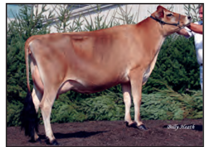
BACHELORS SPARK REXIE 882 Great-Grandam of Lot 60