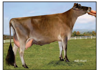
SV HEATHS AMADEO REXANNE Grandam of Lot 60