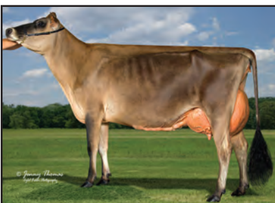
ELECTRAS ENCHANTING-ET Sister to the Dam of Lot 41