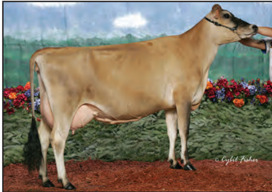
HIXSON FUTURE SLEEPY (6)-P-ET, E-94% SISTER TO THE GRANDAM OF LOT 110