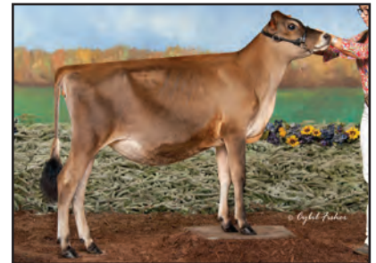
LLR PREMIER TOO LEGIT-ET Sister to Lot 24