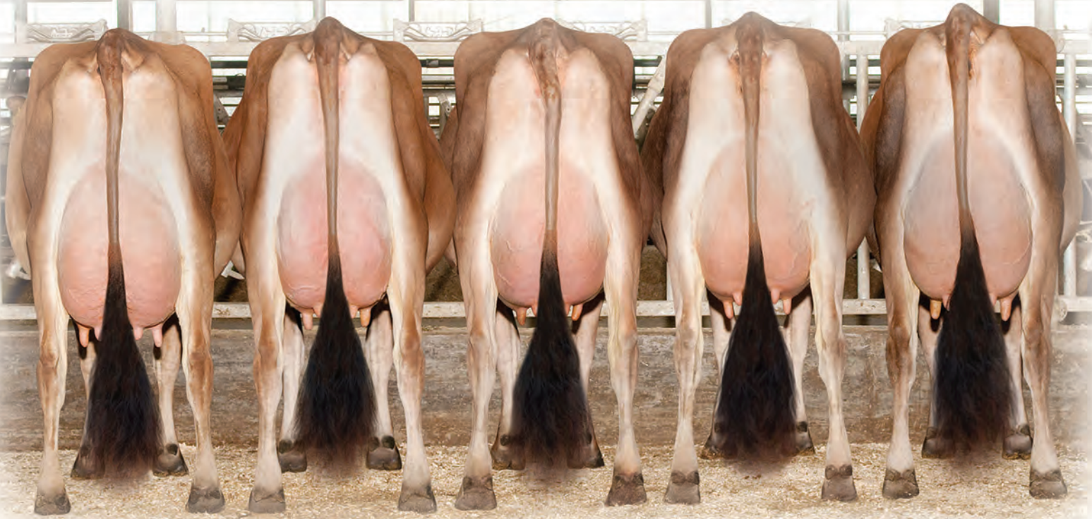
Axis daughter group, Crosswind Jerseys, Elkton, SD, Damrow photo