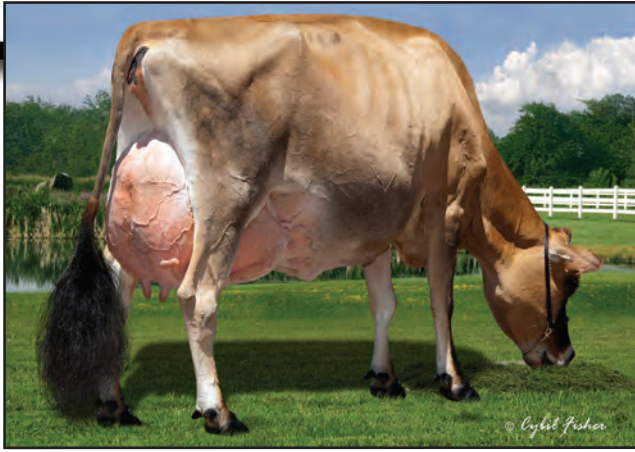
BRIDON VERIFY ELEVATE, E-95% Grandam of Lot 16