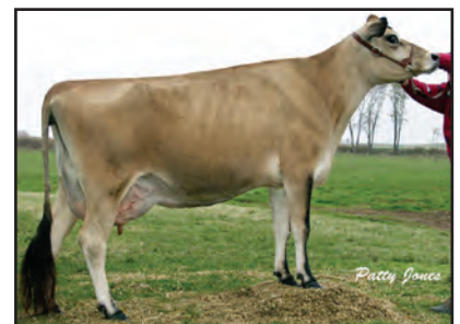
ENNISKILLEN JUNO ASY Great-Grandam of Lot 76