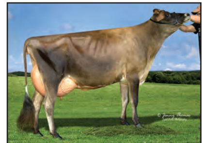
OAKFIELD MINISTER VENICE-ET Sister to the Dam of Lot 20