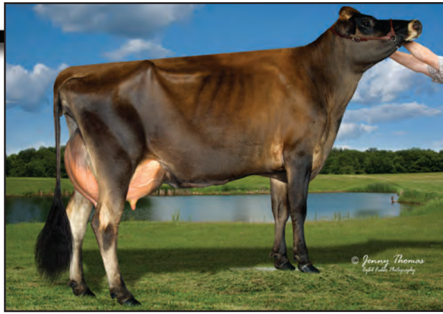
DREAM-VALLEY TEQUILAS BIG TIPSTER, E-90% Grandam of Lot 47