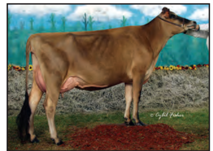
JULIANNAS DELUXE JUSTINE-ET Great-Grandam of Lot 56