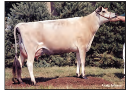
GD LORD SUSAN Fourth Dam of Lot 48

SIRE: SELECT-SCOTT MINISTER-ET GJPI -86 1%ILE SISTER(S): GORDONS GRAN PRIX SARA LEE 85% 3-04 305 2 13370 5.5 735 3.6 478 97DCR 1652C