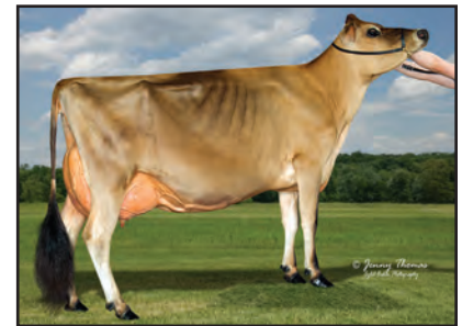
EHRHARDT COLTON JULEP, E-90% From the Same Family as Lot 22

NEXT DAM: JEWELS DELUXE MODEL-ET 1ST JUNIOR YEARLING, 2004 CENTRAL NATIONAL SHOW SIRE: ELLIOTTS RENAISSANCE DELUXE GJPI -111 0%ILE