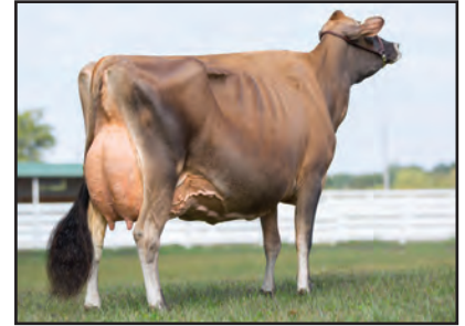
COWBELL GUAPO RICOCHET Sister to Lot 14