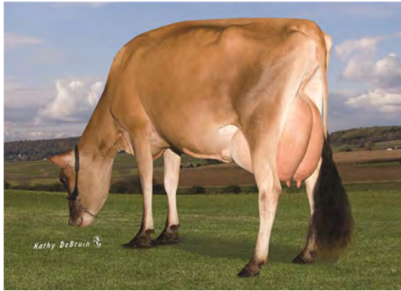
CLARESHOE ZUMA ROSEBUSH, E-90% SAME FAMILY AS LOT 107