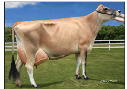
FAMILY HILL REN FLIRT-ET Sister to the Dam of Lot A