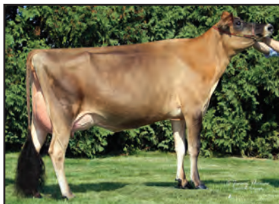
ARETHUSA RESPONSE VIEW-ET Dam of Lot 9