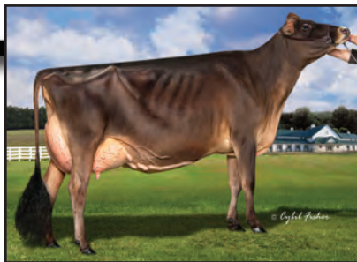
TJ CLASSIC MINISTER VENUS-ET Grandam of Lot 37