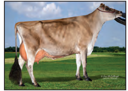
SOUTH MOUNTAIN SOCRATES JIGSAW-ET Sister to the Dam of Lot 56