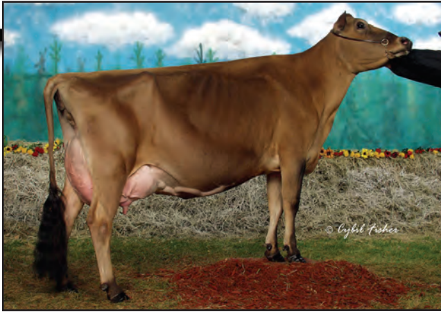
HOLLYLANE JEWELS JASMINE, E-94% Fourth Dam of Lot 22