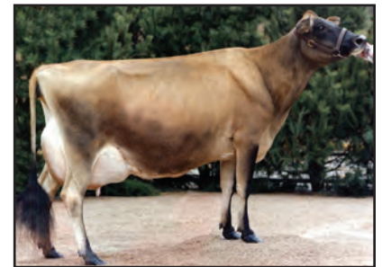
BUTTERFIELD REWARD POLLYANNA Fourth Dam of Lot 74