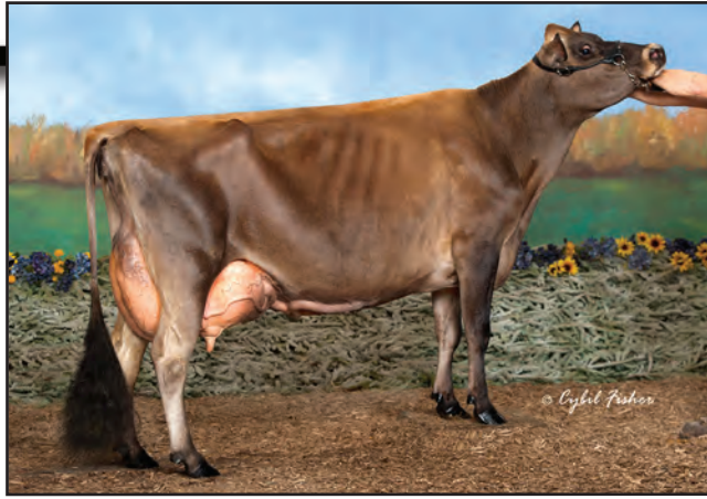
GLENVIEW COMERICA FRANNIE, E-94% Sister to the Dam of Lot 7