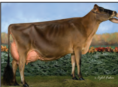
EXTREME ELECTRA Grandam of Lot 41