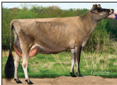
ARETHUSA VERONICAS BLITZEN-ET Grandam of Lot 39