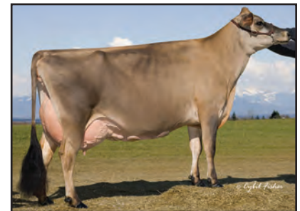
FAMILY HILL SD FAVORITE Sister to the Dam of Lot A