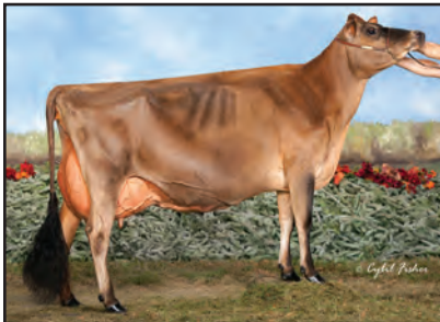
MILO VINDICATION SEASON-ET Grandam of Lot 13