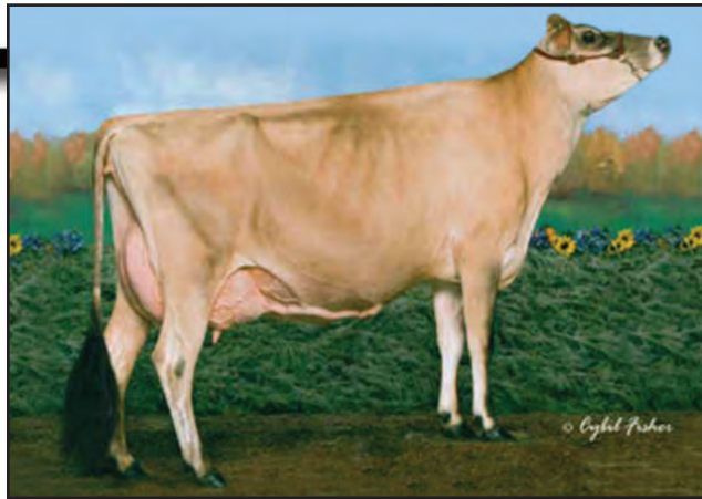
BRIDON BE WINK, E-92% Grandam of Lot 27