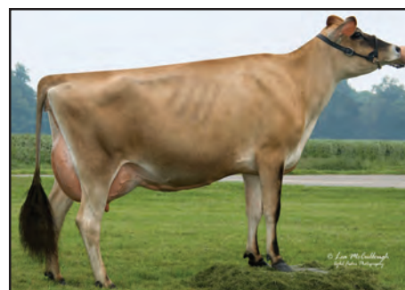
Sold in the 2009 sale Enniskillen Centurion Daisy, VG-87% 6-5 305 16,490 4.9% 802 3.4% 561