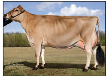
SOUTH MOUNTAIN SOCRATES LAUGHTER-ET Sister to the Dam of Lot 42