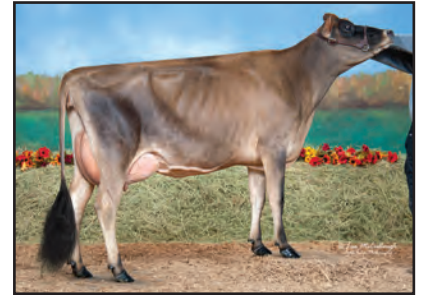
GORDONS MINISTER DAISY ONE Sister to Lot 76