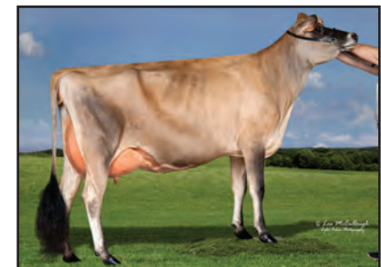
COWBELL GUAPO RODEO Sister to Lot 14