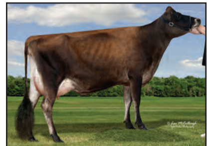
OAKFIELD TBONE VANESSA-ET Sister to the Dam of Lot 20