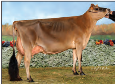
ELLIOTTS VOLTAGE SAHARA-ET Sister to the Dam of Lot 13