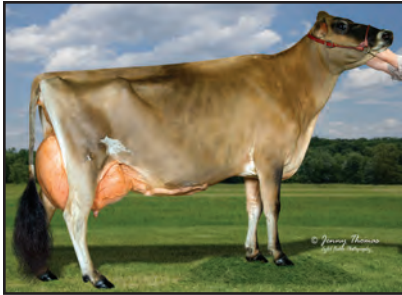
TJ CLASSIC MOMENT LAYLA Sister to the Dam of Lot 57