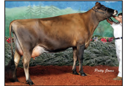
ENNISKILLEN RESPECT DAISY Grandam of Lot 76