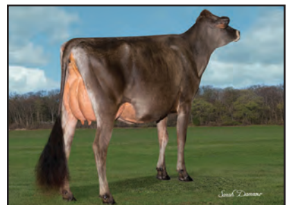
BILLINGS IMPRESSION BACKSTAGE-ET Sister to Lot 28