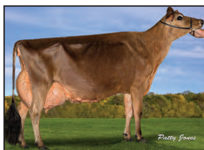
BRIDON IATOLA POLISH-ET Sister to the Grandam of Lot 35

BORN 06/14/2016 PO FEMALE EFI 6.9% AMERICAN ID 281 / 281