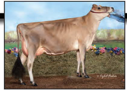
SOUTH MOUNTAIN SOCRATES JERICA-ET Dam of Lot 56

NEXT DAM: JULIANNAS DELUXE JUSTINE-ET 93% 3-01 305 2 22840 4.7 1080 3.5 799 86DCR 2762C 3RD JR 3-YEAR-OLD, 2004 CENTRAL NATIONAL 7TH JR 3-YEAR-OLD, 2004 ALL AMERICAN JERSEY SHOW 1ST JR 2-YEAR-OLD, 2003 MID-ATLANTIC REGIONAL SHOW 1ST JR 2-YEAR-OLD, 2003 CENTRAL NATIONAL SIRE: ELLIOTTS RENAISSANCE DELUXE GJPI -111 0%ILE