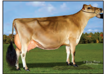
BILLINGS SULTAN BRYCE Sister to Lot 28