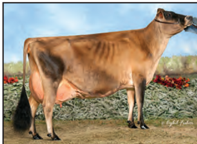
HURONIA CENTURION VERONICA 20J Great-Grandam of Lot 17