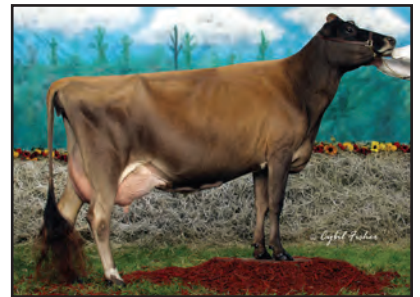
ELLIOTTS PREMONITION SABRINA Sister to the Grandam of Lot 8