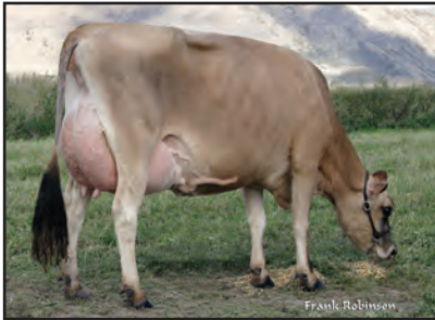
HAWARDEN FUTURE PIXY Great-Grandam of Lot 31