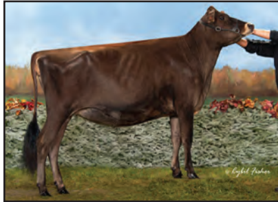
SSF TEQUILA FANTASIA Sister to the Grandam of Lot 43