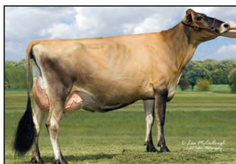
Sold in the 2008 sale HLF Excitation Evita, E-91% 2-9 305 3x 20,160 5.7% 1,141 3.6% 730