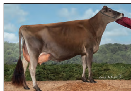
Sold in the 2010 sale Cooper Farm RBR Miss America-ET, E-91% 2 nd 4-year-old, 2013 Southern National Jersey Show