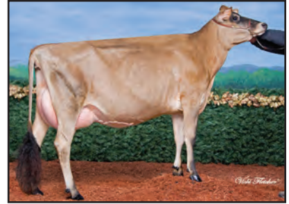
ARETHUSA DELUXE LYRIC-ET Grandam of Lot 42