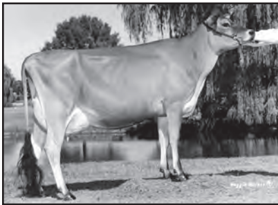
BOVI-LACT JUDE JEWEL-ET VG 89 (CAN) Fifth Dam of Lot 55