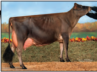
ELLIOTTS COMERICA SABLE-ET Sister to the Dam of Lot 13