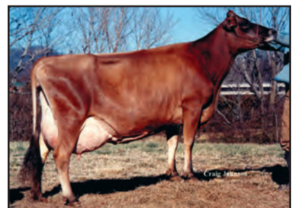
GABYS LEMVIG BARBIE Great-Grandam of Lot 36