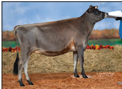
DKG JADE WILD PLUM Sister to the Dam of Lot 33