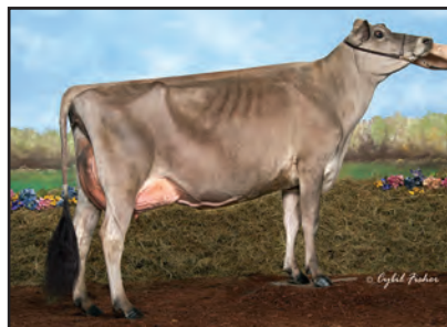
SOUTH MOUNTAIN VERB SUBLIME-ET Sister to the Dam of Lot 45