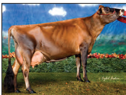
Sold in the 2003 sale Smart Remake Enchantment, E-93% Supreme Champ., 2005 World Dairy Expo Jr. Show