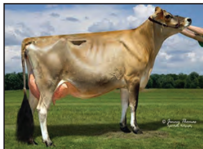
TJ CLASSIC ACTION VENUS Sister to the Grandam of Lot 37