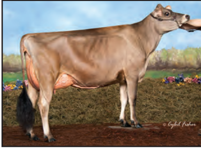
GLENVIEW TEQUILA FAWN, VG-89% 1st Sr. 2-year-old, 2014 International Jersey Show Daughter of Glenview ComERICA Frannie