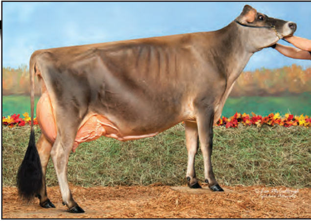
MARHAVEN MINISTER CORONA-ET, E-91% Sister to the Dam of Lot 62