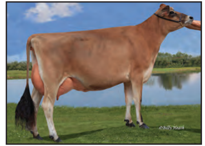
SV HEATHS RACHEL ALEXANDRA Sister to the Dam of Lot 60