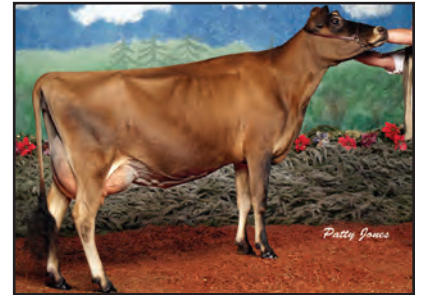
REXLEA JADE KARYN-ET Fourth Dam of Lot 12

4TH DAM: REXLEA JADE KARYN-ET EX 92 (CAN) 3-04 305 2 18619 4.8 891 4.1 759 CAN 2483C GRAND CHAMPION, 2003 BROME FAIR 1ST JUNIOR TWO-YEAR-OLD, 2003 BROME FAIR 3RD JUNIOR THREE-YEAR-OLD, 2004 ROYAL WINTER FAIR NOMINATED ALL CANADIAN JUNIOR THREE-YEAR-OLD, 2004