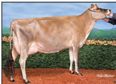
ARETHUSA VERONICAS CUPID-ET Sister to the Dam of Lot 9