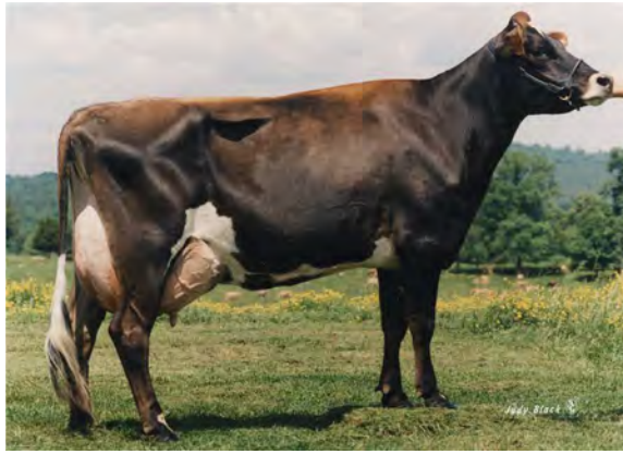
CHERUB COMMANDER FAWN, E-92% SIXTH DAM OF LOT 153