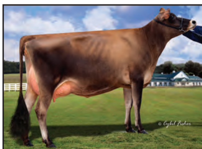
TJ CLASSIC VERBATIM VEGAS Sister to the Dam of Lot 37