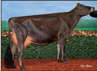
ELLIOTTS TEQUILA SENIORITA-ET Sister to the Dam of Lot 13