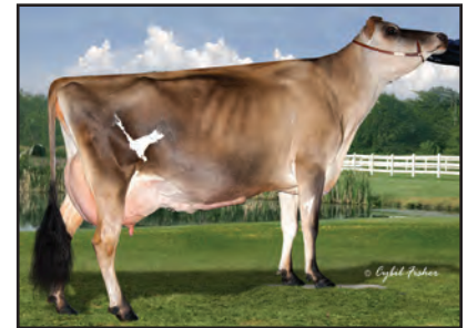
JUSTINES VALIANT JEMINI-ET Grandam of Lot 56