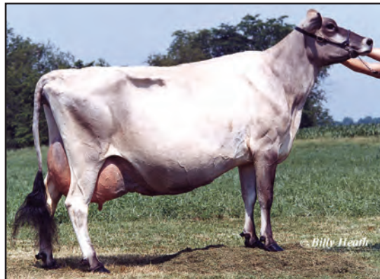
WESTER IMP INELL ISSY (5)-P, E-95% GRANDAM OF LOT 111