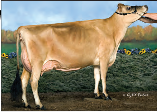
HILLACRES LAVENDER MARIGOLD, E-93% Grandam of Lot 66