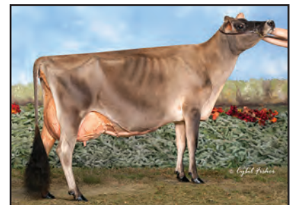
ARETHUSA VERONICAS COMET-ET Sister to the Grandam of Lot 54