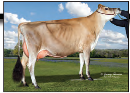
ARETHUSA HG LIBBY-ET Dam of Lot 42

4TH DAM: SILVER DREAMS FAITHFUL LINDY 86% 3-08 305 2 12180 5.1 616 3.9 470 94DCR 1626C