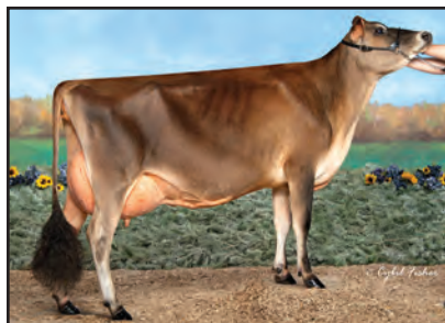
STEESSHANIE IATOLA TINKERBELL Dam of Lot 49