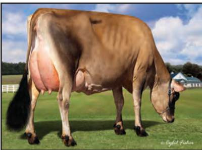
HAWARDEN HIRED GUN PIXEL Sister to the Dam of Lot 31