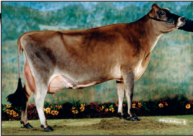
WOODRUFFS LESTER ELVIRA, E-95% Winner, 2001 National Jersey Jug Futurity Fifth Dam of Lot 6