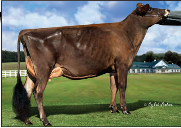
SCOTTIERE KACEY TEQUILA, VG-88% Dam of Lot 12