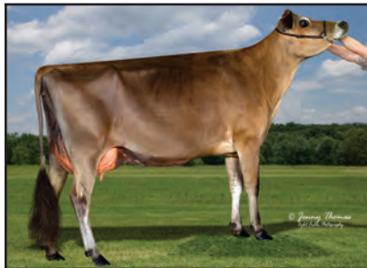
DKG MOTION BLINKY Sister to the Grandam of Lot 33