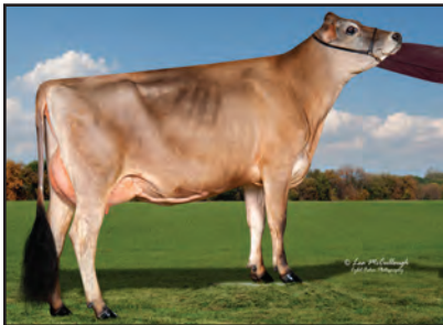
PAGE-CREST EXCITATION KARISMA-ET Sister to the Dam of Lot 29