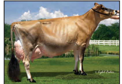
BRIDON VERIFY ELEVATE Grandam of Lot 16

4TH DAM: BRIDON AW ELECTRA-ET EX 90-6E (CAN) 3-00 305 2 17724 5.4 957 3.8 675 CAN 2336C 1 STAR BROOD COW IN CANADA, DECEMBER 2011