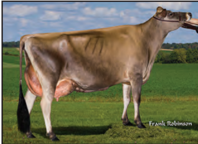
TJ CLASSIC MINISTER LEGACY Sister to the Dam of Lot 57

BORN 08/09/2015 TATTOO TJ76 / TJ76 P0 FEMALE EFI 5.4%