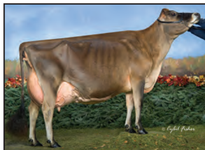
STEPHAN SPARKLER VERA-ET Great-Grandam of Lot 37