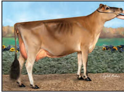
SVHEATHS JUSTICE JOELY Sister to the Dam of Lot 65