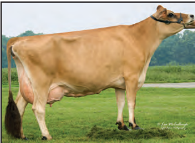
GORDONS COUNCELLER GIDGET Sister to the Grandam of Lot 15

BORN 12/03/2016 PO FEMALE EFI 3.8% AMERICAN ID 112 / 112