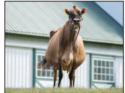
COWBELL GUAPO RICOCHET Sister to Lot 14