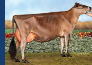
EDGEBROOK TEQUILA MADISON (CYBIL FISHER)

HIGHEST SELLING JERSEY OF ALL TIME $267,000 ALL AMERICAN 2015 AND RESERVE ALL AMERICAN 2016