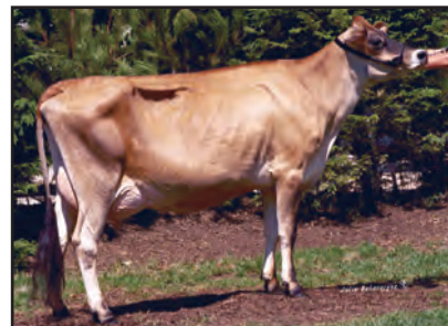
MARHAVEN JUNO RITA Great-Grandam of Lot 68

4TH DAM: MARHAVEN DUNCAN RIVA 84% 4-11 305 2 12210 5.5 673 4.2 508 94DCR 1655C