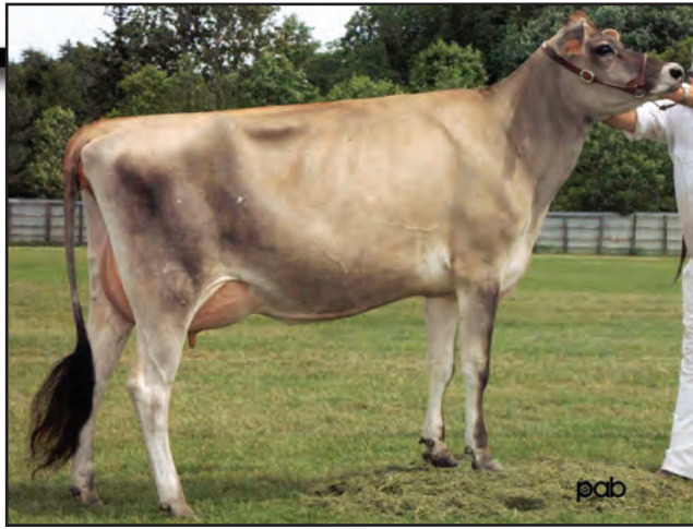
ROCK ELLA GILLER JAMIE-LEE, EX 90 (CAN) Fourth Dam of Lot 55