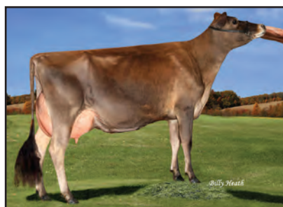
TJ CLASSIC VERBATIM VICTORIA-ET Sister to the Grandam of Lot 37