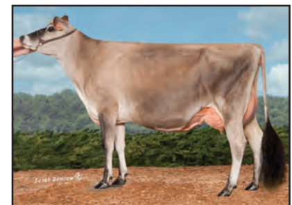
COWBELL GUAPO OREILLY-ET Sister to Lot 14