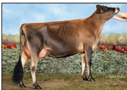
Sold in the 2011 sale Hixson Indiana Ilene, E-91% Reserve Junior All American Jr. 2-yr.-old, 2012