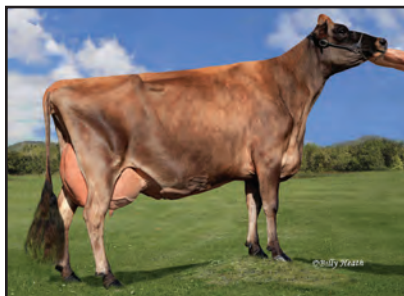
SHEER GRACE Grandam of Lot 35