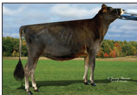
Sold in the 2013 sale TJ Classic Remake Vanna-ET 1st Summer yearling, 2013 International Jersey Show