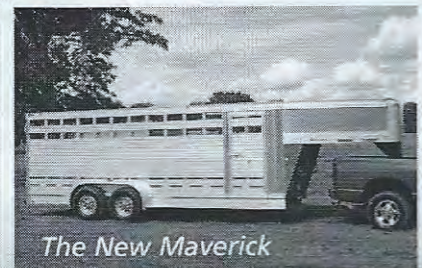
The New Maverick

M.H. EBY, Inc. | 4435 State Route 29 | P.O. Box 137 | West Jefferson, OH 43162 | 800-752-0507 | www.mheby.com