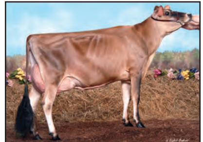
BILLINGS JADE BRYANT Sister to Lot 28