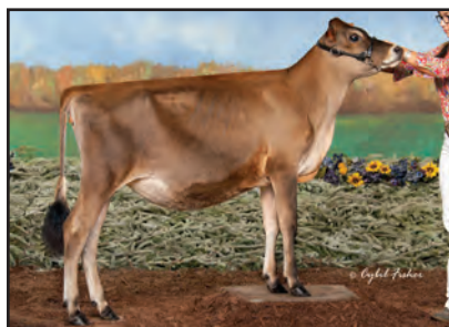
LLR PREMIER TOO LEGIT-ET Sister to Lot 49

BORN 03/06/2016 P1 FEMALE EFI 6.4% AMERICAN ID 7221 / 7221