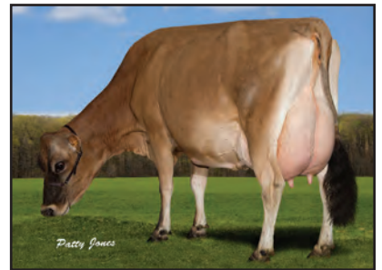
GABYS ACTION BABY-ET Grandam of Lot 36