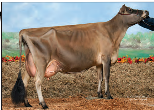
BELFONTAINE REMAKE OSHGOSH, E-93% Grandam of Lot 69