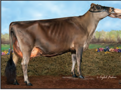
MAPLE-DOWNS HIRED GUN AMORA Dam of Lot 15