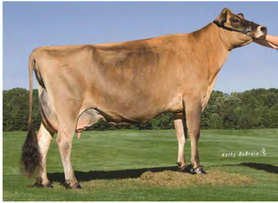
COWBELL JADE LA CU CA RA CHA, E-93% GREAT-GRANDAM OF LOT 156