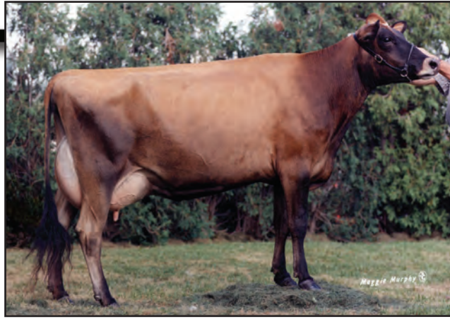
SS CHAMPIONS CONNIE OF SSF, E-90% Fourth Dam of Lot 67