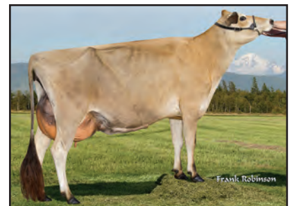
FAMILY HILL SOCRATES FLYNN-ET Sister to the Dam of Lot A