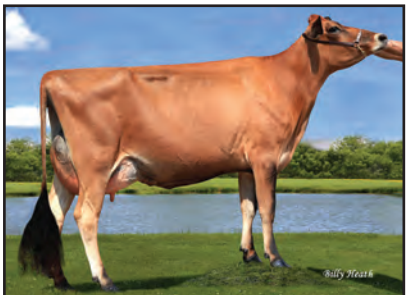
SVHEATHS VERBATIM JUBILEE Sister to the Dam of Lot 23