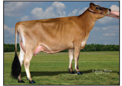
GABYS VIRGIL BUTTERSOTCH-ET Sister to Lot 36