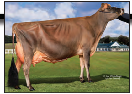
COWBELL GUAPO RICOCHET Sister to Lot 14

FAITHFUL DEE-ANN OF SSF 90% 10-06 305 2 10550 5.1 536 3.9 412 DHIR 1341C JUNIOR CHAMPION, 1985 ALL AMERICAN JR SHOW RESERVE SUPREME CHAMPION, 1991 OTTAWA CENTRAL NATIONAL EXHIBITION 3RD, 1988 NATIONAL JERSEY JUG FUTURITY