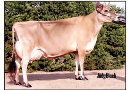
PLEASANT NOOK BERRETTA FELICE Grandam of Lot A