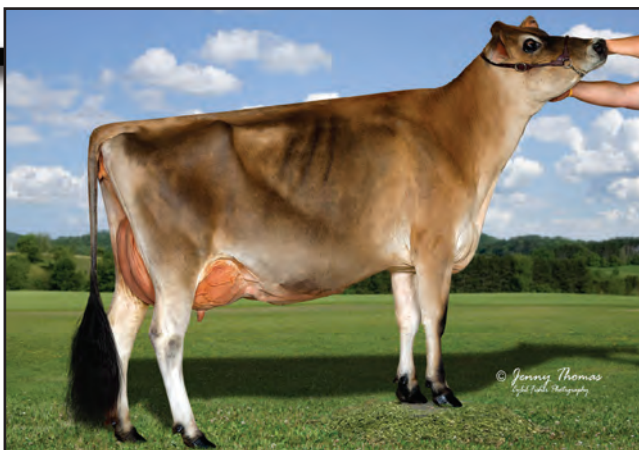
S&O GILLER RITZ BITZ, VG-87% Sister to Dam of Lot 68