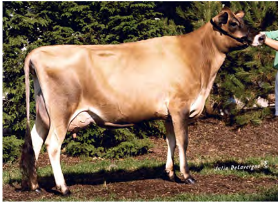
BDB GROVE PENNY FOURTH DAM OF LOT 127