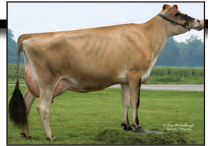
ENNISKILLEN CENTURION DAISY Dam of Lot 76

4TH DAM: ENNISKILLEN KNIGHT ASY GP 83 (CAN) 3-06 305 2 11572 5.9 679 4.6 527 CAN 1822C