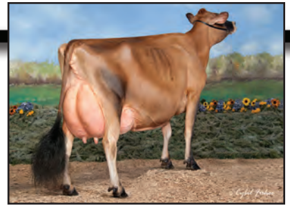
AVONLEA CONNECTED TO KANADA-ET Grandam of Lot 40

SISTER(S): AVONLEA KOOKIES KAHLUA EX 90-2E (CAN) 3-00 285 2 11232 5.4 606 4.1 456 CAN 1579C AVONLEA KOOKIES KISSES-ET EX 90-4E (CAN) 3-06 305 2 17775 4.1 736 3.8 677 CAN 2120C AVONLEA KOOKIES PRIME KANGA VG 87 (CAN) 4-02 305 2 18696 5.0 935 4.1 759 CAN 2553C ROCK ELLA JADE KAPRI-ET VG 88 (CAN) 5-06 305 2 13237 5.1 681 3.8 501 CAN 1734C ROCK ELLA JADE KOOKIE-ET VG 88 (CAN) 4-10 305 2 17453 4.6 798 3.6 633 CAN 2155C KOOKABEAR OF AVONLEA-ET EX 91 (CAN) 4-10 305 2 18535 5.3 979 3.7 684 CAN 2366C NOMINATED ALL CANADIAN JUNIOR THREE-YEAR-OLD, 2011 HM JUNIOR THREE-YEAR-OLD, 2011 ALLBREDS ACCESS AVONLEA KOOKIES KISKA EX 91 (CAN) 1-11 305 2 11380 5.2 591 4.1 465 CAN 1593C AVONLEA KOOKIES M KEEPSAKE-ET EX 93 (CAN) 3-09 305 2 16906 5.9 1003 3.5 600 CAN 2074C 3RD PLACE, 2013 ROYAL INTERNATIONAL FUTURITY NOMINATED ALL ONTARIO SENIOR TWO-YEAR-OLD, 2012 AVONLEA CONNECTED TO KRACKER-ET VG 88 (CAN) 2-00 290 2 12425 5.0 622 3.7 461 CAN 1595C NOMINATED ALL ONTARIO JUNIOR TWO-YEAR-OLD, 2012 AVONLEA KOOKIE DOUGH-ET EX 93 (CAN) 2-00 300 2 12174 4.9 591 3.6 443 CAN 1532C 3RD JUNIOR THREE-YEAR-OLD, 2013 ROYAL WINTER FAIR HONORABLE MENTION ALL ONTARIO JR 3-YEAR-OLD, 2013 AVONLEA KOOKIES KAMARO-ET VG 87 (CAN) 2-06 302 2 8403 5.0 417 3.7 313 CAN 1083C AVONLEA KOOKIES KORVETTE-ET EX 91-2E (CAN) 1-10 291 2 11817 5.3 631 3.6 426 CAN 1473C