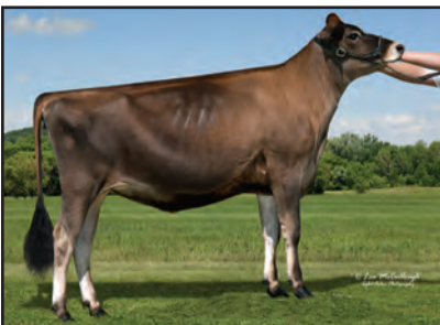
ELECTRAS EVOLUTION-ET Sister to the Dam of Lot 41

BORN 03/31/2016 TATTOO R4521 / R4521 PO BBR 100 FEMALE EFI 6.0% AMERICAN ID 4521 / 4521 JH1C JH2F