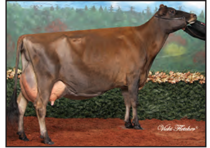
AVONLEA RENAISSANCE KOOKIE-ET Great-Grandam of Lot 40