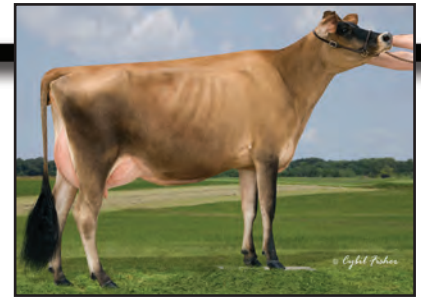
ARETHUSA COMERICA DOLCE VITA Grandam of Lot 54

SISTER(S): ELLIOTT'S DELUXE VANESSA-ET 92% 5-03 305 2 19990 5.3 1053 3.7 731 98DCR 2528C ELLIOTT'S SD VANNA-ET 93% ELLIOTT'S GOLDEN VISTA-ET 95% 3-04 365 2 22399 6.7 1502 4.2 939 DHIA 3254C ELLIOTT'S GOLDEN VANESSA-ET 93% 7-04 305 2 12110 4.7 574 3.3 401 101DCR 1384C ARETHUSA PRIMETIME DEJA VU-ET 95% 5-00 305 2 20000 5.0 996 3.8 763 96DCR 2640C ARETHUSA VERONICAS DASHER-ET 95% 7-04 305 3 27720 5.9 1643 3.6 1007 90DCR 3482C ARETHUSA VERONICAS PRANCER-ET 93% 6-09 305 2 21220 5.4 1143 3.9 829 97DCR 2869C ARETHUSA VERONICAS VIXEN-ET 92% 6-10 305 2 24160 6.2 1499 3.9 935 95DCR 3236C ARETHUSA VERONICAS COMET-ET 95% 4-06 305 2 19970 6.5 1292 3.6 710 96DCR 2454C ARETHUSA VERONICAS CUPID-ET 94% 5-06 305 2 18310 4.6 837 3.6 663 95DCR 2258C ARETHUSA RESURRECTION VERSACE-ET 93% 7-09 305 2 22150 5.4 1190 4.0 877 96DCR 3036C ARETHUSA PRIMETIME VONDA-ET 92% 4-06 289 2 18740 5.1 950 3.5 659 97DCR 2278C ARETHUSA PRIMETIME VOILA-ET 92% 5-09 305 2 20350 6.5 1313 4.1 832 ODCR 2882C ARETHUSA PRIMETIME VOYAGE-ET 92% 4-03 300 2 19580 6.2 1207 3.9 759 97DCR 2627C ARETHUSA RESPONSE VANITY-ET 93% 5-10 305 2 22760 6.4 1465 3.3 751 98DCR 2593C ARETHUSA RESPONSE VIEW-ET 92% 6-04 305 2 20110 5.8 1163 3.7 749 97DCR 2591C ARETHUSA RESPONSE VIVID-ET 95% 6-00 305 2 22670 6.5 1482 3.5 790 97DCR 2730C ARETHUSA SOCRATES VALDINA-ET 92% 4-05 305 2 21970 6.4 1398 3.6 782 96DCR 2703C ARETHUSA GOLD VENUS-ET 94% 5-01 305 2 19270 5.6 1079 3.9 747 95DCR 2585C