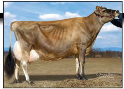
BILLINGS LS BOO BOO Dam of Lot 28