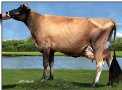
ARETHUSA HG BLUSHING-TWIN Dam of Lot 39