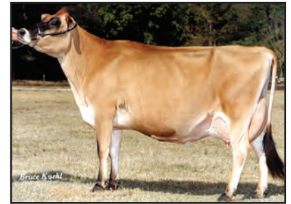
BUTTERFIELD CHAMPION PRAIRIE Great-Grandam of Lot 74

4TH DAM: BUTTERFIELD REWARD POLLYANNA 95% 9-00 365 3 20934 4.7 983 4.0 829 DHIR 2655C ALL AMERICAN AGED COW, 1998 RESERVE ALL AMERICAN AGED COW, 1997