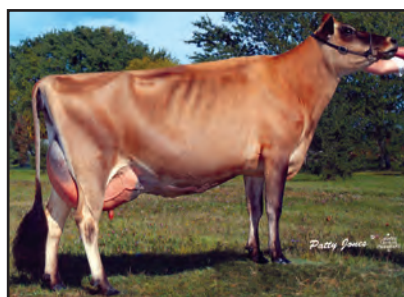
PREMONITION GRACE Great-Grandam of Lot 35