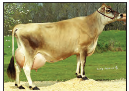
GABYS ALF BALLET Fourth Dam of Lot 36