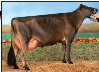
ARETHUSA TEQUILA VISION Sister to Lot 9