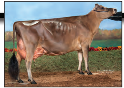
FAMILY HILL COMERICA FLAME-ET Dam of Lot A

4TH DAM: GOLDCREST RENO FANTASY 90% 9-11 305 2 21500 4.0 865 3.2 682 90DCR 2324C RESERVE SENIOR & RESERVE GRAND CHAMPION, 1998 WESTERN NATIONAL JERSEY SHOW