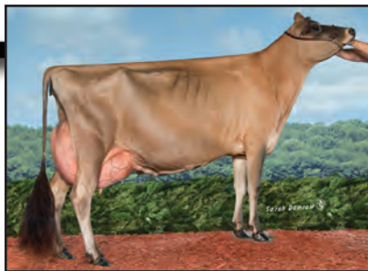
SOUTH MOUNTAIN VOLTAGE SPICE-ET Dam of Lot 45