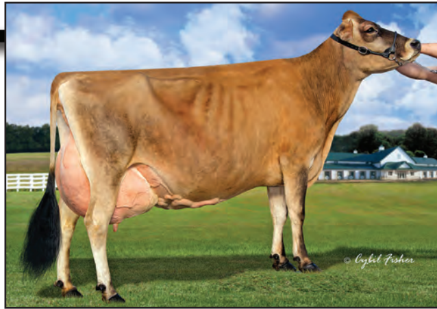
HAWARDEN JACE PIX, E-95% Grandam of Lot 31