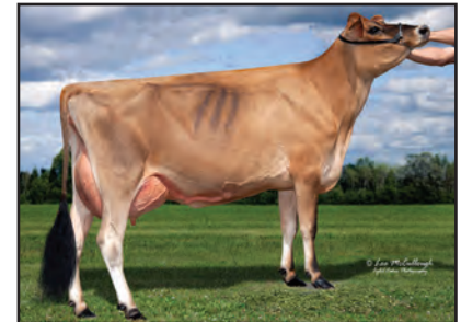
AVONLEA INTL DARE TO DREAM Sister to the Dam of Lot 54