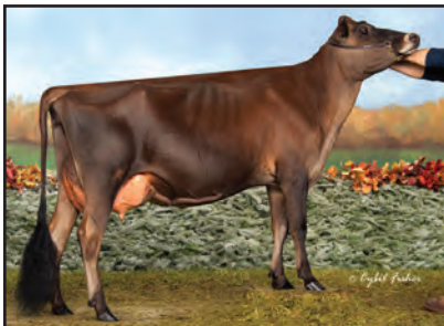
ARETHUSA IMPRESSION SUNSHINE-ET Sister to the Dam of Lot 13