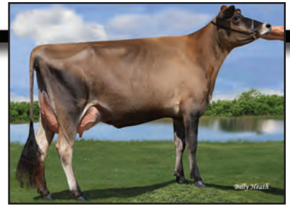
SV HEATHS VERBATIM ROSA-ET Dam of Lot 60

4TH DAM: BACHELORS APACHE REXANNE 82% 5-01 305 2 18600 4.7 872 3.5 658 84DCR 2274C