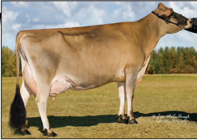
BUTTERFIELD BARBER PRAYER, E-90% Grandam of Lot 74