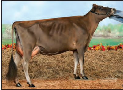
TJ CLASSIC MOMENT LEGACY Dam of Lot 57