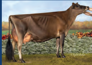
PAYNESIDE MAC-N-CHEESE (CYBIL FISHER)

HIGHEST SELLING JERSEY OF ALL TIME $267,000 ALL AMERICAN 2015 AND RESERVE ALL AMERICAN 2016