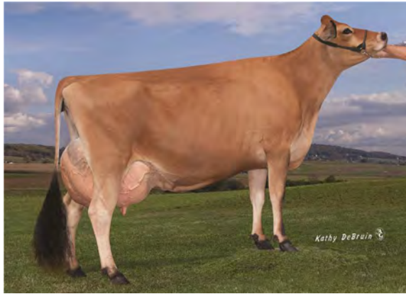
HI-LAND ZIPPER FLUFFY, VG-84% DAM OF LOT 157