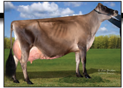
OAKFIELD TBONE VIVIANNE-ET Dam of Lot 20

GENESIS RENAISSANCE VIVIANNE VG 87 (CAN) 5-00 305 2 12110 4.2 514 3.8 461 CAN 1464C 7 STAR BROOD COW IN CANADA, SEPTEMBER 2012