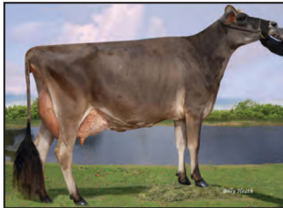
SV/HEATHS GILLER JUNE Sister to the Dam of Lot 65