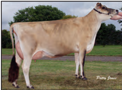
REXLEA REMAKE GERMAINE Fourth Dam of Lot 27