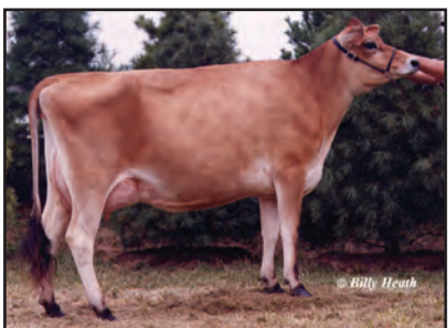
BONNYBURN JOEL SABRINA Great-Grandam of Lot 23

BORN 09/09/2016 PO FEMALE EFI 3.0% AMERICAN ID 4741 / 4741