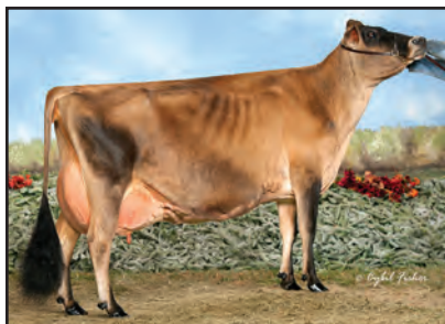
HURONIA CENTURION VERONICA 20J Great-Grandam of Lot 39