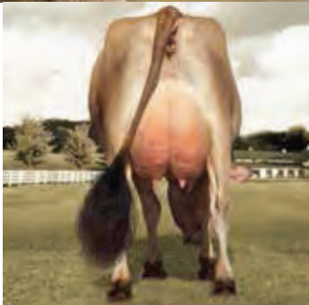
CRAZE's dam, remaining photos first lactation