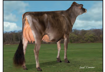
BILLINGS IMPRESSION BACKSTAGE-ET Sister to Lot 30