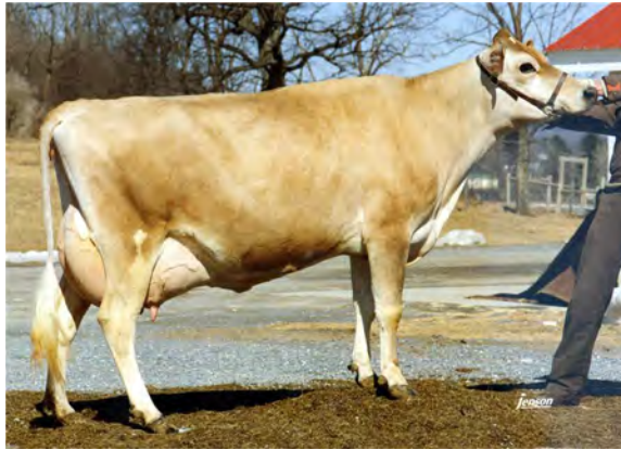
GREENRIDGE FW CHIEF ALTHEA-ET, E-92% SEVENTH DAM OF LOT 158