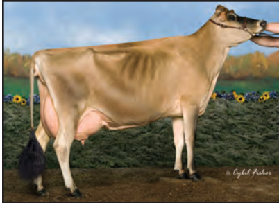
DREAMVALLEY GOLDEN TIP Great-Grandam of Lot 47