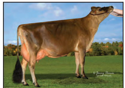
BILLINGS MINISTER BREIGH Sister to Lot 28