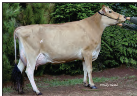
Sold in the 1997 sale OBryans Merit Trena Mae, E-91% 11-10 305 19,510 8.9% 1,730 3.8% 736

Celebrating a long history of selling the great ones. These are just a few of the well-known girls that have crossed the auction block in this annual spring sale.