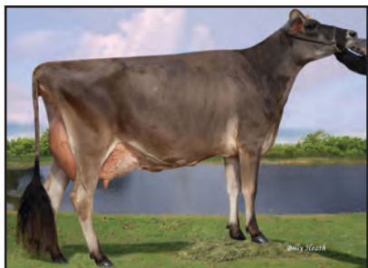
SV/HEATHS GILLER JUNE Dam of Lot 23