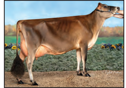
STEESHANIE IATOLA TINKERBELL Dam of Lot 24

4TH DAM: JANECEK HVF LAST CHANCE TRICIA EX-2E (CAN) 3-10 305 2 12681 4.7 600 3.8 478 CAN 1624C