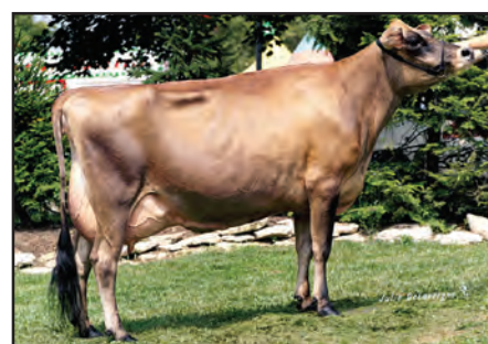
Sold in the 2000 sale Shell Ray Remake Margo, E-93% Reserve Grand Champion, 2007 Ohio Spring Expo