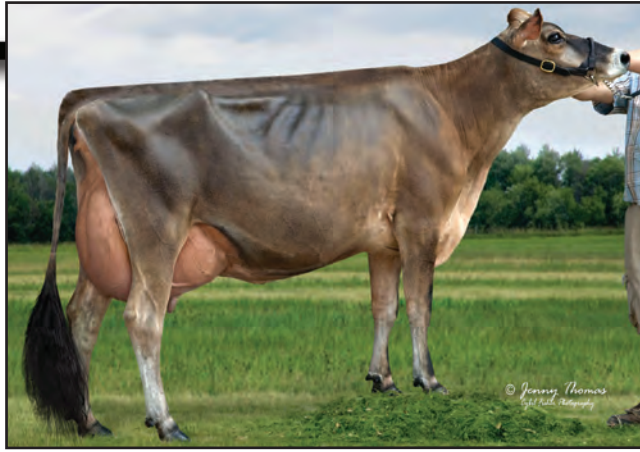
TJ CLASSIC SULTAN MIRACLE, E-91% Great-Grandam of Lot 75