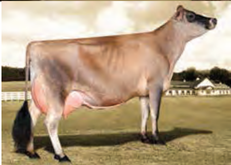
CRAZE's dam, second lactation photo, milking over 80lbs a day