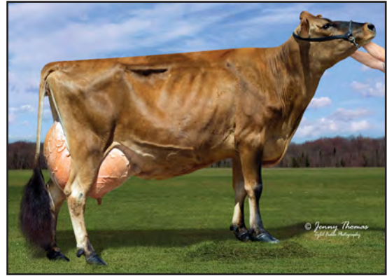
BUTTERCREST BLACKSTONE PRICELESS, 92% GRANDAM OF LOT 959