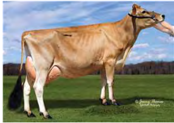
OHIO ZUMA BLACKSTON 95, E-90% SISTER TO THE GRANDAM OF LOT 234