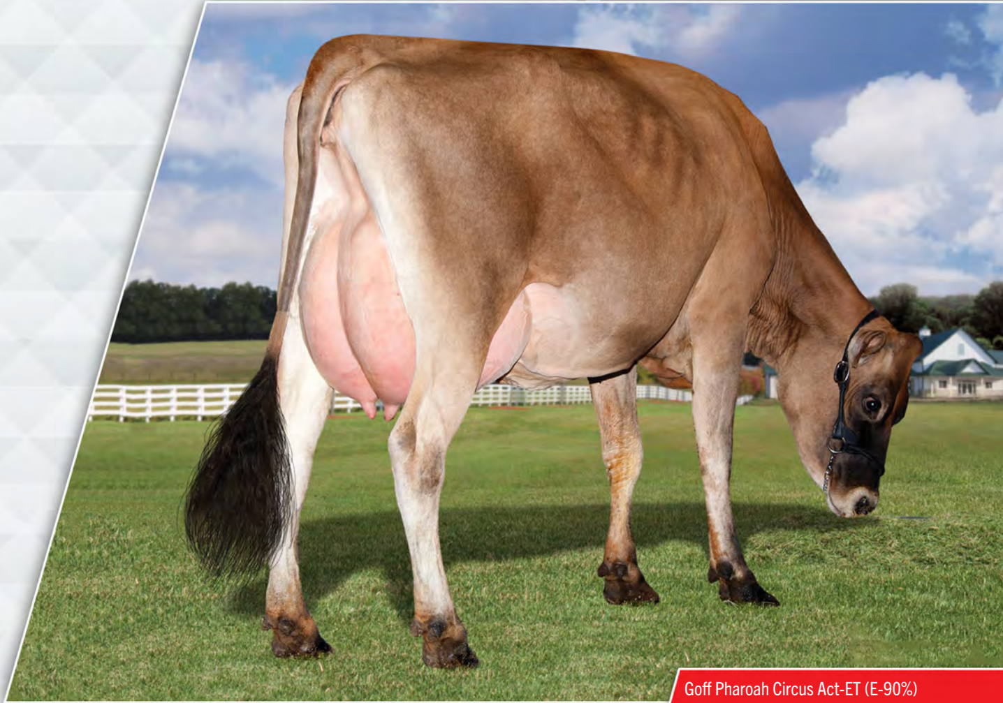
Goff Pharoah Circus Act-ET (E-90%) Third Dam of CLEVER