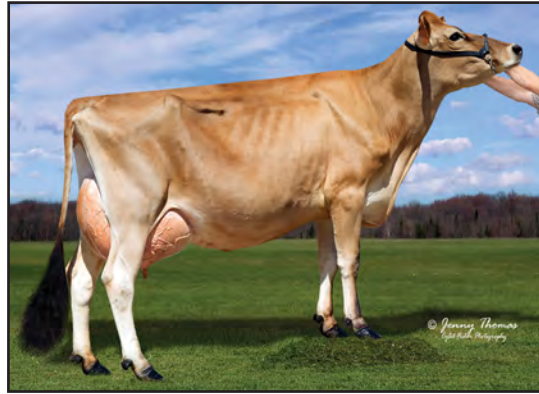
NEZINSCOT IMPULS TESS, E-93% GRANDAM OF LOT 688