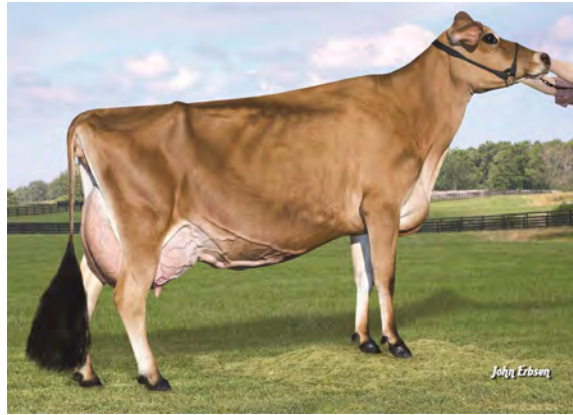
NEZINSCOT IMPULS TESS, E-93% GREAT-GRANDAM OF LOT 146