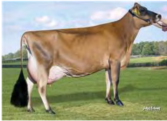
JARS OF CLAY TBONE BELLE, VG-86% GREAT-GRANDAM OF LOT 892