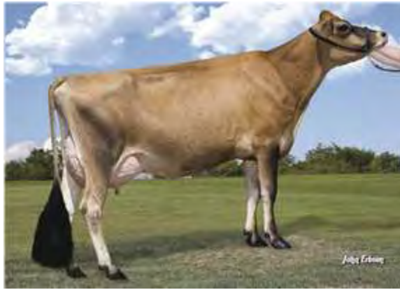
OHIO OLIVER KANOO 307-P, VG-86% DAM OF LOT 196