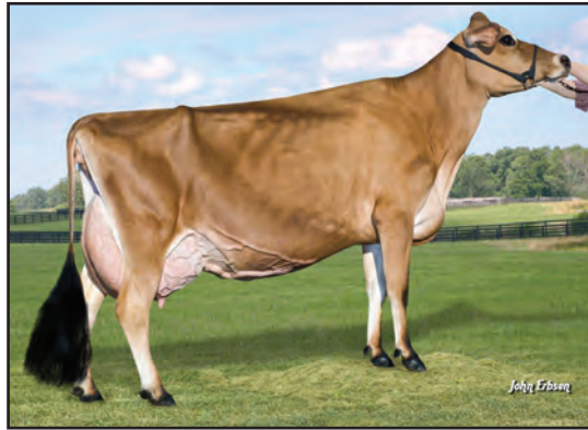
NEZINSCOT IMPULS TESS, E-93% GRANDAM OF LOT 950