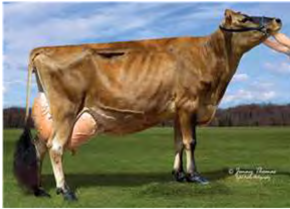
BUTTERCREST BLACKSTONE PRICELESS, E-92% GREAT-GRANDAM OF LOT 234