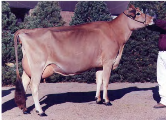
SPARKLER CORTNEY OF SS-ET, E-93% FULL SISTER TO THE GREAT-GRANDAM OF LOT 4216