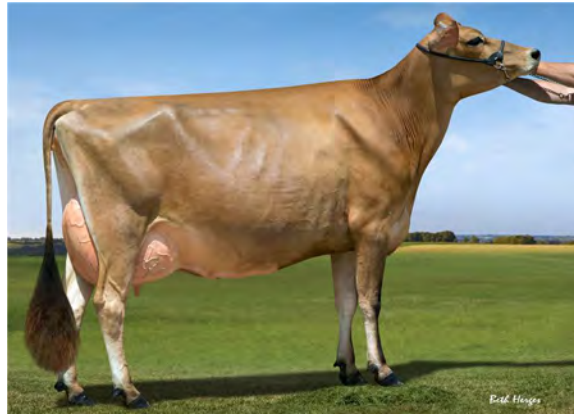
NORSE STAR PREMIER DEVINE, E-90% DAM OF LOT 4418