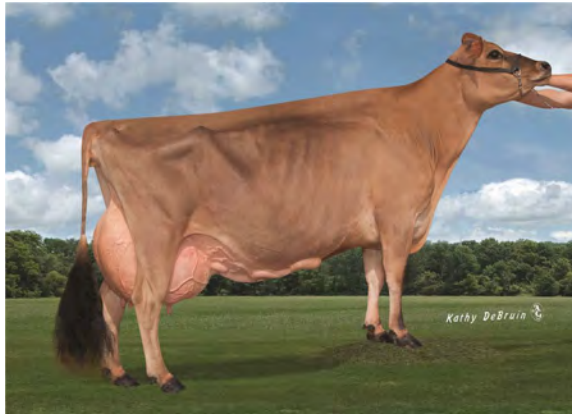
NORSE STAR SULTAN FARRAH, E-92% GRANDAM OF LOT 3750