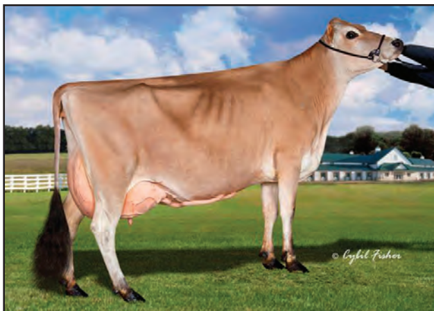
SUNSET CANYON HEADLINE DAFFY 3-ET, E-90% SISTER TO THE GRANDAM OF LOT 4374