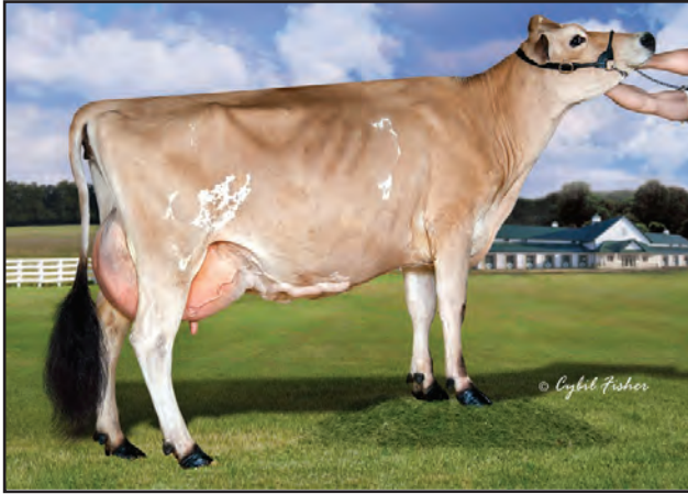
SUNSET CANYON REN DAHLIA 939-ET, VG-88% SISTER TO THE DAM OF LOT 4374