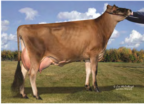
HEARTLAND ACTION KAVA-ET, VG-85% DAM OF LOT 3939