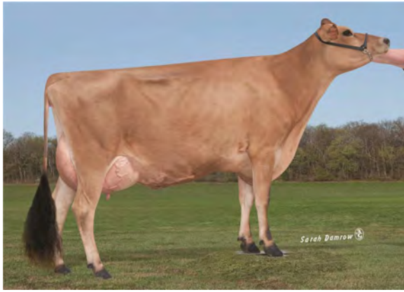
PRAIRIE HARBOUR RENEGADE MAGPIE-TWIN, VG-88% DAM OF LOT 826