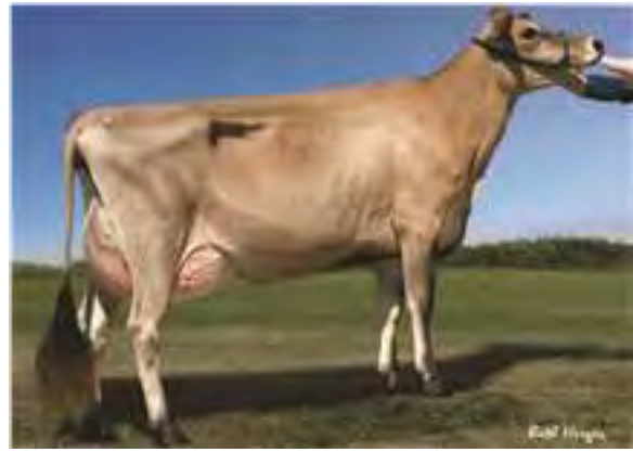
NORSE STAR LENNOX TWINKLE-ET, VG-88% SISTER TO THE DAM OF LOT 4291