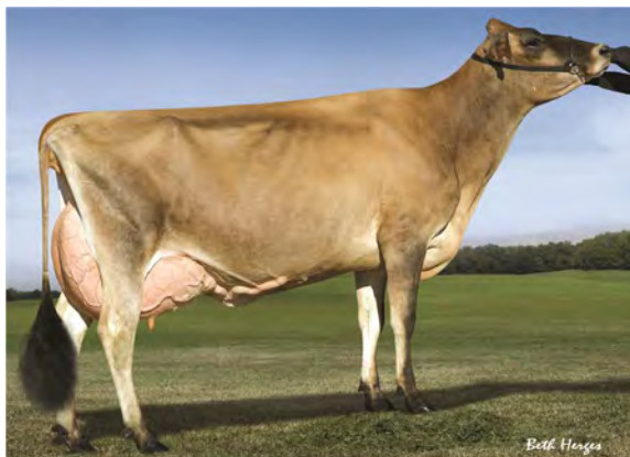
NORSE STAR ARCO N2929, VG-88% GRANDAM OF LOT 4484