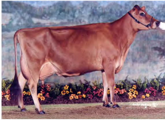
DUNCAN CHIEF DOTTY, E-95% FOURTH DAM OF LOT 4015