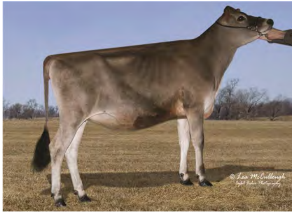
HARDSCRABBLE GOVERNOR DESIRE, E-91% GRANDAM OF LOT 4331 MANY SHOW WINNINGS AS A HEIFER