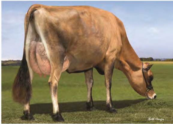
NORSE STAR PREMIER TWIRL-ET, E-90% SELLING AS LOT 3758