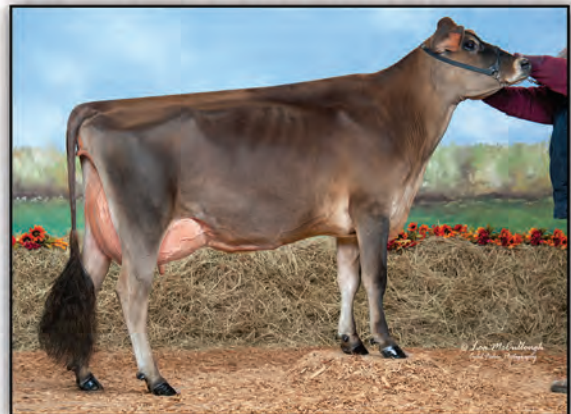
Norse Star latola Brooklyn, E-93%

Reserve All American 4-Year-Old, 2011 Reserve All American Junior 3-Year-Old, 2010