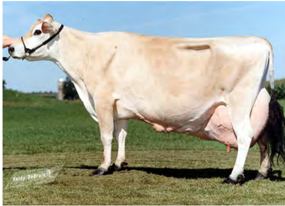
NORMANDELL KHAN ARIEL, VG-84% GREAT-GRANDAM OF LOT 3192 FORMER WORLD MILK & PROTEIN CHAMPION