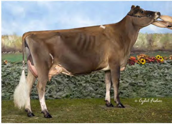
NORSE STAR IATOLA CHAMPAGNE-ET, VG-87% SISTER TO LOT 3888