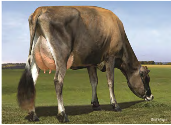
NORSE STAR JOEL 4146, VG-87% SISTER TO LOT 3726