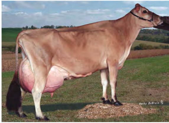
NORSE STAR JUDE BERRY, E-92% GREAT-GRANDAM OF LOT 4476