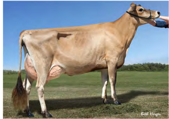
NORSE STAR LENNOX TWINKLE-ET, VG-88% DAM OF LOT 3758