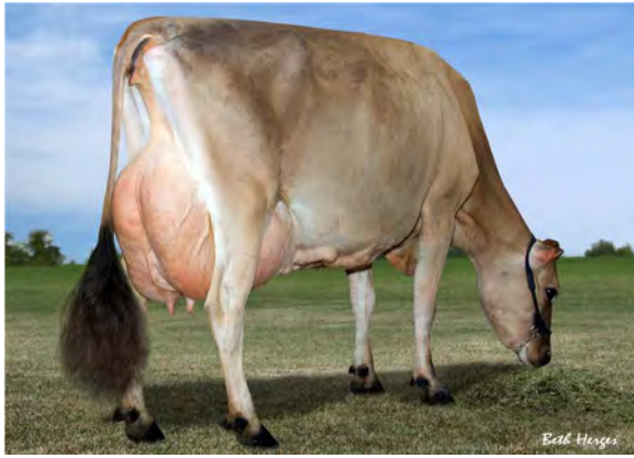
NORSE STAR IATOLA BECKA-ET, VG-88% SISTER TO THE DAM OF LOT 2963