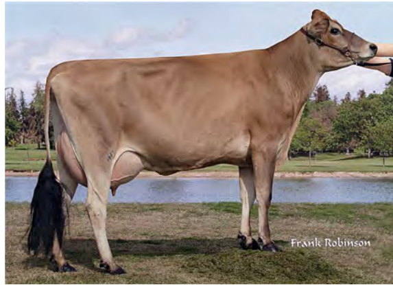
JO-GEP HALLMARK PARTY TIME, E-90% FOURTH DAM OF LOT 4265