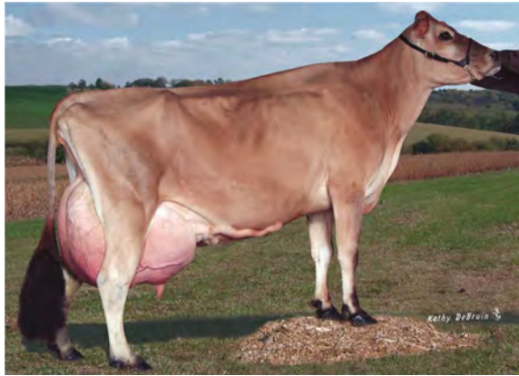
NORSE STAR JUDE BERRY, E-92% GREAT-GRANDAM OF LOT 3413 2006 WISCONSIN COW OF THE YEAR