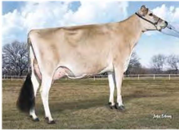
HAWARDEN IMPULS FLOSSIE, E-92% SISTER TO THE DAM OF LOT 4061