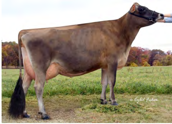
SSF SIGNATURE POLLY, E-92% GREAT-GRANDAM OF LOT 3816