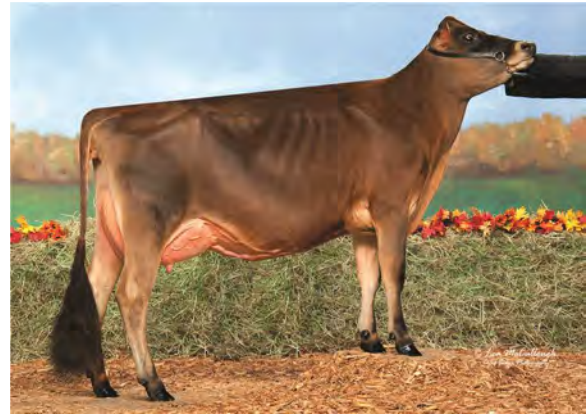
NORSE STAR VITALITY RAVEN, VG-85% DAUGHTER OF LOT 196