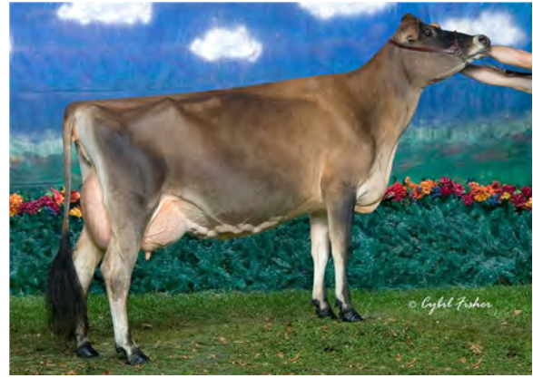
BJ JADE MIRACLE-ET, E-94% GREAT-GRANDAM OF LOT 4101