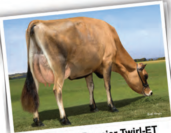
Norse Star Premier Twirl-ET