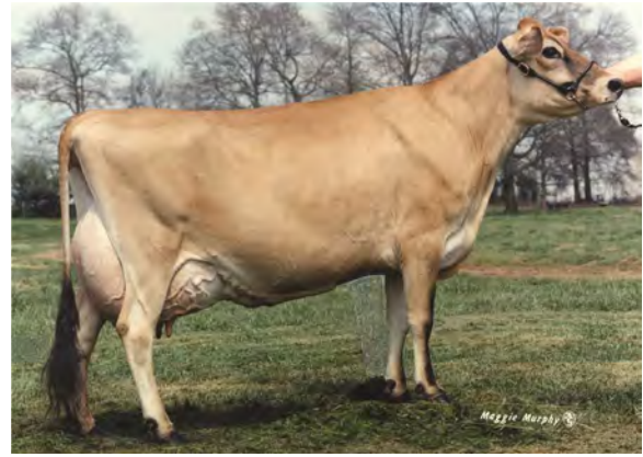
TP ACRES B SOONER MANDY FLIRT, E-96% GREAT-GRANDAM OF LOT 3886