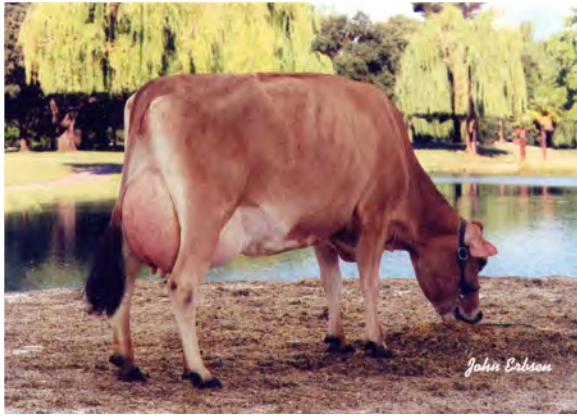
OAK MOUND ALF PRIME, E-92% GRANDAM OF LOT 3006