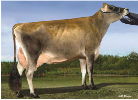
BJ TEQUILA MOOLA, VG-85% DAM OF LOT 4101