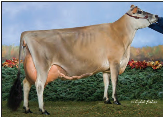
FAMILY HILL AVERY FIRE, E-95% SISTER TO THE DAM OF LOT 308