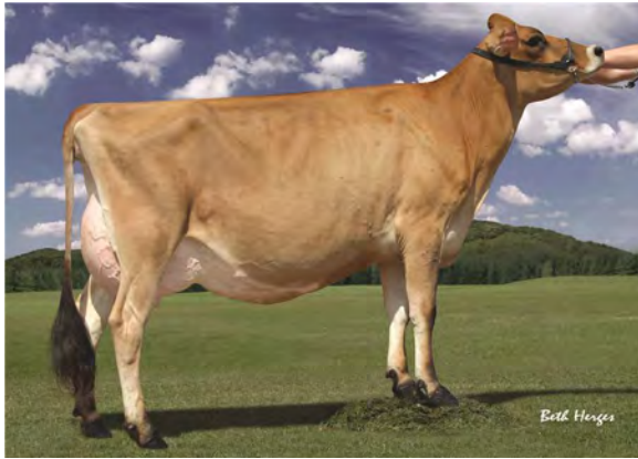
CONNECTION CALI OF NORSE STAR, E-91% SISTER TO LOT 3882