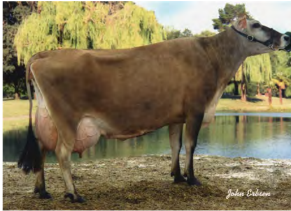
OAK MOUND BERRETTA EBONY {4}, E-92% GREAT-GRANDAM OF LOT 2745