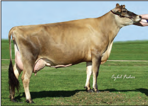
SAMBO FRAN OF FAMILY HILL, E-93% DAM OF LOT 308