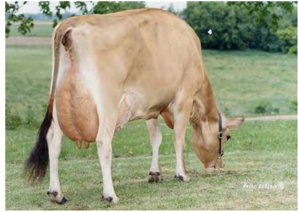
DUNCAN CHIEF DOTTY, E-95% FOURTH DAM OF LOT 3770