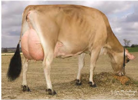
NORSE STAR 1107 NUGGET, E-90% GRANDAM OF LOT 3846