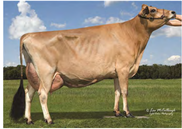
MARSHFIELD BLACKSTONE MOZZA, E-90% GRANDAM OF LOT 4245