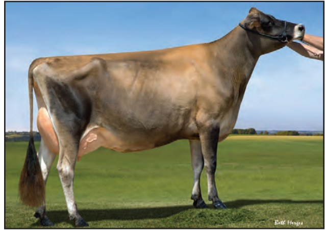
RATLIFF TEQUILA AGGIE-ET, E-90% SELLING AS LOT 938