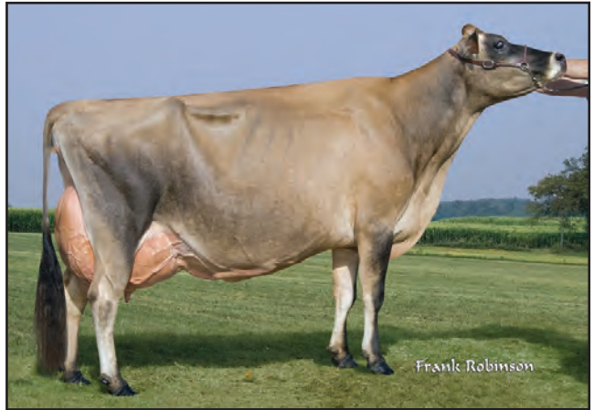
FAMILY HILL SAMBO FERN, E-95% SISTER TO THE DAM OF LOT 308