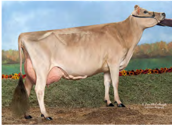
NORSE STAR ALLSTAR MAIDEN, E-91% SELLING AS LOT 3323