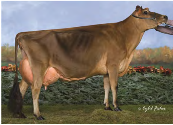
BRJ DUASEOIR BARBER FLIRT K-33-ET, E-93% DAM OF LOT 3886