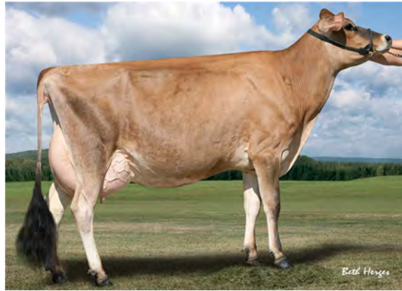
NORSE STAR TEQUILA WILLA, VG-86% SISTER TO THE DAM OF LOT 4171