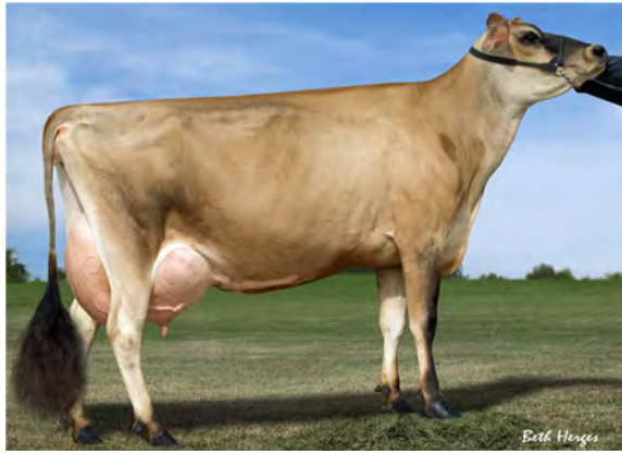
NORSE STAR IATOLA BELLA-ET, E-90% GRANDAM OF LOT 3477