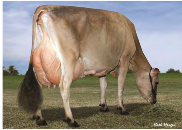
NORSE STAR IATOLA BECKA-ET, VG-88% DAM OF LOT 4250