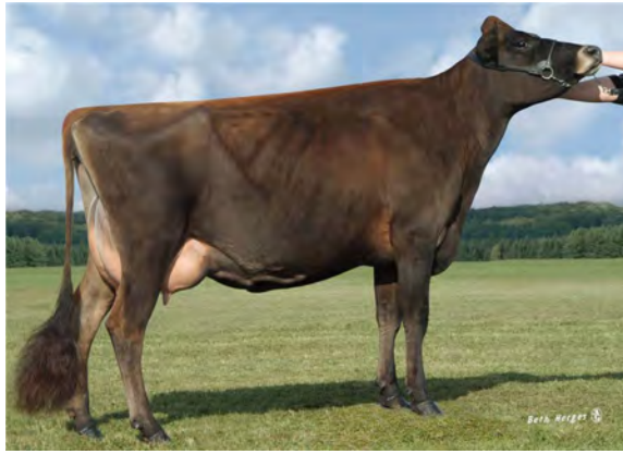
SHADY SPACE KAPTAIN JENNA, E-94% GRANDAM OF LOT 4176