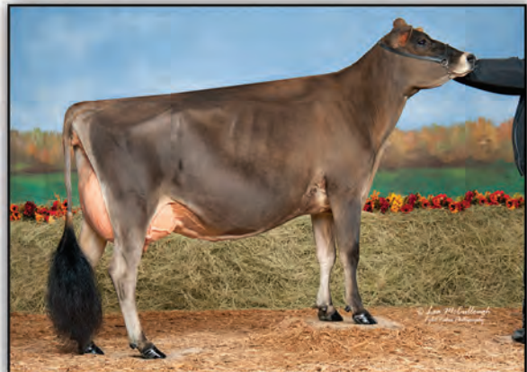
Norse Star Tequila Shotski, E-93%

3 rd Milking Yearling, 2016 All American Jersey Show