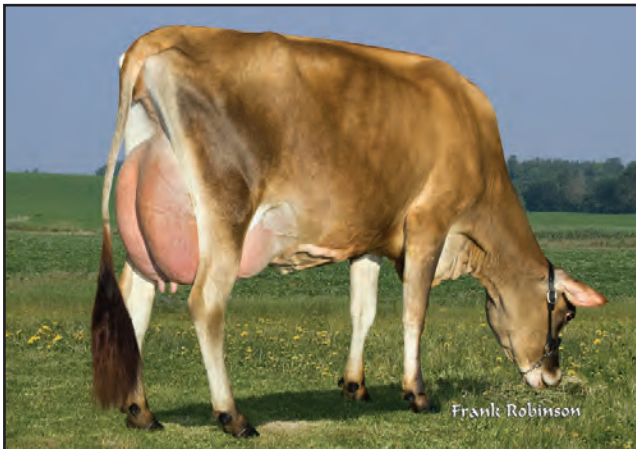
PEARLMONT JIMMIE DAWN-ET, E-90% SISTER TO THE GRANDAM OF LOT 4374