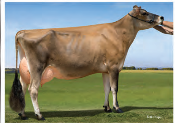
Norse Star Premier Adore