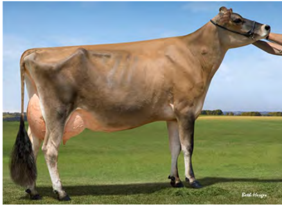
NORSE STAR PREMIER ADORE, E-91% SELLING AS LOT 3763