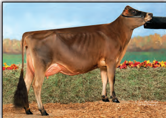
Norse Star Vitality Raven, VG-85%

Reserve All American Junior 2-Year-Old, 2012