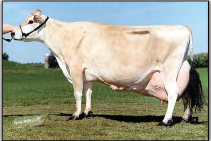
Norse Star Khan Ariel, VG-84%

World Production Leader for Fat Production 3-0 365 39,239 7.2% 2,827 3.8% 1,500 92DCR