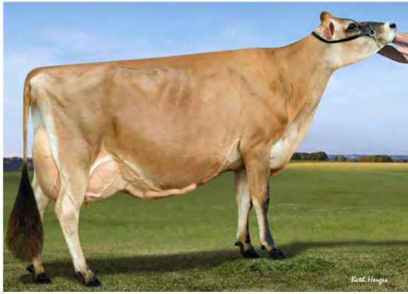
SUPER-K TBONE RUSTY, E-93% SELLING AS LOT 196