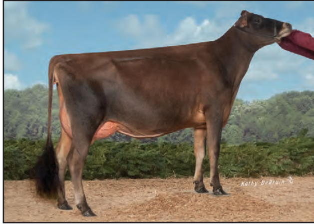
HARMONY CORNERS SOCRATES 11086-ET, E-92% SISTER TO LOT 308