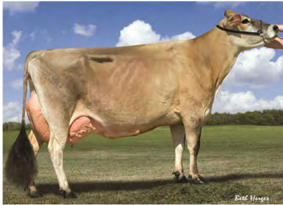
NORSE STAR JAMAICA N2656, E-90% SISTER TO THE DAM OF LOT 3970