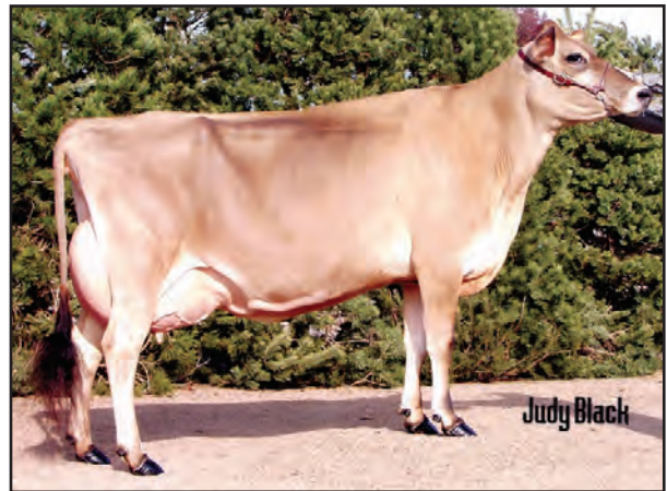
PLEASANT NOOK BERRETTA FELICE, E-95% SISTER TO THE DAM OF LOT 308