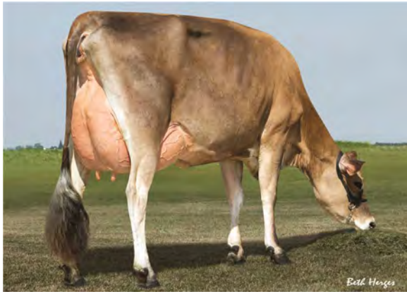
BLUE MOUNTAIN TEQUILA DAPHNE-ET, E-90% DAM OF LOT 4443