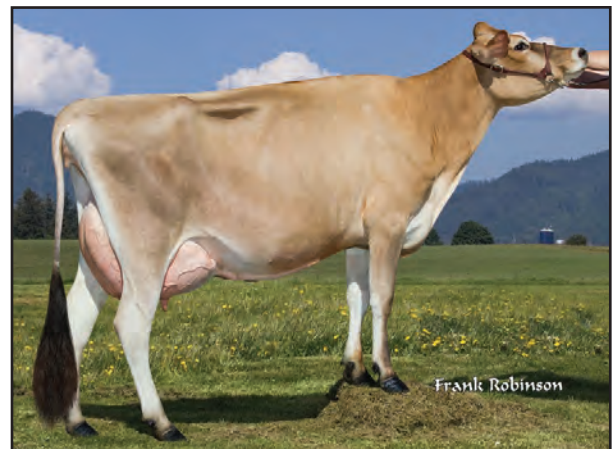
SUNSET CANYON VIBRANT DAFFY 921-ET, E-91% SISTER TO THE GRANDAM OF LOT 4374