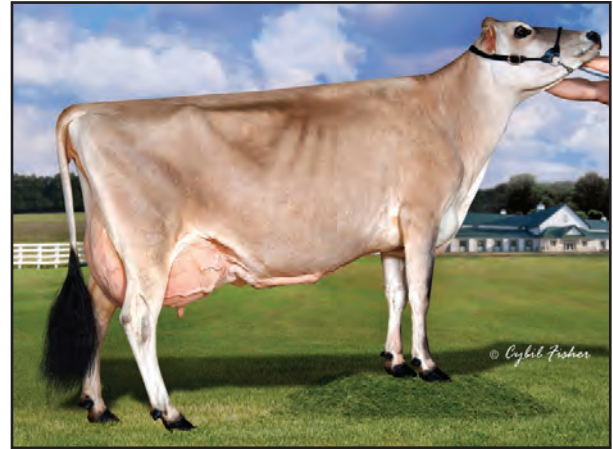
PEARLMONT RESTORE DIXIE-ET, E-90% SISTER TO THE GRANDAM OF LOT 4374