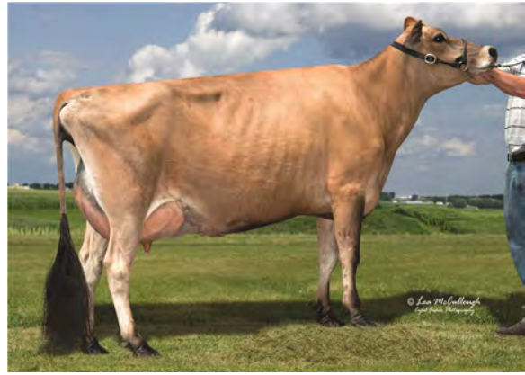
BLUE MOUNTAIN TEQUILA DELILAH-ET, E-92% SISTER TO THE DAM OF LOT 4443