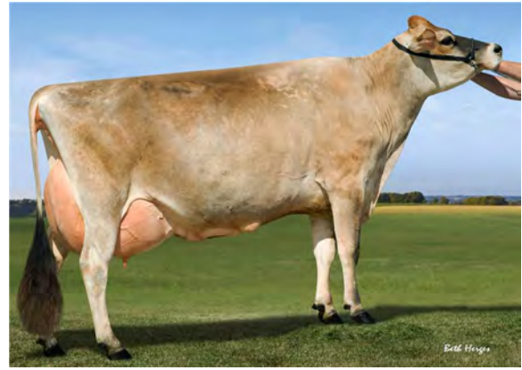
SUPER-K LENNOX RUBY, E-90% DAM OF LOT 4327