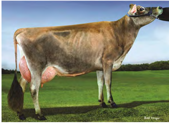
NORSE STAR DAYBREAK 3823, VG-84% SELLING AS LOT 3823