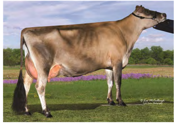
PIERSTEIN JADE DIVAS-ET, E-91% DAM OF LOT 21