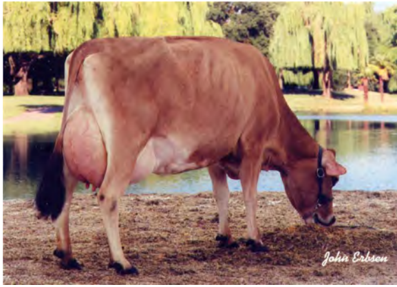
OAK MOUND ALF PRIME, E-92% GREAT-GRANDAM OF LOT 4028