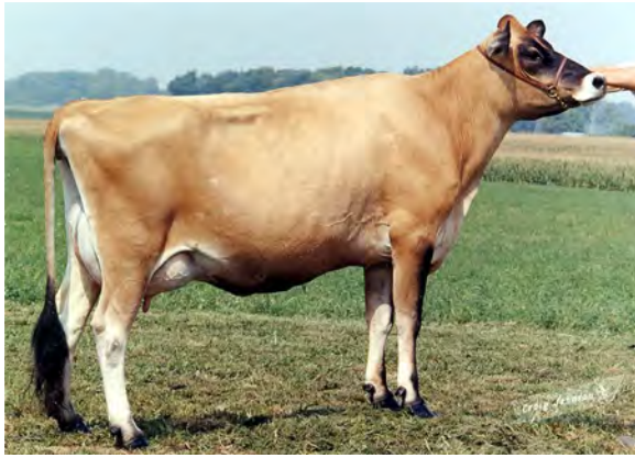
NETTLE CREEK PATRICK ROSA-ET, VG-88% FOURTH DAM OF LOT 4117