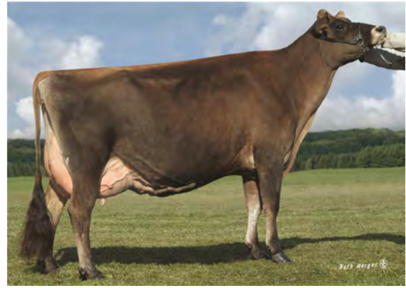
HARMONY CORNERS CALICO, E-91% DAM OF LOT 3888