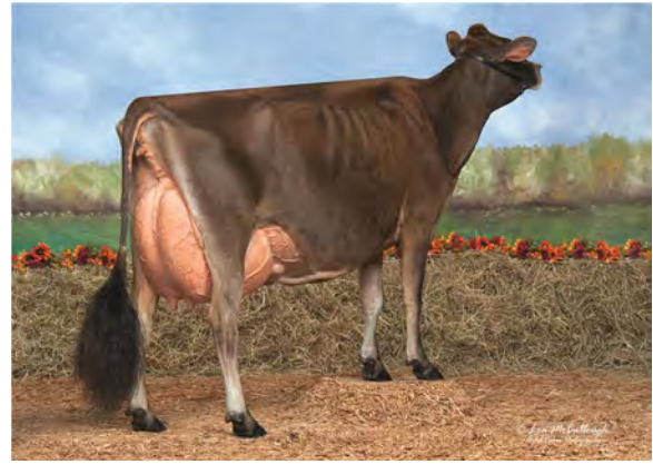
NORSE STAR TEQUILA KATIE (4), E-94% DAM OF LOT 4199