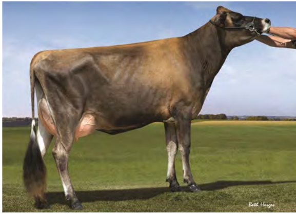
NORSE STAR JOEL 4146, VG-87% SELLING AS LOT 4146