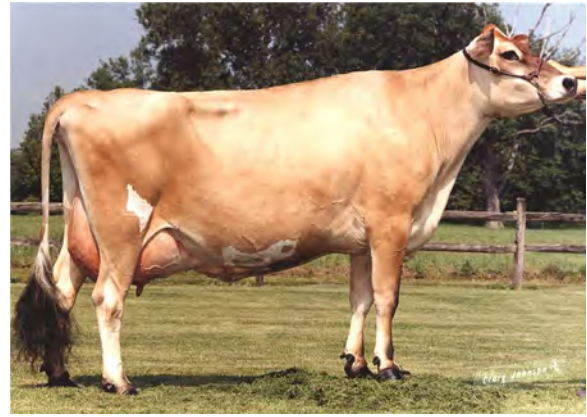
JUNO ROSANNE OF NETTLE CREEK-ET, E-91% FIFTH DAM OF LOT 4117