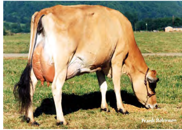
WILSONVIEW B MAGGIE MAY-ET, E-93% FOURTH DAM OF LOT 826