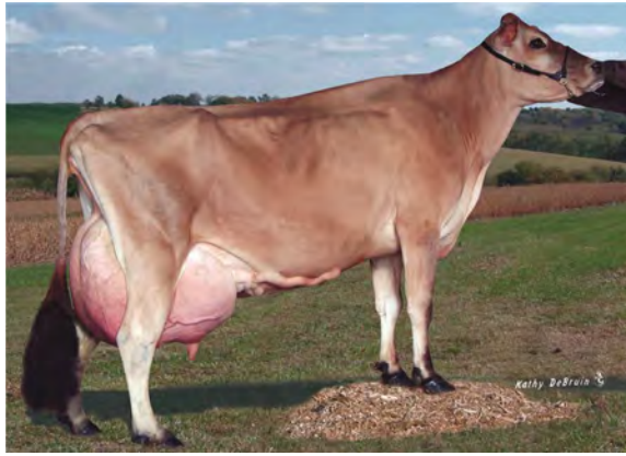
NORSE STAR JUDE BERRY, E-92% GREAT-GRANDAM OF LOT 4210