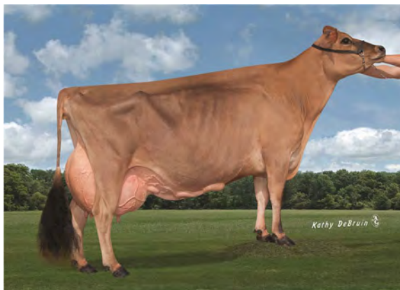
NORSE STAR SULTAN FARRAH, E-92% DAM OF LOT 3559 GRANDAM OF FIERCE AT SELECT SIRES