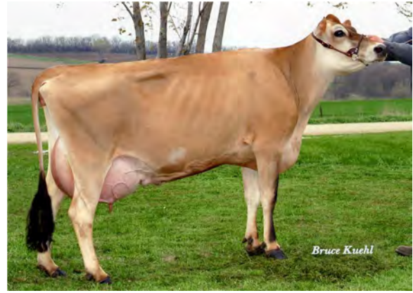
HEARTLAND MANNIX KYLIE-ET, E-93% GRANDAM OF LOT 3939