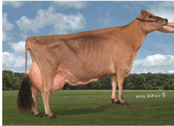
NORSE STAR SULTAN FARRAH, E-92% SELLING AS LOT 2531 GRANDAM OF FIERCE AT SELECT SIRES