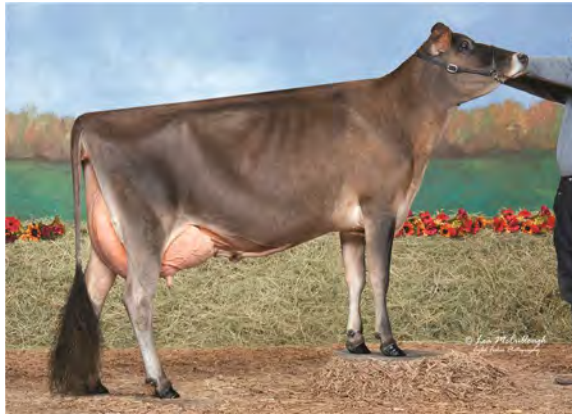
K&M NORTHSTAR CHARITY, E-94% SISTER TO THE DAM OF LOT 827