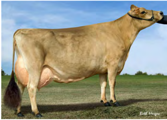
HILL TOP ACE MORGAN, E-90% DAM OF LOT 4196