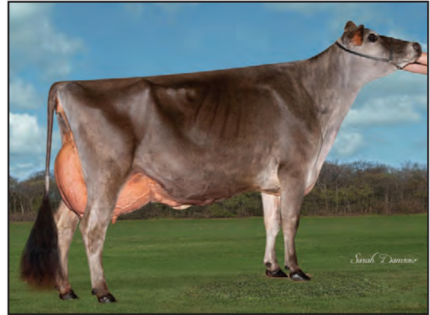
RATLIFF IMPRESSION ANNABELLA-ET, E-91% SISTER TO LOT 938