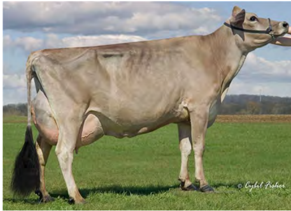
SRG ROYAL PITINO LIBERTY, E-95% GRANDAM OF LOT 4279