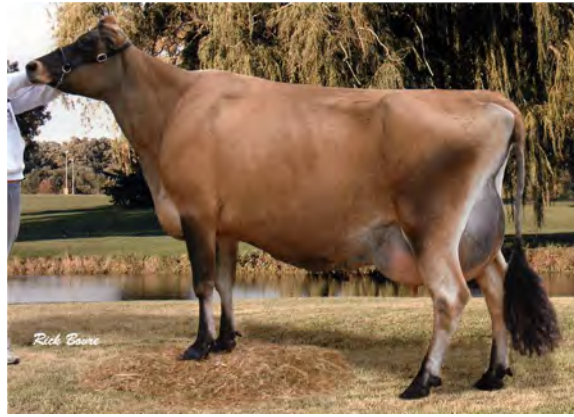
TAURUS MANDY, E-95% GREAT-GRANDAM OF LOT 4492