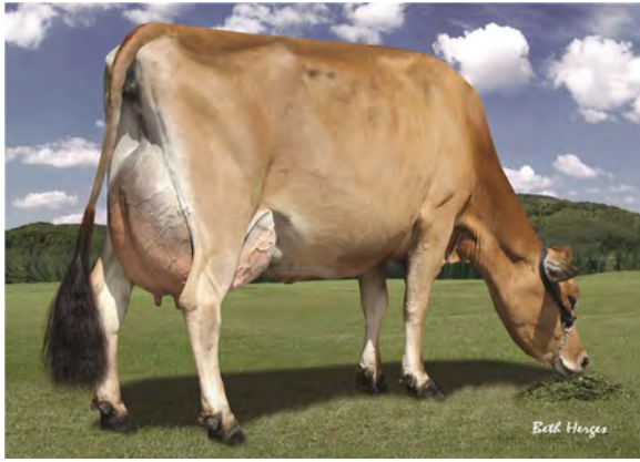
NORSE STAR ABE TINKER, VG-87% GRANDAM OF LOT 4291