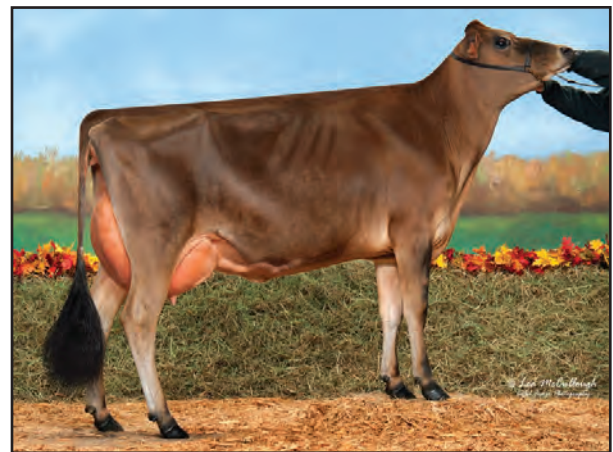
RATLIFF APPLE JACK ACCENT-ET, E-91% SISTER TO LOT 938