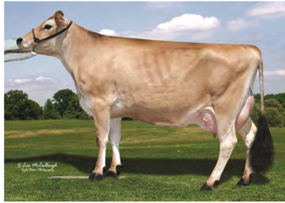
NORSE STAR RENEGADE MARLEY, VG-83% SISTER TO LOT 3951