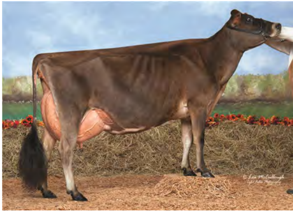
NORSE STAR TEQUILA KATIE (4), E-94% DAM OF LOT 4199