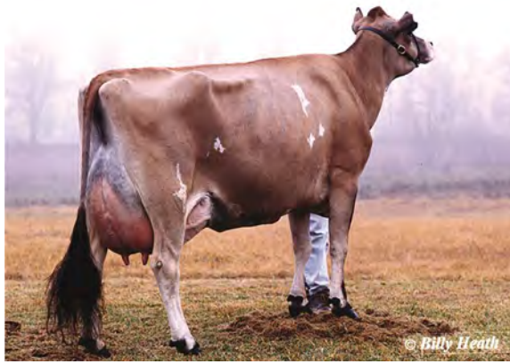
HOMERIDGE BBS VIV, E-90% GREAT-GRANDAM OF LOT 3225