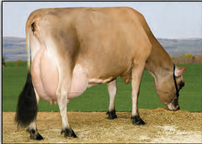
Norse Star Hallmark Bootie, E-90%

World Production Leader for Fat Production 3-0 365 39,239 7.2% 2,827 3.8% 1,500 92DCR