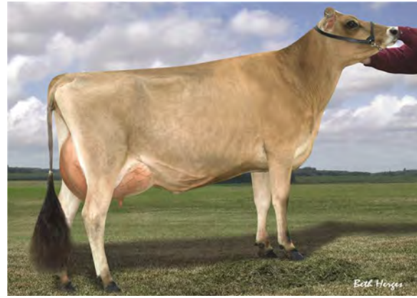
HILL TOP JARRETT MARIAH, VG-82% SISTER TO LOT 4196