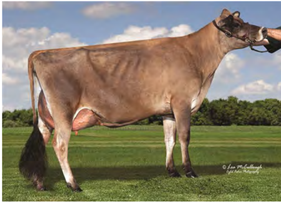
BIG TIME KAMEL DARBY, E-90% SISTER TO LOT 21