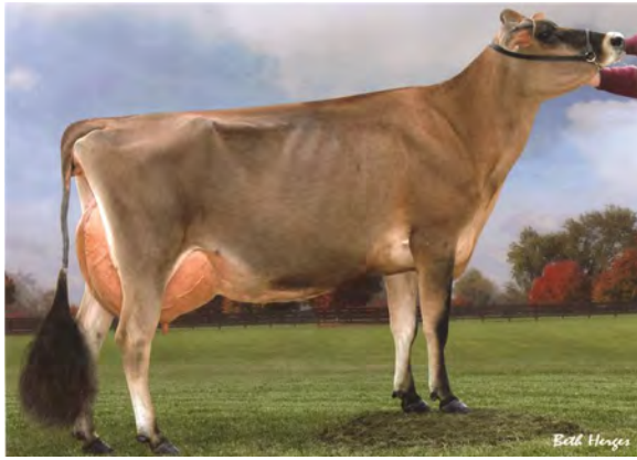
NORSE STAR TEQUILA KATIE {4}, E-94% GRANDAM OF LOT 4439