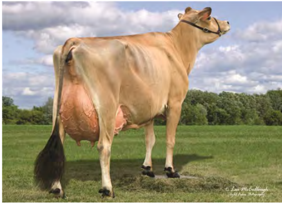
NORSE STAR FUROR BEAUTY, E-91% SISTER TO THE DAM OF LOT 3809