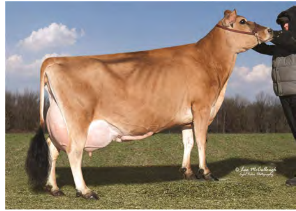
NORSE STAR ROCKET PROMISE, E-91% SISTER TO THE DAM OF LOT 4028