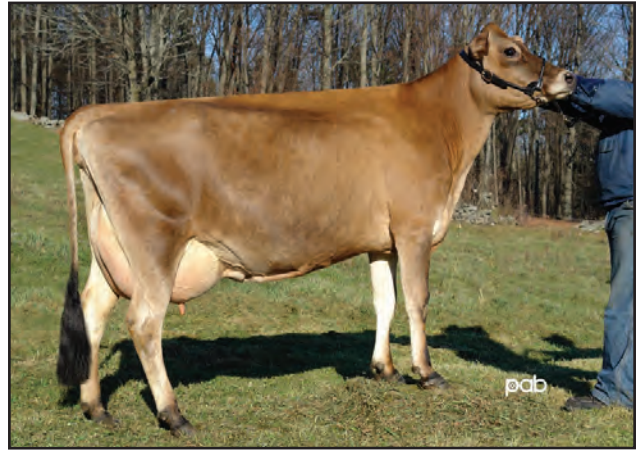
PEARLMONT IMPULS DAFFY, E-90% GREAT-GRANDAM OF LOT 4374