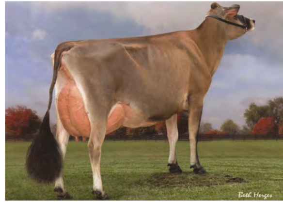
NORSE STAR TEQUILA KATIE {4}, E-94% GRANDAM OF LOT 4439