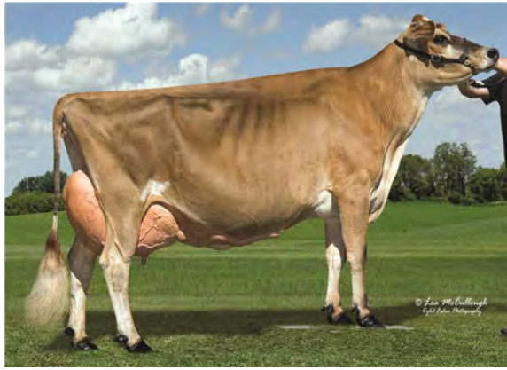
NORSE STAR MINISTER GLAMOUR, E-93% GRANDAM OF LOT 4324