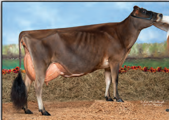
Norse Star Tequila Katie {4}, E-94%

Reserve All American 4-Year-Old, 2011 Reserve All American Junior 3-Year-Old, 2010