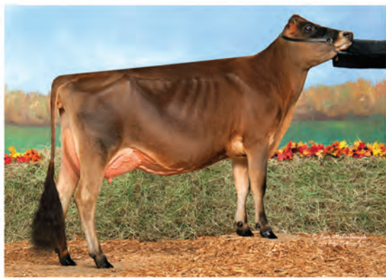
Norse Star Vitality Raven