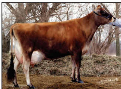
PIEDMONT RENAISSANCE VIVIAN-ET Fourth Dam of Lot 16