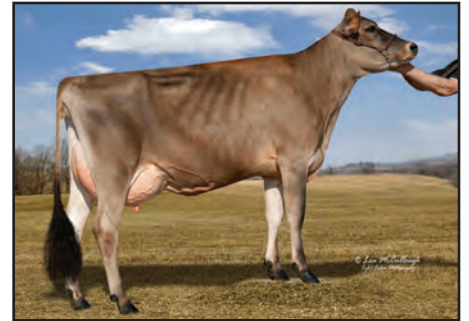
Lyon TBone Apple, E-94% 4-5 305 19,970 4.3% 854 3.6% 711 Sold in 2012 Kentucky National Sale