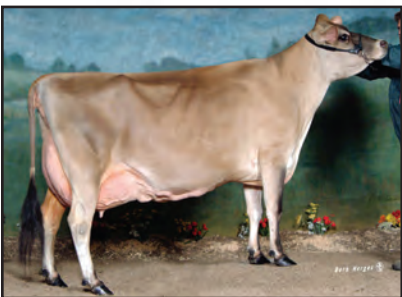
JWH COUNCILLERS SWEET PEA Fourth Dam of Lot 54