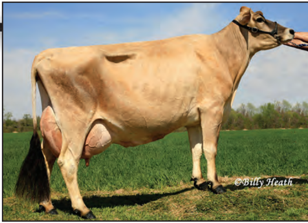
SUNBOW B.DANIEL GINGER, E-90% Great-Grandam to Lot 31