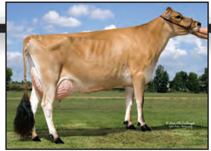
HEARTLAND ABE AVALANCHE Grandam to Lot 11

4TH DAM: HEARTLAND BERRETTA AMANDA 80% 5-08 305 3 20390 5.6 1150 3.8 782 92DCR 2706C