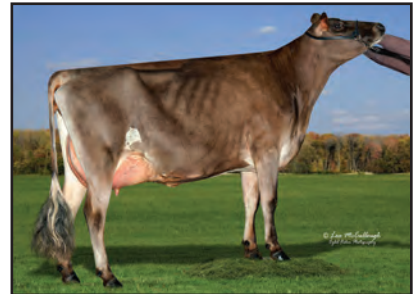
HEARTLAND SANTIAGO AINSLEY-ET Sister to the Dam of Lot 11