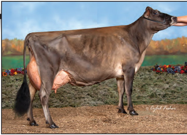
WF ATTABOY APPLEPIE, E-95% Sister to the Great-Grandam of Lot 13