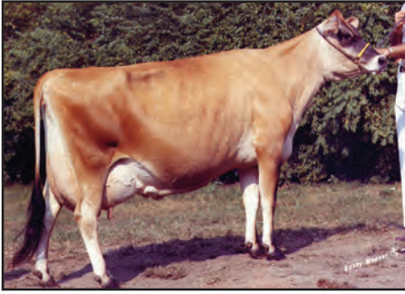
Generators Topsy, E-97% 1973 National Grand Champion Winner, 1985 Great Cow Contest Sold in the 1969 Sale