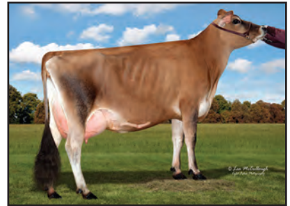
HEARTLAND TOPEKA ATHENA-ET Sister to the Dam of Lot 11