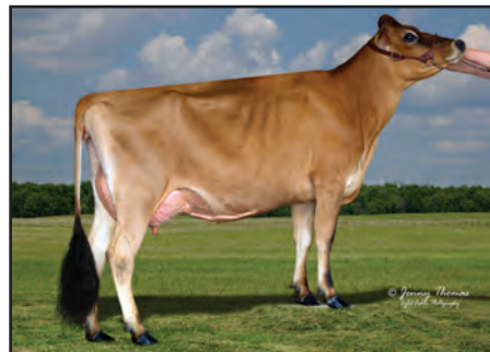
Gabys Virgil Butterscotch-ET, E-93% 3-5 305 17,430 5.7% 993 3.7% 645 Sold in the 2014 Kentucky National Sale