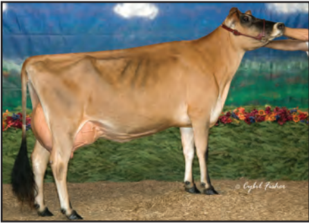
KCJF Jupiter Pollyanna, E-91% 4th Sr. Three-Year-Old, 2007 All American 1st Sr. Three-Year-Old, 2007 KY State Fair Sold in the 2004 Sale