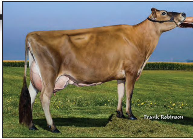
AHLEM LEGAL RUTH 37900, E-92% Sister to the Dam of Lot 12