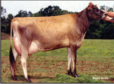
TC BARBER 602 BESSIE Great-Grandam of Lot 32

PA 265M 18F 8P 134CM$ 136NM$ 140FM$ 5.0PL -1.0DPR -1.6CCR 1.6HCR 2.98SCS PA TYPE 1.2 JPI 37%R 30 ST SR DF RA RW RL FA FU 1.2 -0.1 0.6 L0.7 -0.3 P0.2 S0.2 1.3 RH RUW UC UD TP TL RTR RTS 1.3 0.2 -0.2 S2.0 C0.4 S0.2