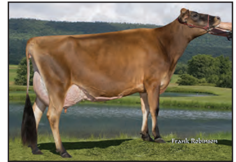
Gabys Blackstone Brassy, E-92% 3-1 305 21,200 5.6% 1,188 3.9% 829 Sold in the 2012 Kentucky National Sale