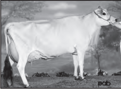
LLOLYN JUDE GOLD 42D Great-Grandam to Lot 46