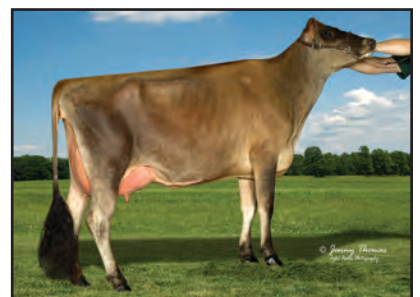
GORDONS GRANDPRIX VICTORY Sister to the Dam of Lot 17