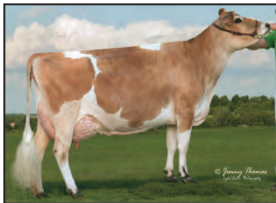
HARMONY CORNERS LUCINDA Sister to Grandam of Lot 10