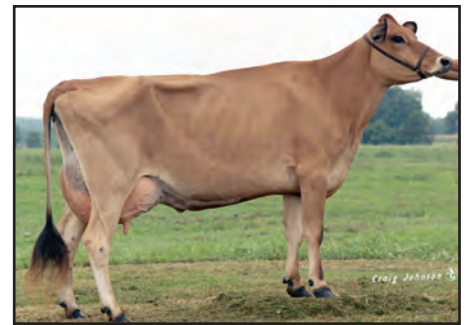
Sky Line Duncan Helen, E-92% 3-5 305 20,740 3.7% 775 3.7% 764 1st Sr. 3-year-old, 1995 All American Show Sold in the 1994 Sale