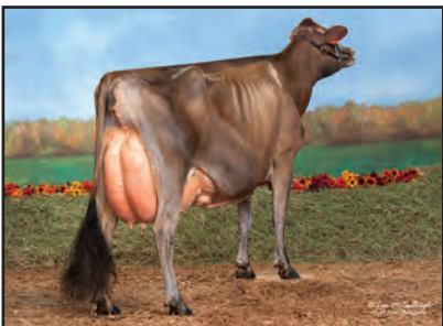
HBJ ACTION SIERRA Sister to the Dam of Lot 54

BORN 04/20/2016 PO FEMALE EFI 5.9% AMERICAN ID 62 / 62