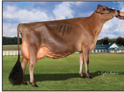
Payneside GG Got Milk, E-93% Reserve Grand Champion, 2013 All American Junior Jersey Show Sold in the 2012 Kentucky National Sale