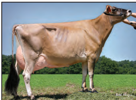
Legion Polly, E-92% 3-1 305 16,190 5.3% 865 3.8% 621 Grand Champion, 2008 All American Jr Show Second High Seller, 2008 Kentucky National Sale