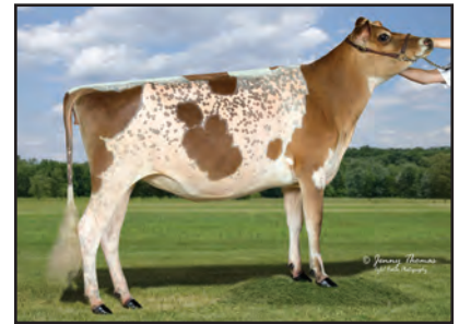
DKG EXCLAMATION SUNBURST Dam of Lot 7