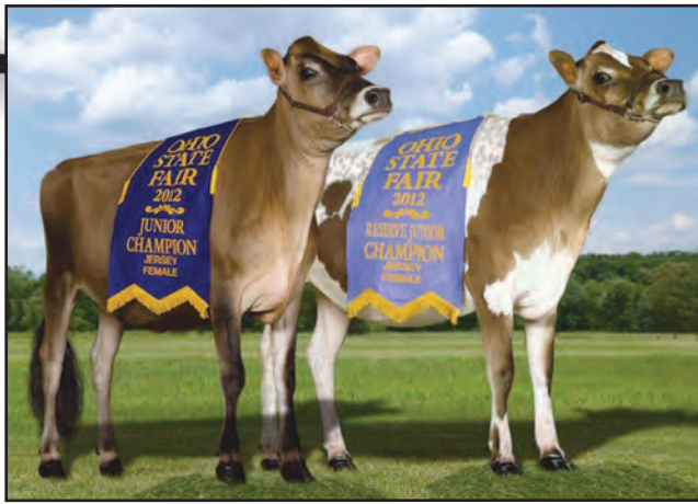
DKG EXCLAMATION SUNBURST Dam of Lot 7 (Pictured on right)