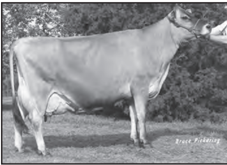
Generators Imp, E-96% 6-3 365 25,220 4.7% 1,188 Sold in the 1974 Sale