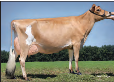
Connection Eli, E-92% 10-6 305 3x 17,020 5.4% 918 3.6% 613 4th National Jersey Jug Futurity, 2008 Sold in the 2007 Sale