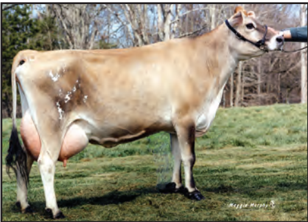
Sunny Day RR Beck Beck-ET, VG-86% 2-11 305 25,430 4.2% 1,056 3.6% 918 Hall of Fame Sold in the 1997 Sale