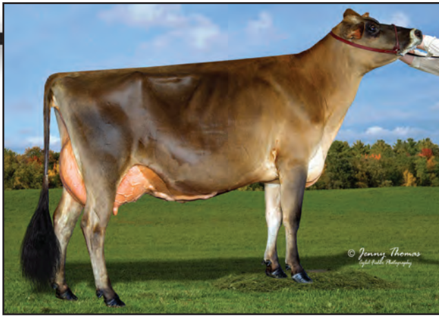
TIERNEYS TEQUILA LONDA {6}, E-91% Sister to the Grandam of Lot 27