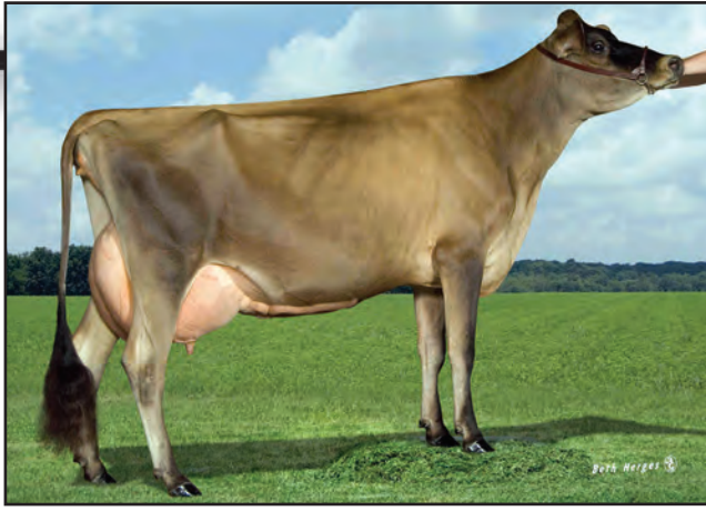
DEMENTS EMERSON IDABELLE, E-91% Sister to the Dam of Lot 47