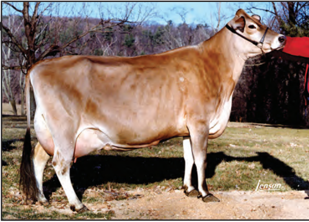
CELESTIAL BROOK GLIMMER, E-93% Fifth Dam of Lot 37