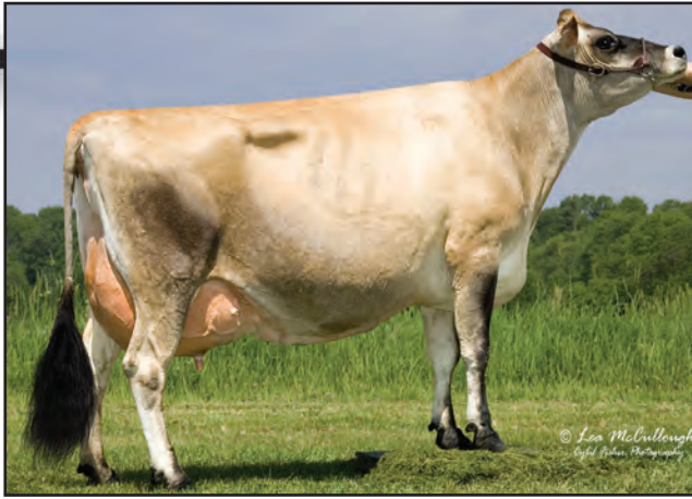
JUNO PERFECT AURORA, E-92% Fourth Dam of Lot 53