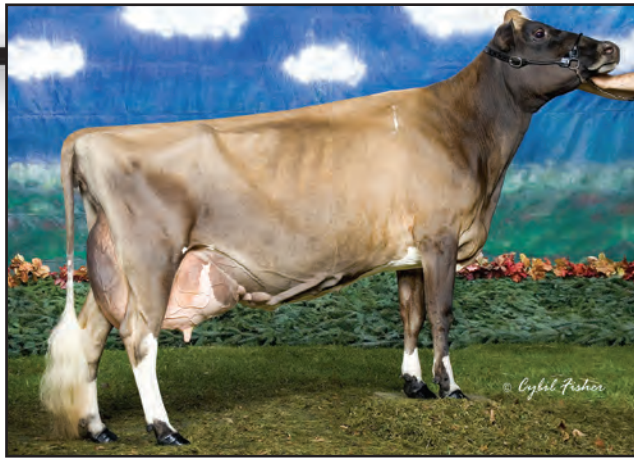
RESPONSES CHERYL, E-95% Grandam of Lot 36