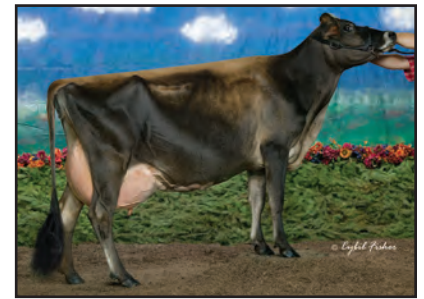
WF APOLLO APPLEBEE Great-Grandam of Lot 13

4TH DAM: WF BIG TIME MISS AMERICA 91% 6-09 305 2 18610 4.7 870 3.8 699 97DCR 2362C