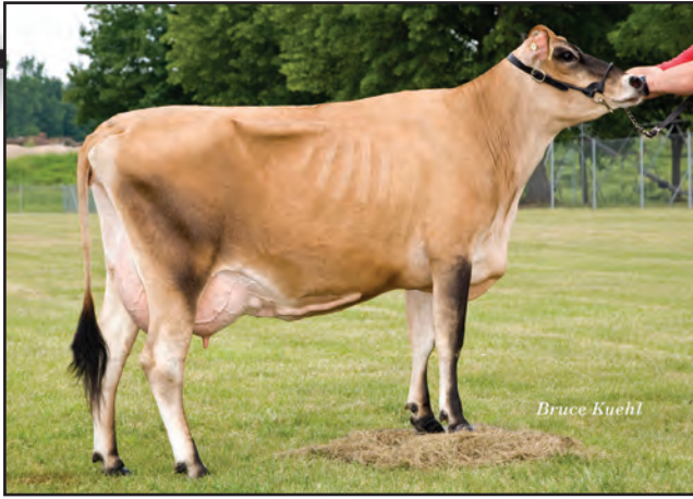
AMERI MILK JACE TAMARA, E-94% Sister to the Grandam of Lot 35