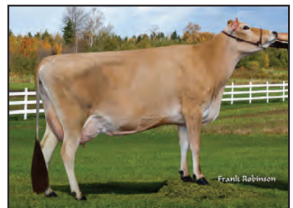
HEARTLAND DIGNITARY ABIGAIL-ET Sister to the Dam of Lot 11