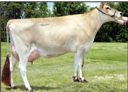
SJ Barmore Pitino Shooting Star, VG-84% 2-1 305 15,590 4.4% 689 3.6% 563 High selling female, 2000 KY National Sale