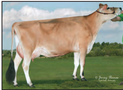
HARMONY-CORNERS LIBBY Grandam of Lot 10