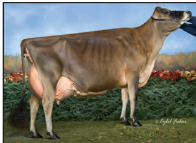
STEPHAN SPARKLER VERA-ET Great-Grandam of Lot 16