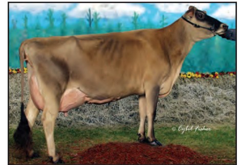
Giprat Renn Anastasia-ET, E-95% 1st Jr 3 & 4-year-old, 2000 & 2001 All American Reserve Grand Champ, 2003 World Dairy Expo Sold in the 1999 Sale