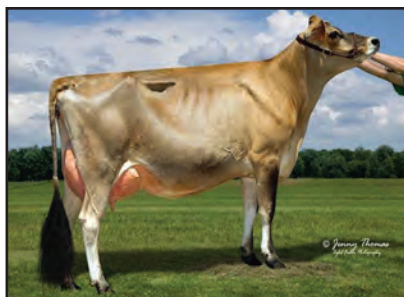
TJ CLASSIC ACTION VENUS Sister to Grandam of Lot 16