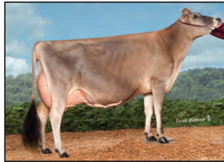
TC 1457 Jade Iris, E-93% 4-5 305 15,670 5.5% 858 3.5% 550 Sold in the 2013 Kentucky National Sale