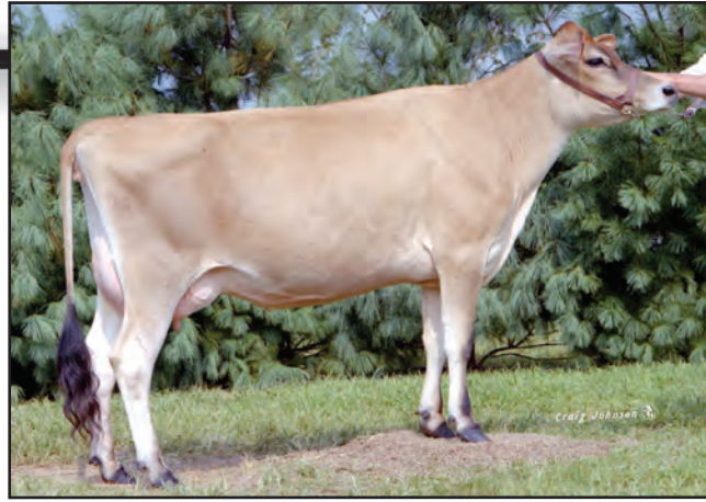
MILLERS PATRICK FARRAH, E-90% Fourth Dam to Lot 28