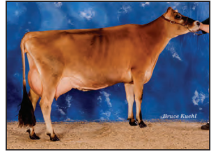
SSF VINDI Great-Grandam of Lot 17

4TH DAM: SSF BARBER WREN 91% 4-01 275 2 16170 5.3 865 3.8 611 98DCR 2114C