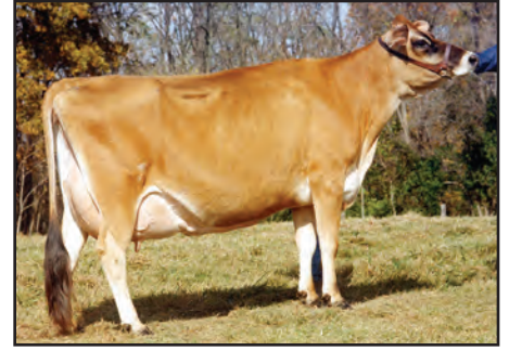
Sybil Surville Jesse, E-96% 7-8 365 15,140 5.5% 840 1976 & 1977 National Grand Champion Sold in the 1973 Sale