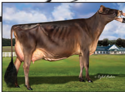
TJ CLASSIC MINISTER VENUS-ET Sister to the Grandam of Lot 16