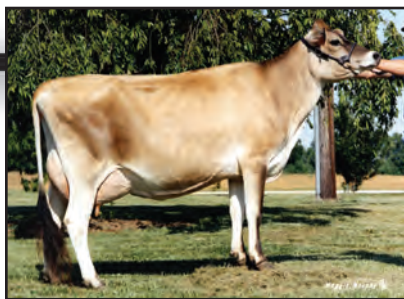
SWEET GRASS 2875 GURIT-ET Great-Grandam of Lot 8