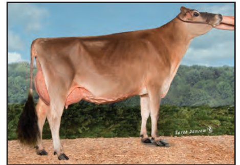
Triple S Tequila Limearita, E-92% Two-time Champion, Land of Lincoln Show Sold in the 2015 Kentucky National Sale