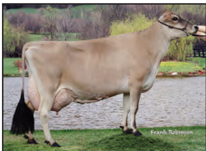
DEERVIEW MONTANA GALAXY-ET Sister to the Dam of Lot 8