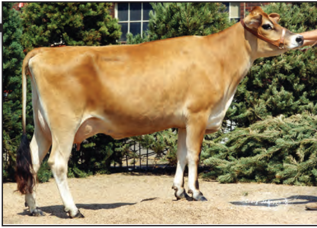
M VOLUNTEER DISCOVERY FOXETTE, E-90% Sixth Dam of Lot 3