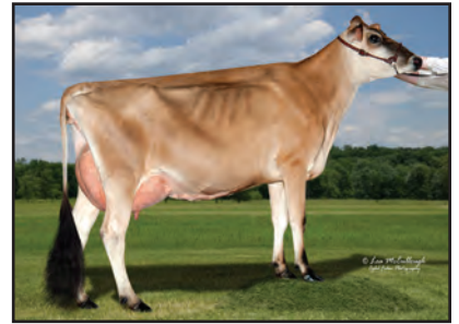
GORDONS ACTION VICTORIA Grandam of Lot 17