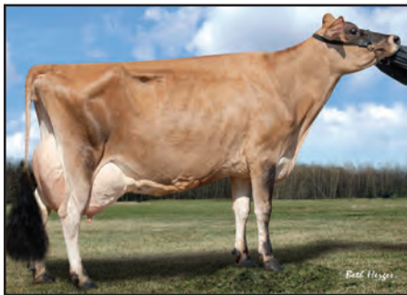
Gabys latola Pearl-ET, E-91% 5-1 305 27,200 4.5% 1,229 3.4% 916 Sold in the 2006 Kentucky National Sale