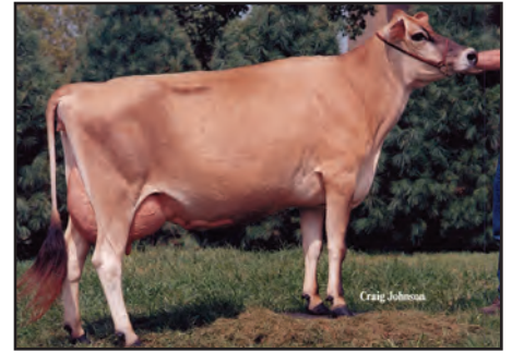
KCBC Freedom Dixie Belle, E-92% 5-8 305 14,200 4.5% 642 3.5% 500 High Seller, 2005 Kentucky National Sale