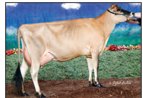
K&M Centurion Gillian, E-91% 2-5 247 14,108 4.7% 667 3.3% 471 Sold in the 2010 Kentucky National Sale