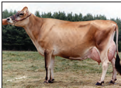
DEERVIEW ALF GALAXY-ET Grandam of Lot 8