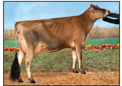
GORDONS TEQUILA VERA Sister to the Dam of Lot 17