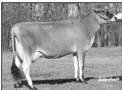
SWEET GRASS BRASS GULKA Fourth Dam of Lot 8