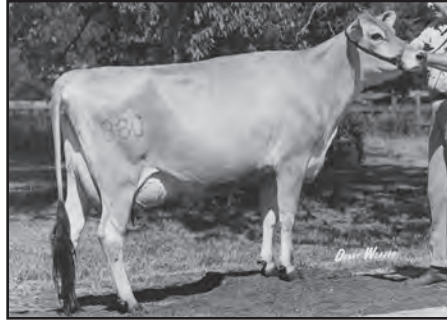
Generators Maid Snowdrop, E-92% 7-3 305 12,410 4.8% 592 Sold in the 1970 Kentucky National Sale