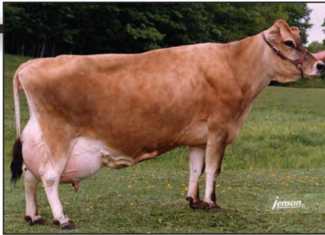
SCOTCH VIEW LESTER NANCY, E-90% Fourth Dam to Lot 52