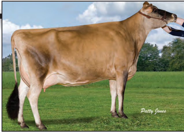
RICH VALLEY DUAISEOIR OREO 27L, SUP-EX 92-4E (CAN) Fourth Dam of Lot 6