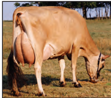
WF/L&M Berretta Bobbi-ET, E-90% 5-6 305 19,200 5.5% 1,050 3.8% 737 Grand Champion, 1999 KY National Show Sold in the 1999 Sale