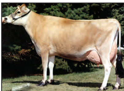
DEERVIEW FROSTY GALAXY-ET Sister to the Dam of Lot 8