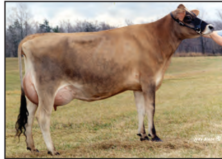
Rog-Al Barber Dee-Dee-ET, E-92% 4-5 305 3x 21,560 4.5% 978 3.6% 784 Sold in the 2002 Sale