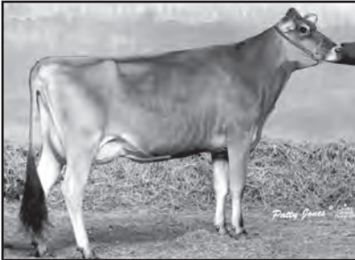
LLOLYN FRED'S GOLD 31B Fourth Dam to Lot 46

LLOLYN FRED'S GOLD 31B EX-2E (CAN) 4-01 305 2 14895 5.2 770 3.9 578 CAN 2001C RESERVE ALL CANADIAN SENIOR YEARLING IN MILK, 1994 2ND SEN. 2-YEAR-OLD, 1995 STRATFORD CHAMPIONSHIP SHOW 2ND MILKING YEARLING, 1994 ROYAL WINTER FAIR HM. ALL CANADIAN SENIOR 2-YEAR-OLD, 1995