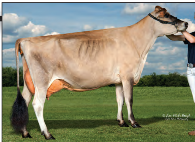
ROCKIN J SUREFIRE MADGE, E-90% Grandam of Lot 48