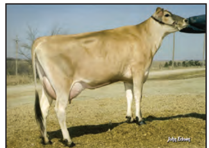
HEARTLAND ACTION AVIS Great-Grandam of Lot 11