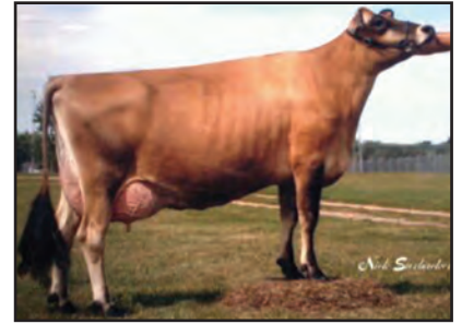
DEBSCOTT JADE TAHOE Great-Grandam of Lot 35

HEARTLAND NATHAN TEXAS-ET 95% USA 067041437 GT50K BBR 100 JH1F JH2F DHIA HERD # 48-89-0168 CONTROL # 1437 2-10 305 3 21850 4.6 1008 3.9 843 93DCR 2785C 3-11 305 3 26340 4.3 1130 3.8 991 92DCR 3185C 5-01 305 3 25940 4.6 1185 3.7 963 94DCR 3232C 7-00 183 3 17610 4.8 844 3.5 610 79DCR 2108C 305 2X ME AVG 5L 21944M 1006F 828P 2737C PPA 1701M 26F 71P / YD 1102M 23F 54P CDCB GPTA 03/06/2018 5RECS 92%R 45%ILE 312M 6F 18P 138CM$ 126NM$ 99FM$ 56GM$ 2.4PL -1.1LIV -2.4DPR -1.4CCR 0.4HCR 3.10SCS AJCA 03/06/2018 GPTAT 89%R 1.5 GJUI 19.2 GJPI 87%R 41