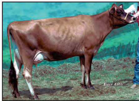
A.S.M. Miss America of GJF, E-92% 7-2 305 15,510 4.8% 746 3.8% 595 Sold in the 1982 Kentucky National Sale