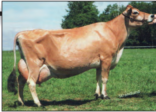
FAMILY HILL BROOK LYNNA, E-94% Fourth Dam of Lot 10