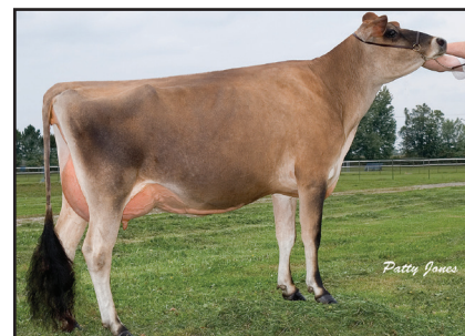
SELECT JADE GOLD 4-ET Sister to the Grandam of Lot 404