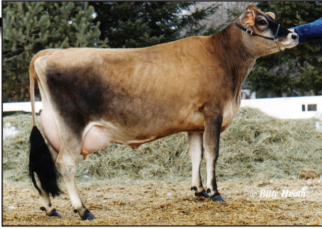
MAPLELINE ALF FULLPINT, VG-87% Fourth Dam of Lot 400