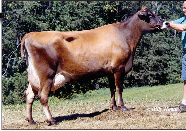
MOLLYBROOK MONTANA FAYLINE, E-91% Fifth Dam of Lot 401