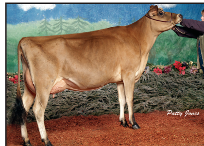
SELECT JW BABYGOLD-ET Sister to the Grandam of Lot 404