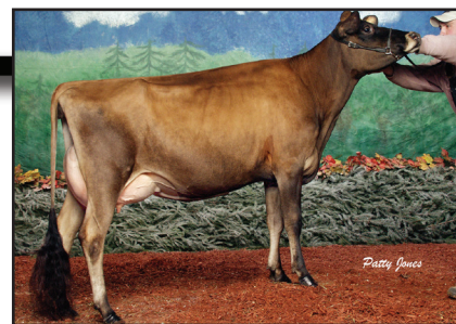
SELECT JADES GOLD 2-ET Sister to the Grandam of Lot 404

4TH DAM: LLOLYN FRED'S GOLD 31B EX-2E (CAN) 4-01 305 2 14895 5.2 770 3.9 578 CAN 2001C RESERVE ALL-CANADIAN SENIOR YEARLING IN MILK, 1994 2ND SR 2-YEAR-OLD, 1995 STRATFORD CHAMPIONSHIP SHOW 2ND MILKING YEARLING, 1994 ROYAL WINTER FAIR HM ALL CANADIAN SENIOR TWO-YEAR-OLD, 1995