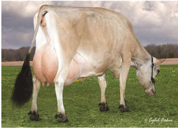
AHLEM B JOHN PRINCESS 3183-ET, E-91% FIFTH DAM OF LOT 1