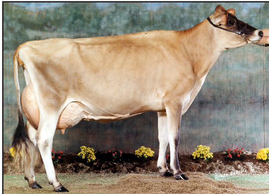
DEMENTS LESTER D DOTTIE, E-90% FOURTH DAM OF LOT 13