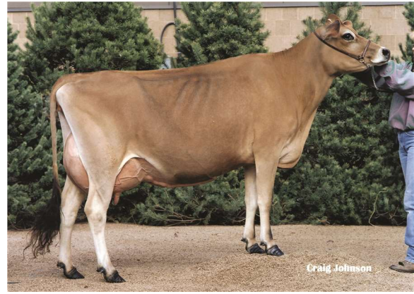
KCJF SAMBO DHARMA, E-93% GREAT-GRANDAM OF LOT 41