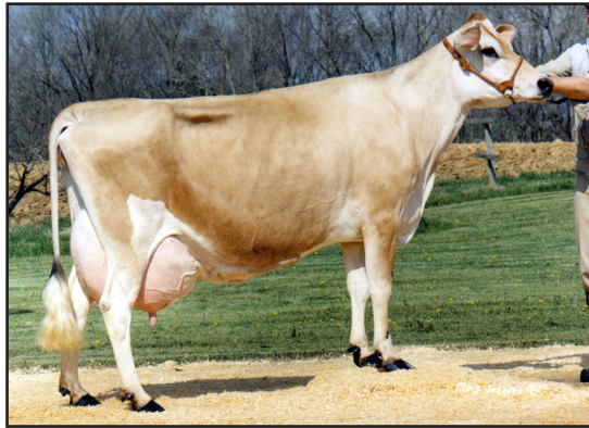
GABYS BOOMER ROXY {6}, E-91% FOURTH DAM OF LOT 170