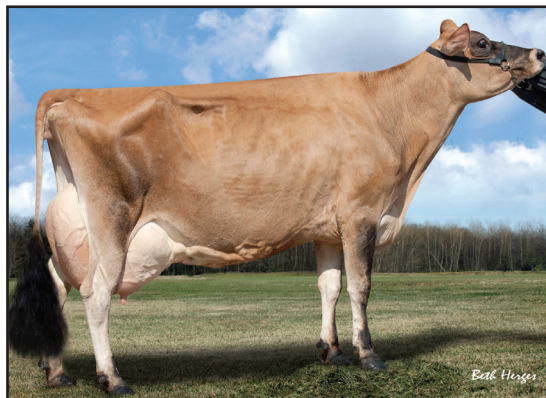
GABYS IATOLA PEARL, E-91% SISTER TO GRANDAM OF LOT 170