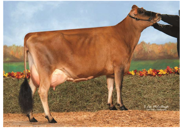
SWEET HAVEN MY FAIR LADY {6}, VG-88% SISTER TO DAM OF LOT 177