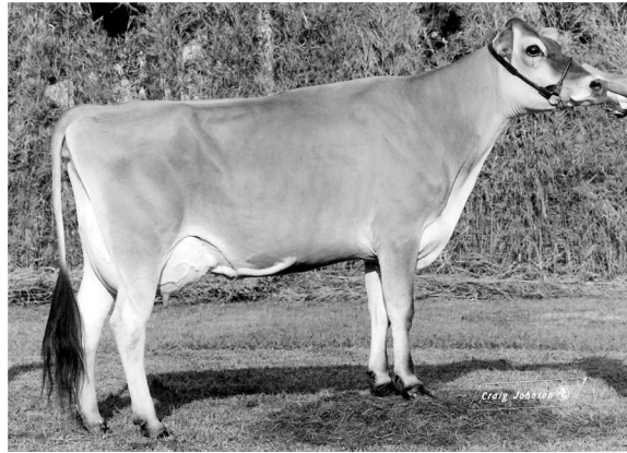
CHIEF OPHELIA-ET, E-93% FOURTH DAM OF LOT 149