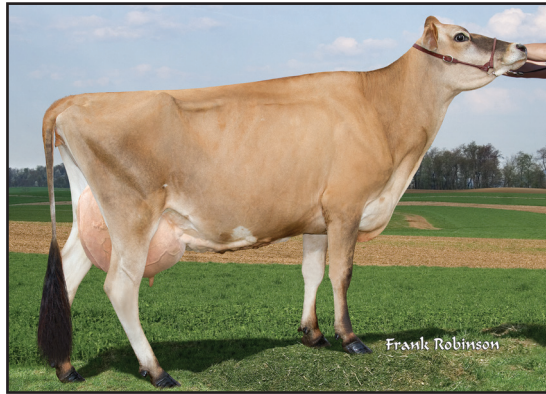
GABYS MAXIMUM SPICE-ET, VG-85% SISTER TO DAM OF LOT 170