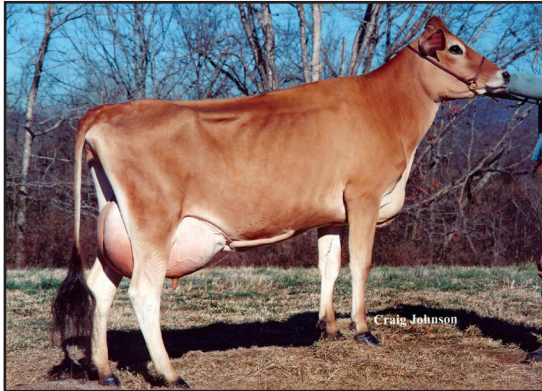
GABYS IATOLA AMETHYST-ET, E-90% FOURTH DAM OF LOT 169