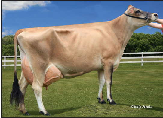
FAMILY HILL REN FLIRT-ET, E-94% GRANDAM OF LOT 51