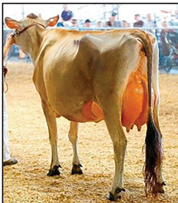
TIERNEYS HIRED GUN TEAGAN, E-91% SISTER TO DAM OF LOT 171