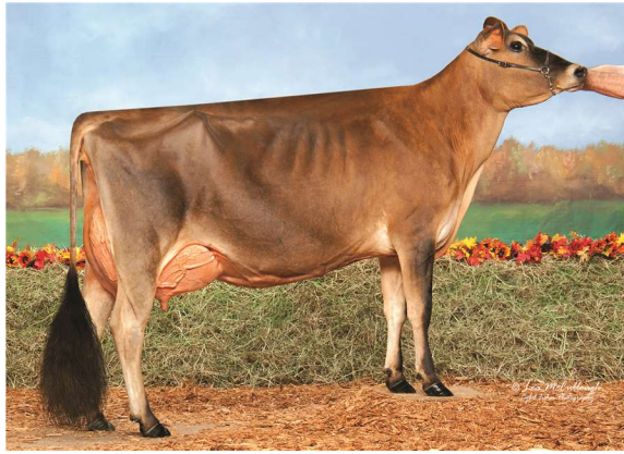
KCJF VERBATIMS SOLITUDE, E-93% SISTER TO LOT 173