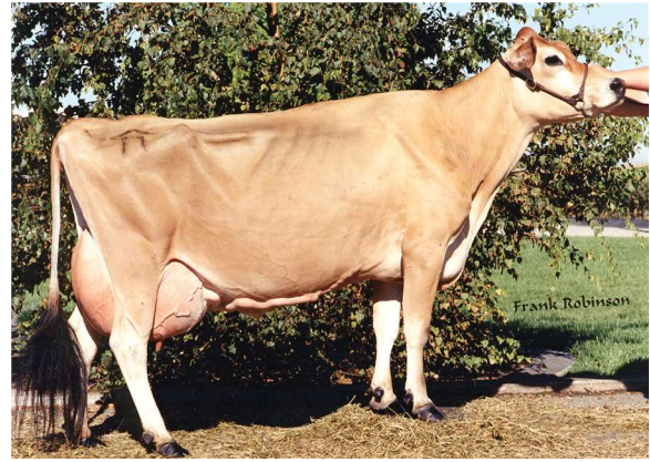
AHLEM BSB PRINCESS 6112 {6}, E-93% SIXTH DAM OF LOT 2