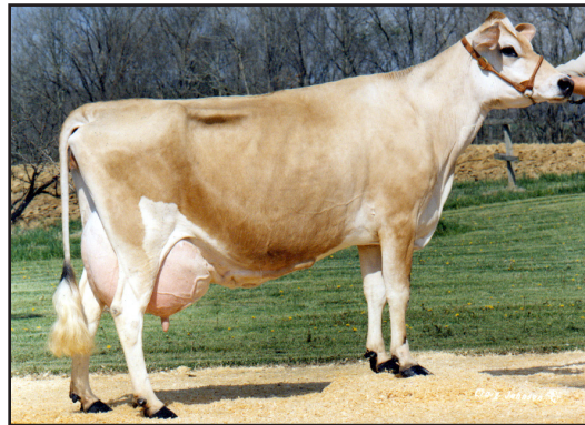
GABYS BOOMER ROXY {6}, E-91% SIXTH DAM OF LOT 174