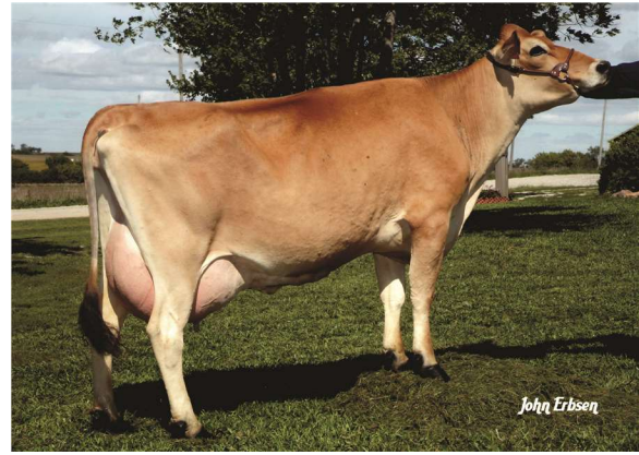
HEARTLAND JENETTA BILL DAY, E-90% FIFTH DAM OF LOT 146