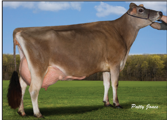
GABYS ARTIST AMBROSIA, E-94% GREAT-GRANDAM OF LOT 169