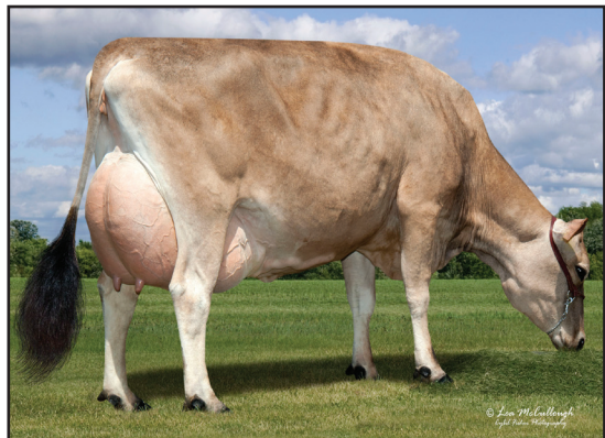
JX WAUNAKEE DALE JOEY 2332 {3}-ET, VG-85% SISTER TO GRANDAM OF LOT 3