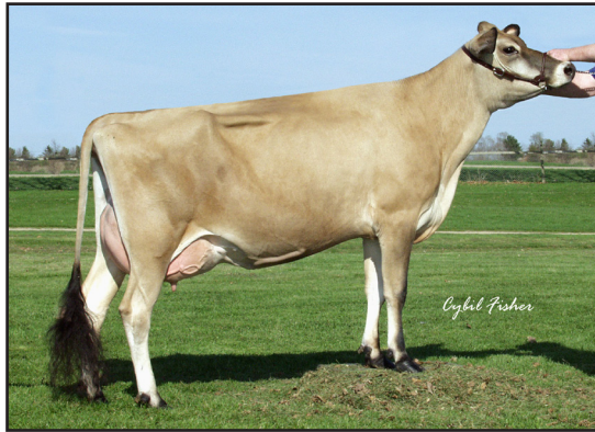
FAMILY HILL KJ FAVOR, E-94% SISTER TO GRANDAM OF LOT 51