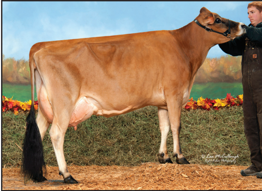
GABYS BENEFACITOR APPLAUSE, E-90% DAM OF LOT 169