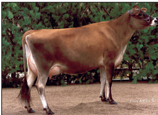
RRF BOOM DOREEN, E-91% FIFTH DAM OF LOT 13