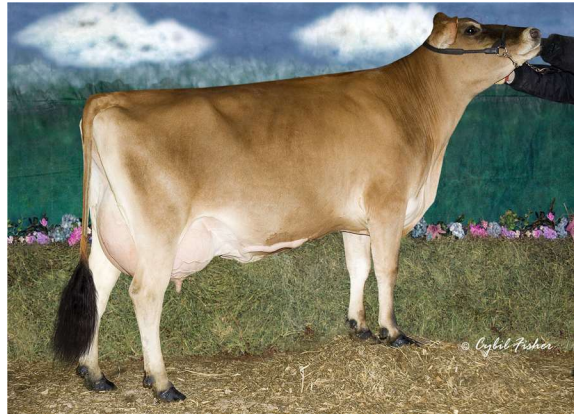
K&K LEXINGTON MATTI MANDA, VG-87% FOURTH DAM OF LOT 144