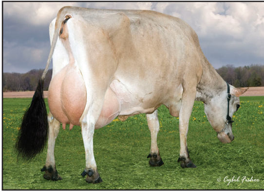
AHLEM B JOHN PRINCESS 3183-ET, E-91% GREAT-GRANDAM OF LOT 3