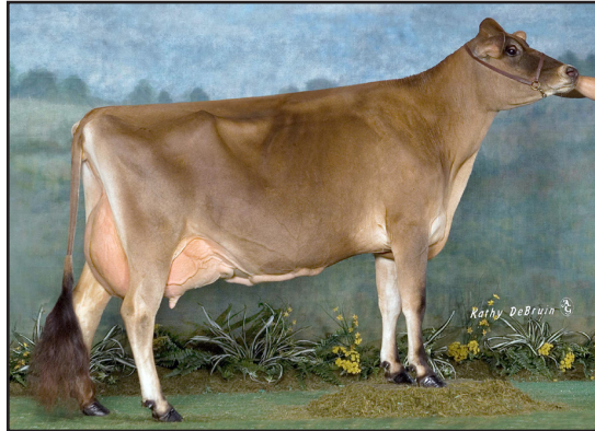
DEMENTS JADE DAWN, E-93% GREAT-GRANDAM OF LOT 13