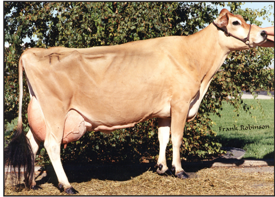
AHLEM BSB PRINCESS 6112 {6}, E-93% FOURTH DAM OF LOT 3