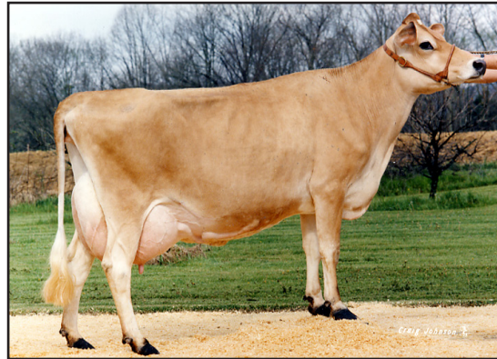
GABYS HERMITAGE ROXETTE, E-90% GREAT-GRANDAM OF LOT 170