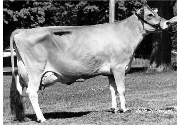
RENMOOR ETHERNAL BLISS, VG-86% FIFTH DAM OF LOT 9