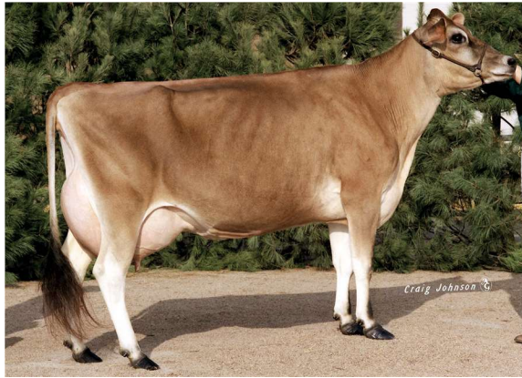
CANTENDO SOONER X RUBY, E-91% FIFTH DAM OF LOT 11