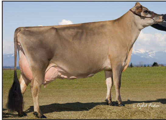
FAMILY HILL SD FAVORITE, E-95% SISTER TO GRANDAM OF LOT 51