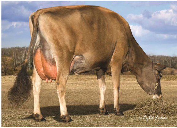
KCJF DHARMAS RENAISSANCE DYNASTY, E-91% GRANDAM OF LOT 41