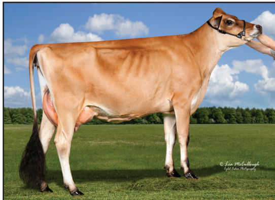
TIERNEYS HIRED GUN TAMALE, VG-86% SELLING AS LOT 171