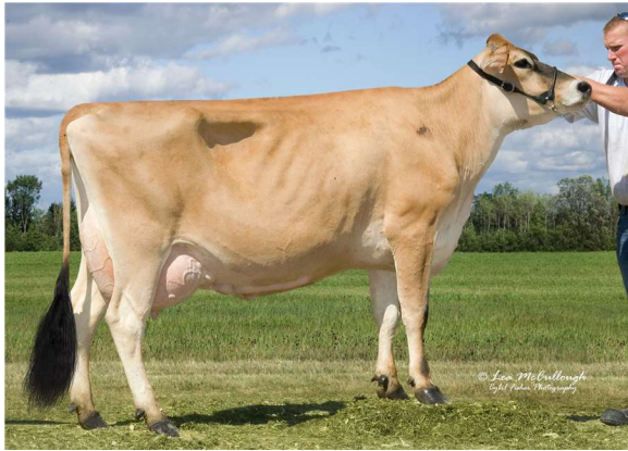
MAINSTREAM JACE J LO-ET, E-91% FOURTH DAM OF LOT 5