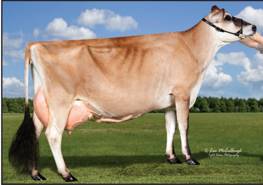
JX GABYS DONOVAN SEQUIN {4}, E-91% DAM OF LOT 174