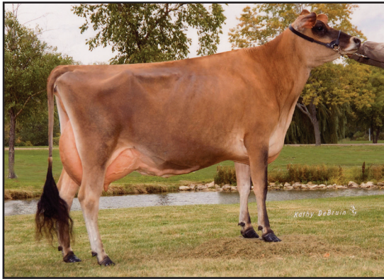
FAMILY HILL JADE CAROLINA-ET, E-91% SISTER TO GRANDAM OF LOT 40