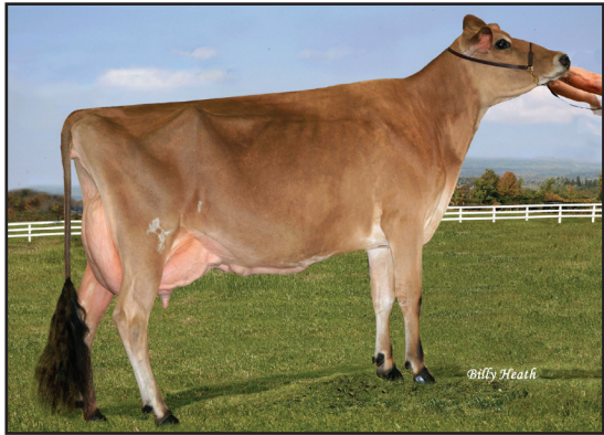
FAMILY HILL CONNECTION CHILLI-ET, E-91% SISTER TO GRANDAM OF LOT 40