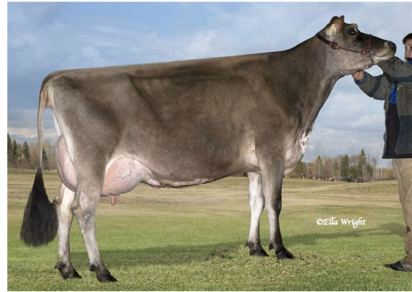
VALLEYSTREAM DYNAMO SARAH, EX 90-2E (CAN) GREAT-GRANDAM OF LOT 122