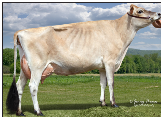
TIERNEYS DUASEOIR TOPAZ, E-91% GRANDAM OF LOT 171