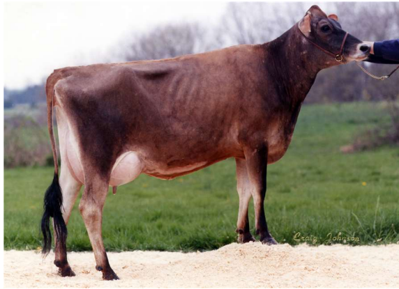
GABYS GOLDEN NATTIE, E-90% FOURTH DAM OF LOT 176