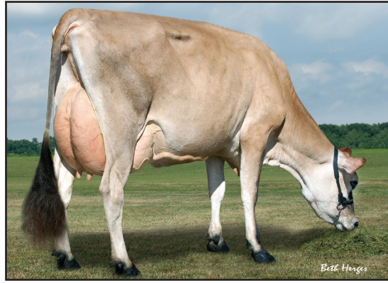
WAUNAKEE JEVON PROMISE 2058, VG-86% SISTER TO GRANDAM OF LOT 4