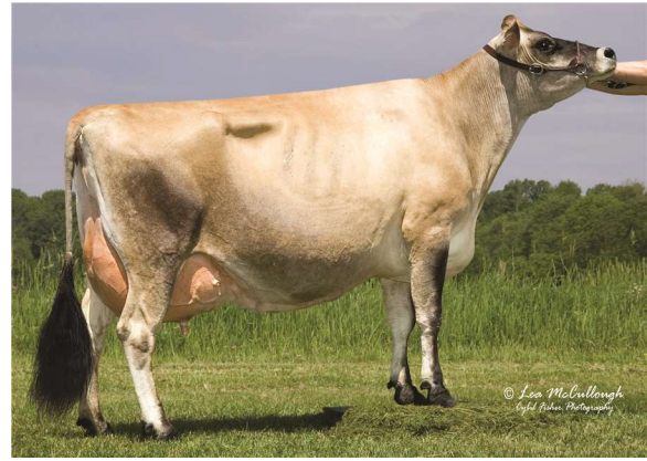
JUNO PERFECT AURORA, E-92% FIFTH DAM OF LOT 52