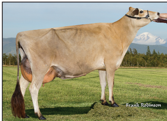
FAMILY HILL SOCRATES FLYNN-ET, E-95% SISTER TO GRANDAM OF LOT 51