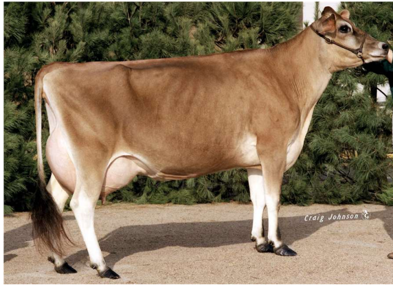
CANTENDO SOONER X RUBY, E-91% FOURTH DAM OF LOT 12