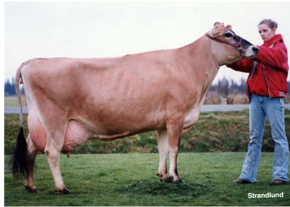
MAINSTREAM BERRETTA JOY, VG-88% FIFTH DAM OF LOT 5 FORMER WORLD MILK CHAMPION