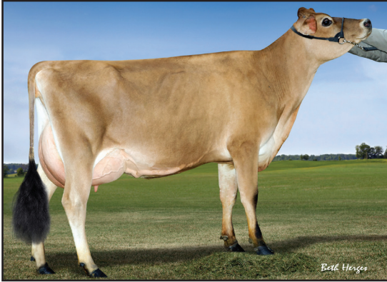
WAUNAKEE LEGAL PUFF-ET, E-90% SISTER TO DAM OF LOT 3