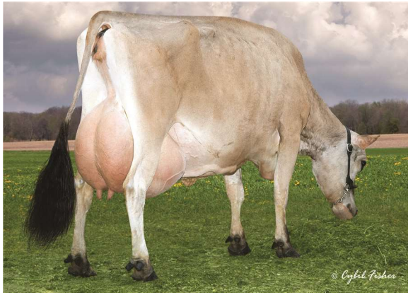
AHLEM B JOHN PRINCESS 3183-ET, E-91% FIFTH DAM OF LOT 2