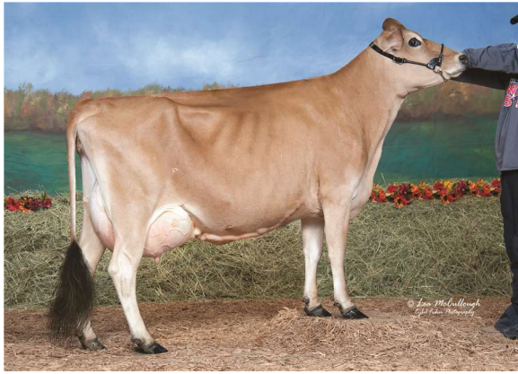
HAPPY M SHOWSTOPPIN BEAUTY {6}, VG-87% DAM OF LOT 177