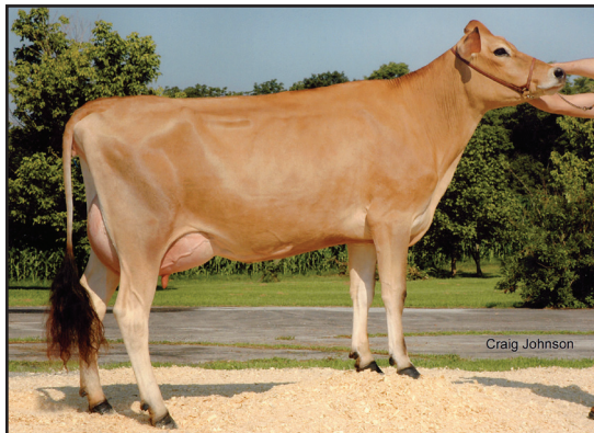
GABYS JACINTO ALYSSA, E-93% SISTER TO GRANDAM OF LOT 169