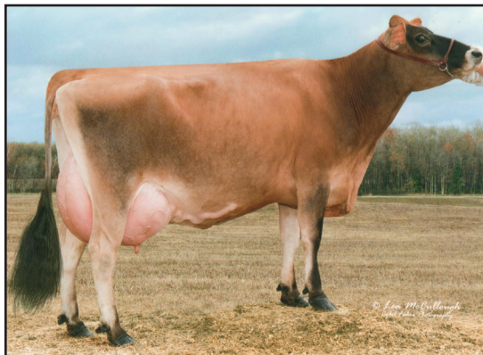
WAUNAKEE JACE PANNY-ET, VG-86% SISTER TO GRANDAM OF LOT 3