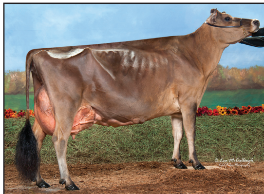
FAMILY HILL COMERICA FLAME-ET, E-95% SISTER TO GRANDAM OF LOT 51