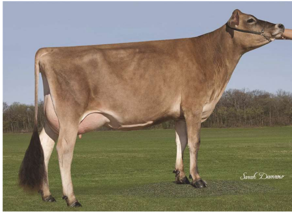
CROSSWIND AXIS 5976 {5}, VG-85% SISTER TO LOT 81