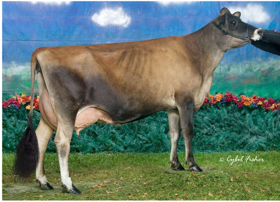
PREDESTINATION PERFECT ANNA, E-91% FOURTH DAM OF LOT 52