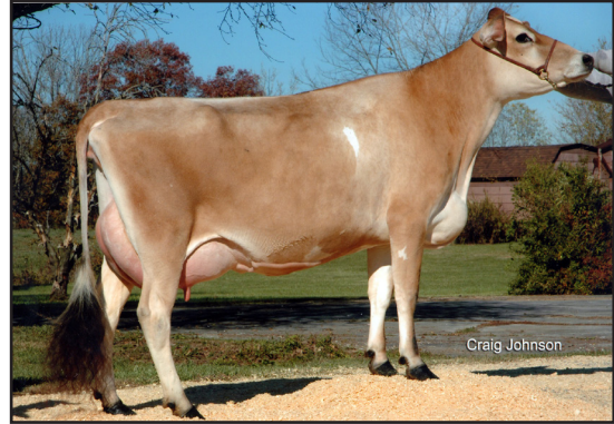
GABYS ARTIST SATIN, E-90% GRANDAM OF LOT 174