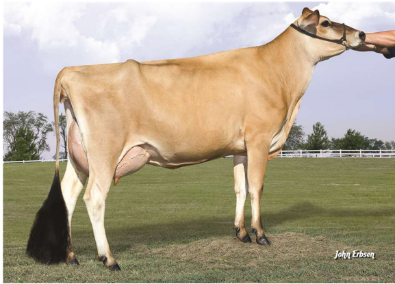
UNIQUE HP ACTION SASHA-ET, E-90% GRANDAM OF LOT 122