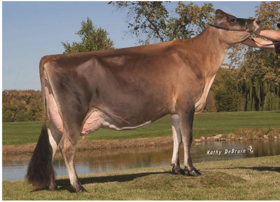
SEPTEMBER STAR IMPULS, E-94% SISTER TO DAM OF LOT 49