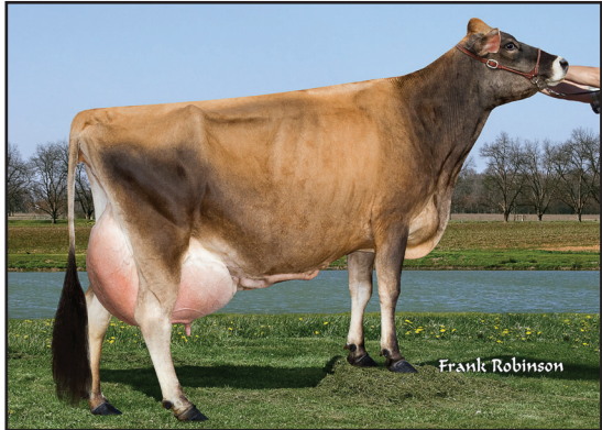
GABYS JEWELER AMYRILLIS-ET, E-91% SISTER TO GRANDAM OF LOT 169