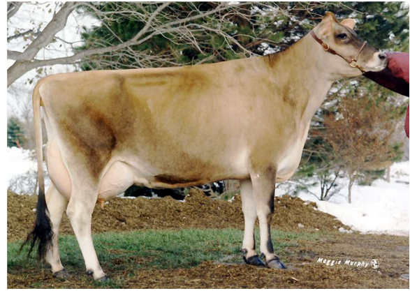
SOONER ELISE OF SSF, E-93% SIXTH DAM OF LOT 49