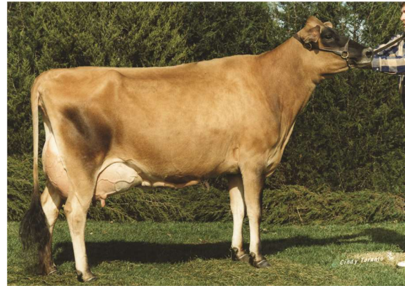
W.F. JUSTIN LANITA, E-96% EIGHTH DAM OF LOT 8 1983 & 1985 NATIONAL GRAND CHAMPION