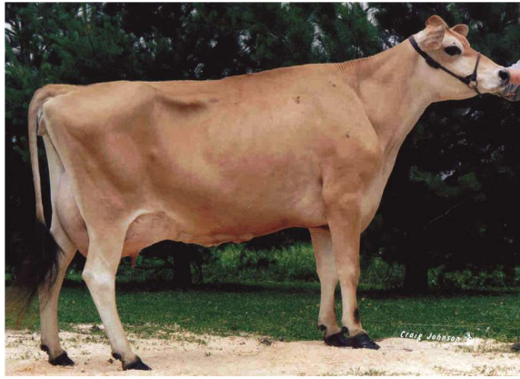
DEMENTS ZUKOR NIOLA, E-93% FOURTH DAM OF LOT 14