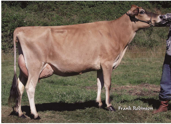
WF BARBER LEELA, E-92% FOURTH DAM OF LOT 8