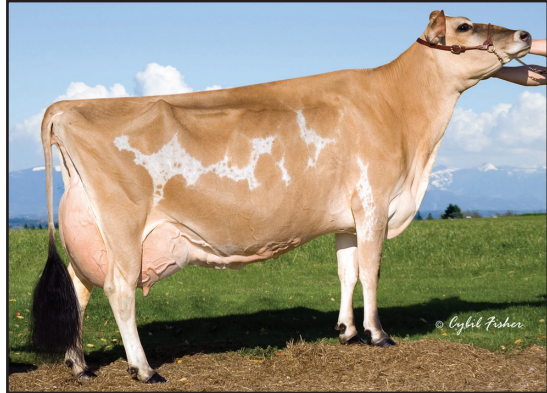
PLEASANT NOOK F PRIZE CIRCUS, E-97% GREAT-GRANDAM OF LOT 40