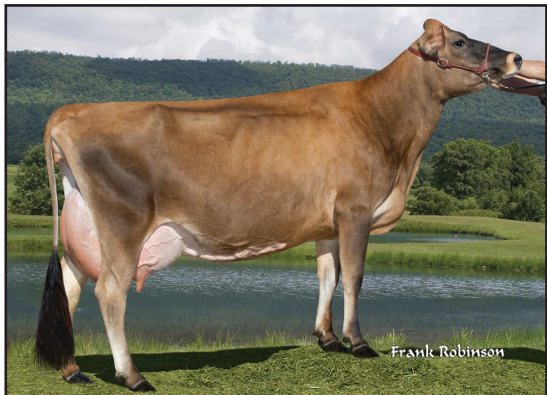
GABYS BLACKSTONE ANGELINA-ET, E-92% SISTER TO GRANDAM OF LOT 169