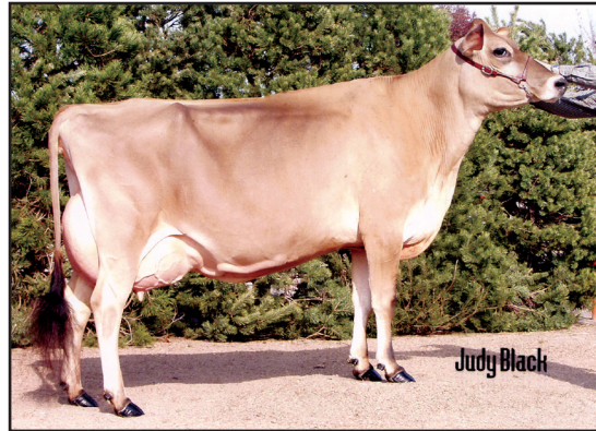
PLEASANT NOOK BERRETTA FELICE, E-95% GREAT-GRANDAM OF LOT 51