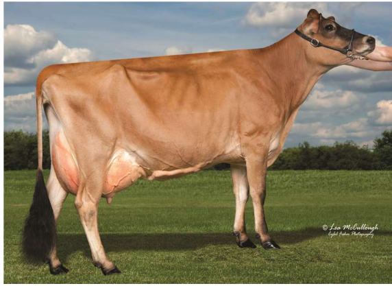
SWEET HAVEN CELEBRITY HUM V, E-92% SISTER TO GRANDAM OF LOT 172