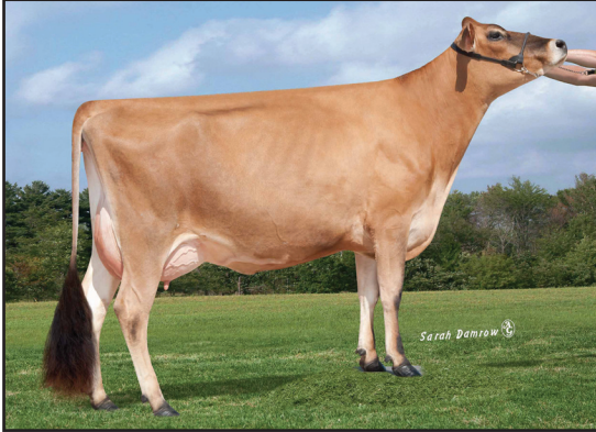
FAMILY HILL REN CARLY-ET, E-90% GRANDAM OF LOT 40