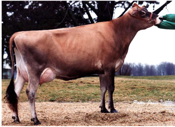
LLOLYN REN POLLYANN 3-ET, VG 87 (CAN) FIFTH DAM OF LOT 175