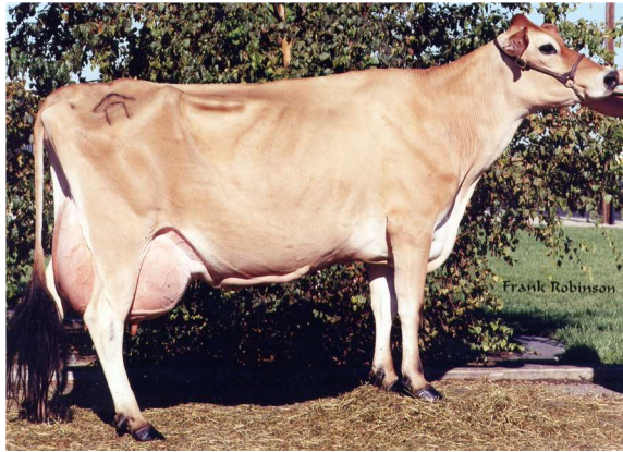
AHLEM POSEIDON JAN 6343, E-92% SIXTH DAM OF LOT 138