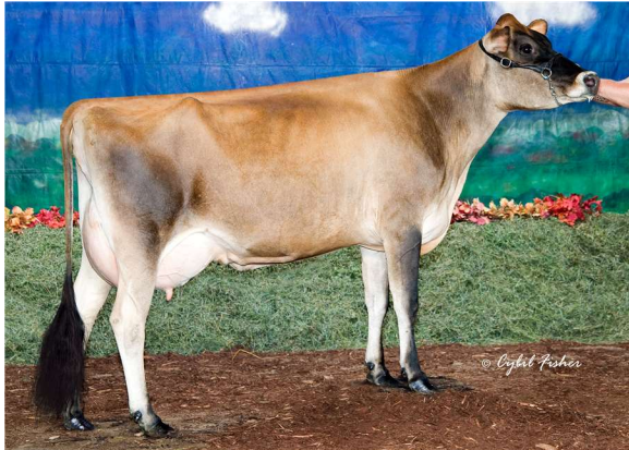
EGGINK JADE BETSY-ET GRANDAM OF LOT 9