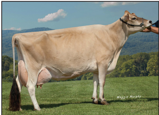
FAMILY HILL COMERICA CHANCE-ET, E-95% SISTER TO GRANDAM OF LOT 40