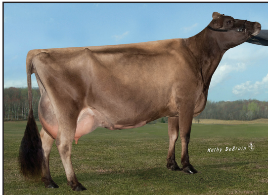
FAMILY HILL AMADEO COLBI, E-94% SISTER TO GRANDAM OF LOT 40