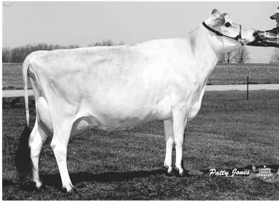
BRIDON PATRICK RADIANCE, EX (CAN) FOURTH DAM OF LOT 1