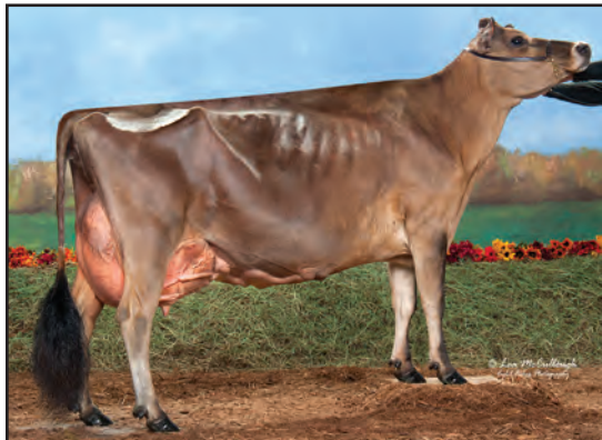
FAMILY HILL COMERICA FLAME-ET, E-95% SISTER TO GRANDAM OF LOT 31