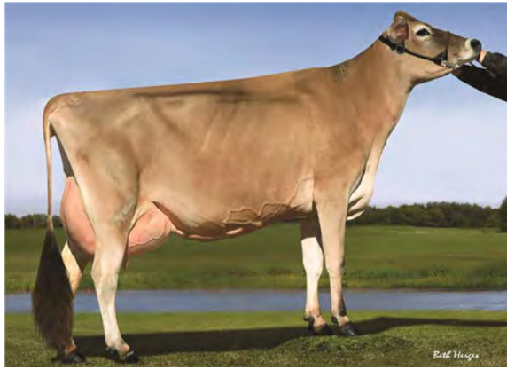
HIGHVIEW VALENTINO MISTLE TOE, E-90% DAM OF LOT 100