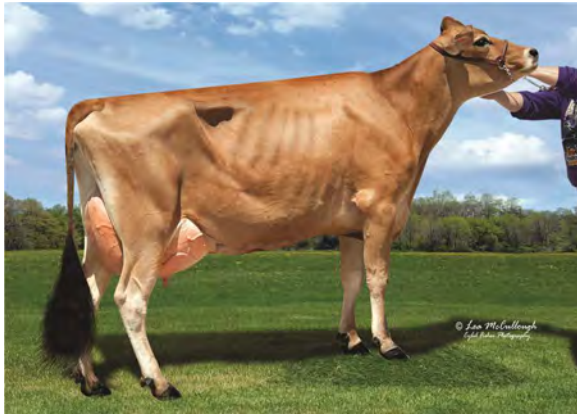
HEARTLAND VALENTINO DIANNA, E-90% SISTER TO THE GRANDAM OF LOT 28