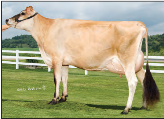
JARS OF CLAY IATOLA 16710 2751, VG-87% GREAT-GRANDAM OF LOT 35