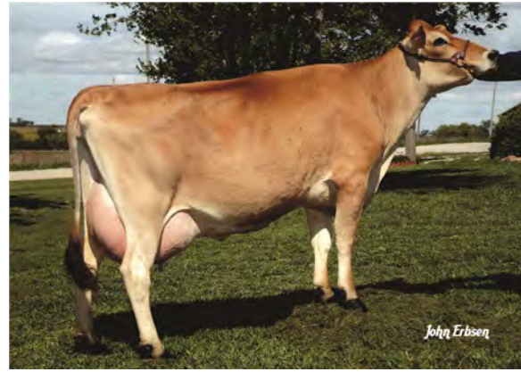
HEARTLAND JENETTA BILL DAY, E-90% FIFTH DAM OF LOT 28