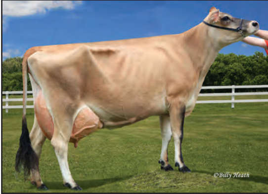
FAMILY HILL REN FLIRT-ET, E-94% GRANDAM OF LOT 31