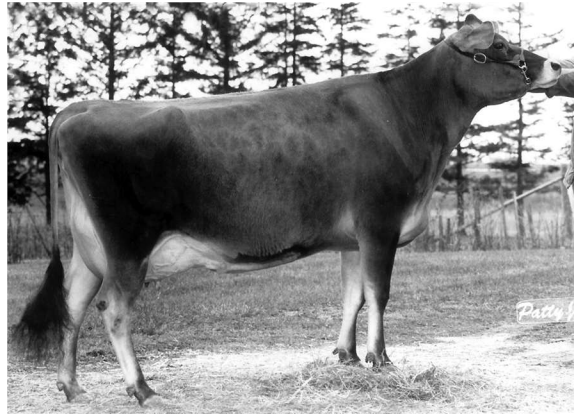
ELMLINE TITLES ELIZA 14R, EX (CAN) SIXTH DAM OF LOT 30