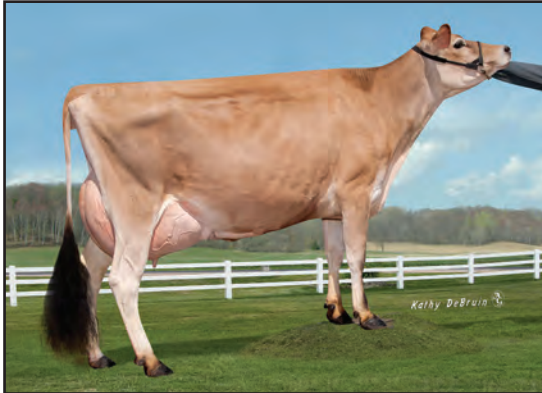
ALL LYNNS DIMENSION VENETTA-ET, VG-83% SISTER TO THE DAM OF LOT 34