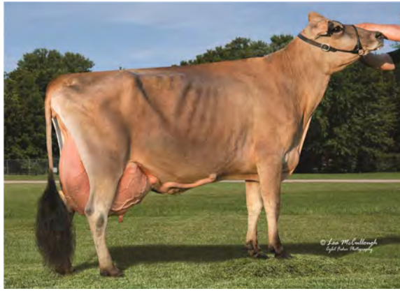
HIGHVIEW COUNTRY JANEL, VG-80% GRANDAM OF LOT 118