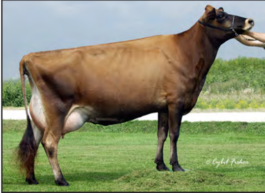
BRIDON FIRST ERUPT-ET, E-93% GREAT-GRANDAM OF LOT 33