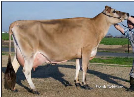
D&E ABE VIOLET, E-90% FIFTH DAM OF LOT 32