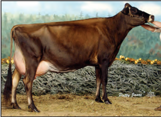
JUST A FEW RENAISSANCE ELISA, EX 94-2E (CAN) FOURTH DAM OF LOT 33