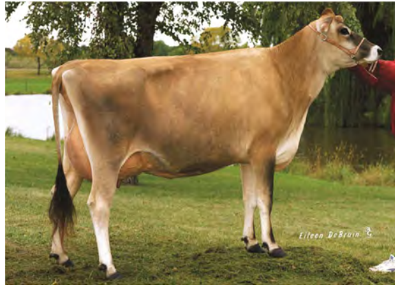
VALHALLA SPARKLER LEANN, VG-87% FIFTH DAM OF LOT 38