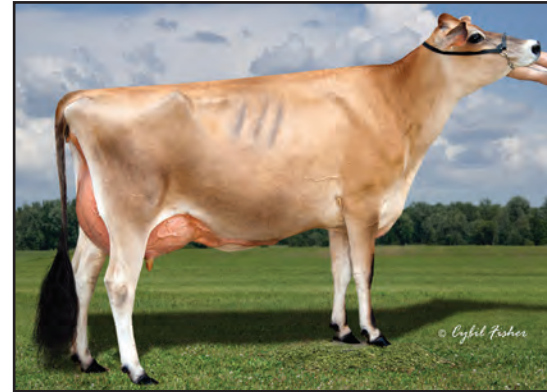
BBDN FUROR ENCINA-ET, E-93% SISTER TO GRANDAM OF LOT 33