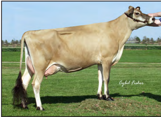
FAMILY HILL KJ FAVOR, E-94% SISTER TO GRANDAM OF LOT 31