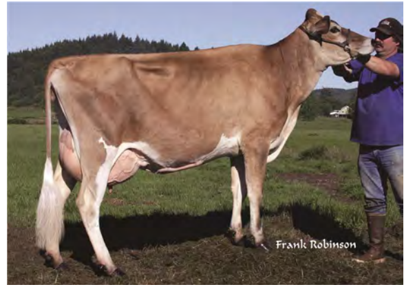
ROCHA HALLMARK WHISTLE, E-91% FIFTH DAM OF LOT 37