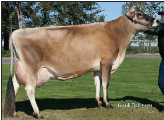
AHLEM COUNTRY ELLA 16710, E-91% FOURTH DAM OF LOT 35