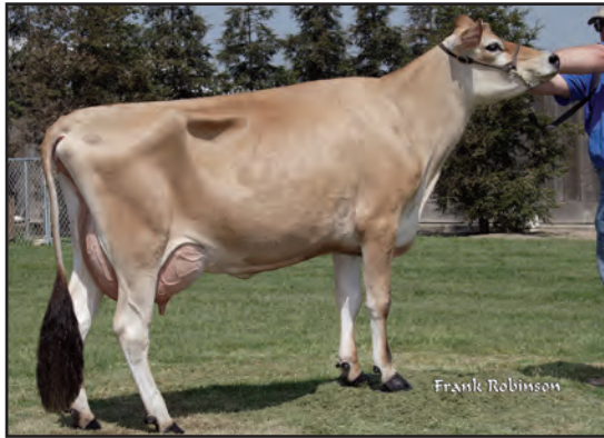
D&E PARAMOUNT VIOLET, E-90% FOURTH DAM OF LOT 32