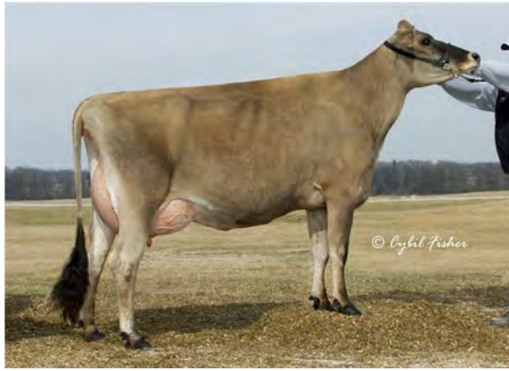
REMAKE PENNY OF JAUQUET, E-93% FOURTH DAM OF LOT 2