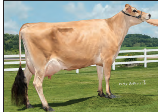
ALL LYNNS IMPULS VALENTINE-ET, VG-86% SISTER TO THE DAM OF LOT 34