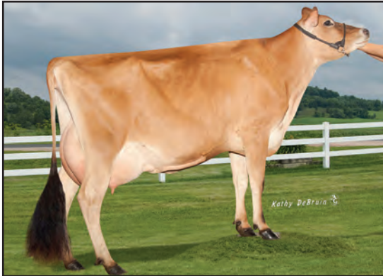
ALL LYNNS CELEBRITY VANITY-ET, VG-85% SISTER TO THE DAM OF LOT 34