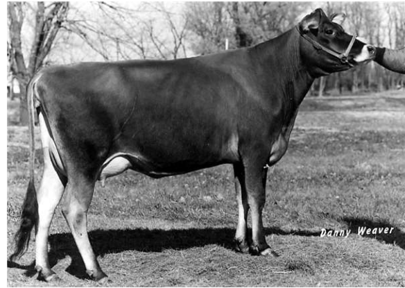
BRIDON DORIS GLADYS 6K, VG-86% SIXTH DAM OF LOT 1