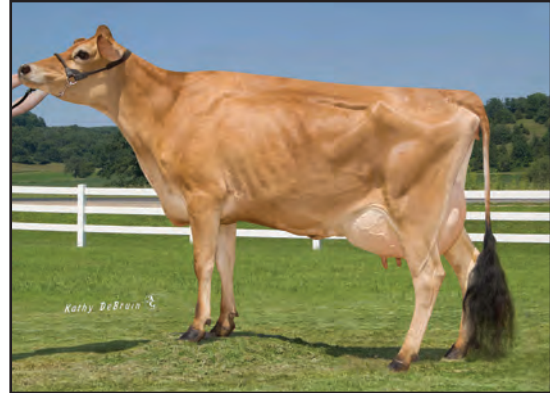
ALL LYNNS MAXIMUM VALERIE-ET, VG-80% SISTER TO THE DAM OF LOT 34