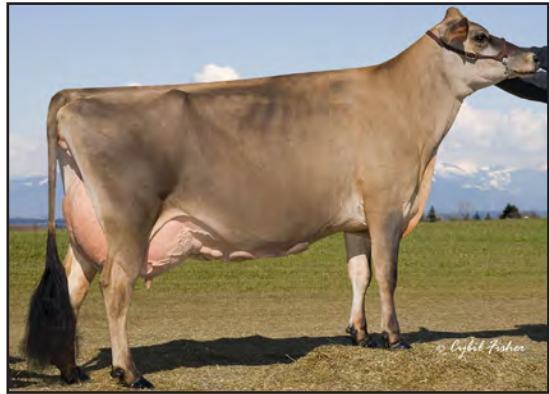
FAMILY HILL SD FAVORITE, E-95% SISTER TO GRANDAM OF LOT 31