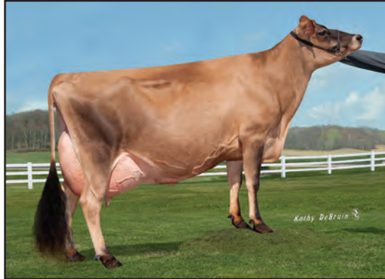
ALL LYNNS VALENTINO INGRID-ET, VG-88% GRANDAM OF LOT 35