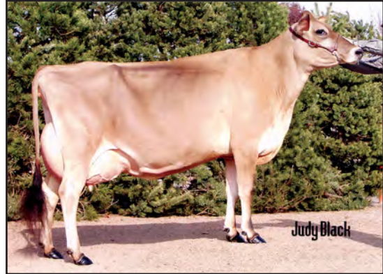
PLEASANT NOOK BERRETTA FELICE, E-95% GREAT-GRANDAM OF LOT 31