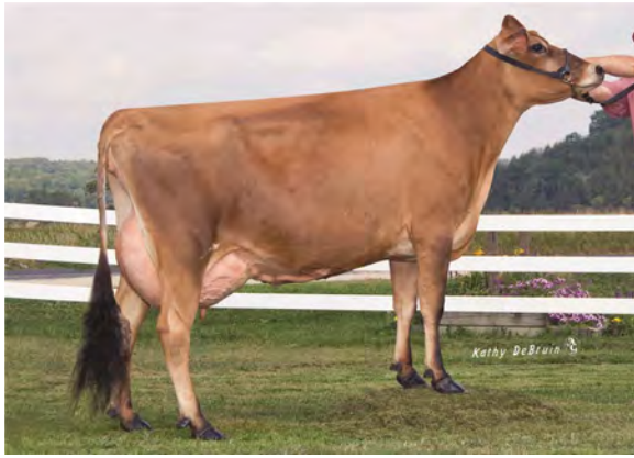
ROCHA IMPULS WHITNEY, VG-89% FOURTH DAM OF LOT 37