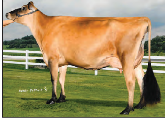
BBDN EXCITATION ESPECIALLY, E-91% GRANDAM OF LOT 33