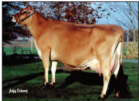
VANTAGE LEMVIG MAMME, E-90% GRANDAM OF LOT 166