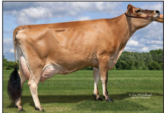
TJF/LEE ACTION MAMME 847-ET, E-92% SISTER TO THE DAM OF LOT 166