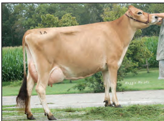
GABYS IMPULS DIANE-ET, VG-85% SISTER TO THE GRANDAM OF LOT 165