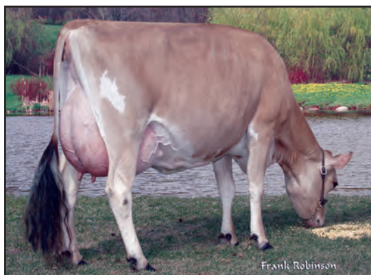
JVB RED HOT MOR BELINDA-ET, E-94% FOURTH DAM OF LOT 172