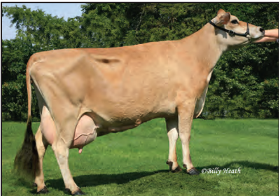
VANTAGE CURTIS MAME, E-90% SISTER TO THE DAM OF LOT 166