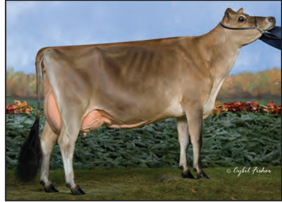
RATLIFF AMEDEO KRISSEY-ET, E-90% SISTER TO THE GRANDAM OF LOT 2