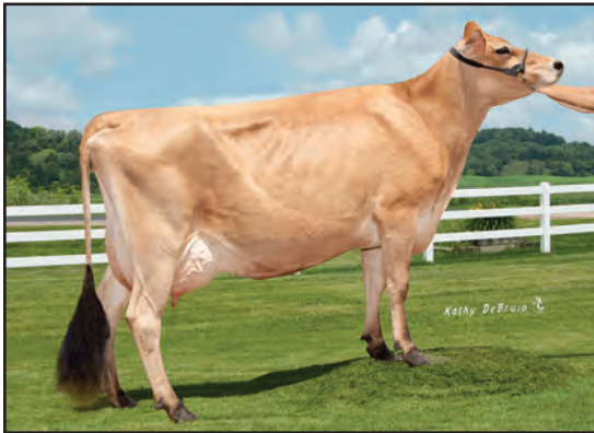
TJF/LEE ACTION MAMME 836-ET, VG-88% DAM OF LOT 166