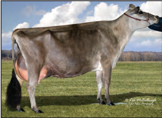
RENN KANDIE OF RATLIFF, E-95% SISTER TO THE GRANDAM OF LOT 2