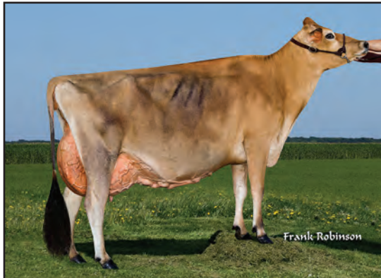
FREE-MAR BLACKSTONE BEEVES, E-92% SISTER TO THE GRANDAM OF LOT 172