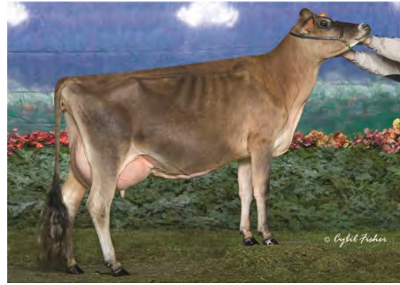
RATLIFF JADE GLITTER, E-92% GRANDAM OF LOT 1