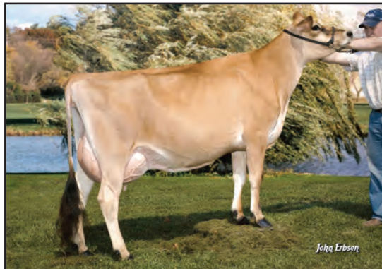
JVB RED HOT SABER BEBE, E-91% GREAT-GRANDAM OF LOT 172