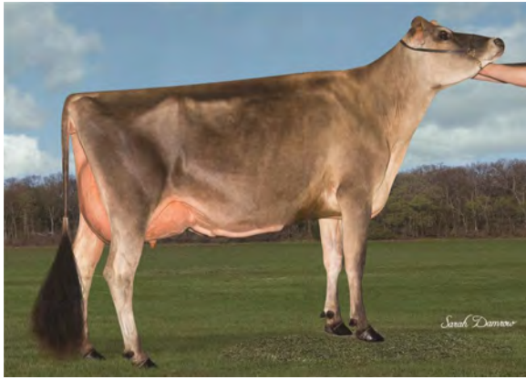
RATLIFF MINISTER MIDGEE, E-92% SISTER TO LOT 1