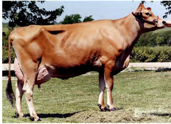
HEARTLAND DECLO DANA, E-90% SIXTH DAM OF LOT 159