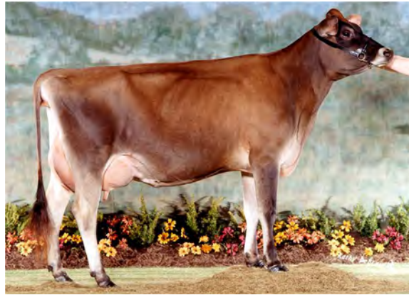
BRIDON PRE LIBERTY, E-95% FOURTH DAM OF LOT 3