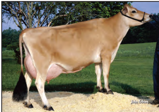
GABYS JACINTO DEMA, E-91% GREAT-GRANDAM OF LOT 165