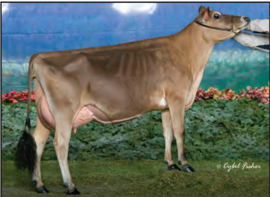
RATLIFF SAMBO KARLA-ET, E-93% SISTER TO THE GRANDAM OF LOT 2