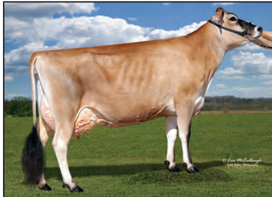
GABYS LANCELOT DRAGONETTE DAM OF LOT 165