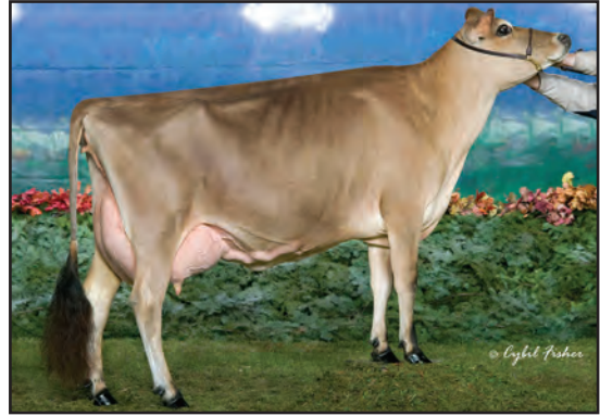
RATLIFF F PRIZE KAY-ET, E-93% SISTER TO THE GRANDAM OF LOT 2