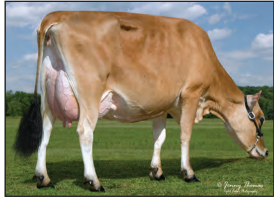
TJF/LEE ACTION MAMME 840-ET, E-90% SISTER TO THE DAM OF LOT 166