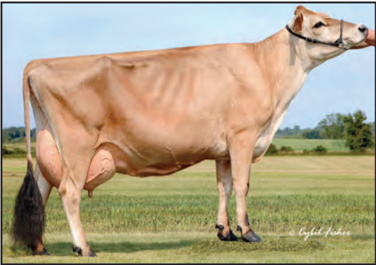
RATLIFF F PRIZE KIRBY-ET, E-90% SISTER TO THE GRANDAM OF LOT 2