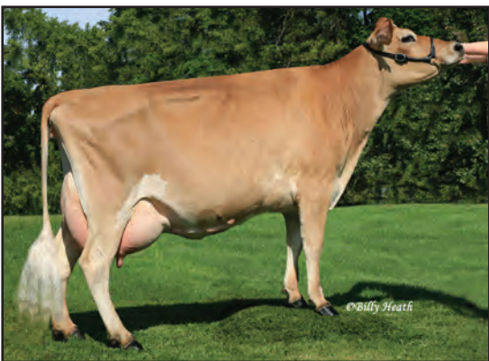
VANTAGE KLASSIC MARIE-ET, VG-86% SISTER TO THE DAM OF LOT 166