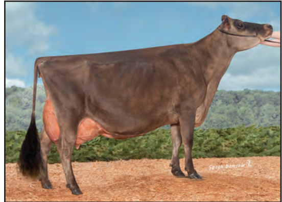
RATLIFF REN KENDRA-ET, E-95% SISTER TO THE GRANDAM OF LOT 2