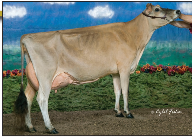
SAR SAMBO SHOWGIRL, E-92% Fourth Dam of Lot 4747