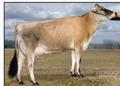
SAR RESSURECTION TIPSYP Sister to Grandam of Lot 4044