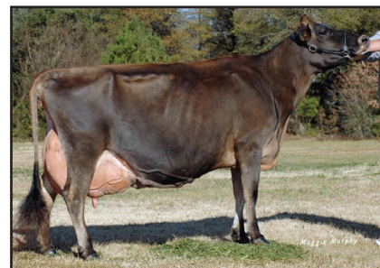
FRANKEN RENAISSANCE ANGELA Fourth Dam of Lot 4781

SUNSET CANYON MERCHANT-ET USA 114256027 GT50K BBR 100 JH1C JH2F 11JE884 CDCB GPTA 08/01/2016 2021DAUS 240HRDS 4%RIP 99%R 52M 0.14% 30F 20%ILE 99%R 0.03% 9P 120CM$ 108NM$ 79FM$ -25GM$ 0.6PL -4.7DPR -4.9CCR -2.7HCR 3.02SCS AJCA 08/01/2016 1383DAUS GPTAT 99%R 1.5 GJUI 16.2 GJPI 98%R 28