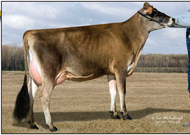
CRACKERJACK H GUN KYTE E-82, E-90% Grandam of Lot 4776