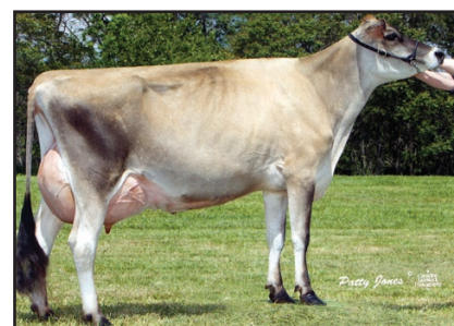
SAR SAMBO TALLY Sister to Grandam of Lot 4044