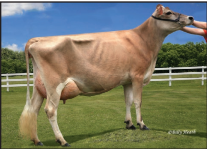
SC GOLD DUST ACTION ANGELA H-73-ET Sister to the Grandam of Lot 4768

DAM: SC GOLDDUST EXCITATION ANGIE USA 067534130 DHIA HERD # 56-36-0051 CONTROL # 4130 2-03 205 2 7720 5.0 385 3.1 238 94DCR 821C 305 2X ME AVG 1L 12408M 627F 395P 1363C PPA -3065M -102F -112P / YD -3967M -143F -147P CDCB PTA 08/01/2016 1RECS 53%R 3%ILE -1016M -34F -38P -242CM$ -227NM$ -192FM$ -242GM$ 0.7PL -1.3DPR 0.5CCR 0.6HCR 3.06SCS PA TYPE 0.9 JUI JPI 46%R-109 SELLING AS LOT 4130