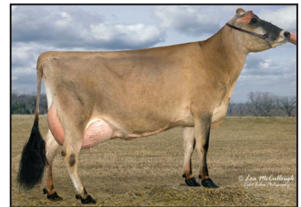
BRJ-ARCO LEGION MAN BELLE K-100-ET Great-Grandam of Lot 4725

4TH DAM: MANNIX BELLE-ET 90% 3-09 305 2 24090 4.9 1191 3.4 820 94DCR 2833C