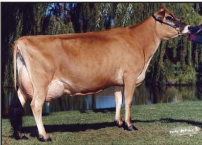
DUNCAN EILENE OF HLF, E-96% Sixth Dam of Lot 4726

PA 131M 25F 10P 265CM$ 252NMS 221FM$ 3.2PL 0.2DPR 0.0CCR 0.1HCR 2.89SCS PA TYPE 0.8 JPI 30%R 79 ST SR DF RA RW RL FA 0.5 -0.3 0.3 H1.0 0.2 P0.4 S0.8 FU RH RUW UC UD TP TL 0.7 0.7 0.3 -0.1 S1.1 W0.2 L0.4