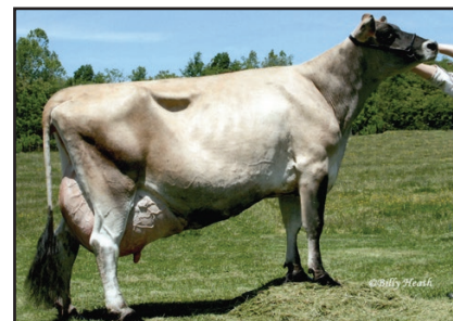
SAR IMPERIAL TINY Great-Grandam of Lot 4044