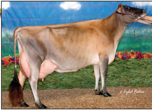
SAR ANDRE, E-95% Fourth Dam of Lot 4767