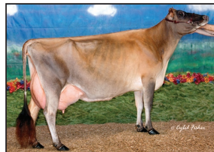
SAR ANDRE Great-Grandam of Lot 4356

SC GOLD DUST PARAMOUNT IATOLA-ET USA 112118277 GTHD BBR 100 JH1F JH2F 29JE3301 CDCB GPTA 08/01/2016 18128DAUS 2459HRDS 6%RIP 99%R -311M 0.11% 7F 19%ILE 99%R 0.05% -2P 108CM$ 93NM$ 59FM$ 94GM$ 0.9PL 0.3DPR 0.2CCR 0.1HCR 2.96SCS AJCA 08/01/2016 9397DAUS GPTAT 99%R 1.2 GJUI 15.7 GJPI 99%R 26