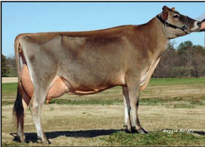
BRJ BOMBER PITINO EILENE X-17 Great-Grandam of Lot 4726