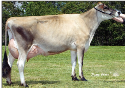
SAR SAMBO TALLY Sister to Grandam of Lot 4337

PEARL MONT RESTORE DIXIE-ET 90% USA 116341888 GT50K BBR 100 JH1F JH2C TATTOO / P5 DHIA HERD # 33-87-0722 CONTROL # 305 2-00 305 2 19000 4.3 819 3.4 650 97DCR 2209C 365 2 22546 4.3 975 3.5 789 97DCR 2653C 3-07 305 2 20010 4.6 930 3.5 697 89DCR 2409C 5-06 305 3 24280 4.4 1072 3.4 833 102DCR 2867C 305 2X ME AVG 4L 17392M 791F 620P 2117C PPA 1019M -4F 23P / YD 1404M 33F 46P CDCB GPTA 11/01/2016 4RECS 92%R 98%ILE 976M 26F 28P 371CM$ 366NM$ 356FM$ 281GM$ 4.9PL -1.4DPR 0.2CCR 2.7HCR 2.75SCS AJCA 11/01/2016 GPTAT 90%R 0.6 GJUI 6.0 GJPI 89%R 141