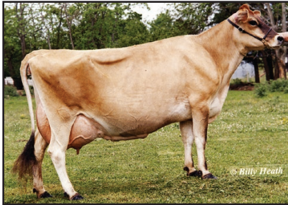
SAR DEALER POPOFF Fourth Dam of Lot 4744

JARS OF CLAY BARNABAS USA 067342492 GT80K BBR 100 JH1F JH2F 7JE1294 CDCB GPTA 08/01/2016 74%R 598M 0.07% 43F 47%ILE 75%R 0.02% 25P 326CM$ 315NM$ 289FM$ 222GM$ 2.8PL -1.9DPR -3.5CCR -1.0HCR 3.04SCS AJCA 08/01/2016 ODAUS GPTAT 75%R 2.2 GJUI 21.5 GJPI 72%R 116