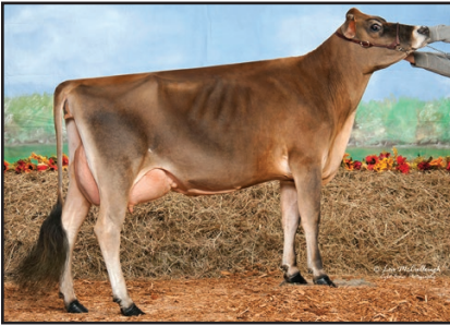
BRJ JADE BOMBER EILENE H-74-ET Grandam of Lot 4726

BUSH RIVER / SKIPARILLA / DORA BREEDER & OWNER NEWBERRY, SC