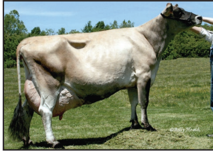
SAR IMPERIAL TINY Great-Grandam of Lot 4337

DORAN, TAMMIE STILES BREEDER NEWBERRY, SC