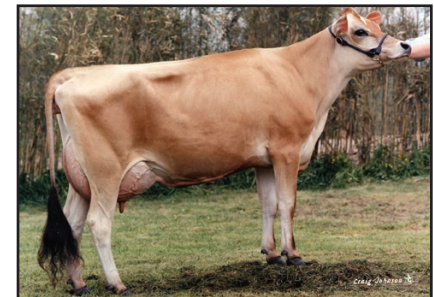
BOOMER BELLE, E-93% Fifth Dam of Lot 4725