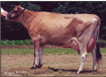
BRJ PITINO BERRETTA EILENE Fourth Dam of Lot 4726