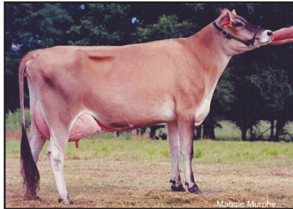
SAR BOMBER TULIP Sister to Grandam of Lot 4337

SELECT-SCOTT MINISTER-ET JECAN000101483843 GTHD BBR 100 JH1F JH2F 200JE427 CDCB GPTA 08/01/2016 1815DAUS 803HRDS 6%RIP 99%R -1751M 0.23% -42F 3%ILE 99%R 0.10% -44P -280CM$ -291NM$ -315FM$ -240GM$ 0.2PL 1.4DPR 1.5CCR -2.0HCR 3.16SCS AJCA 11/01/2016 1225DAUS GPTAT 98%R 0.4 GJUI 16.1 GJPI 97%R -134