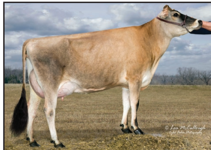
SAR RESSURECTION TIPSYP Sister to Grandam of Lot 4337

SAR SAMBO TATER-ET 80% USA 067213143 DHIA HERD # 56-36-0051 CONTROL # 3143 1-11 298 2 13840 4.6 638 3.5 486 101DCR 1680C 305 2X ME AVG 1L 18347M 834F 650P 2234C PPA -1818M -101F -64P / YD -2226M -122F -78P CDCB PTA 08/01/2016 1RECS 59%R 12%ILE -1115M -48F -38P -85CM$ -80NM$ -66FM$ -27GM$ 4.8PL 3.3DPR 4.5CCR 1.2HCR 2.92SCS AJCA 08/01/2016 PTAT 52%R 0.5 JUI 21.2 JPI 51%R -55 SIRE: LESTER SAMBO GJPI -56 8%ILE