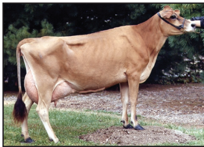
BOOMER BARBER J ANN-ET Fourth Dam of Lot 4734