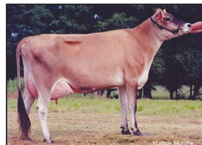
SAR BOMBER TULIP Sister to Grandam of Lot 4044