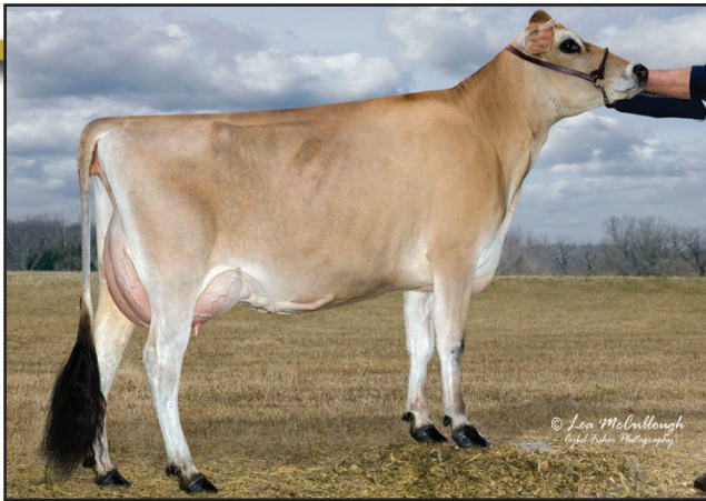
BRJ BOWTIE BERRETTA SHIVER R-96, VG-87% Great-Grandam of Lot 4746