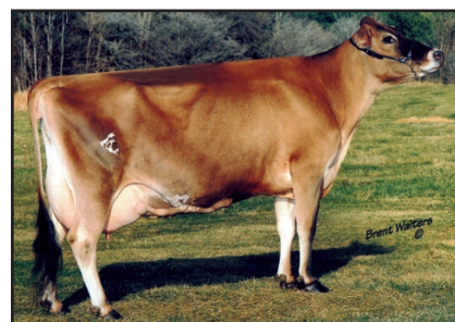
VAN DE DC JAN MARTHA Fouth Dam of Lot 4762