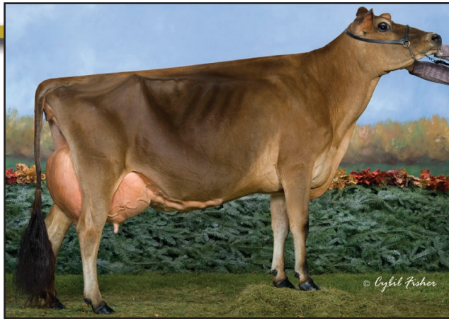
BRJ DUASEOIR BARBER FLIRT K-33-ET, E-93% Fourth Dam of Lot 4763