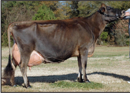
FRANK RENAISSANCE ANGELA Great-Grandam of Lot 4768

D&E PARAMOUNT VIOLET 90% USA 067007718 GTHD BBR 100 JH1F JH2F TATTOO / D7718 DHIA HERD # 35-57-0960 CONTROL # 7718 1-09 305 2 20540 4.6 954 3.3 684 94DCR 2362C 2-09 305 2 20550 4.5 921 3.4 705 94DCR 2436C 5-02 305 3 27600 4.2 1167 3.5 953 95DCR 3186C 305 2X ME AVG 3L 23841M 1059F 813P 2788C PPA 4295M 159F 124P / YD 3830M 141F 120P CDCB GPTA 11/01/2016 3RECS 96%R 99%ILE 1474M 51F 48P 427CM$ 425NM$ 418FM$ 297GM$ 3.9PL -3.2DPR -1.8CCR 1.2HCR 3.14SCS AJCA 11/01/2016 GPTAT 95%R 0.6 GJUI -2.9 GJPI 95%R 159