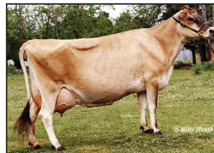
SAR DEALER POPOFF Fourth Dam of Lot 4356

SISTER(S): SAR SAMBO POLLY 90% 5-10 305 2 16490 5.1 838 3.8 625 101DCR 2162C SAR TUCKER POPTART 85% 6-10 305 2 20890 4.2 873 3.4 716 100DCR 2388C 1ST MILKING YEARLING, 2008 SC STATE FAIR JR SHOW 2ND MILKING YEARLING, 2008 SC STATE FAIR 4TH MILKING YEARLING, 2008 NC STATE FAIR SAR LEGIONAIR POPOFF 91% 3-10 305 2 19770 5.5 1085 3.8 743 101DCR 2570C SAR DUNCAN ANDRE-ET 81% 2-00 300 2 14980 4.9 733 3.8 563 101DCR 1948C