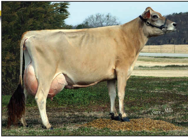
MANNIX BELLE-ET, E-90% Fourth Dam of Lot 4725