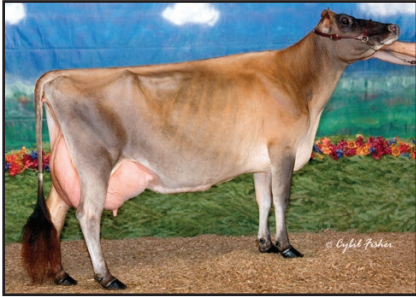
SAR ANDRE Great-Grandam of Lot 4744

SISTER(S): SAR GOVERNOR POPOFF 79% 2-00 305 2 19080 4.3 828 3.3 622 101DCR 2147C SAR APPLEJACK POPTART 80% 2-01 305 2 12590 5.3 662 3.5 439 99DCR 1517C