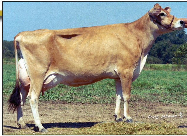
SOONER JUNO ANN, E-95% Fifth Dam of Lot 4734