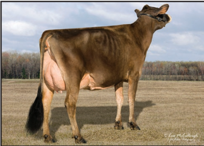
SC GOLD DUST GOVERNOR ANGELA A52-ET Sister to the Grandam of Lot 4768