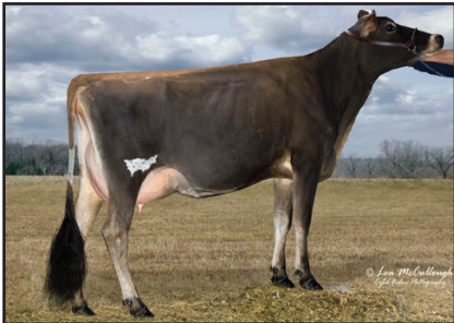
SARTUCKER POPTART Sister to the Grandam of Lot 4744