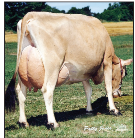
REBOB BERRETTA NELLIE EX 90 (CAN) Sixth Dam of Lot 4715

4TH DAM: BRJ PITINO BARBER NAN 84% 4-09 305 2 16290 5.5 901 3.9 640 95DCR 2215C