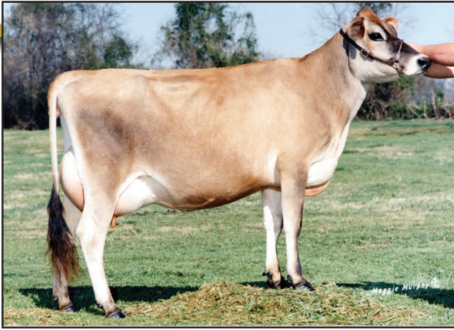
POTWELL BARBERS NAN 3G-ET, VG-88% Fifth Dam of Lot 4715