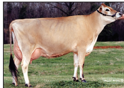
MORDALE MOMENTUM MARG Great-Grandam of Lot 4762

4TH DAM: VAN DE DC JAN MARTHA EX 91-5E (CAN) 5-00 305 2 25335 6.0 1521 3.7 939 CAN 3248C 1 STAR BROOD COW IN CANADA, 2008 SINGLE HALL OF FAME, 2004 SILVER AWARD ON 1-9 RECORD 1ST MATURE COW, 2002 GRAND PRIX JERSEY SHOW 5TH MATURE COW, 2002 ROYAL WINTER FAIR 5TH 5-YEAR-OLD, 2001 ROYAL WINTER FAIR 2ND 5-YEAR-OLD, 2001 ONTARIO DISCOVERY SHOW 2ND 5-YEAR-OLD, 2001 ONTARIO SPRING SHOW