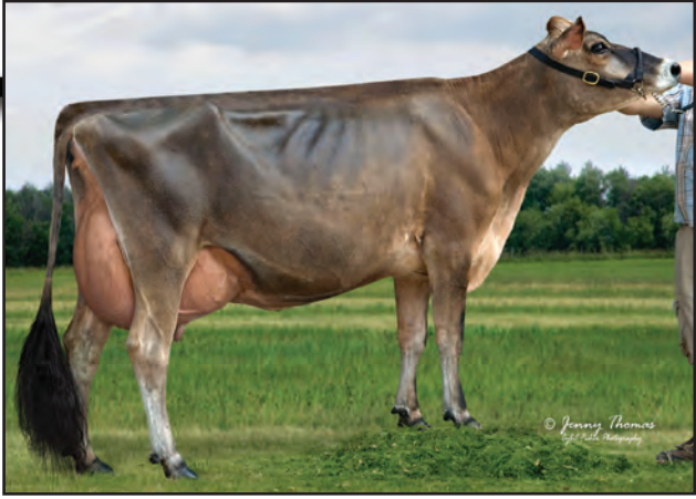
TJ CLASSIC SULTAN MIRACLE, E-91% Fifth Dam of Lot 4