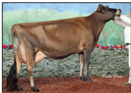
POTWELL WHISTLERS EMILY Great-Grandam of Lot 8

BORN 08/20/2018 PO FEMALE EFI 4.6% AMERICAN ID 109 / 109