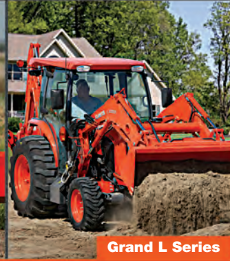
Grand L Series