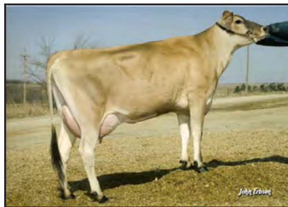
HEARTLAND ACTION AVIS Fourth Dam of Lot 12