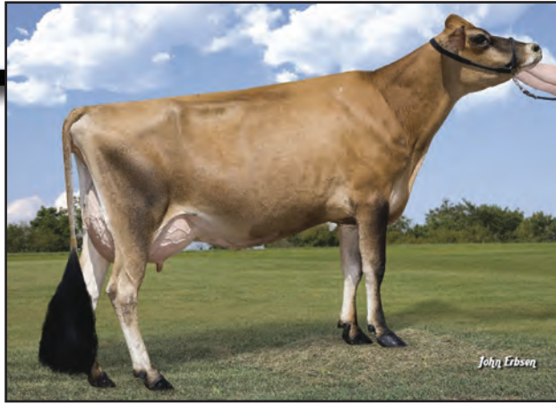
OHIO OLIVER KANOO 307-P, VG-86% Dam of Lot 14