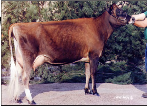
BERRETTA A TARA, E-90% Fifth Dam of Lot 1