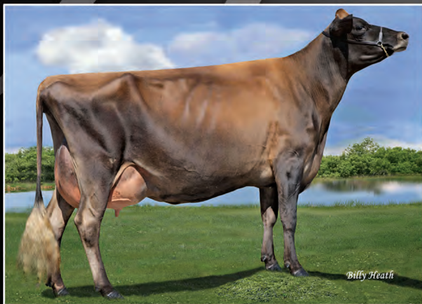
DAM - SV RESPONSE HYANCINTH-ET E-94%

Bred by & Acquired from: Spring Valley Farm Jerseys, Westminster, MD