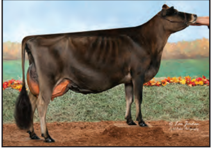
TJ CLASSIC PREMIER MISTY Sister to the Dam of Lot 4