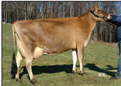
PEARLMONT IMPULS DAFFY, E-90% Sister to the Fourth Dam of Lot 2