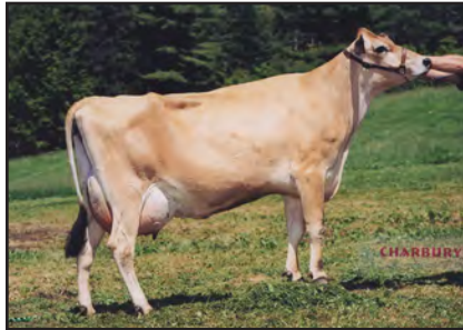
SOMERHILL MONTANA DAISY, E-91% Fifth Dam of Lot 2