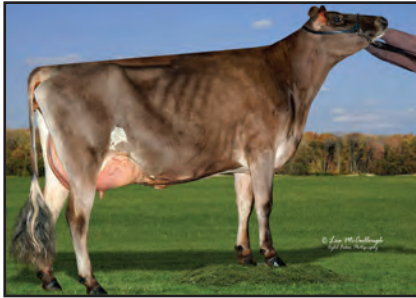
HEARTLAND SANTIAGO AINSLEY-ET Sister to the Grandam of Lot 12