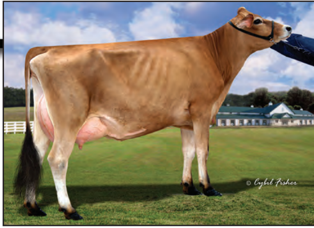
HEARTLAND SANTANA ARLENE-P-ET, VG-86% Sister to the Dam of Lot 12