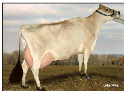
WELDY BLAIR TASHA, E-91% 5-2 305 21,860 5.7% 1238 3.7% 813

One of the 'landmark' activities of the Buckeye Dairy Club has been the dairy cattle sale. The first sale was held in the Plumb Hall arena on May 16, 1981 and was titled "Buckeye Classic Calf and Heifer Sale" with only Holstein cattle being sold. There were 41 lots sold the first year. The Club received the College's New Activity Award for the sale for the 1982-1983 academic year. By 1988, the title had become the Buckeye Classic Sale, it also included lactating Holstein cows, and it was moved to the Ohio State Fairgrounds.