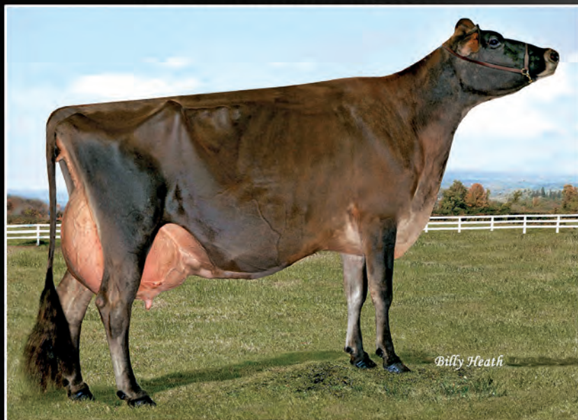
2ND DAM - PLEASANT VALLEY PRIME HEATHER E-96%