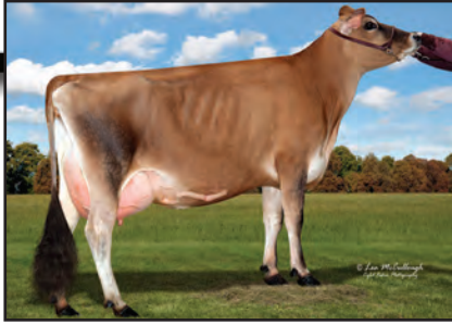
HEARTLAND TOPEKA ATHENA-ET Grandam of Lot 12