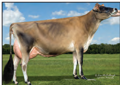
SELECT JADE EMY-ET Sister to the Grandam of Lot 8