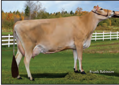
HEARTLAND DIGNITARY ABIGAIL-ET Sister to the Grandam of Lot 12