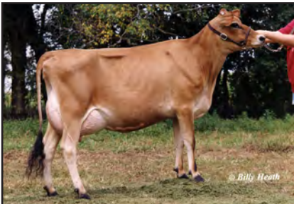
WF/L&M FRANCO BENNI, E-90% 2-1 305 15,480 3.8% 590 3.7% 575 2nd Two-Year-Old, 1998 Ohio State Fair