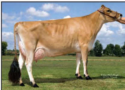
HEARTLAND ABE AVALANCHE Great-Grandam of Lot 12