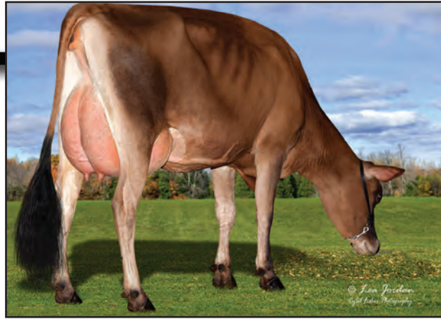
JX GENERATIONS JAMMER DORA {5}, VG-87% Dam of Lot 2