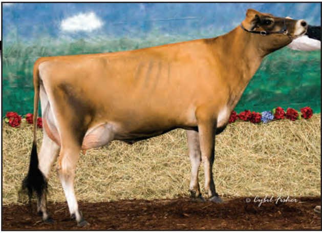
SUESS RASTUS RANDI, E-92% Grandam of Lot 16