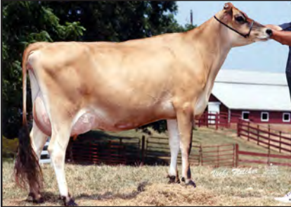
WILLIAMS IMPRESSIVE IDEA-ET, E-90% 3-5 305 20,096 4.7% 950 3.6% 715 Reserve Intermediate Champion, 2000 All American Jersey Show