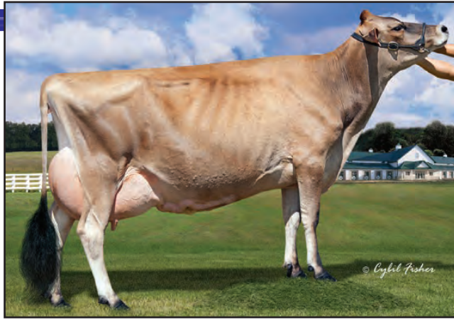
SUNSET CANYON JEVON L MAID 3-ET, VG-88% Great-Grandam of Lot 2