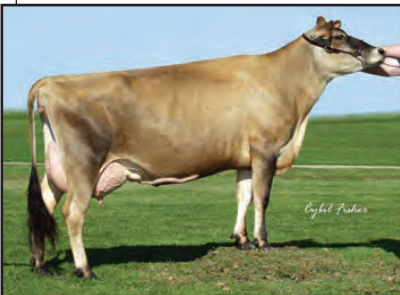
SAMBO FRAN OF FAMILY HILL Fourth Dam of Lot 43