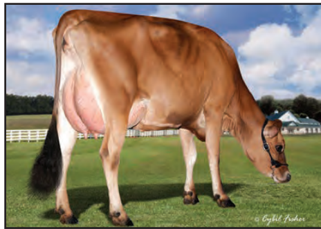
Sold in the 2014 All American Sale Ahlem Volcano Buttons 42731, E-91% 1-9 305 3x 16,930 5.8% 980 4.0% 673