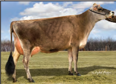
RATLIFF KING SNICKERS Sister to Dam of Lot 41