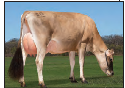
JER-Z-BOYZ PREMIUM CLAIRE {6}-ET Sister to Dam of Lot 66