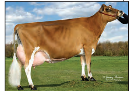
JX JER BEL DALE ABBY {3} Great-Grandam of Lot 20