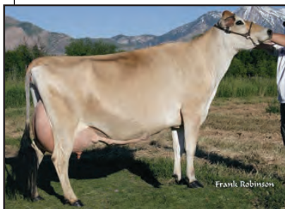
MONTANA LASSY Fourth Dam of Lot 53

ROCK ELLA REMAKE-ET JECAN00000139233 GTHD BBR 100 JH1F JH2F 94JE3083 CDCB GPTA 08/01/2018 3750DAUS 1294HRDS 4%RIP 99%R -1012M 0.17% -17F 5%ILE 99%R 0.03% -30P -65CM$ -69NM$ -76FM$ -27GM$ 2.2PL 1.3LIV 2.2DPR 1.7CCR -0.5HCR 2.83SCS AJCA 08/01/2018 2202DAUS GPTAT 99%R -0.1 GJUI 12.0 GJPI 99%R -16