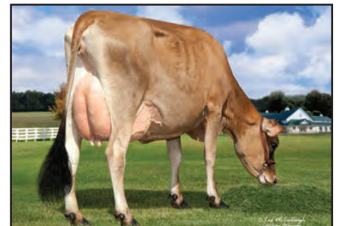
Sold in the 2010 All American Sale Hi-Kel TBone Pfenning-ET, E-90% 3-7 305 3x 21,200 4.8% 1,015 3.7% 781