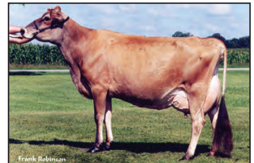
Sold in the 1997 All American Jada Boomer Sooner Dawn, Ex 92 (CAN) 4-5 305 19,720 3.9% 760 3.9% 769 CAN