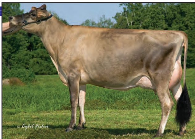
JURISDICTION JENNY, E-90% Sister to Dam of Lot 59