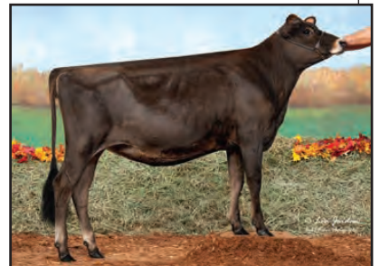
DISCOVERYS TEQUILA JEWELS-ET Sister to Dam of Lot 8