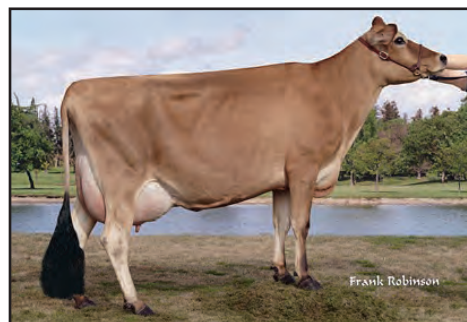
Sold in the 2005 All American Sale D&E Abe Cindy, VG-87% 3-7 305 19,510 4.6% 897 3.6% 706