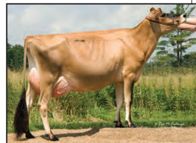
ARETHUSA VERONICAS PRANCER-ET Sister to Grandam of Lot 29 & 30