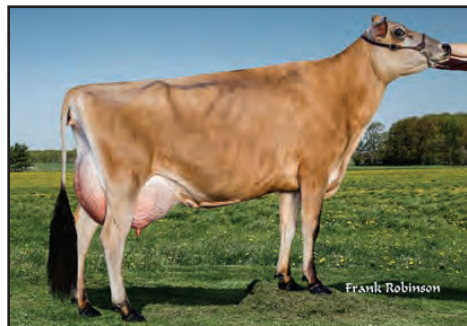
Sold in the 2013 All American Sale Springdale Action Tilli, E-93% 4-9 300 3x 16,010 4.5% 722 3.8% 601