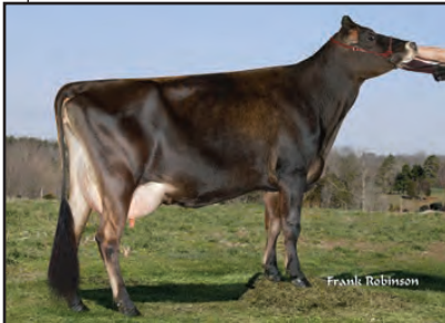
BERRYS TBONE PUCKET-ET Sister to Grandam of Lot 23