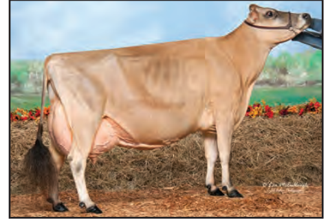
Sold in the 2006 All American Sale Sambo Fabulous-ET, E-93% 5-5 305 19,420 4.4% 862 3.5% 674