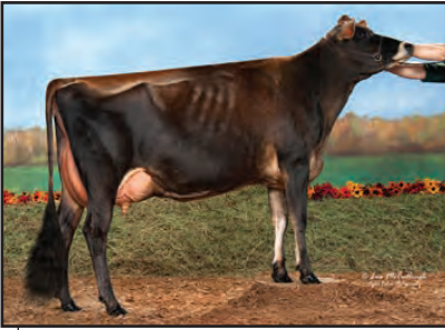
RATLIFF TEQUILA STYLE-ET Dam of Lot 41