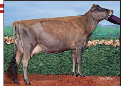
ARETHUSA SOCRATES VELVET Dam of Lot 38