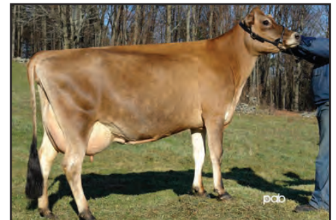
Sold in the 2008 All American Sale Pearlmount Impuls Daffy, E-90% 4-3 305 18,560 5.0% 932 3.8% 707