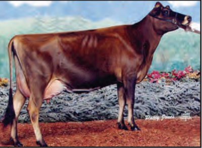
RONADA REN SOPHA Great-Grandam of Lot 41