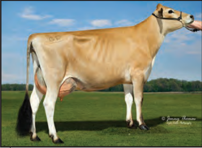
JER-Z-BOYZ SEVEN MAE 52120-P-ET Dam of Lot 4A & 4B