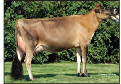
ARETHUSA RESPONSE VIEW-ET Grandam of Lot 34