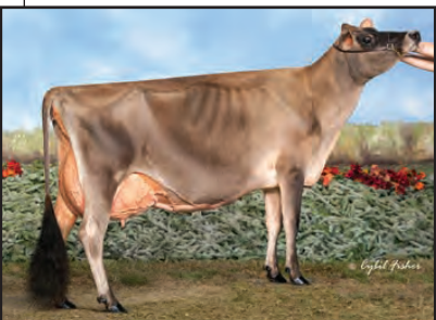
ARETHUSA VERONICAS COMET-ET Sister to Dam of Lot 35 & 36