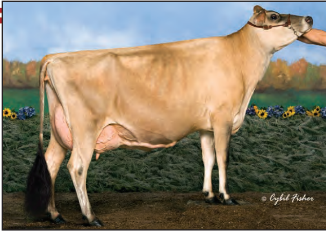
BRIDON BE WINK, E-92% Grandam of Lot 40