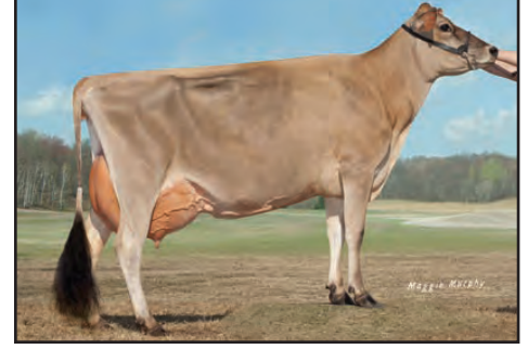
Sold in the 2011 All American Sale Hilmar Kilowatt 32102, E-93% 3-11 305 17,940 4.2% 757 3.4% 611