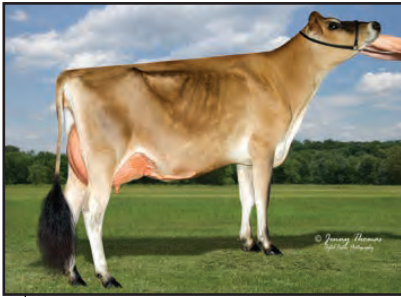
MORGANS MATT BELLA Selling as Lot 16