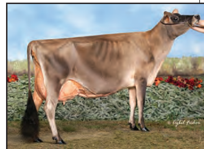
ARETHUSA VERONICAS COMET-ET Sister to Grandam of Lot 29 & 30