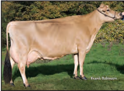
SUNSET CANYON LEMVIG MAID 4-ET Fourth Dam of Lot 2