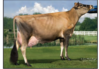
ARETHUSA DELUXE VERONIQUE Grandam of Lot 38