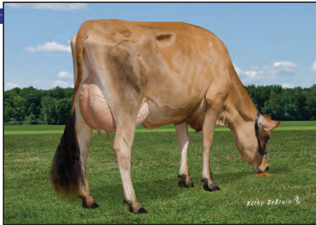
JX FARIA BROTHERS VANDRELL 308720, VG-86% Dam of Lot 5