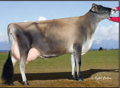
FAMILY HILL KAPTAIN FARRAH Grandam of Lot 43