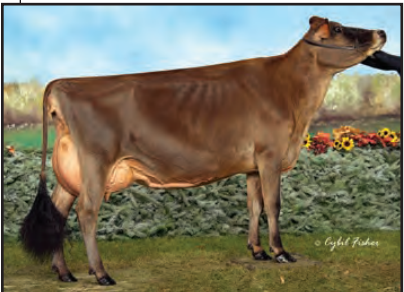
RATLIFF SAMBO DEMI-ET Grandam of Lot 39