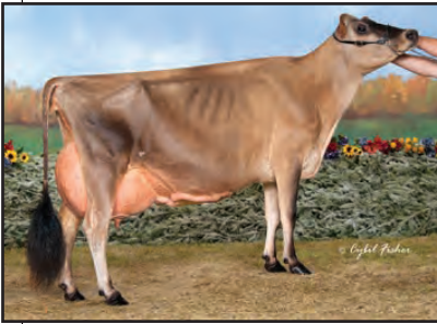
HILLACRES MORRAE MARYLAND Dam of Lot 9

HILLACRES MAGGIES MONA 77% 5-04 305 2 20200 4.7 943 4.1 819 DHIA 2580C