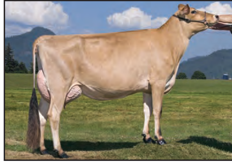
Sold in the 2006 All American Sale Sunset Canyon Sultan Anthem-ET, E-90% 4-7 305 3x 26,280 4.6% 1,221 3.5% 931