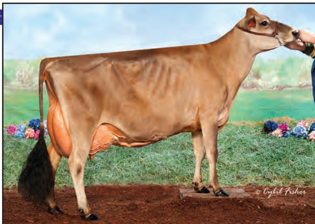
HEMENWAY HILL VALENTI TWEET, E-93% Dam of Lot 51