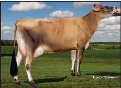
KY-HI TOPEKA FAITHFULL-ET Sister to Lot 31