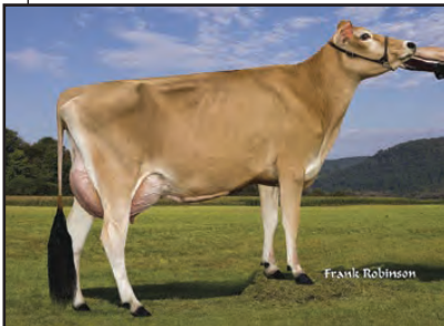
SUNSET CANYON FT M BELLE-ET Sister to Dam of Lot 16