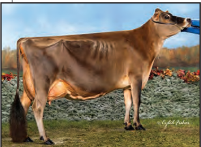
ARETHUSA VIXENS PRESTO Sister to Dam of Lot 37