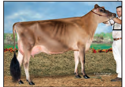
JEWELS IATOLA SUNRISE Grandam of Lot 58