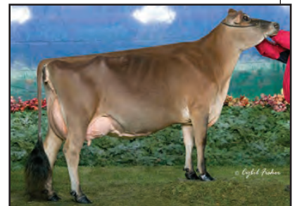
JEWELS PRIME SAPPHIRE-ET Fourth Dam of Lot 58