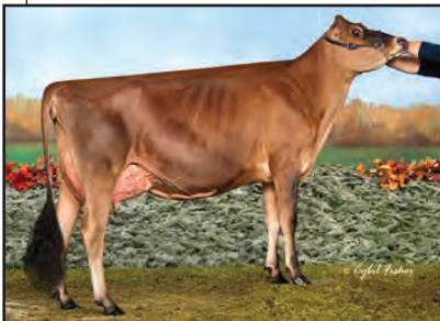
CROSSBROOK IMPRESSION DASHER-ET Sister to Dam of Lot 7