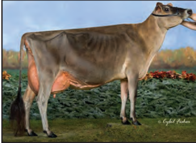
ARETHUSA VERONICAS DASHER-ET Grandam of Lot 7