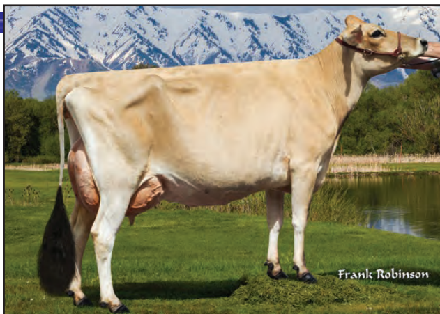
DC VENERABLE SASSY, E-93% Dam of Lot 53