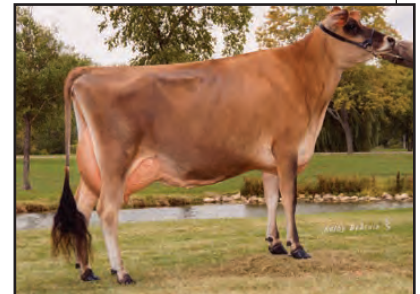
FAMILY HILL JADE CAROLINA-ET Sister to Grandam of Lot 24