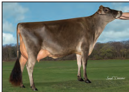
Sold in the 2016 All American Sale Lavon Farms Applejack Cheyene, VG-89%