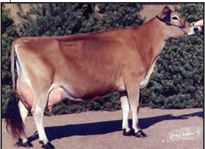
REICH-DALE BRIGADER SANDRA DEE Seventh Dam of Lot 53

JASPAR RENAISSANCES EVENING EX 91-3E (CAN) JECAN00000599920 GI BBR 100 JH1F TATTOO HCJ / 12E 6-08 305 2 20489 5.6 1153 4.0 814 CAN 2819C 8-02 305 2 23278 6.0 1394 3.8 891 CAN 3084C 8-05 305 2 22639 5.8 1314 3.9 882 CAN 3053C 9-05 305 2 22639 5.8 1314 3.9 882 CAN 3053C CDCB GPTA 10/02/2018 ORECS 86%R 1%ILE -1679M -38F -52P -337CM$ -333NM$ -326FM$ -263GM$ -1.3PL -0.7LIV 0.6DPR 2.3CCR 2.5HCR 3.03SCS AJCA 10/02/2018 GPTAT 76%R 0.4 GJUI 6.5 GJPI 80%R-104