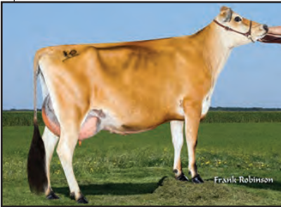
JER-Z-BOYZ PREMIER 38706 {6}-ET Sister to Grandam of Lot 4A & 4B