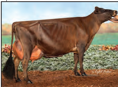
ARETHUSA TEQUILA VISION Sister to Lot 35 & 36