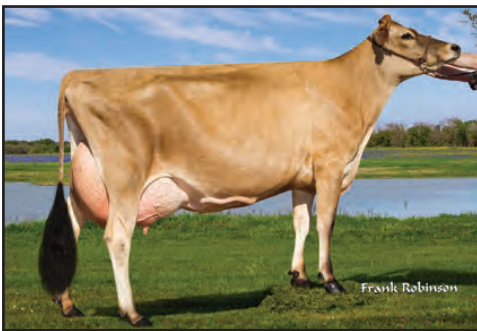
Sold in the 2015 All American Sale Spring Creek Chili Ivana-ET, VG-85% Projected to 25,613—1,400—959 ME at 1-9