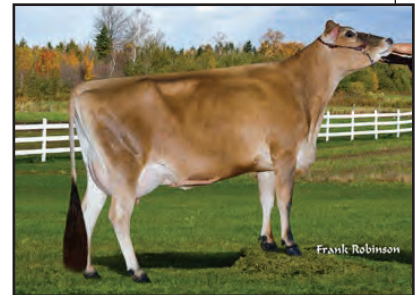
AHLEM MARVEL LADY 40814-ET Sister to Grandam of Lot 3

SISTER(S): AHLEM FASTRACK LADY 40421-ET 87% 4-05 305 3 20570 5.1 1041 3.7 765 94DCR 2646C AHLEM FASTRACK LADY 40449-ET 84% 5-00 305 3 20750 5.4 1120 4.0 820 96DCR 2839C AHLEM MARVEL LADY 40751-ET 81% 2-09 292 3 21680 4.7 1021 3.9 842 94DCR 2804C AHLEM MARVEL LADY 40791-ET 90% 2-08 305 3 22040 4.9 1087 3.8 844 95DCR 2911C AHLEM MARVEL LADY 40814-ET 90% 3-09 273 2 15340 5.0 760 3.9 595 96DCR 2042C AHLEM KARBALA LADY 40900 85% 3-10 305 3 19070 5.2 988 4.2 802 97DCR 2698C AHLEM BRIER LADY 43260 90% 3-02 305 3 20490 4.6 936 3.8 771 94DCR 2568C