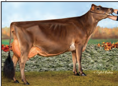
RATLIFF ACTION DABBLE-ET Full Sister to Dam of Lot 33