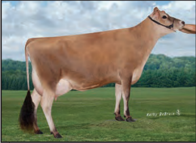
DODAN LH VISIONARY TESSA Sister to Gramdam of Lot 67

4TH DAM: TOLLENAAR IMPULS 3220-ET 88% 2-10 305 2 25370 7.0 1775 3.6 922 92DCR 3188C