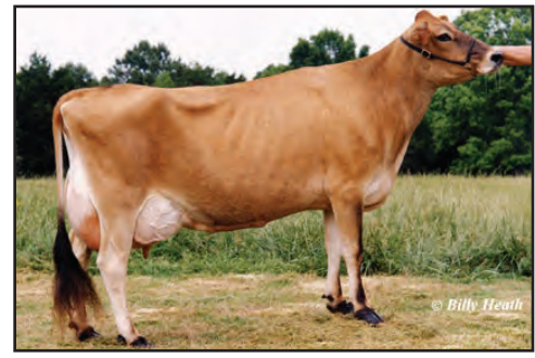
Sold in the 1995 All American Sale Amitys Barber Pine, E-94% 5-7 305 21,460 4.9% 1,060 3.5% 759