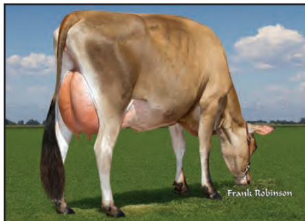
Sold in the 2009 All American Sale BW Renegade Katie ET749-ET, E-90% 6-2 305 3x 27,790 5.4% 1,504 3.8% 1,055