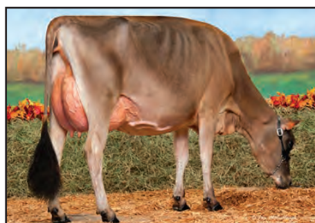
Sold in the 2014 All American Sale Billings Vindication Shea, VG-89% 18,492—823—634 ME at 1-11