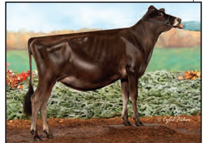
MILKSOURCE GENTRY MARRIOT-ET Sister to Lot 6