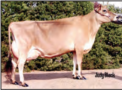
PLEASANT NOOK BERRETTA FELICE Fourth Dam of Lot 49