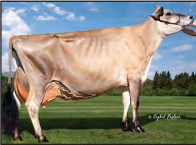
FLM BIG SHOW FENWAY Sister to Dam of Lot 43