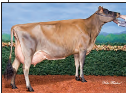
WAY-BON VINDICATION MARGARAT Great-Grandam to Lot 47

PLEASANT NOOK LEGACY MAGIC EX 90 (CAN) 4-03 305 2 16339 4.6 756 4.0 659 CAN 2128C 2ND 4-YEAR-OLD, 2015 BRANT-NORFOLK JERSEY PARISH SHOW MAPLE LEAF MARILYN-ET VG 86 (CAN) 2-02 296 2 13298 4.9 646 3.9 512 CAN 1745C PLEASANT NOOK MUST BE ONTIME-ET VG 85 (CAN) 1-10 296 2 13126 5.3 697 4.1 538 CAN 1864C MAPLE LEAF MIRANDA-ET VG 85 (CAN) 2-04 239 2 11437 4.8 549 3.8 437 CAN 1485C PLEASANT NOOK TEQUILA MIDSLIDE-ET VG 88 (CAN)