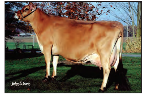
Sold in the 2005 All American Sale Vantage Lemvig Mamme, E-90% 4-4 305 3x 27,440 4.8% 1316 3.6% 996