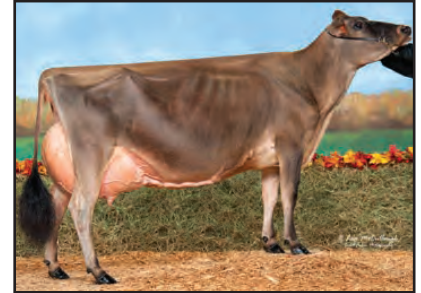
CASCADIA IATOLA PUZZLE Great-Grandam of Lot 56