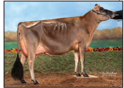
REICH-DALE ACTION SURVIVOR-ET Dam of Lot 17

NEXT DAM: REICH-DALE DUAISEOIR SYMBOL 92% 1-10 305 2 11560 4.5 524 3.8 437 95DCR 1445C 8TH IN JR FUTURITY, 2008 ALL AMERICAN JR SHOW 3RD JR 3-YEAR-OLD, 2008 CENTRAL NATIONAL 2ND JR 3-YEAR-OLD, 2008 MID-ATLANTIC RES INTERMEDIATE & RES GRAND CHAMPION, 2008 MID-ATLANTIC JR SHOW 1ST JR 3-YEAR-OLD, 2008 MID-ATLANTIC JR SHOW 1ST JR 3-YEAR-OLD, 2008 PA DISTRICT 2 4-H SHOW GRAND CHAMPION & SR CHAMPION, 2008 PA DIS. 2 4-H 1ST JR 3-YEAR-OLD, 2008 PA DISTRICT 2 SHOW GRAND AND INTERMEDIATE CHAMPION, 2008 PA DISTRICT 2 1ST JR 2-YEAR-OLD, 2008 PA FARM SHOW 1ST JR 2-YEAR-OLD, 2008 PA JR FARM SHOW RES GRAND AND RES SR CHAMPION, 2008 PA JR FARM SHOW 3RD JR 2-YEAR-OLD, 2007 ALL AMERICAN JR SHOW 2ND JR 2-YEAR-OLD, 2007 MID-ATLANTIC SHOW 1ST JR 2-YEAR-OLD, 2007 MID-ATLANTIC JR SHOW RES INTERMEDIATE CHAMPION, 2007 MID-ATLANTIC JR SHOW SIRE: SHAMROCK DUAISEOIR-ET GJPI -149 0%ILE