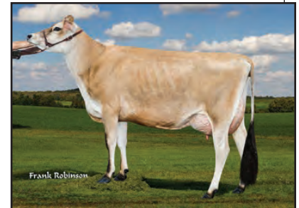
PUZZLES PANTHER-ET Sister to Grandam of Lot 56