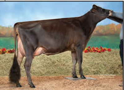
RATLIFF TEQUILA SHOTGLASS-ET Sister to Dam of Lot 41