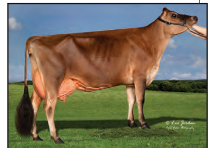
PUZZLES PREMIUM-ET Sister to Grandam of Lot 56