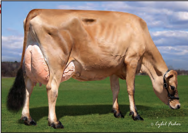
HILLVIEW LOUIE KATI-KI-P, E-90% Grandam of Lot 22