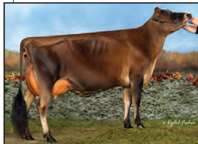
PLEASANT NOOK TEQUILA MAE, EX 94-2E (CAN)