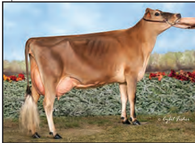
GARHAVEN I DREAM OF THE SPLASH-ET Sister to Grandam of Lot 27