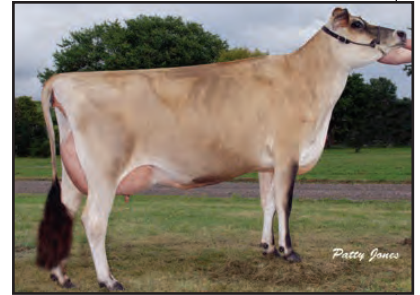
REXLEA REMAKE GERMAINE Fourth Dam of Lot 40

4TH DAM: REXLEA REMAKE GERMAINE SUP-EX 91-6E (CAN) 6-10 305 2 19283 5.1 975 3.8 741 CAN 2565C 1ST JR 3-YEAR-OLD, 2003 STRATFORD CHAMPIONSHIP SHOW 2ND JR 2-YEAR-OLD, 2002 STRATFORD CHAMPIONSHIP SHOW 3RD 3-YEAR-OLD, 2003 BRANT NORFOLK JERSEY PARISH 4TH MATURE COW, 2006 ONTARIO SPRING DISCOVERY 5TH JR 2-YEAR-OLD, 2002 ROYAL AG WINTER FAIR 6TH JR 2-YEAR-OLD, 2002 WORLD DAIRY EXPO NOMINATED ALL CANADIAN JR 3-YEAR-OLD, 2003 NOMINATED ALL CANADIAN JR 2-YEAR-OLD, 2002