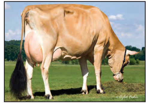
Sold in the 2010 All American Sale Billings RBR Style, VG-89% 2-8 305 17,970 5.1% 911 3.8% 686