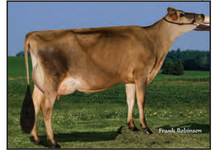
PRO-HART CHROME BRENDA Selling as Lot 15