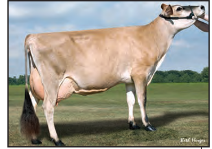
WAUNAKEE JEVON PROMIS 2058 Great-Grandam of Lot 62