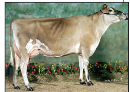
SHF FIRST PRIZE RITA Sixth Dam of Lot 60