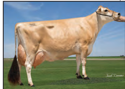
JER-Z-BOYZ DOMINICAN 39501 {6}-ET Sister to Grandam of Lot 4A & 4B