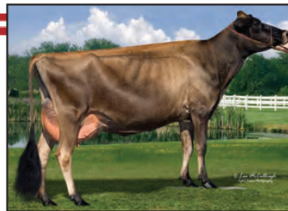
ARETHUSA RESPONSE VANITY-ET Full Sister to Dam of Lot 35 & 36