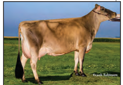
JX FARIA BROTHERS TOPEKA 220920 {2}-ET Sister to Grandam of Lot 68