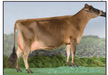
RESSURRECTIONS MONET OF EDGEBROOK Sister to Dam of Lot 6