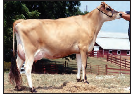
Sold in the 2001 All American Sale Williams Impressive Idea-ET, E-90% 3-5 305 20,096 4.7% 950 3.6% 715 Dam of SC Gold Dust Paramount latola-ET