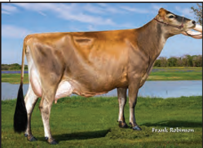
KY-HI TOPEKA HOPEFULL-P-ET Sister to Lot 31