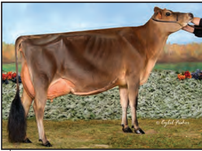
CHILLI PREMIER CINEMA-ET Dam of Lot 19