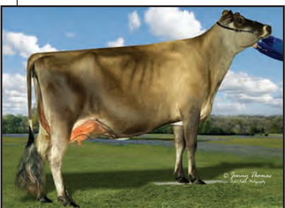
ARETHUSA SUREFIRE VENUS-ET Sister to Dam of Lot 37