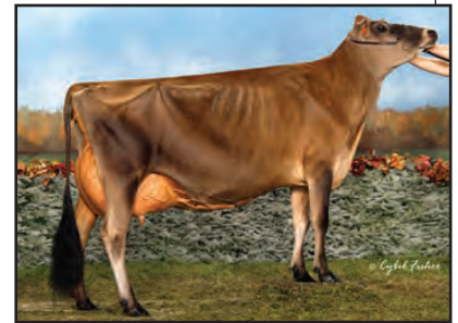
ELLIOTTS TEQUILA REESE Great-Grandam of Lot 60

NEXT DAM: ELLIOTTS TEQUILA REESE 95% 6-09 305 2 26500 6.2 1651 3.9 1023 97DCR 3541C 7TH 5-YEAR-OLD, 2015 WORLD DAIRY EXPO JERSEY SHOW NOMINATED ALL-AMERICAN & ALL-CANADIAN 4-YEAR-OLD, 2014 4TH 4-YEAR-OLD, 2014 ROYAL WINTER FAIR 3RD 4-YEAR-OLD, 2014 INTERNATIONAL JERSEY SHOW SENIOR & GRAND CHAMPION, 2014 EASTERN STATES EXPO 1ST 4-YEAR-OLD, 2014 EASTERN STATES EXPOSITION 3RD 4-YEAR-OLD, 2014 NY SPRING SHOW NOMINATED ALL-CANADIAN JR 3-YEAR-OLD, 2013 4TH JR 3-YEAR-OLD, 2013 ROYAL WINTER FAIR SIRE: TOWER VUE PRIME TEQUILA-ET GJPI -118 0%ILE