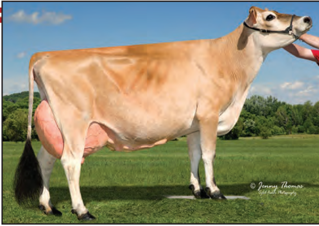
JX JER BEL VISIONARY ASPEN {5}, E-93% Dam of Lot 20