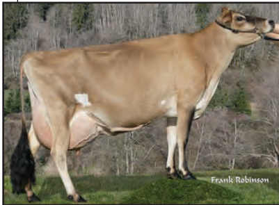
SUNSET CANYON HALLMARK BELLE 1-ET Fourth Dam of Lot 16