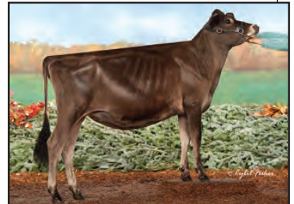
MILKSOURCE GENTRY MINK-ET Sister to Lot 6