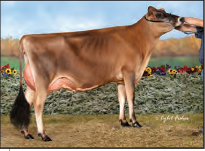
ROYALTY RIDGE G FASHIONISTA-ET Grandam of Lot 49