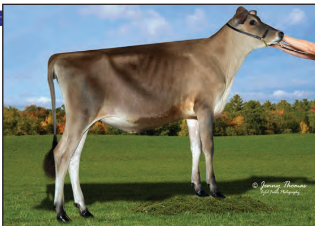
CHESTNUT HYLL SUEDE MEMPHIS Selling as Lot 25