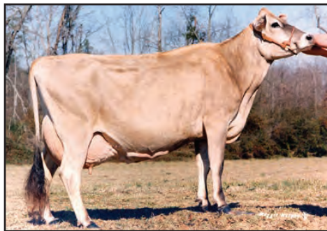
Sold in the 1996 All American Sale Piedmont Lester Betsy, E-92% 4-2 365 24,670 4.7% 1,170 4.0% 983