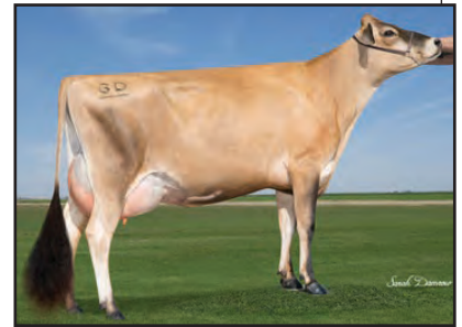
JER-Z-BOYZ PREMIUM JOYCE 48744 {6}-ET Dam of Lot 66