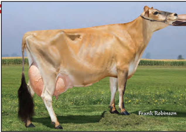
AHLEM TBONE LADY 31879, VG-88% Great-Grandam of Lot 3