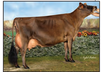
ARETHUSA PRIMETIME DEJA VU-ET Sister to Grandam of Lot 18A & 18B