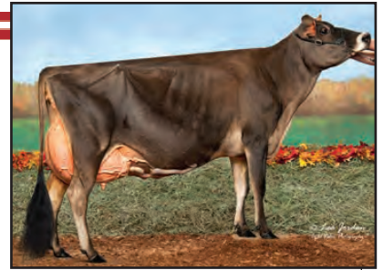
DISCOVERYS TEQUILA JEWELENE Dam of Lot 8

NEXT DAM: THOMSEN 4226 CADILLAC JAY {5} 95% 7-01 305 2 20660 5.4 1123 4.2 862 DHIA 2987C SENIOR & GRAND CHAMPION, 2008 MIDWEST JAMBOREE RES GRAND CHAMPION, 2007 & 2008 MN STATE FAIR FFA RES SENIOR & RES GRAND CHAMPION, 2009 MN STATE FAIR 1ST JR 2-YEAR-OLD, 2005 MINNESOTA STATE FAIR 1ST JR 2-YEAR-OLD, 2005 CENTRAL NATIONAL JUNIOR SHOW 1ST JR 3-YEAR-OLD, 2006 MINNESOTA STATE FAIR 1ST 5-YEAR-OLD, 2008 MIDWEST JAMBOREE & MN STATE 1ST AGED COW, 2009 MINNESOTA STATE FAIR SIRE: RENMOOR REMAKE CADILLAC {4} JPI -64 2%ILE