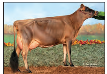
SUNRISE VINDICATION SUNUP Sister to Dam of Lot 58