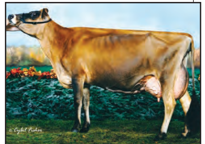
JADES JEWEL OF PARADISE {6} Sister to Grandam of Lot 8