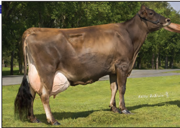
BERRYS BRAZO CENTURY {6}, E-90% Great-Grandam of Lot 23