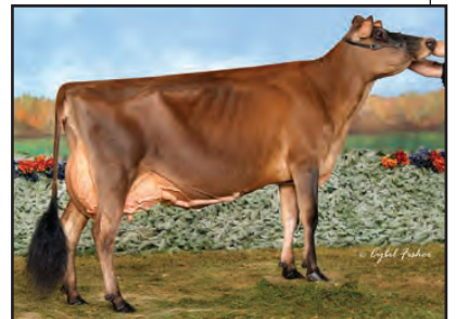
DEMME'S JADE JEMINI {6} Sister to Grandam of Lot 8