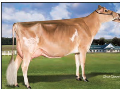
CHILLI NITRO CABO-ET Sister to Dam of Lot 19