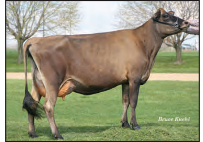
EDGEBROOK STYLEMASTER MERLOT Grandam of Lot 6