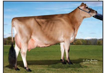
SCENIC VIEW MESCHACH BUTTERCUP-P-ET Sister to Dam of Lot 48