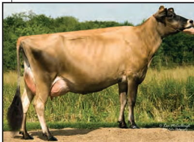
ARETHUSA VERONICAS DASHER Sister to Grandam of Lot 29 & 30