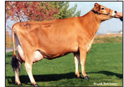
AHLEM GLENWOOD COMM PRINCESS {5} Sixth Dam of Lot 62