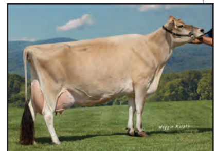
FAMILY HILL COMERICA CHANCE-ET Sister to Grandam of Lot 24