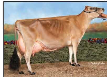
MILO CENTURION SASSAFRASS-ET Great-Grandam of Lot 28

4TH DAM: BRI-LIN RENS SOFIE EX 90 (CAN) 4-04 305 2 21505 5.2 1117 3.8 815 DHIA 2820C 1ST 4-YEAR-OLD, 2000 NEW YORK SPRING SHOW 5TH SR 2-YEAR-OLD, 1998 CENTRAL NATIONAL JERSEY SHOW 2012 JERSEY CANADA COW OF THE YEAR 7TH PLACE, 2015 GREAT COW CONTEST