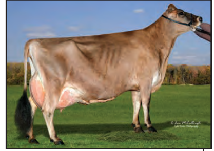
GABYS TBONE BUTTERCUP-ET Grandam of Lot 48