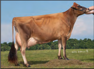
HAVS LOVABULL WATCHFULL-P Dam of Lot 31

SISTER(S): HAVS KODY ALARM CLOCK 80% 3-04 305 2 15170 3.4 515 3.2 490 97DCR V 1502C