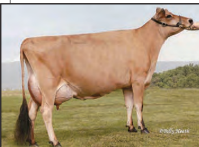
NORVAL ACRES ALI DELANEY Grandam of Lot 45