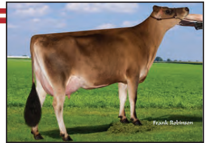
JX FARIA BROTHERS AVON 281569 {3} Dam of Lot 68