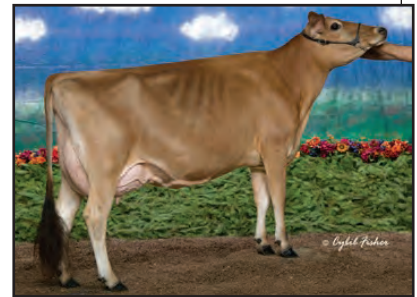
REICH-DALE DUAISEOIR SYMBOL Great-Grandam of Lot 17