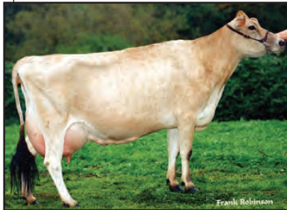
TENN HAUG E MAID Fifth Dam of Lot 2