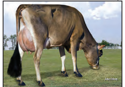
JX FARIA BROTHERS VALENTINO JEMMYE {2} Sister to Grandam of Lot 68