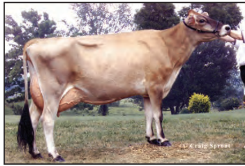
Sold in the 2002 All American Sale Nobledale Pitino Victoria, E-94% 3-4 305 21,030 4.3% 902 3.2% 671