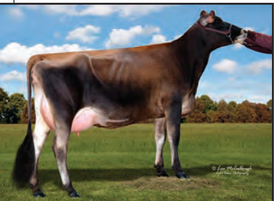
NORSE STAR TOPEKA DESIRE-ET Sister to Lot 45