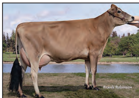
Sold in the 2002 All American Sale Jo-Gep Hallmark Party Time, E-90% 5-1 305 19,980 3.9% 772 3.4% 673