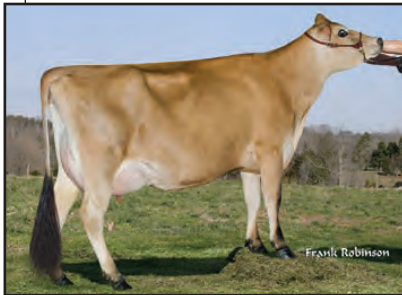
BERRYS TBONE PANAMA-ET Sister to Grandam of Lot 23

NEXT DAM: BERRY BRAZO CENTURY {6} 90% 4-02 305 2 19740 5.8 1147 3.4 666 102DCR V 2300C SIRE: SIL-MIST RMBM BUTTONS BRAZO {5}-ET GJPI 22 15%ILE