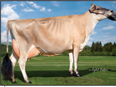
FLM ACTION FAIRY Dam of Lot 43

7TH DAM: GOLDCREST MR X FASHION 91% 6-11 305 2 17070 4.4 743 3.6 609 DHIR 1979C