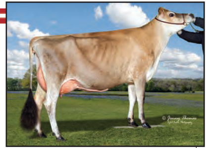
ARETHUSA HG LIBBY-ET Grandam of Lot 44

4TH DAM: SILVER DREAMS CENTR LINDY 92% 3-02 365 2 25261 5.7 1434 3.6 900 DHIR 3112C SR & GRAND CHAMPION, 2007 NEW YORK SPRING CAROUSEL 1ST 4-YEAR-OLD, 2007 NEW YORK SPRING CAROUSEL 4TH NATIONAL JERSEY JUG FUTURITY, 2006 ALL AMERICAN RES ALLBREEDS ACCESS ALL AMERICAN 4-YEAR-OLD, 2007