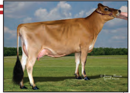
GABYS VIRGIL BUTTERSCOTCH-ET Dam of Lot 48

4TH DAM: GABYS LEMVIG BARBIE 92% 6-09 305 2 23550 5.6 1319 3.6 850 101DCR 2939C