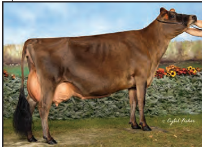
ARETHUSA PRIMETIME DEJA VU-ET Sister to Grandam of Lot 29 & 30