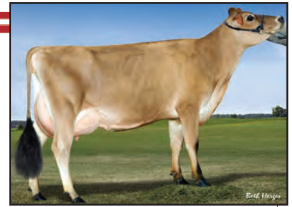
WAUNAKEE LEGAL PUFF-ET Grandam of Lot 62

6TH DAM: AHLEM GLENWOOD COMM PRINCESS {5} 92% 5-06 305 2 27150 4.1 1111 3.6 981 94DCR 3140C