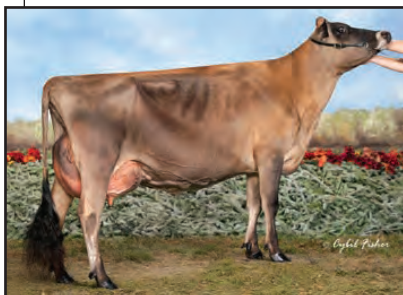
ARETHUSA FIRST PRIZE VIENNA-ET Full Sister to dam of Lot 37