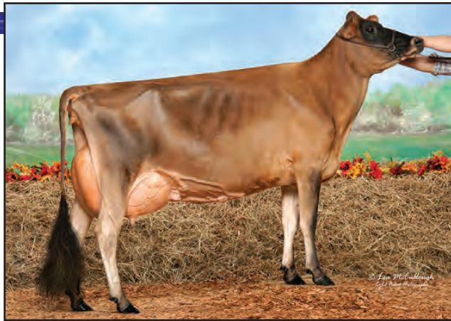
KCJF IATOLAS VIXEN, E-94% Grandam of Lot 61