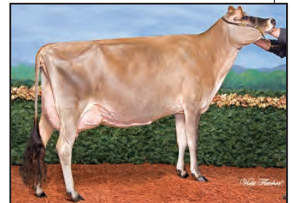
ARETHUSA VERONICAS CUPID-ET Sister to Grandam of Lot 34