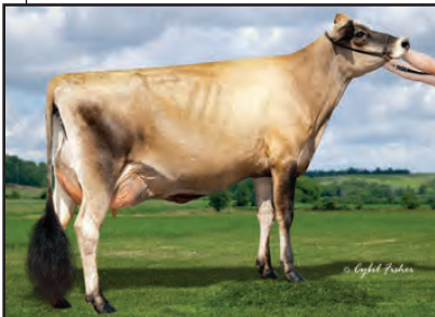
DIXIES SHOWDOWN DASH-ET Sister to Lot 7