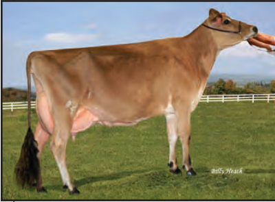
FAMILY HILL CONNECTION CHILLI-ET Grandam of Lot 19