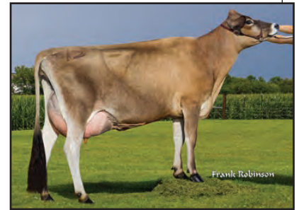
HILLVIEW MACHETE KEY-CHARM-P-ET Sister to Grandam of Lot 22