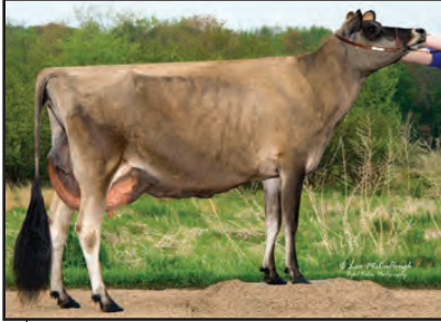
ARETHUSA VERONICAS BLITZEN-ET Grandam of Lot 29 & 30