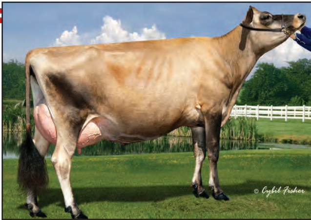
ELLIOTTS HG REBECCA, E-90% Grandam of Lot 60