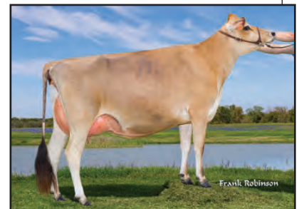
SOUTH MOUNTAIN COMERICA LIVELY-ET Sister to Grandam of Lot 44