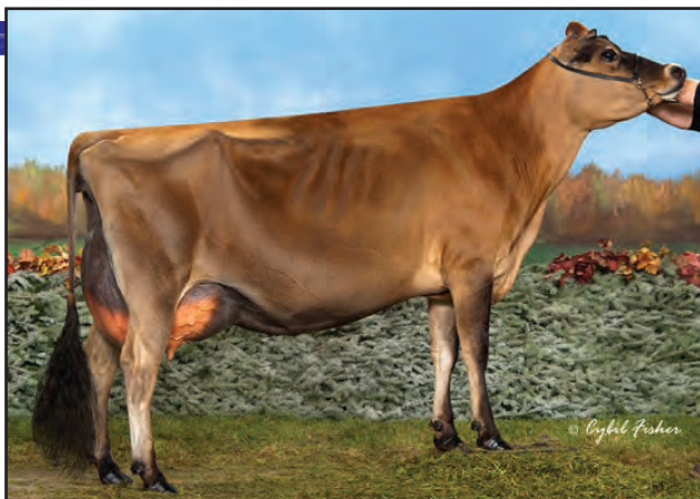
PLEASANT NOOK ACTION MARKELLE-ET, VG 89 (CAN) Grandam of Lot 47