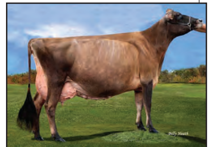
JEWELS SAPPHIRE Great-Grandam of Lot 58