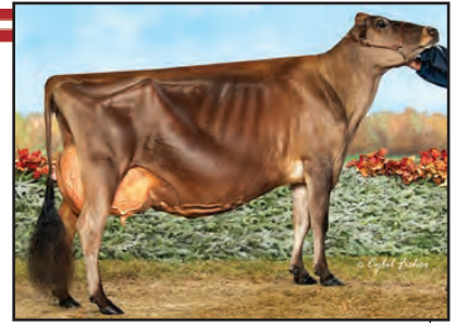
EDGEBROOK TEQUILA MADISON-ET Dam of Lot 6

AVON RD SVED MANIA OF EDGEBROOK 90% 8-02 305 2 17180 4.6 790 3.1 541 92DCR 1867C