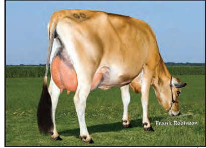
JX JER-Z-BOYZ GOOSE 38278 {3}-ET Sister to Grandam of Lot 4A & 4B