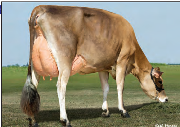
BLUE MOUNTAIN TEQUILA DAPHNE-ET, E-90% Dam of Lot 45