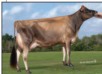
HARMONY CORNERS GINGERALE Sister to Dam of Lot 55