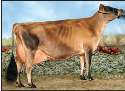
HURONIA CENTURION VERONICA 20J Great-Grandam of Lot 29 & 30