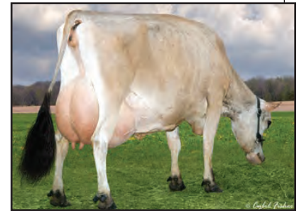
AHLEM B JOHN PRINCESS 3183-ET Fourth Dam of Lot 62