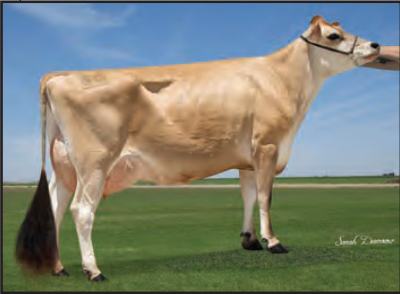
JER-Z-BOYZ CREDIBULL 47160 {6}-ET Sister to Grandam of Lot 4A & 4B