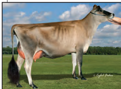
COWBELL IMPRESSION MAUI-ET Dam of Lot 25

4TH DAM: COWBELL BOGART MISFIT 90% 6-02 305 2 18160 4.4 794 3.5 630 95DCR 2142C