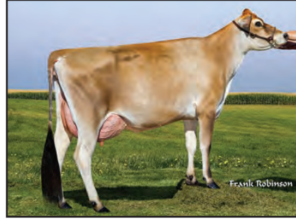
Sold in the 2015 All American Sale Family Hill Connection Can Do-ET, E-92% 4-9 302 14,640 4.4% 647 3.8% 560