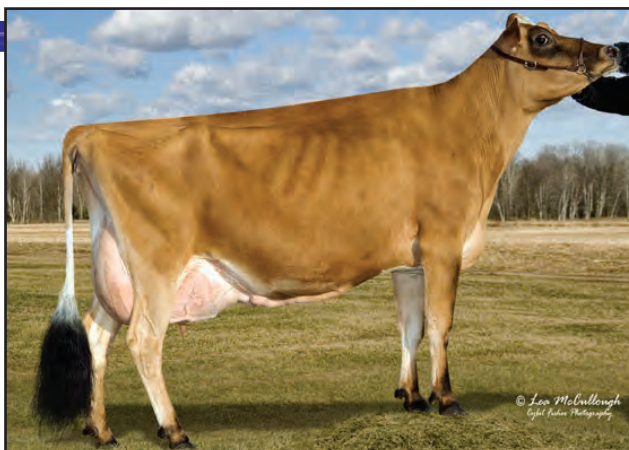
HARMONY CORNERS GRETCHEN, E-94% Great-Grandam of Lot 55