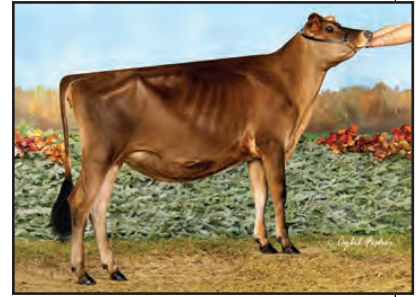
SV FIZZ CHORUS-ET Sister to Lot 18A & 18B