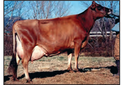
GABYS LEMVIG BARBIE Fourth Dam of Lot 48