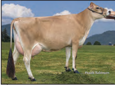
SUNSET CANYON MATINEE S BELLE Grandam of Lot 16