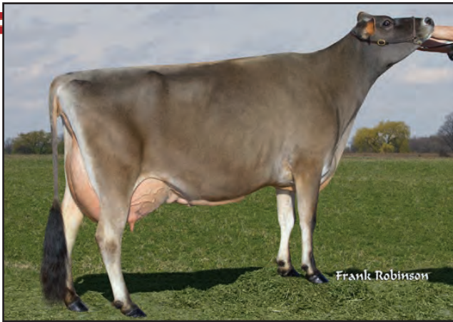
MRJ ROCKETS SUMMER GIRL, E-94% Grandam of Lot 64