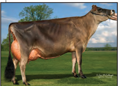
RATLIFF SAMBO DREAM-ET Full Sister to Grandam of Lot 39

BORN 09/16/2017 P1 FEMALE EFI 6.3% AMERICAN ID 15 / 15