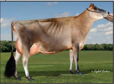
FAMILY HILL GOVERNOR FAVOR Sister to Grandam of Lot 49