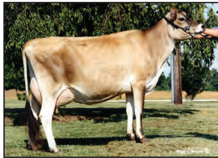
Sold in the 1992 All American Sale Sweet Grass 2875 Gurit-ET, E-90% 1-11 305 17,390 4.4% 956 3.6% 620