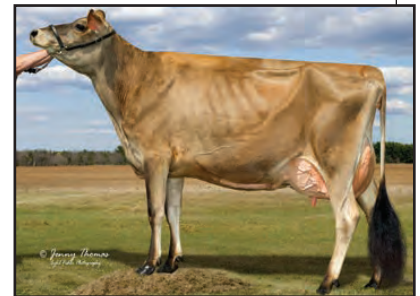
COLD RUN IATOLA LILLYBUG-ET Sister to Dam of Lot 44