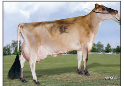
JX FARIA BROTHERS ACTION DEAN SMITH {1} Great-Grandam of Lot 68