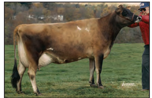
Sold in the 1994 All American Sale Billings Top Rosanne, E-96% 6-7 305 19,490 5.8% 1,138 4.1% 802 2-time National Grand Champion