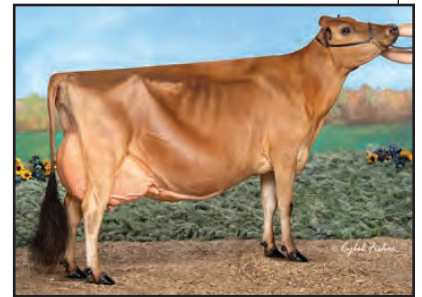
DC HARMONY NORMA, E-95% Same Family as Lot 52

4TH DAM: COOKIE ALENA 90% 5-02 305 2 18670 4.5 845 4.2 786 100DCR 2449C