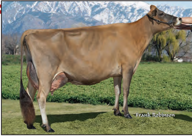
DC REGENCY COOKIE, E-94% Great-Grandam of Lot 52