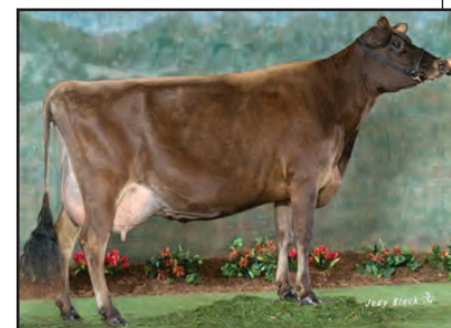
BRI-LIN RENS SOFIE Fourth Dam of Lot 28