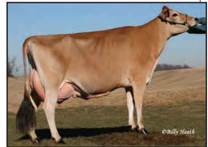
REICH-DALE GC SEQUENCE-ET Fourth Dam of Lot 17