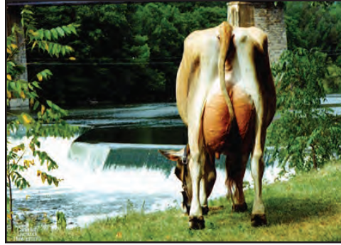
Sold in the 1993 All American Sale Hases Babes Lad Charo, EX 2 (CAN) 4-3 365 39,550 4.4% 1,726 3.6% 1,410 CAN