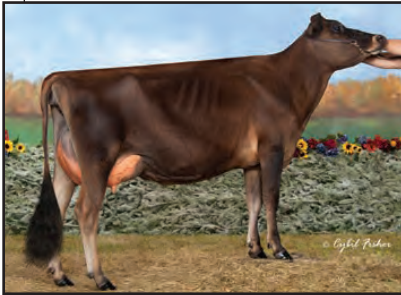
GARHAVEN IATOLA DUSK Dam of Lot 27

4TH DAM: STANSON M S C DEBBY 27T SUP-EX (CAN) 9-06 305 2 12414 4.8 598 3.6 450 CAN 1556C 2 STAR BROOD COW, DECEMBER 2011