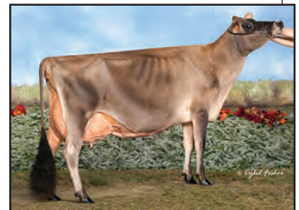
ARETHUSA VERONICAS COMET-ET Sister to Grandam of Lot 34