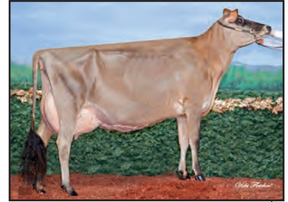
ARETHUSA DELUXE LYRIC-ET Great-Grandam of Lot 44