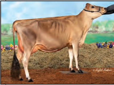
BUDJON-VAIL TEQUILA MACKENZIE Sister to Lot 9