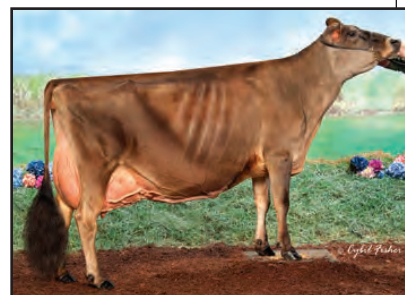
ARETHUSA RESPONSE VIVID-ET Full Sister to Dam of Lot 35 & 36