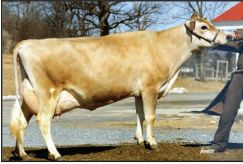
Sold in the 1987 All American Greenridge FW Chief Althea-ET, E-92% 10-4 305 21,240 4.1% 862 3.9% 832 DHIR 15 Sons in A.I.