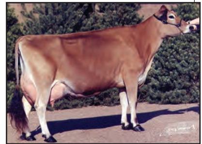
REICH-DALE BRIGADIER SANDRA DEE Fifth Dam of Lot 17