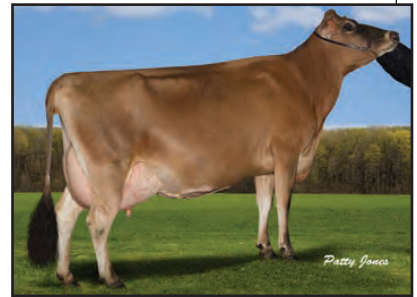
GABYS ACTION BABY-ET Great-Grandam of Lot 48