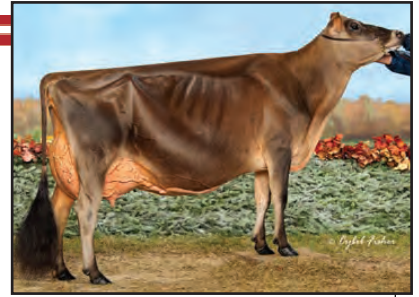
ELLIOTT'S BLACKSTONE CHARLOTTE-ET Sister to Dam of Lot 18A & 18B