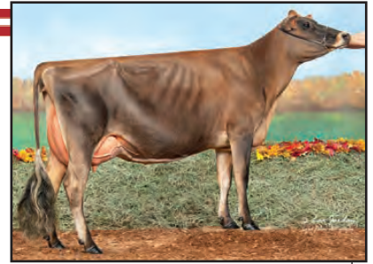
TLJ TEQUILA CAMEL-ET Dam of Lot 24