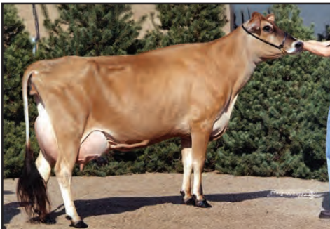
Sold in the 1999 All American Sale Headspring Berretta Push, E-92% 3-9 305 31,110 4.5% 1,403 3.7% 1,153 DHIR