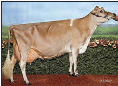
GARHAVEN FUROR DOMINATRIX TRIX-ET Sister to Grandam of Lot 27