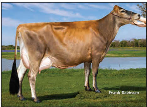
Sold in the 2013 All American Sale Ky-Hi Topeka Hopefull-P-ET, E-90% 3-0 305 3x 20,860 5.0% 1,040 3.7% 775