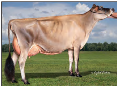
SHINING STAR MIN DAMITARI-ET Dam of Lot 39