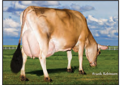
JX FARIA BROTHERS HULK IBRAHIMOVIC {2}-ET Grandam of Lot 68