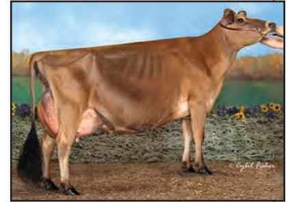
EMERVEST SENZAS LILLYBUG-ET Dam of Lot 26

PLEASANT NOOK STARDUST LEGACY VG 88 (CAN) 4-02 305 2 14407 4.8 690 3.7 531 CAN 1837C