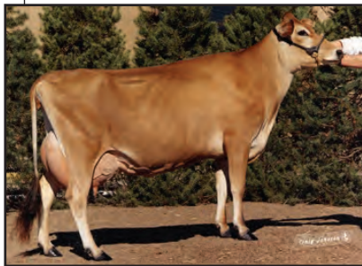
LAURICK BERRETTA CALAIS Fourth Dam of Lot 65