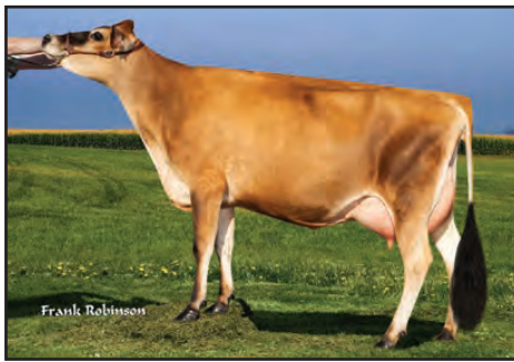
Sold in the 2016 All American Sale Progenesis Matrimony-ET, VG-83% Projected to 22,591—959—801 ME at 2-0