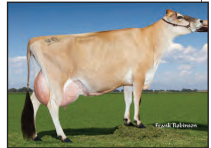
JER-Z-BOYZ BENEFACTOR 29424 {5} Grandam of Lot 66