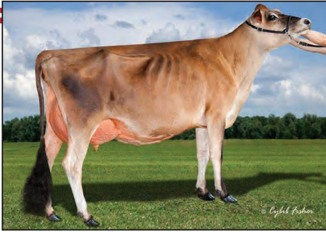
SMOKIN HOT LIGHT THE LAMP, E-92% Dam of Lot 50