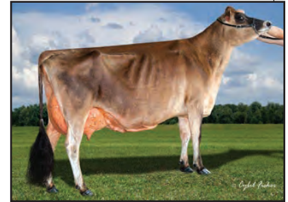
SMOKIN HOT LOVELY RENDITION Grandam of Lot 50

4TH DAM: RON-NET DUKE LIESHA 80% 8-01 303 2 14150 5.0 703 3.9 549 97DCR 1887C