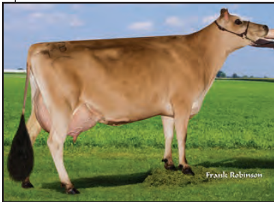
JX FARIA BROTHERS MAGNUM 255658 {2}-ET Grandam of Lot 5

BORN 05/14/2018 P9 BBR 100 FEMALE EFI 5.8% AMERICAN ID 412953 / 412953 JH1F JH2F