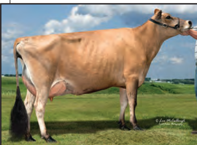
BLUE MOUNTAIN TEQUILA DELILAH-ET Sister to Dam of Lot 45

BORN 06/25/2017 PO FEMALE EFI 4.8% AMERICAN ID 5572 / 5572