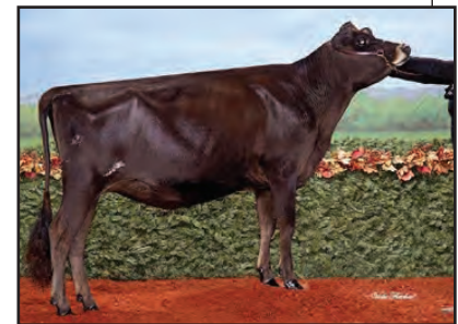
SVHEATHS HGUN COROLLA-ET Sister to Lot 18A & 18B