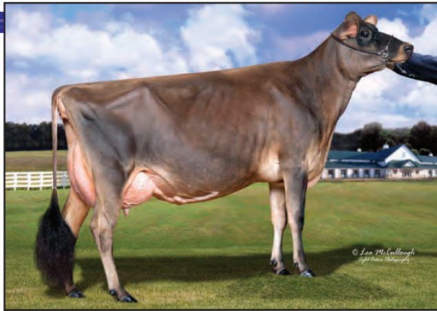
LAURICK GILLER MISSIE, E-92% Grandam of Lot 65