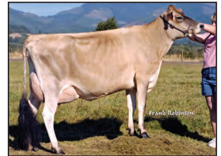
Sold in the 2004 All American Sale Rocha Charismatic Rubal, E-93% 6-2 305 21,840 5.0% 1,097 3.4% 735