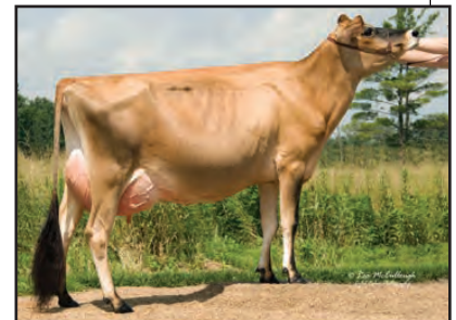
ARETHUSA VERONICAS PRANCER-ET Sister to Grandam of Lot 34