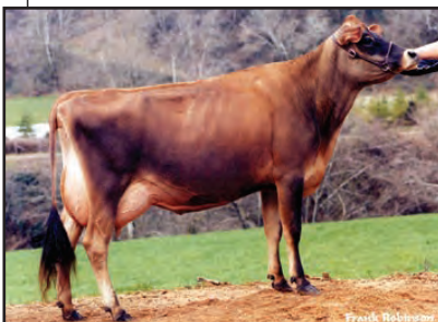
GIPRAT B MIDNIGHT SHADOW-ET Fifth Dam of Lot 16