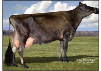
THOMSEN 4226 CADILLAC JAY {5} Great-Grandam of Lot 8