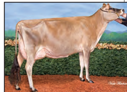
ARETHUSA VERONICAS CUPID-ET Sister to Grandam of Lot 29 & 30