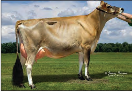
Sold in the 2016 All American Sale TJ Classic Action Venus, E-91% Projected to 20,664—855—785 ME at 3-5