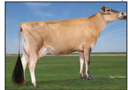
JER-Z-BOYZ BULLISTIC 48933 {6}-ET Sister to Dam of Lot 66