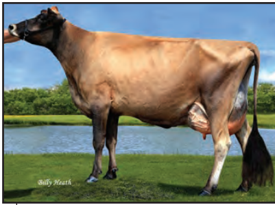
ARETHUSA HG BLUSHING-TWIN Dam of Lot 29 & 30