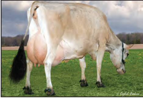
Sold in the 2004 All American Ahlem B John Princess 3183-ET, E-91% 6-9 305 3x 35,900 4.8% 1,728 3.2% 1,153