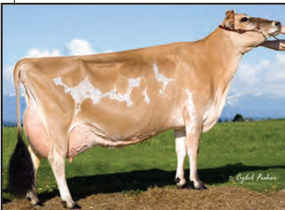
PLEASANT NOOK F PRIZE CIRCUS Great-Grandam of Lot 19