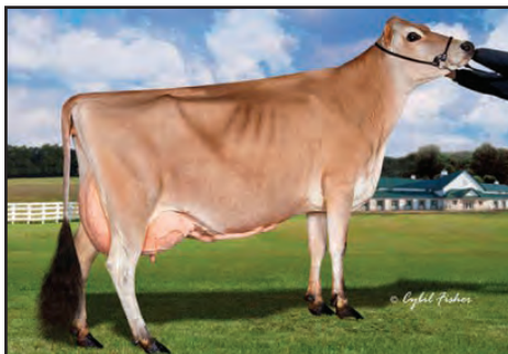
Sold in the 2010 All American Sale Sunset Canyon Headline Daffy 3-ET, E-90% 4-6 305 3x 24,060 4.4% 1,048 3.3% 795