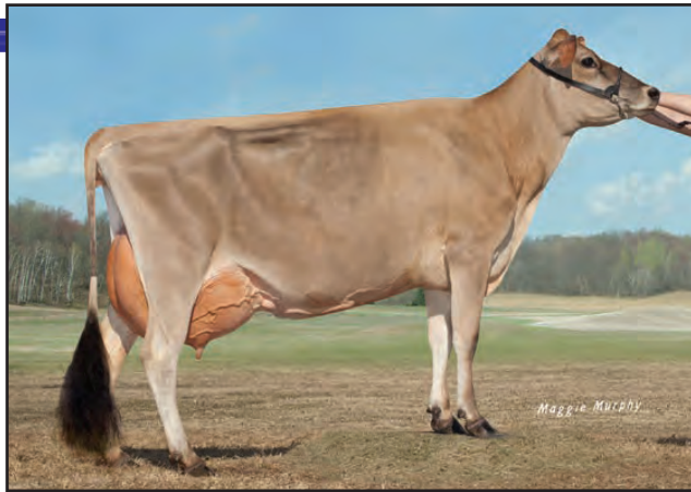
HILMAR KILOWATT 32102, E-93% Great-Grandam of Lot 21