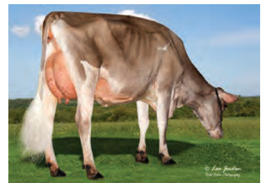
JX PVF Eusebio Bettie (5), VG-87%

+653 ICC$™ | +172 JPI™ | +602 CM$ | +1836 Milk | +161 CFP