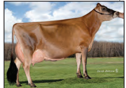
UHT CANAAN MORGAN BROOKE Sister to Dam of Lot 15