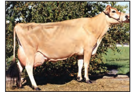
AHLEM BSB PRINCESS 6112 {6} Fifth Dam of Lot 62