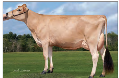
Sold in the 2014 All American Sale Orthridge-DB Prescott Radish, VG-86% 1-10 305 17,050 4.8% 816 3.5% 605