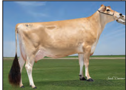
JER-Z-BOYZ PLUS 45661 {6}-ET Sister to Grandam of Lot 4A & 4B