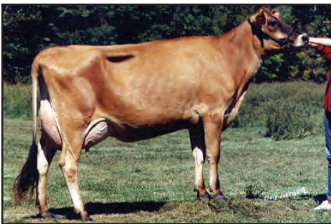
Sold in the 1990 All American Duncan Nanni, E-92% 6-4 305 25,310 4.5% 1,148 3.5% 882 DHIR 4th Sr. 2-yr.-old cow, 1990 All American