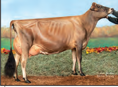
FLM TRADITION FLOWER Sister to Dam of Lot 43