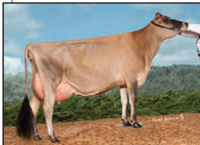
COWBELL SOCRATES MADEMOISELLE Sister to Dam of Lot 25