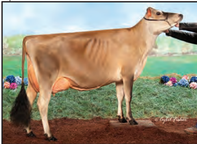
ELLIOTTS REGENCY CORRINA-ET Sister to Lot 19