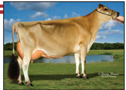
MISS EHRHARDT MOZART SUNSHINE Dam of Lot 58

7TH DAM: HOLLYLANE N GIRLS TREASURE EX-2E (CAN) 8-02 305 2 14063 4.4 624 4.1 573 CAN