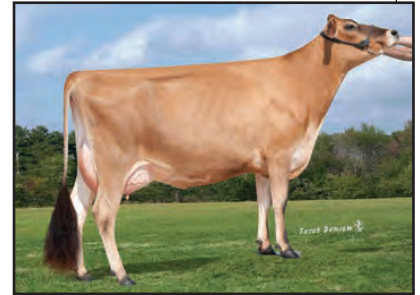
FAMILY HILL REN CARLY-ET Grandam of Lot 24