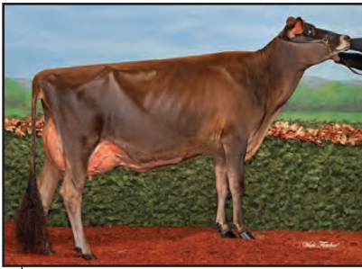
CROSSBROOK HG DIXIE-ET Dam of Lot 7