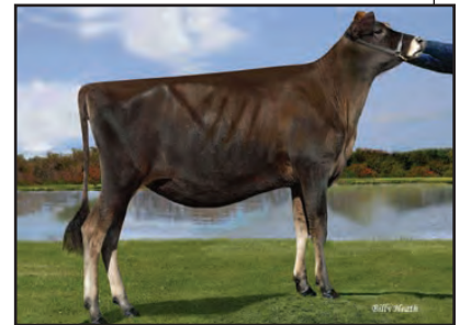
SV FIZZ CONSTELLATION-ET Sister to Lot 18A & 18B