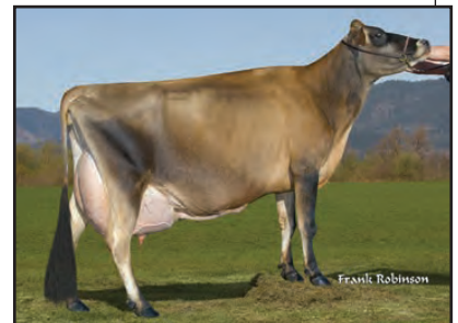
YOSEMITE LEMVIG BERRETTA BROOK Grandam of Lot 15