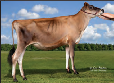
SHOWDOWN MISS AVERY Sister to Lot 41