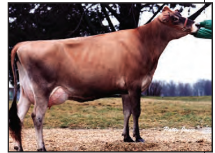
LLOLYN REN POLLYANN 3-ET Sixth Dam of Lot 64