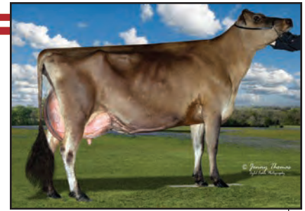
M-SIGNATURE COMERICA TIANA MARIE-ET Sister to Dam of Lot 40

8TH DAM: DAIRYLAND IMPERIAL BESS 15S VG 85 (CAN)