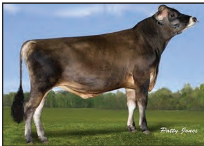
VERJATIN WESTSTAR-ET Brother to Dam of Lot 17