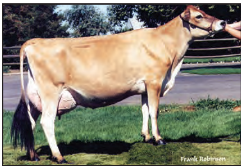
Sold in the 1998 All American Sale Topaz Montana Question, E-90% 2-3 279 3x 16,720 4.8% 800 3.5% 583 DHIA