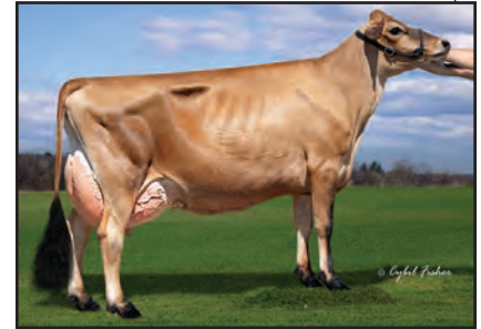
HILLVIEW LOUIE KATI-KI-P Sister to Lot 6

ALL LYNNS VINNIE-ET USA 117655133 GT50K BBR 100 JH1F JH2F 200JE207 CDCB GPTA 08/01/2016 128DAUS 72HRDS 69%RIP 91%R 870M 0.12% 66F 80%ILE 92%R 0.06% 43P 427CM$ 400NM$ 335FM$ 258GM$ 2.4PL -3.9DPR -3.8CCR -0.9HCR 3.05SCS AJCA 08/01/2016 74DAUS GPTAT 86%R 0.7 GJUI 3.2 GJPI 87%R 148