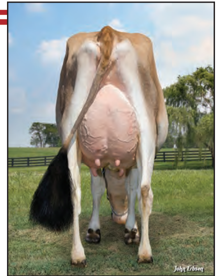
COVINGTON OLIVER MAID-P Sister to Lot 46