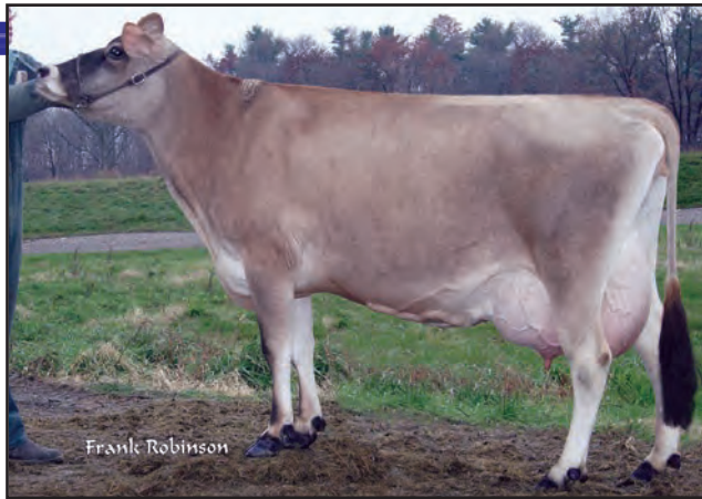
DUTCH HOLLOW KLASSIC DEVA-ET, VG-88% Fourth Dam of Lot 5