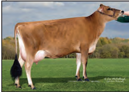
HEARTLAND JIMMIE TUCSON-ET Sister to Dam of Lot 55