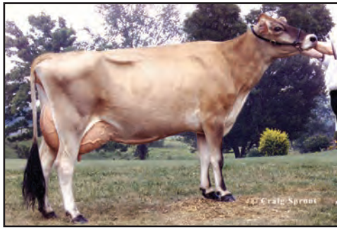
Sold in the 2002 All American Sale Nobledale Pitino Victoria, E-94% 3-4 305 21,030 4.3% 902 3.2% 671