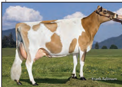
FAMILY HILL IATOLA CALICO-ET Sister to Dam of Lot 15