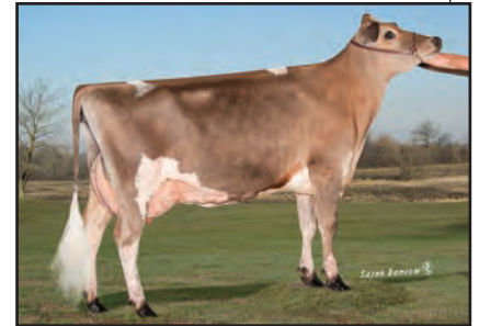
UHT CANAAN IATOLAS SUNLIGHT Dam of Lot 44