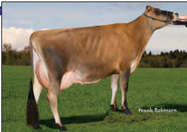
DP LOUIE MYALEAN 853, E-90% Grandam of Lot 21