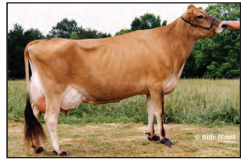
Sold in the 1995 All American Sale Amitys Barber Pine, E-94% 5-7 305 21,460 4.9% 1,060 3.5% 759