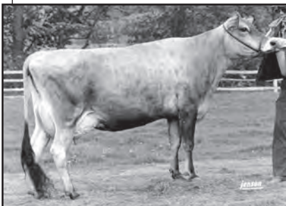
BILLINGS PRIME SUANN Fifth Dam of Lot 43