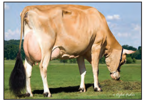
Sold in the 2010 All American Sale Billings RBR Style, VG-89% 2-8 305 17,970 5.1% 911 3.8% 686