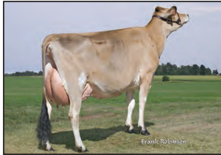
Sold in the 2006 All American Sale Sunset Canyon Sultan Anthem-ET, E-90% 4-7 305 3x 26,280 4.6% 1,221 3.5% 931