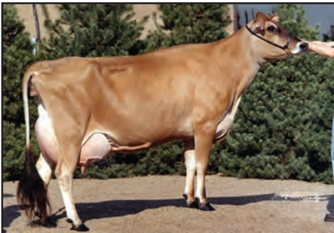
Sold in the 1999 All American Sale Headspring Berretta Push, E-92% 3-9 305 31,110 4.5% 1,403 3.7% 1,153 DHIR