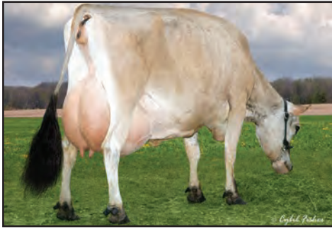
Sold in the 2004 All American Ahlem B John Princess 3183-ET, E-91% 6-9 305 3x 35,900 4.8% 1,728 3.2% 1,153