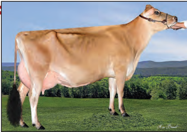
BONA ECLIPSES RISABELLE-ET, VG 86 (CAN) Sister to Dam of Lot 20