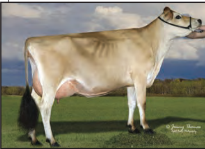
HEARTLAND IRWIN MYRA-ET Sister to Lot 41