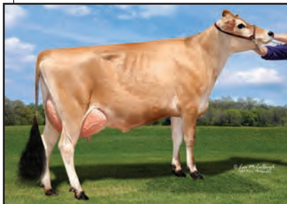
HEARTLAND IMPRESS TAMPA-ET Sister to Dam of Lot 55