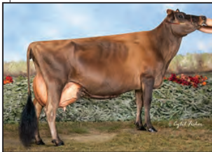
ELLIOTTS GOLDEN VISTA-ET Sister to Grandam of Lot 23