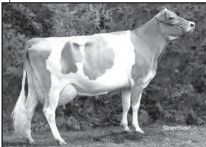
BELVIDERE SAINT HIBISCUS Fifth Dam of Lot 39