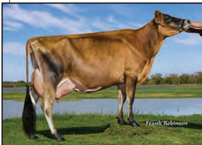
TJF/LEE TAYLOR LISA 1038-P Sister to Dam of Lot 37