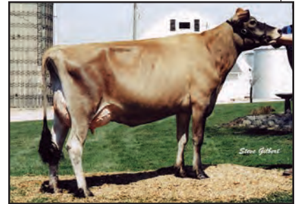
SMART NATE GUNNER EDEN Great-Grandam of Lot 10