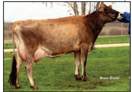
HEARTLAND MANNIX TYME Fourth Dam of Lot 55