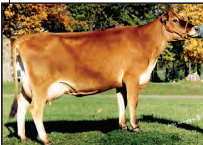
WF/L&M CHIEF BABE-ET Sixth Dam of Lot 51

BORN 09/25/2015 TATTOO / PB99 P7 FEMALE EFI 6.2% PA 420M 17F 18P 294CM$ 284NM$ 261FM$ 4.4PL 0.6DPR -0.3CCR 0.5HCR 2.97SCS PA TYPE 1.2 JPI 41%R 103 ST SR DF RA RW RL FA 0.4 0.2 0.5 L0.1 0.3 P0.6 S0.7 FU RH RUW UC UD TP TL 1.2 0.8 0.6 0.1 S1.0 C0.4 S0.2