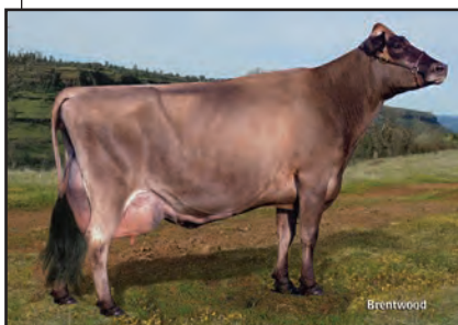
BW AVERY KATIE ET121-ET Sixth Dam of Lot 17