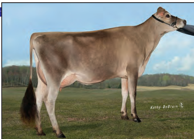
BRI-LIN JOEL JOLINE, VG-86% Selling as Lot 13