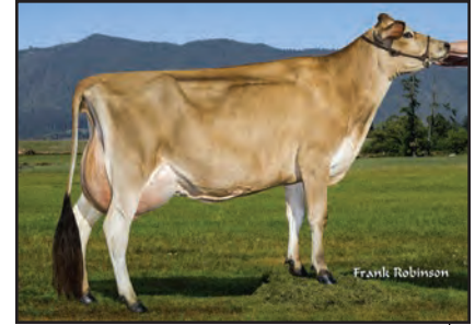
JARS OF CLAY PLUS BRIANNA II {6}-ET Sister to Lot B