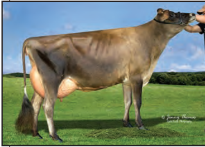
OAKFIELD MINISTER VENICE-ET Sister to Dam of Lot 23