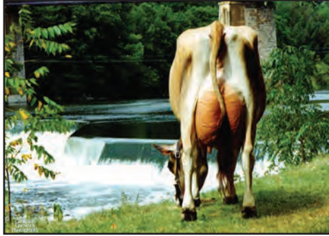
Sold in the 1993 All American Sale Hases Babes Lad Charo, EX 2 (CAN) 4-3 365 39,550 4.4% 1,726 3.6% 1,410 CAN