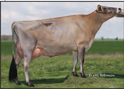
PARTEE AT BUDJON LIBERTY-ET Sister to Lot 9