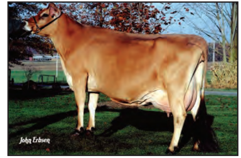
Sold in the 2005 All American Sale Vantage Lemvig Mamme, E-90% 4-4 305 3x 27,440 4.8% 1316 3.6% 996