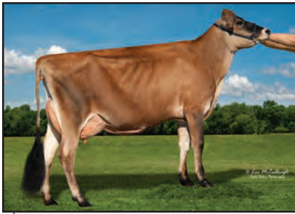
KEVETTA CELEBRITY VIVICA Sister to Lot 23