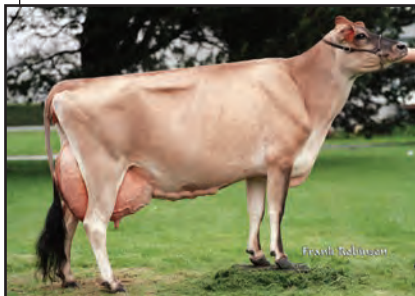
SUNSET CANYON MBSB ANTHEM-ET