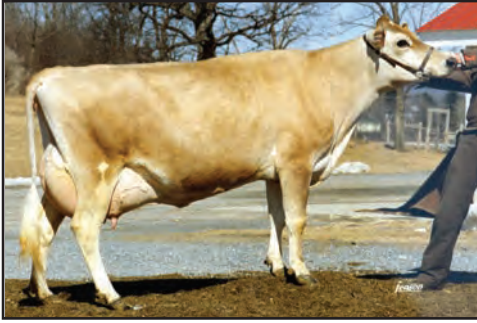
Sold in the 1987 All American Greenridge FW Chief Althea-ET, E-92% 10-4 305 21,240 4.1% 862 3.9% 832 DHIR 15 Sons in A.I.