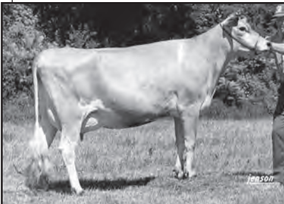
BILLINGS MILESTONE SUSAN Seventh Dam of Lot 43

CDCB GPTA 10/04/2016 ORECS 71%R 2%ILE -1168M -37F -33P -284CM$ -286NM$ -288FM$ -296GM$ -0.9PL -1.2DPR -1.6CCR -1.4HCR 3.07SCS AJCA 10/04/2016 GPTAT 69%R 0.6 GJUI 15.5 GJPI 66%R-119 ST SR DF RA RW RL FA 0.8 0.1 -0.6 H0.8 0.4 P0.7 S0.3 FU RH RUW UC UD TP TL 1.4 -0.2 -0.1 0.0 S2.5 C0.6 L0.6