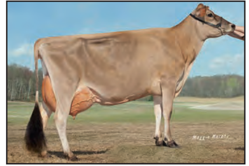
Sold in the 2011 All American Sale Hilmar Kilowatt 32102, E-90% 16,731—678—601 ME at 2-0