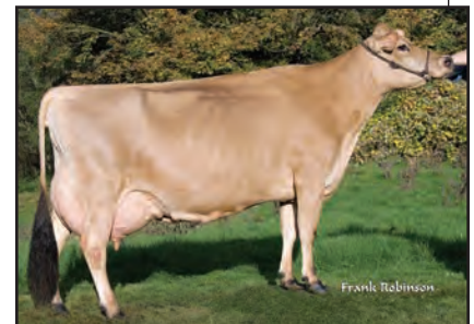
SUNSET CANYON LEMVIG MAID 4-ET Great-Grandam of Lot 46