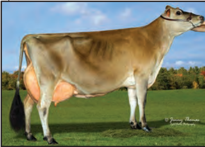
BILLINGS ACTION SASSY Sister to Dam of Lot 43

BILLINGS FARM & MUSEUM BREEDER & OWNER WOODSTOCK, VT 802-457-2355