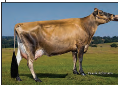
HEARTLAND IMPRESS ALLISON-ET Sister to Grandam of Lot 35