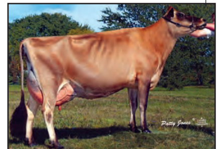
PREMONITION GRACE Great-Grandam of Lot 54