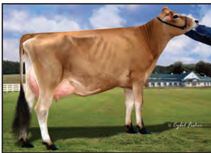
HEARTLAND SANTANA ARLENE-P-ET Sister to Dam of Lot 35