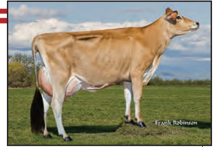
JARS OF CLAY PLUS BRIANNA I {6}-ET Sister to Lot B

* DENOTES COWS THAT RANK ON THE TOP 1-1/2% LIST FOR JPI