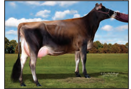
NORSE STAR TOPEKA DESIRE-ET Sister to Dam of Lot 48