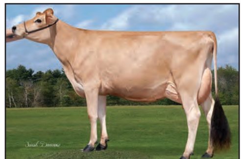
Sold in the 2014 All American Sale Orthridge-DB Prescott Radish, VG-86% Projected to 22,348—1,000—773 ME at 1-11