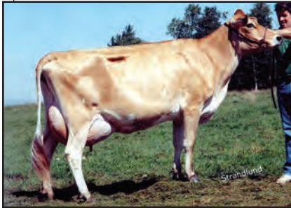
DUNCAN HIBRITE OF FAMILY HILL Fourth Dam of Lot 39