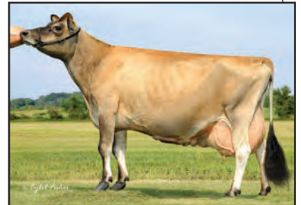
BILLINGS VIEW MORGAN Sister to Dam of Lot 8