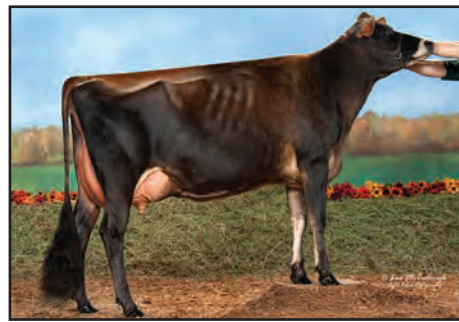
Sold in the 2013 All American Sale Ratliff Tequila Style-ET, E-90% Daughter selling as Lot 33 (2015)