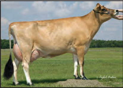
MI WIL DELUXE GORGEOUS Dam of Lot 31