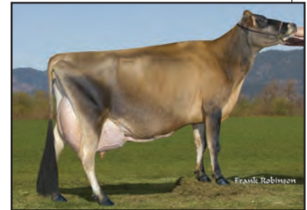
YOSEMITE LEMVIG BERRETTA BROOK Great-Grandam of Lot 28

HURONIA CENTURION VIRGINIA 24L EX 93-3E (CAN) JECAN000010214698 GI BBR 100 JH1F TATTOO UZA / 24L 2-11 305 2 19735 4.8 953 3.6 712 CAN 2462C 3-11 305 2 15448 4.9 752 3.6 551 CAN 1905C 5-06 305 2 22162 4.5 1008 3.4 759 CAN 2623C 6-11 305 2 20176 4.7 950 3.5 701 CAN 2423C CDCB GPTA 10/04/2016 ORECS 81%R 2%ILE -858M -33F -34P -268CM$ -248NM$ -200FM$ -192GM$ -0.5PL 1.1DPR 1.8CCR 0.9HCR 3.23SCS AJCA 10/04/2016 GPTAT 74%R 0.6 GJUI 16.4 GJPI 75%R-105