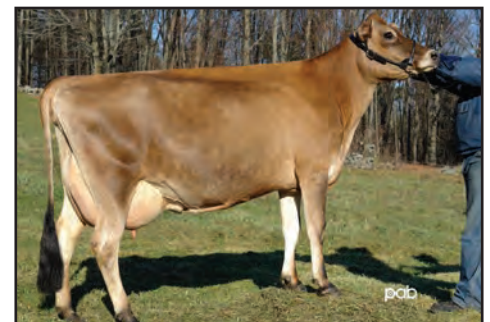
Sold in the 2008 All American Sale Pearlmont Impuls Daffy, E-90% 4-3 305 18,560 5.0% 932 3.8% 707