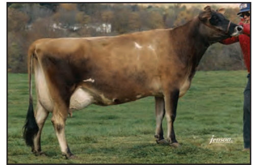
Sold in the 1994 All American Sale Billings Top Rosanne, E-96% 6-7 305 19,490 5.8% 1,138 4.1% 802 2-time National Grand Champion