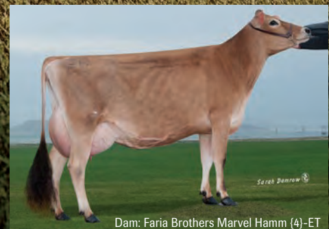
Dam: Faria Brothers Marvel Hamm (4)-ET

A complete package sire of sons from the GENESIS Cooperative Herd!