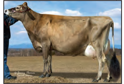
BILLINGS LASER MARGAUX Sister to Lot 8