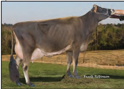
SEACORD FARM LOVABULL LISA-P Great-Grandam of Lot 37