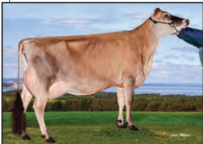
VERJATIN DECOY LISARINEA-ET Sister to Grandam of Lot 17