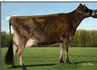
BRI-LIN MAESTRO JILL Grandam of Lot 13

BORN 12/13/2013 TATTOO RLJ / 31A BBR 100 DHIA HERD # 31-06-1141 CONTROL # 231 FEMALE EFI 6.4%