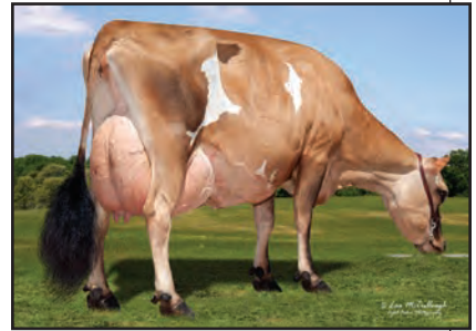
HEARTLAND NATHAN TEXAS-ET Grandam of Lot 55