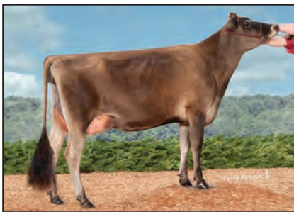
LAVON/DEBOER IATOLA COLBY Sister to Lot 15