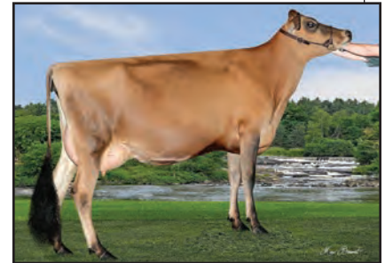
BONA FRONTRUNNER RICANE-ET Sister to Dam of Lot 20

TOLLENAARS IMPULS LEGAL 233-ET USA 067007718 GTHD BBR 100 JH1C JH2F 29JE3506 CDCB GPTA 08/01/2016 9776DAUS 1014HRDS 16%RIP 99%R 325M -0.05% 5F 33%ILE 99%R 0.03% 17P 249CM$ 237NM$ 207FM$ 225GM$ 3.6PL 0.5DPR 1.9CCR 3.6HCR 3.00SCS AJCA 08/01/2016 4467DAUS GPTAT 99%R 1.0 GJUI 21.5 GJPI 99%R 104