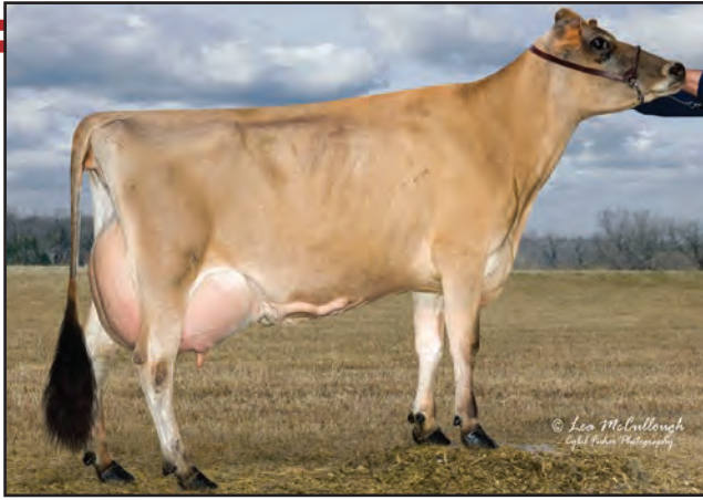
SAR PARAMOUNT SHIVER, E-90% Grandam to Lot 14