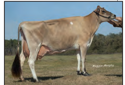
OOMSDALE LOUIE GARYN GINA {4}-ET Sister to Grandam of Lot 36