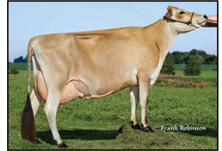
SUNSET CANYON DOMINICANS I MAID-ET Sister to Dam of Lot A