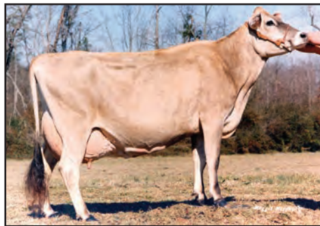
Sold in the 1996 All American Sale Piedmont Lester Betsy, E-92% 4-2 365 24,670 4.7% 1,170 4.0% 983