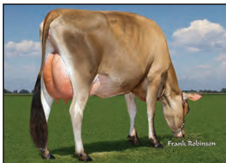
Sold in the 2009 All American Sale BW Renegade Katie ET749-ET, E-90% 3-5 305 3x 25,740 5.6% 1,447 3.8% 966