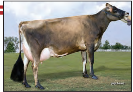
HEARTLAND IMPRESS TULIP-ET Sister to Dam of Lot 55

4TH DAM: HEARTLAND MANNIX TYME 92% 7-05 305 3 24820 4.5 1112 3.6 896 92DCR 3021C