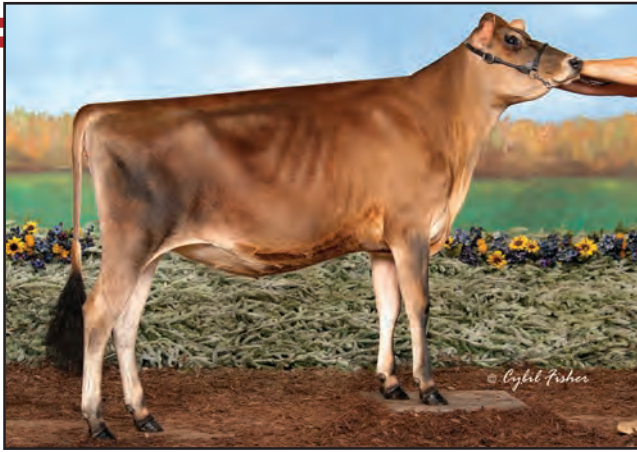
M-SIGNATURE PREMIER EPISODE-ET Selling as Lot 10