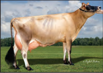
SCHULTE BROS VIN GRACIE-ET Sister to Lot 31