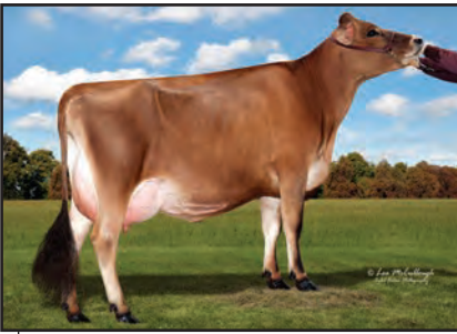
HEARTLAND TOPEKA MIA Sister to Lot 41

4TH DAM: HILL TOP SAMBO MONICA 91% 3-10 305 2 14160 4.6 649 3.5 489 95DCR 1690C