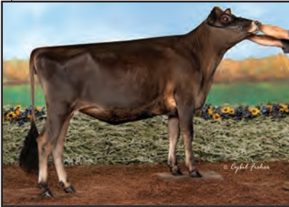
PARTEE-HPDH LUSTRE-ET Sister to Lot 9