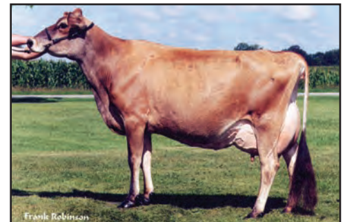
Sold in the 1997 All American Jada Boomer Sooner Dawn, Ex 92 (CAN) 4-5 305 19,720 3.9% 760 3.9% 769 CAN