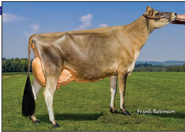
UNDERGROUND HOLLYS HOPE, E-91% Sister to Lot 27