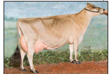
UHT CANAAN LEGION SUNSHINE {6} Great-Grandam of Lot 44