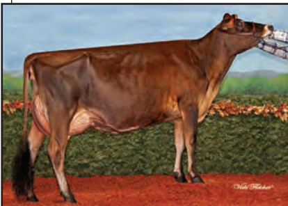
BUDJON MINISTER LIGHTEN UP-ET Sister to Lot 9