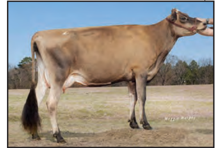
OOMSDALE LOUIE GARYN GEANNA {4}-ET Sister to Grandam of Lot 36