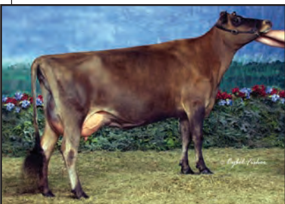
HOMERIDGE F P LISA 2 Dam of Lot 9