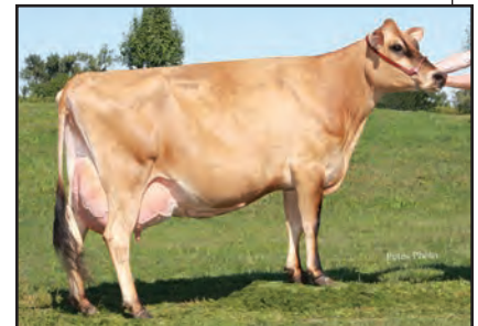
SUNSET CANYON CENTURION L MAID 2-ET Grandam of Lot 46