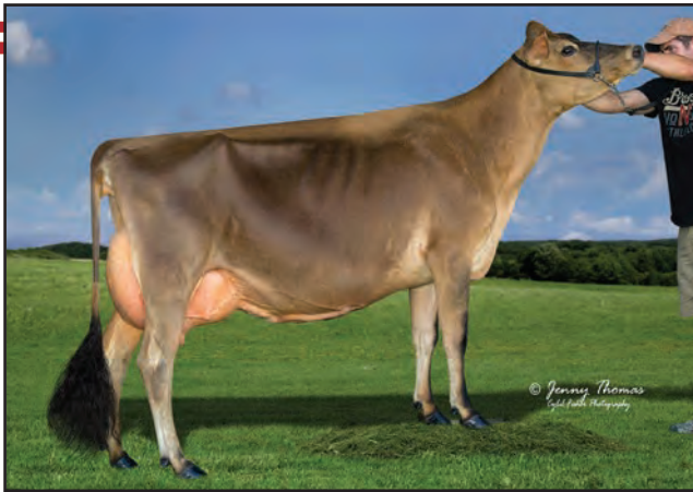
UNDERGROUND HAZELS HOLLY, E-93% Great-Grandam of Lot 26