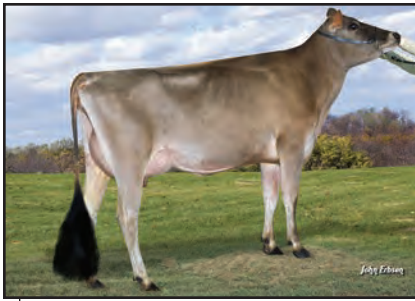
HEARTLAND FASTRACK TEMPE-ET Dam of Lot 55