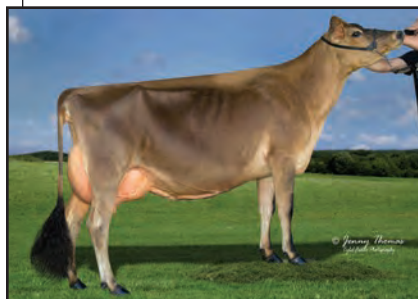
UNDERGROUND HAZELS HOLLY Great-Grandam of Lot 25