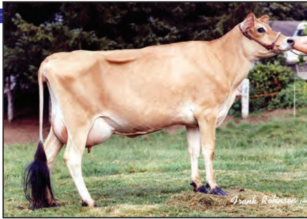
FAMILY HILL BOOMER BRITE HILITE, E-90% Great-Grandam of Lot 39