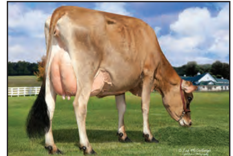
Sold in the 2010 All American Sale Hi-Kel TBone Pfenning-ET, E-90% 3-7 305 3x 21,200 4.8% 1,015 3.7% 781