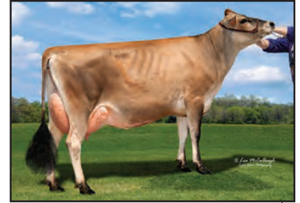
HEARTLAND ECLIPSE NIKE Dam of Lot 50