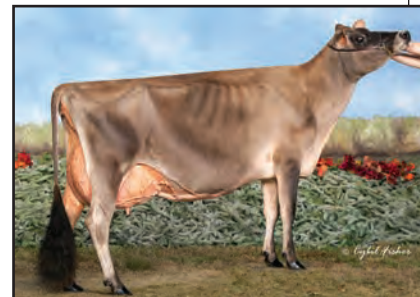
ARETHUSA VERONICAS COMET-ET Sister to Grandam of Lot 24