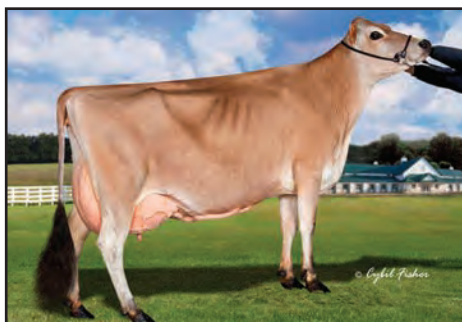
Sold in the 2010 All American Sale Sunset Canyon Headline Daffy 3-ET, E-90% 4-6 305 3x 24,060 4.4% 1,048 3.3% 795