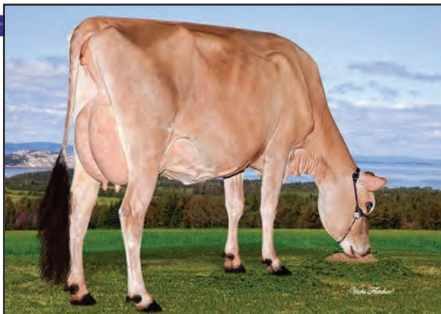
VERJATIN PLUS LISARINNE {6}-ET, VG 86 (CAN) Grandam of Lot 17