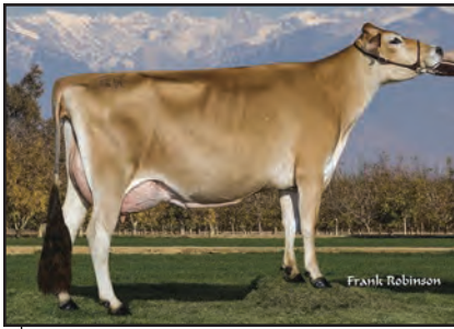
KASH IN DIMENSION 39452-P-ET Dam of Lot 1