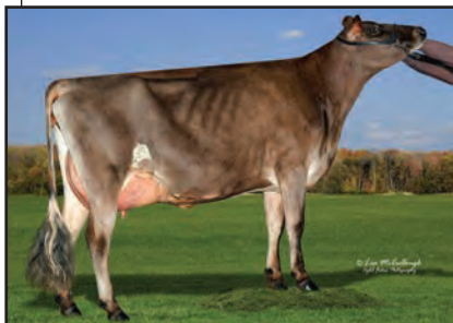
HEARTLAND SANTIAGO AINSLEY-ET Sister to Grandam of Lot 35