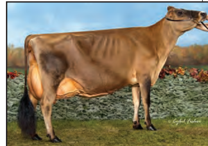
ARETHUSA RESPONSE VIVID-ET Grandam of Lot 24