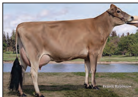
Sold in the 2002 All American Sale Jo-Gep Hallmark Party Time, E-90% 5-1 305 19,980 3.9% 772 3.4% 673