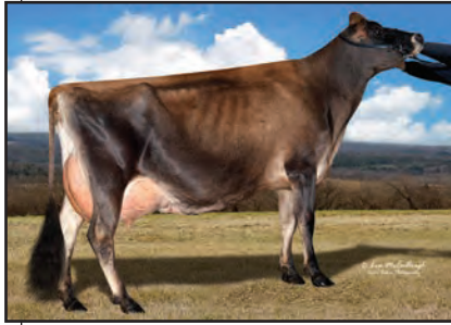
OAKFIELD TBONE VIVIANNE-ET Dam of Lot 23