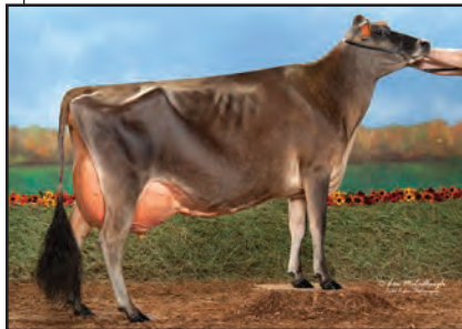
RATLIFF ACTION ANGEL Sister to Dam of Lot 7