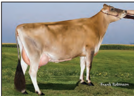
Sold in the 2010 All American Sale Oomsdale Casey Celebrity Cheyann{3}-ET, VG-87% 3-5 305 22,600 5.3% 1,190 3.5% 802