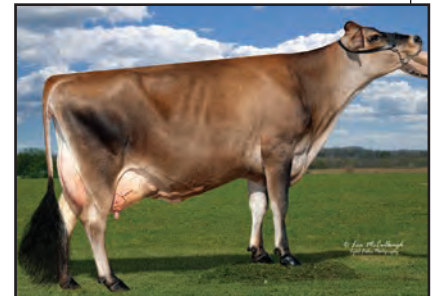
HEARTLAND CLARK NESSA {4} Sister to Dam of Lot 50