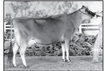
NORVAL ACRES JODYS DELCY 4U Sixth Dam of Lot 48