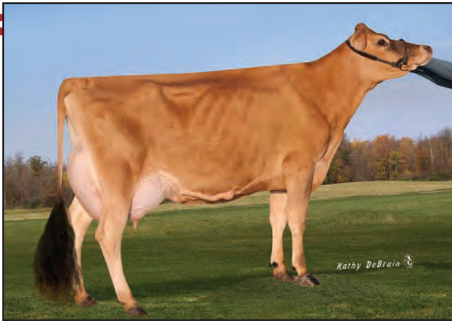
HEI-BRI IATOLA NEVAEH, VG-88% Dam of Lot 38