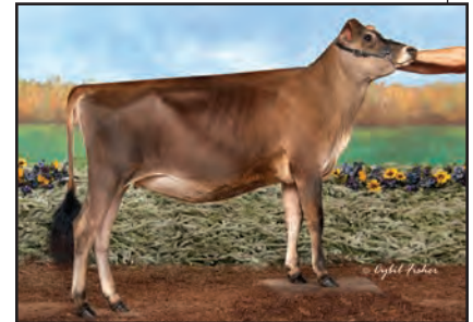
M-SIGNATURE TINA MARIES XXI-ET Sister to Dam of Lot 40