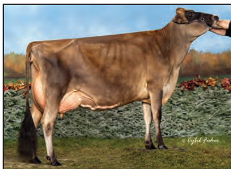
Sold in the 2013 All American Sale Forever Little T of TJ Classic, E-90% 16,521—696—544 ME at 3-2