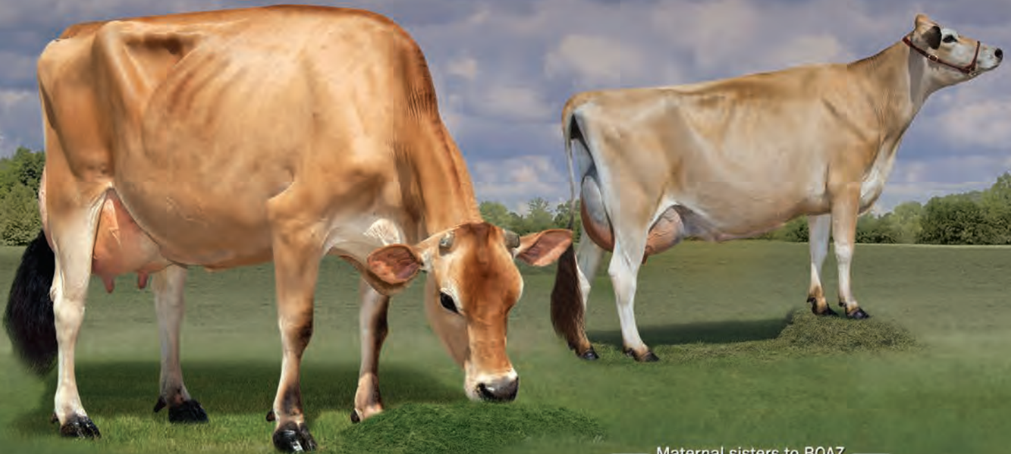
Maternal sisters to BOAZ

Dam: Jars of Clay Valentino Bridget, E-91%