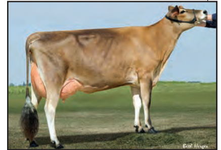
BLUE MOUNTAIN TEQUILA DAPHNE-ET Grandam of Lot 48