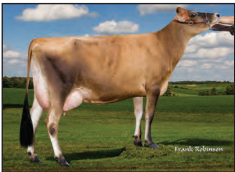
Sold in the 2013 All American Sale Ky-Hi Topeka Hopefull-P-ET, E-90% 2-0 300 3x 19,720 5.2% 1,027 3.8% 747