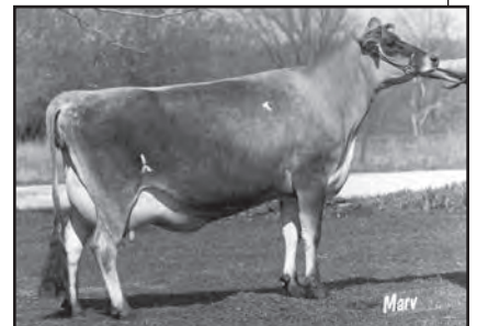
BV MIGHTY MASTER MARNI {6}-P Great-Grandam of Lot 8