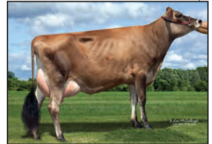
HEARTLAND RUBEX NAOMI-ET Sister to Dam of Lot 50