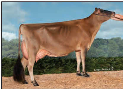
RIVER VALLEY MINSTER ANTHEM II-ET