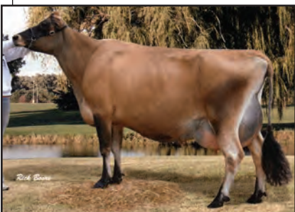
TAURUS MANDY Fourth Dam of Lot 53