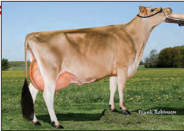
HEINZ LOTTO LINETTE 7132 {4}, VG-88% Grandam of Lot 34