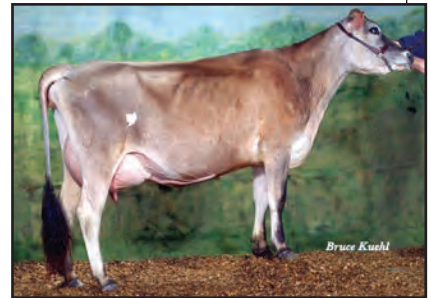
HEARTLAND MOR TULSA Great-Grandam of Lot 55