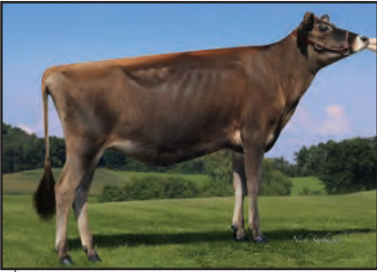
PARTEE-HPDH VELO LAFFY TAFFY-ET Selling as Lot 9

SISTER(S): HOMERIDGE FUROR LISA EX 90 (CAN) 5-02 305 2 13852 5.1 712 4.1 562 CAN 1921C 1 STAR BROOD COW, NOVEMBER 2012