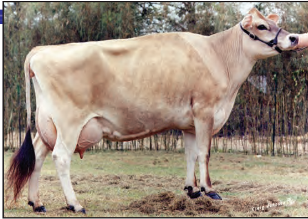
LESTER TOP, VG-87% Ninth Dam of Lot 33