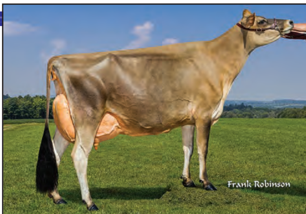
UNDERGROUND HOLLYS HOPE, E-91% Grandam of Lot 25