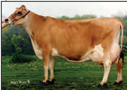
DUTCH HOLLOW BRASS DINAH Seventh Dam of Lot 5