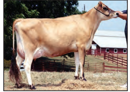
Sold in the 2001 All American Sale Williams Impressive Idea-ET, E-90% 3-5 305 20,096 4.7% 950 3.6% 715 Dam of SC Gold Dust Paramount latola-ET