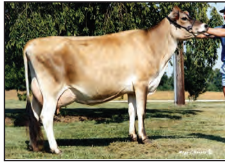
Sold in the 1992 All American Sale Sweet Grass 2875 Gurit-ET, E-90% 1-11 305 17,390 4.4% 956 3.6% 620