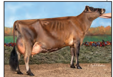
BLUE MOUNTAIN TEQUILA TINA MARIE Grandam of Lot 40