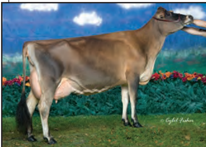
BJ JADE MIRACLE-ET Great-Grandam of Lot 53