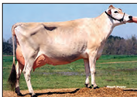
Sold in the 2002 All American Sale Jemi Madam Pitino, E-94% 4-5 305 19,590 5.4% 1,051 3.8% 747