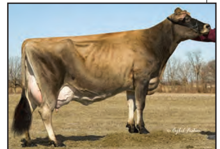
OOMSDALE GRATITUDE COUNTRY CASEY {2}-ET Fourth Dam of Lot 36