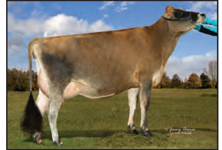
SANFORDDALE GOVERNOR ELAINE Dam of Lot 10