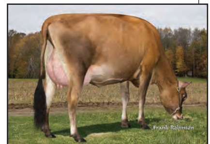
BONA LEGACY RICKY-ET Grandam of Lot 20

4TH DAM: IRCHEL REV RITA GP 83 (CAN) 10-00 305 2 17684 4.5 787 4.9 858 CAN 2465C