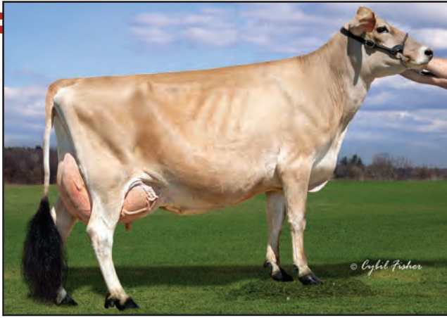
DUTCH HOLLOW DIMENSION MONIKA, VG-86% Dam of Lot 2