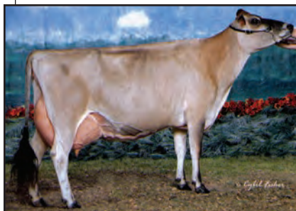
ROZEVIEV DORIE D RACHEL Fourth Dam of Lot 7

BORN 03/01/2016 PO FEMALE EFI 5.0% AMERICAN ID 1279 / 1279