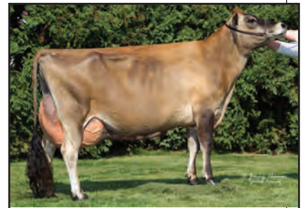
BILLINGS LEGION MINI ME Dam of Lot 8