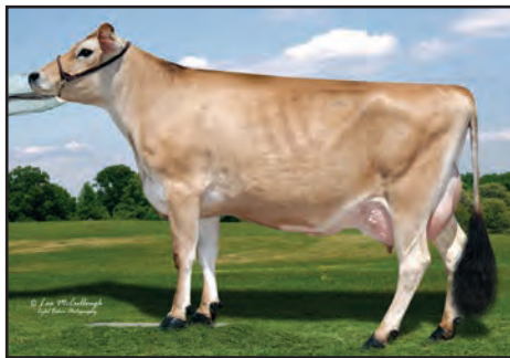
Sold in the 2011 All American Sale Norse Star Renegade Marley-ET, VG-83% 3-02 305 3x 20,330 6.7% 1,363 3.9% 786