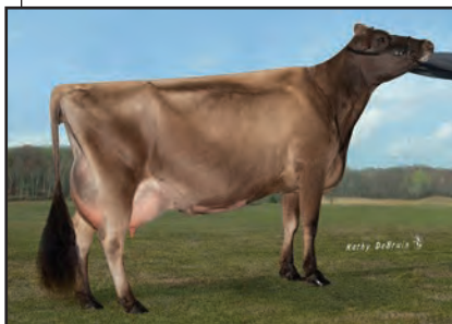
FAMILY HILL AMADEO COLBY Dam of Lot 15