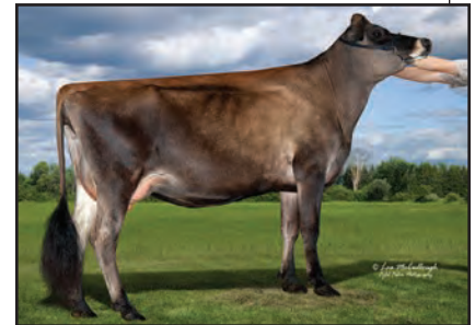
M-SIGNATURE TINA MARIES MERLOT-ET Sister to Dam of Lot 40