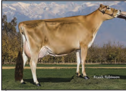
KASH IN DIMENSION 39428-P-ET Sister to Dam of Lot 1