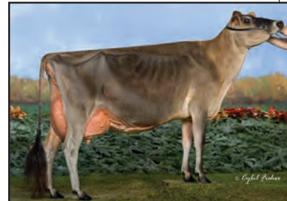
ARETHUSA VERONICAS DASHER-ET Sister to Grandam of Lot 24