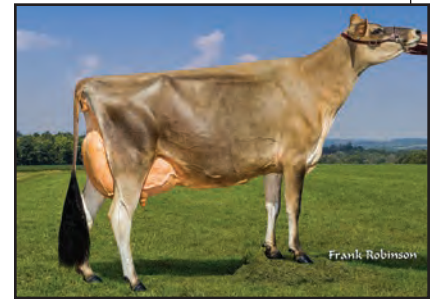
UNDERGROUND HOLLYS HOPE Grandam of Lot 26

NEXT DAM: UNDERGROUND HAZELS HOLLY 93% 3-05 305 2 17680 6.7 1191 3.6 637 94DCR 2202C 3RD 5-YEAR-OLD, 2015 NEW YORK SPRING CAROUSEL 2ND 4-YEAR-OLD, 2014 ROYAL WINTER FAIR 2ND 4-YEAR-OLD, 2014 INTERNATIONAL JR SHOW 1ST 4-YEAR-OLD, 2014 NY STATE FAIR JR SHOW RESERVE GRAND, 2014 NY STATE FAIR JR SHOW RESERVE SR CHAMPION, 2014 NY STATE FAIR JR SHOW 3RD SR 3-YEAR-OLD, 2013 INTERNATIONAL JERSEY SHOW INTERMEDIATE CHAMPION, 2013 NY STATE FAR RESERVE GRAND CHAMPION, 2013 NY STATE FAIR JR SHOW 1ST SR 3-YEAR-OLDS, 2013 NY STATE FAIR JR SHOW SIRE: SENN-SATIONAL PARAMOUNT ACE GJPI 14 15%ILE