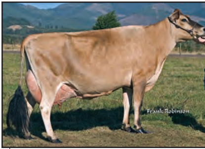
SUNSET CANYON AMERICAN ANTHEM-ET