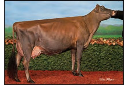
M-SIGNATURE VERBATIM TIA MARIE Sister to Dam of Lot 40