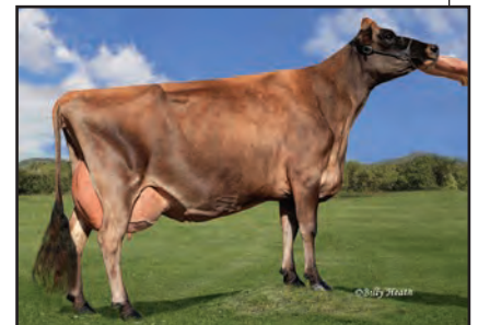
SHEER GRACE Grandam of Lot 54