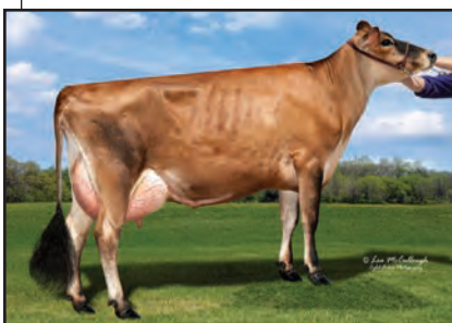
HEARTLAND IMPRESS TOPANGA-ET Sister to Dam of Lot 55