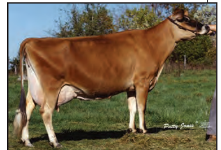
NORVAL ACRES KINGS DELCY 4N Seventh Dam of Lot 48