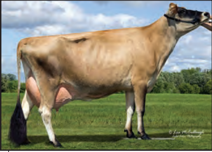
SCHULTE BROS VIN GLAMOUR GIRL Sister to Lot 31