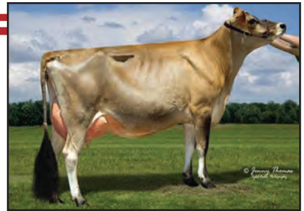
TJ CLASSIC ACTION VENUS Selling as Lot 12

5TH DAM: COTTONWOOD NOBLE VIVO 92% 7-08 293 2 18500 4.6 856 4.2 732 DHIR 2326C