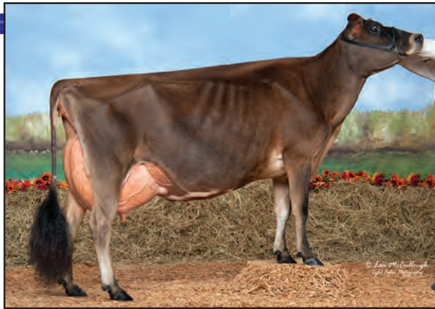
NORSE STAR TEQUILA KATIE {4}, E-94% Grandam to Lot 11