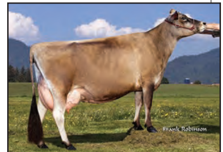
SUNSET CANYON IMPULS L MAID 4-ET Sister to Grandam of Lot 46