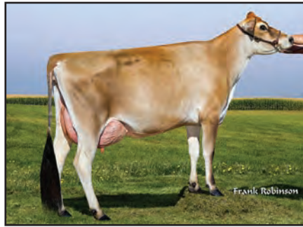
Sold in the 2015 All American Sale Family Hill Connection Can Do-ET, E-92% 4-9 302 14,640 4.4% 647 3.8% 560