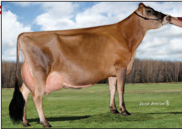
UHT CANAAN MORGAN BROOKE, E-94% Grandam of Lot 28