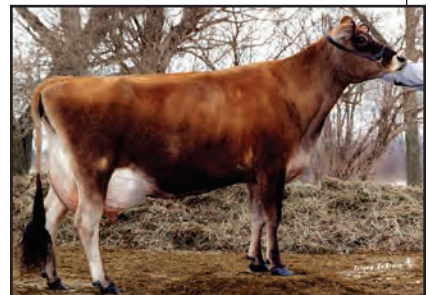
PIEDMONT RENAISSANCE VIVIAN-ET Grandam of Lot 12