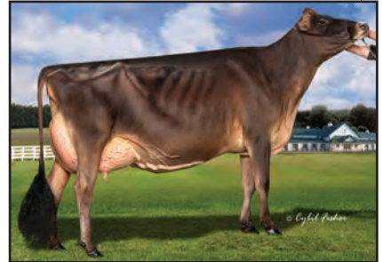
TJ CLASSIC MINISTER VENUS-ET Sister to Lot 12