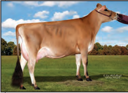
HEARTLAND TOPEKA MADALYN-ET Sister to Lot 41