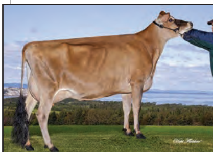
VERJATIN LEGAL LISA MARIA-ET Great-Grandam of Lot 17