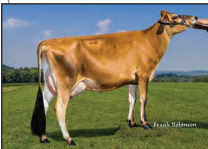
KY-HI TOPEKA FAITHFULL-ET Sister to Lot 49