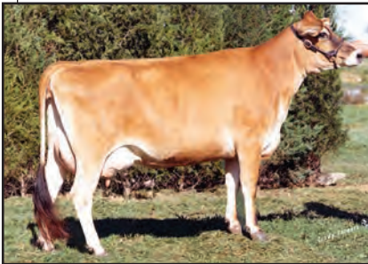
QUICKSILVERS BABE Seventh Dam of Lot 51