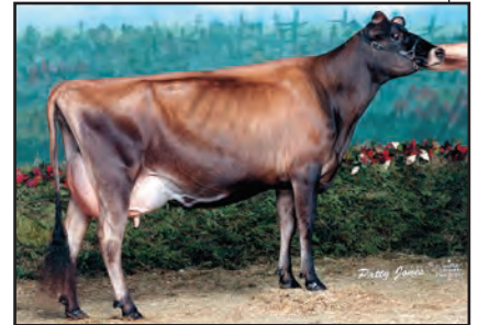
JASPAR RENAISSANCES EVENING, EX 91-3E (CAN) Sister to Fourth Dam of Lot 10