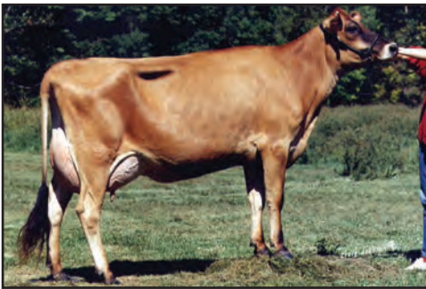
Sold in the 1990 All American Duncan Nanni, E-92% 6-4 305 25,310 4.5% 1,148 3.5% 882 DHIR 4th Sr. 2-yr.-old cow, 1990 All American