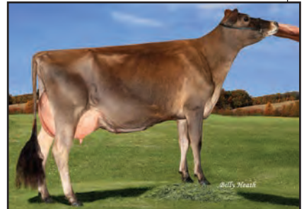
TJ CLASSIC VERBATIM VICTORIA-ET Sister to Lot 12