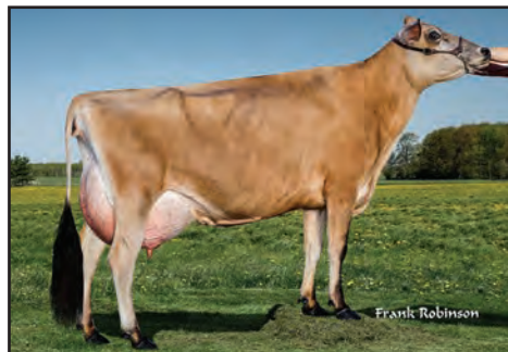
Sold in the 2013 All American Sale Springdale Action Tilli, E-91% Projected to 20,391—865—727 ME at 3-10