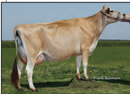
JARS OF CLAY VENERABLE 1771 2620-P Grandam of Lot 1