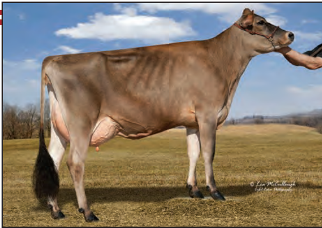
LYON TBONE APPLE, E-93% Dam of Lot 16