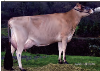
BW BOMBER LIZZIE ET299-ET Fifth Dam of Lot 17