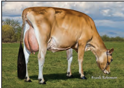
KASH-IN PLUS 41433 {6}-P-ET Sister to Dam of Lot 1