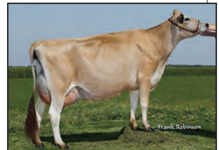
JARS OF CLAY VENERABLE 1771 2620-P Grandam of Lot B

ALL LYNNS LEGAL VISIONARY-ET USA 117222740 GT50K BBR 100 JH1C JH2F 29JE3761 CDCB GPTA 08/01/2016 2315DAUS 341HRDS 27%RIP 99%R 859M -0.02% 37F 86%ILE 99%R 0.06% 43P 481CM$ 448NM$ 369FM$ 350GM$ 4.5PL -2.3DPR 0.9CCR 3.8HCR 2.88SCS AJCA 08/01/2016 1079DAUS GPTAT 99%R 0.9 GJUI 14.8 GJPI 97%R 187