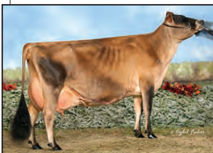
HURONIA CENTURION VERONICA 20J Great-Grandam of Lot 23