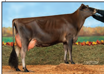
RATLIFF TEQUILA AVELANCHE-ET Sister to Dam of Lot 7