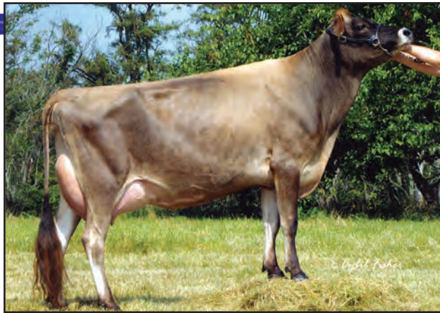
WELDY SAMBO BOBBIE, E-92% Great-Grandam of Lot 51