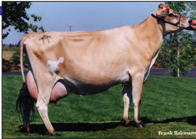
AHLEM GLENWOOD SHOWGIRL 5085 {5}-ET, E-90% Sixth Dam of Lot 3