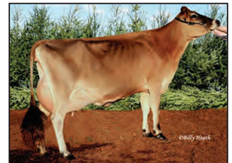
Sold in the 2004 All American Sale Rocha Charismatic Rubal, E-93% 6-2 305 21,840 5.0% 1,097 3.4% 735