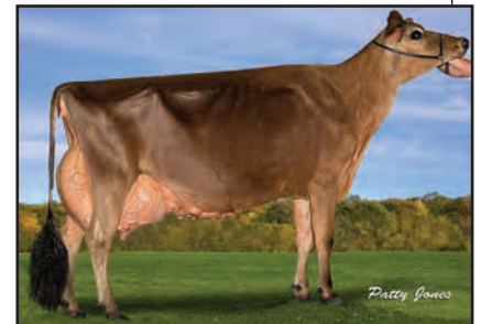
BRIDON IATOLA POLISH-ET Sister to Grandam of Lot 54