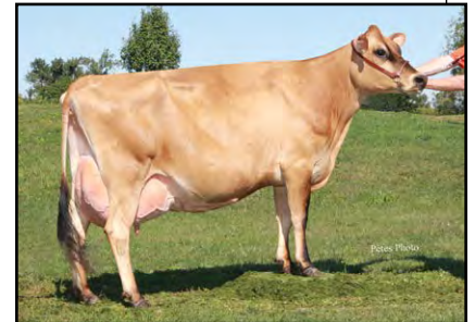
SUNSET CANYON CENTURION L MAID 2-ET Sister to Grandam of Lot A