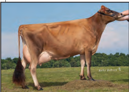
HAVS LOVABULL WATCHFULL-P Dam of Lot 49

CDCB GPTA 10/04/2016 ORECS 71%R 71%ILE 684M 17F 24P 191CM$ 180NM$ 155FM$ 122GM$ 1.1PL -1.3DPR -2.0CCR -1.8HCR 2.87SCS AJCA 10/04/2016 GPTAT 72%R 0.3 GJUI 6.4 GJPI 68%R 83 ST SR DF RA RW RL FA 1.0 0.3 -0.1 L0.5 0.2 P0.1 S0.1 FU RH RUW UC UD TP TL 0.9 0.1 0.1 -0.5 S1.1 C0.2 L0.1