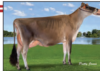
ARETHUSA HG VICTORIA-ET Sister to Dam of Lot 24

SISTER(S): ELLIOTT'S GOLDEN VISTA-ET 95% 3-04 365 2 22399 6.7 1502 4.2 939 DHIA 3254C MEMBER 1ST PRODUCE OF DAM, 2009 WORLD DAIRY EXPO MEMBER ALL-AMERICAN PRODUCE, 2009 ALLBREED ACCESS ELLIOTT'S GOLDEN VANESSA-ET 93% 7-04 305 2 12110 4.7 574 3.3 401 101DCR 1384C GRAND CHAMPION, 2006 MID-ATLANTIC REGIONAL ARETHUSA PRIMETIME DEJA VU-ET 95% 5-00 305 2 20000 5.0 996 3.8 763 96DCR 2640C ARETHUSA VERONICAS DASHER-ET 95% 7-04 305 3 27720 5.9 1643 3.6 1007 90DCR 3482C ABA RESERVE ALL-AMERICAN SR 2-YEAR-OLD, 2008 ARETHUSA VERONICAS PRANCER-ET 93% 6-09 305 2 21220 5.4 1143 3.9 829 97DCR 2869C RESERVE JR CHAMPION, 2007 CENTRAL NATIONAL ARETHUSA VERONICAS COMET-ET 95% 4-06 305 2 19970 6.5 1292 3.6 710 96DCR 2454C SR & GRAND CHAMPION, 2010 RAWF RES. SR & RES. GRAND CHAMPION, 2009 ROYAL WINTER FAIR ABA RESERVE ALL-AMERICAN AGED COW, 2011 NASCO TYPE AND PRODUCTION WINNER, 2011 CENTRAL NATIONAL ARETHUSA VERONICAS CUPID-ET 94% 5-06 305 2 18310 4.6 837 3.6 663 95DCR 2258C NOMINATED ABA ALL AMERICAN AGED COW, 2012 ARETHUSA RESURRECTION VERSACE-ET 93% 7-09 305 2 22150 5.4 1190 4.0 877 96DCR 3036C RESERVE JR CHAMPION, 2007 MID-ATLANTIC REGIONAL ARETHUSA ON TIME VOGUE-ET EX 94 (CAN) 2-00 305 2 26264 3.0 778 2.0 529 CAN 1809C WINNER, 2013 INTERNATIONAL JERSEY FUTURITY INTERMEDIATE CHAMPION, 2013 ROYAL WINTER FAIR ALL CANADIAN JR 3-YEAR-OLD, 2013 ALL CANADIAN JR 2-YEAR-OLD, 2012