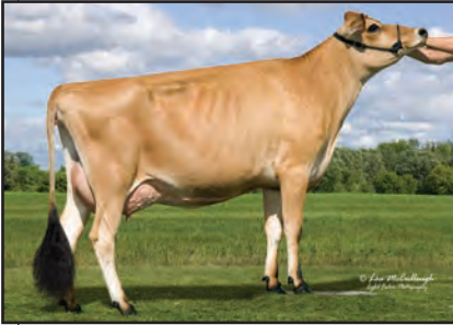
SCHULTE BROS VIN GABBY-ET Sister to Lot 31