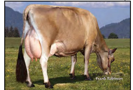
SUNSET CANYON IMPULS L MAID 4-ET Grandam of Lot A