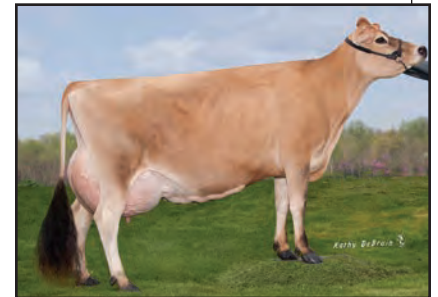
HEI-BRI JACINTO NANA Grandam of Lot 38

SCHULTZ VOLCANO HARRIS {4} USA 118157731 GT80K BBR 100 JH1F JH2F 29JE3866 CDCB GPTA 08/01/2016 100DAUS 10HRDS 96%RIP 91%R 1590M -0.05% 66F 100%ILE 92%R 0.01% 58P 631CM$ 610NM$ 558FM$ 499GM$ 5.3PL -1.6DPR -0.6CCR 0.7HCR 2.85SCS AJCA 08/01/2016 3DAUS GPTAT 74%R 1.2 GJUI 11.2 GJPI 85%R 246