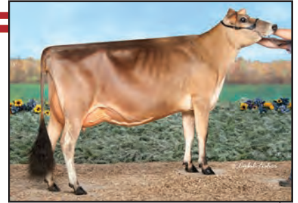
M-SIGNATURE NEVADA EPIC, VG-88% Sister to Lot 10

6TH DAM: ELMLINE TITLES ELIZA 14R EX (CAN)