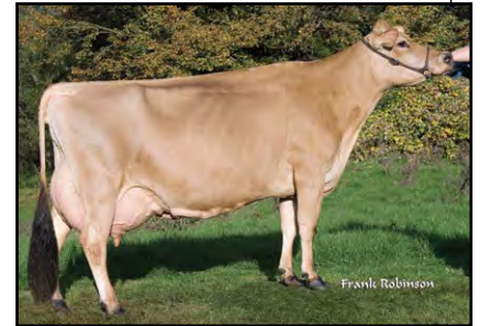
SUNSET CANYON LEMVIG MAID 4-ET Great-Grandam of Lot A