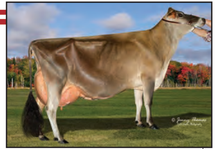
BILLINGS FUROR MEG Sister to Lot 8

5TH DAM: GENS MARJIE-P 90% 7-05 305 2 16850 5.5 933 4.1 694 DHIR 2260C