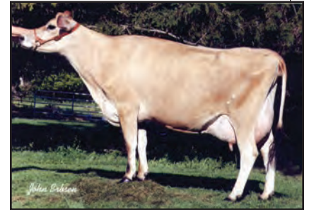
CKB GLASS SHERI SONIA Fourth Dam of Lot 14

NEXT DAM: CKB AMERICAN SONIA SILVER 86% 5-05 305 2 18440 4.1 760 3.5 641 100DCR 2104C SIRE: AL-TOP ALL AMERICAN GJPI -86 3%ILE