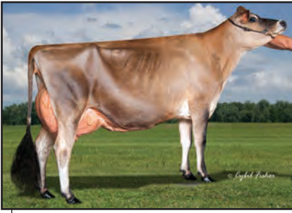
SCHULTE BROS TEQUILA SHOT-ET Sister to Lot 31

PPA -4271M 3F -85P / YD -4028M -8F -82P CDCB PTA 08/01/2016 2RECS 65%R 3%ILE -1748M -16F -38P -221CM$ -238NM$ -281FM$ -182GM$ -0.8PL 1.2DPR 1.2CCR 1.5HCR 3.26SCS AJCA 12/01/2013 PTAT 40%R 0.4 JUI 12.3 JPI 50%R-110 RESERVE GRAND & RESERVE SR CHAMPION, 2008 IA STATE FAIR JR SHOW 1ST 4-YEAR-OLD, 2008 IA STATE FAIR JR SHOW 2ND CFP PRODUCTION AWARD, 2008 IA STATE FAIR 2ND MILK PRODUCTION AWARD, 2008 IA STATE FAIR 3RD 4-YEAR-OLD, 2008 IA STATE FAIR