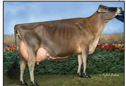
STEPHAN SPARKLER VERA-ET Dam of Lot 12