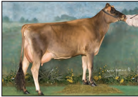
Sold in the 2007 All American Sale SSF Belmont TGIF, E-93% 6-2 305 19,040 4.8% 915 3.3% 634