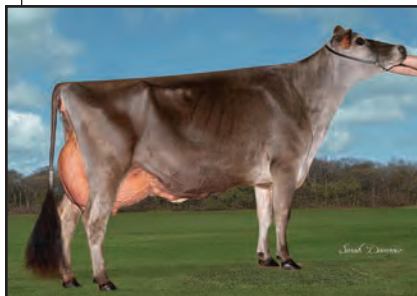
RATLIFF IMPRESSION ANNABELLA-ET Sister to Dam of Lot 7