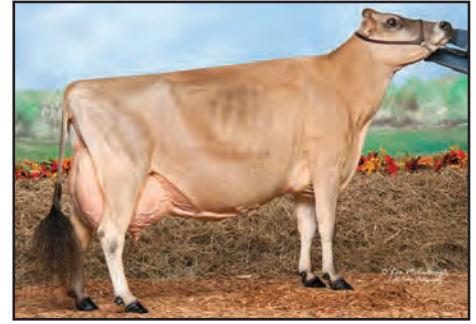
Sold in the 2006 All American Sale Sambo Fabulous-ET, E-93% 5-5 305 19,420 4.4% 862 3.5% 674