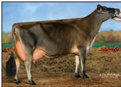
RATLIFF PRICE ALICIA Grandam of Lot 7