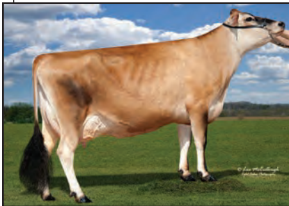
HEARTLAND IRWIN TASHA-ET Sister to Dam of Lot 55