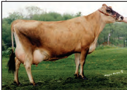
DUTCH HOLLOW BARBER DANA Sixth Dam of Lot 5