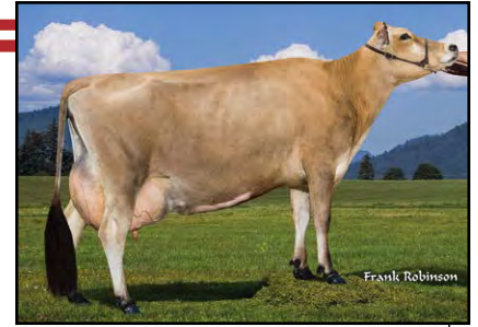
SUNSET CANYON DOMINICAN IMP MAID-ET Dam of Lot A

4TH DAM: TENN HAUG E MAID 93% 6-00 365 2 26014 7.0 1820 4.3 1107 DHIR 3605C 4TH PLACE, 2015 JERSEY JOURNAL GREAT COW CONTEST