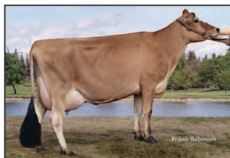
Sold in the 2005 All American Sale D&E Abe Cindy, VG-87% 3-7 305 19,510 4.6% 897 3.6% 706