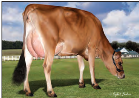
Sold in the 2014 All American Sale Ahlem Volcano Buttons 42731, VG-88% 1-9 305 3x 16,930 5.8% 980 4.0% 673