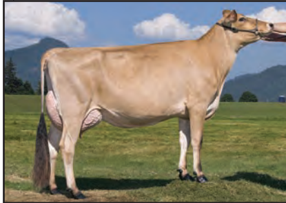
SUNSET CANYON SULTANS ANTHEM-ET