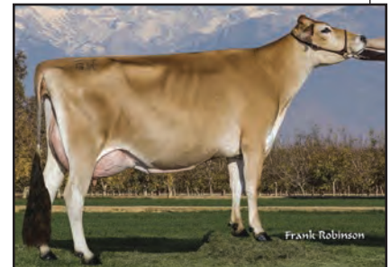
KASH IN DIMENSION 39452-P-ET Sister to Dam of Lot B