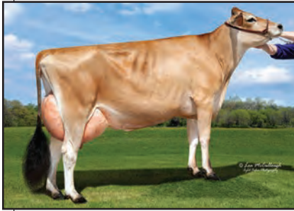
JARS OF CLAY VALENTINO BRIDGET Sister to Dam of Lot 1