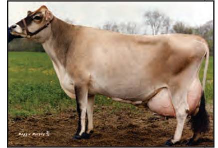
DUTCH HOLLOW S JOE MISTRESS-P Seventh Dam of Lot 2

4TH DAM: DUTCH HOLLOW LEGION MONOPOLY 86% 3-10 305 3 19940 5.3 1056 3.5 690 102DCR 2384C