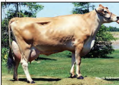
SUNSET CANYON BROOK AMITY-ET