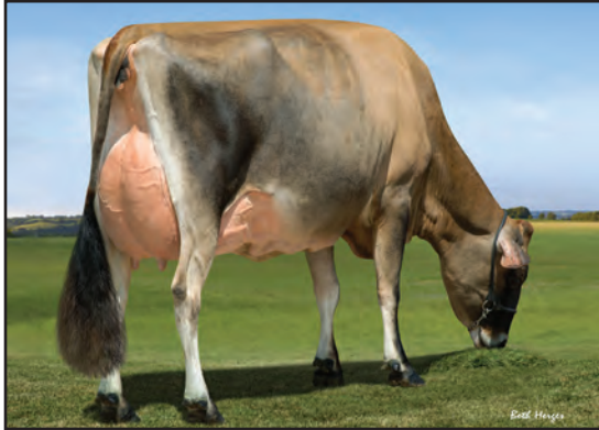
ELLIOTTS EXCITING CHAMBORD-ET, E-90% GRANDAM OF LOT 6