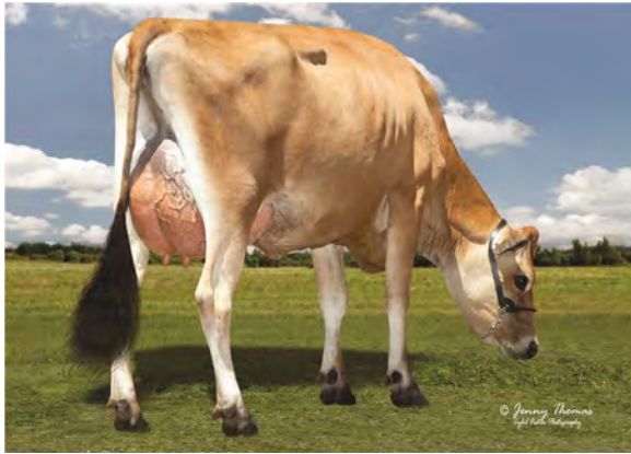
AVI-LANCHE VICEROY BABE 26381, D-79% FROM THE SAME FAMILY AS LOT 3