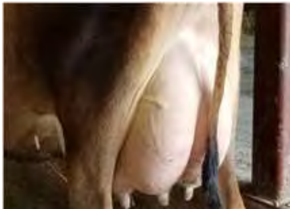
KB TORPEDO 17013 72 LBS MILK AT 14 DIM UDDER OF THE DAM OF LOT 1