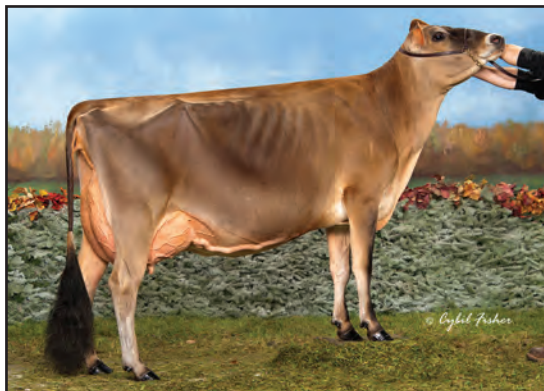
ELLIOTTS COSMO ACTION-ET, E-93% SISTER TO THE GRANDAM OF LOT 6