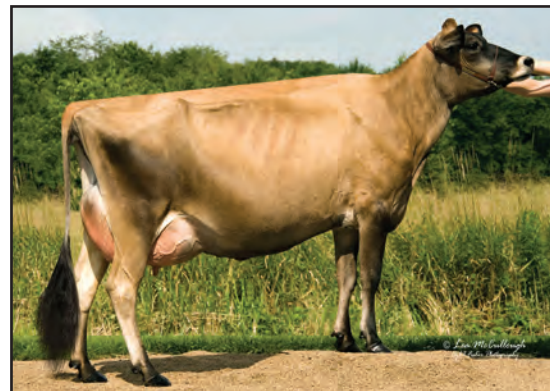
ARETHUSA VERONICAS VIXEN-ET, E-92% FROM THE SAME FAMILY AS LOT 6