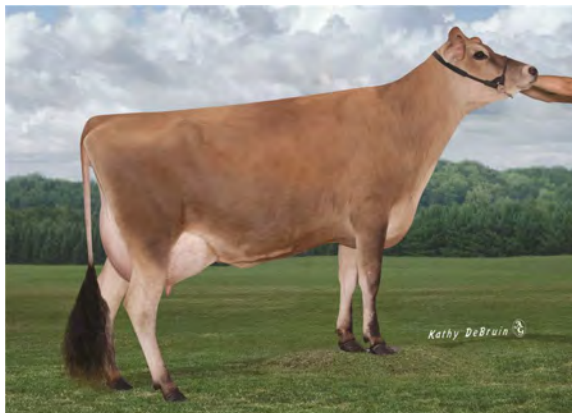
DODAN LH VISIONARY TESSA, E-90% SISTER TO THE GRANDAM OF LOT 16