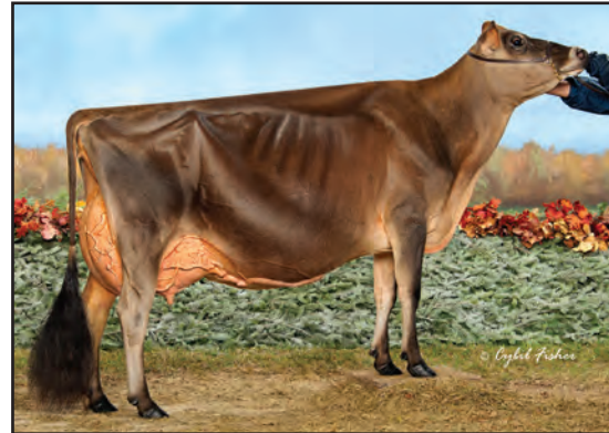
ELLIOTTS BLACKSTONE CHARLOTTE-ET, E-94% SISTER TO THE GRANDAM OF LOT 6