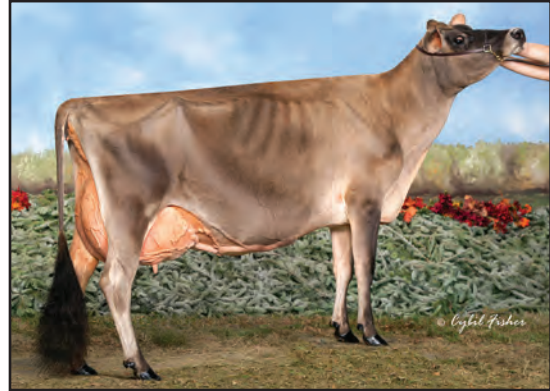
ARETHUSA VERONICAS COMET-ET, E-95% GREAT-GRANDAM OF LOT 6