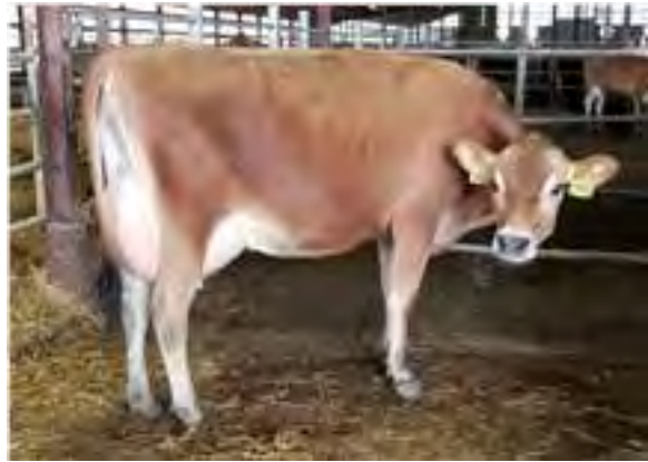
KB CHROME 17911 72 LBS AT 144 DIM, 6.6%F, 3.8%P AND PROJECTED TO 24,407 ME DAM OF LOT 3