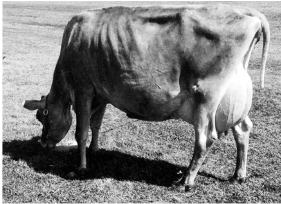
VALHALLA SPARKLER LOLLY, E-91% FIFTH DAM OF LOT 2