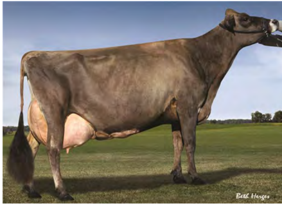
NORSE STAR JADE ASHLYN, E-93% GREAT-GRANDAM OF LOT 23