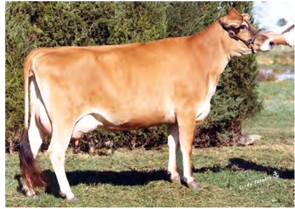
QUICKSILVERS BABE, E-94% TENTH DAM OF LOT 102C