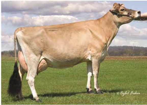
MICHAEL CENTURION DARLA, E-93% GREAT-GRANDAM OF LOT 105C