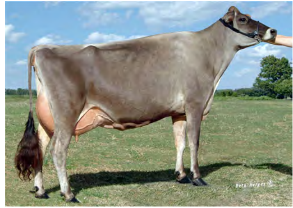
RATLIFF JADE MAISY-ET, E-94% FIFTH DAM OF LOT 105D