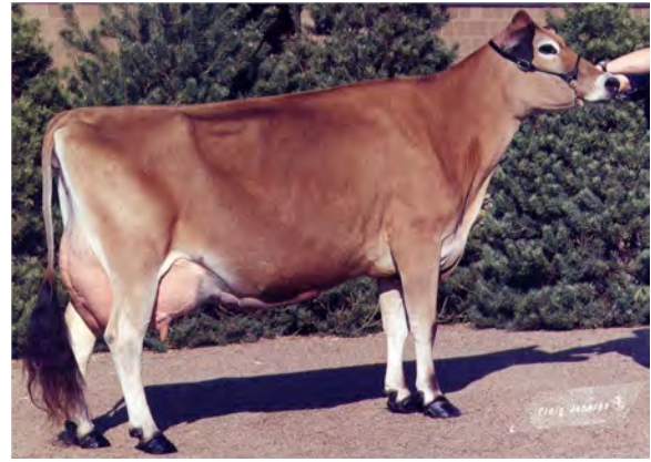
REICH-DALE BRIGADIER SANDRA DEE, E-94% FIFTH DAM OF LOT 104F