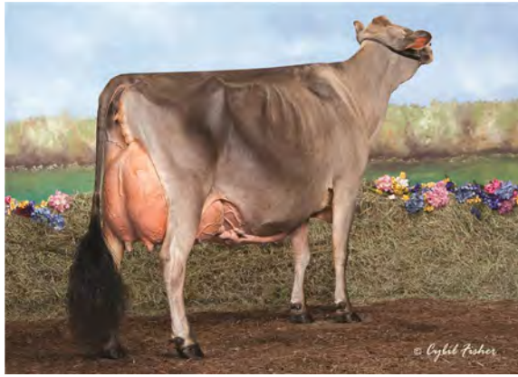
EXTREME ELECTRA, E-95% FOURTH DAM OF LOT 5