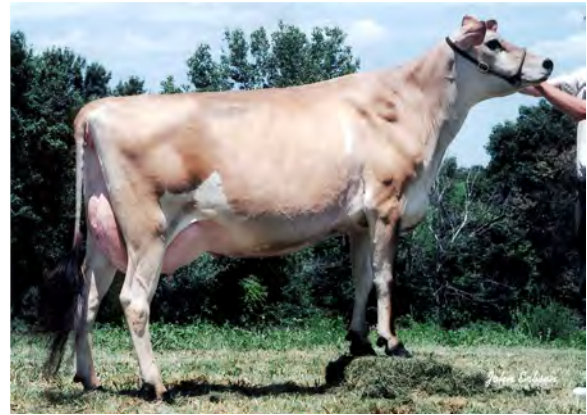
CENTURION DC DELLA, EE-90% FOURTH DAM OF LOT 105C