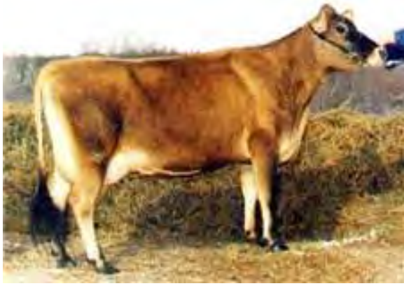
LONG DISTANCE BERRETTA BABE ONE, E-90% SEVENTH DAM OF LOT 102C