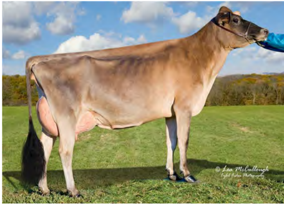
RATLIFF SAMBO MARCIA, E-92% FOURTH DAM OF LOT 105D