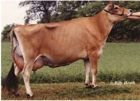
REICH-DALE GC SEQUAL-ET, E-93% FOURTH DAM OF LOT 104F