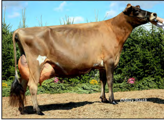
WINDRIFT BREEZE PLUM SARAH, E-95% GREAT-GRANDAM OF LOT 7