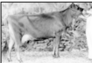
1987 Franken Monarch Rosel 24R Hollylane Jerseys, Ontario