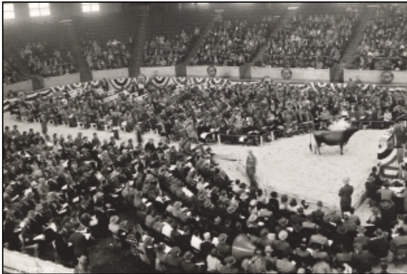
The Ohio State Fairgrounds in Columbus was the site of the first All American Jersey Show, Junior Exposition and Sale of Stars. The sale was the last event of schedule for the first five All Americans. Since 1958, the sale has been slotted on the evening before the All American Show. Above, a classic picture of the first animal sold in the sale on October 12, 1946.