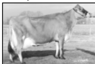
1996 Starn McHale Alice Pyramid Genetics, Forest Glen Jerseys and Skagit Jerseys, Vermont