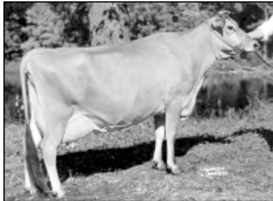
Biltmore Signal Bess Jane

While a number of the National Grand Champions over the years have produced sons of notable achievement, arguably none has had the impact of Biltmore Signal Bess Jane, the 1951 and 1952 champion. She was the tenth dam of Biltmore Earl Bee, who was the dam of Soldierboy Boomer Sooner of CJF, one of the most influential sires in breed history and accorded the honor of a Jersey Journal commemorative issue in October of 1994.