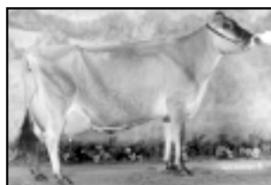
2000 Silver Stream Duncan Peg Shannon Lourenzo, Oregon