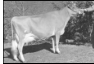
1960 Beacon Bas Tulip Elaine Mayfield, Tennessee