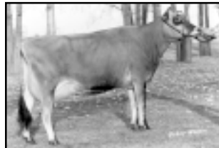
1980 Echobrook Samares Noreen Echobrook Jerseys, Ontario