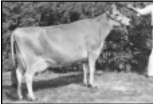
1962 Commando Etta Mercury Chester Folck & Sons, Ohio