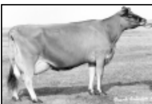
1995 BW Champs F203 Brentwood Farms, California