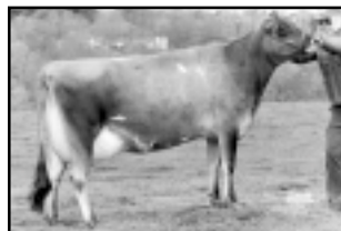
1988 Billings Top Rosanne The Billings Farm and Rosanne Syndicate, Vermont