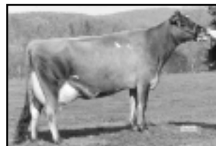
1989 Billings Top Rosanne The Billings Farm and Rosanne Syndicate, Vermont