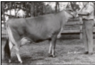
1970 Keepers Sparkling Day KGP Syndicate, Kentucky